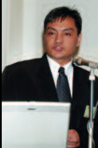
KINLEY WANGDI Government of Bhutan

Intangible heritage is a central element of the cultural heritage of humanity.