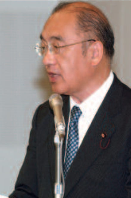
SHOGO ARAI, Parliamentary Secretary for Foreign Affairs