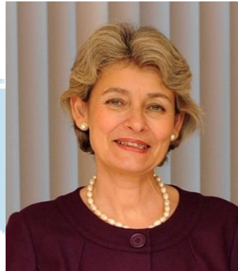
Irina Bokova Director-General of the UNESCO

Each month will be dedicated to a theme and tackles critical areas of concern. The month of May 2015 focuses on “ Women and the Media ” - women’s access, leadership and non-stereotypical representation in media.