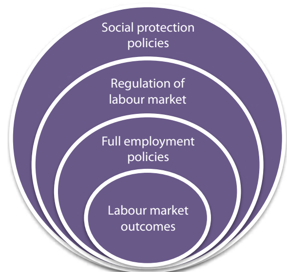
Figure 44.1 The different policy areas that shape labour market outcomes

to support workers when they are no longer working, raise the incomes of those who are working, and improve workers' access to the labour market through social policies that provide child care, elder care and other forms of social support. Figure 44.1 illustrates the different policy areas that shape labour market outcomes. As other articles in this report address social protection policies, the main focus of this article is on macroeconomic policies in support of full employment and labour market regulations.