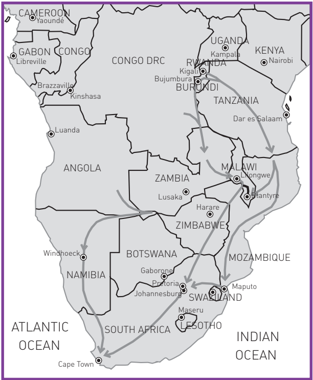
Routes through Mozambique