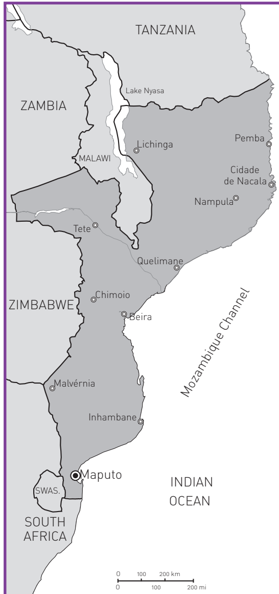
Map of Mozambique