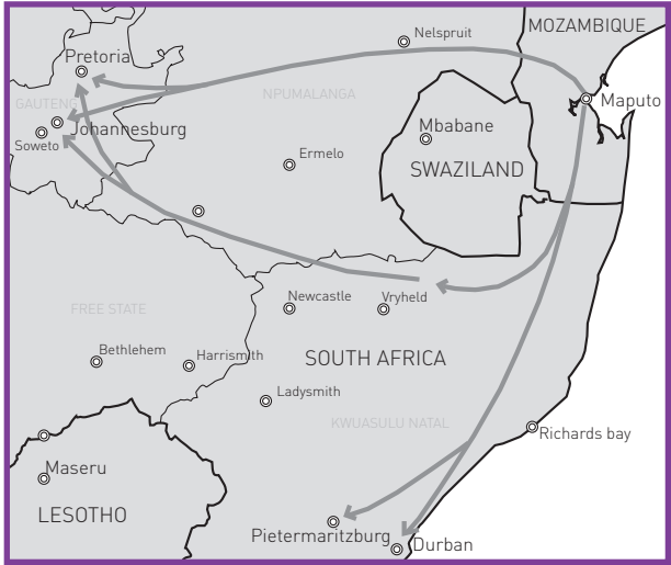
Routes from Mozambique