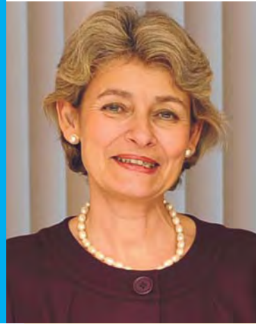
Irina Bokova Director-General of UNESCO

I invite you to join me in this vital challenge.