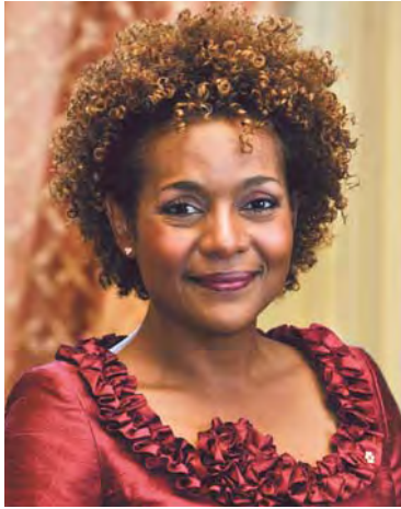
Michaëlle Jean UNESCO Special Envoy to Haiti

'I know of no place, of no land but Haiti, where culture takes such a deep meaning. Art in this country never ceased for a moment being the supreme value, the space where life and hope, light and dignity can be reconquered.'