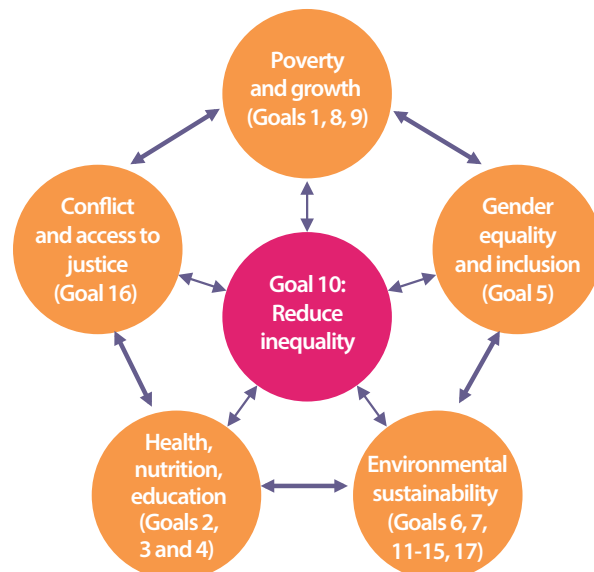
Figure S.2 Interaction of Inequality Goal 10 and the other SDGs

Source: See Gaventa, figure 22.1 in the main Report.