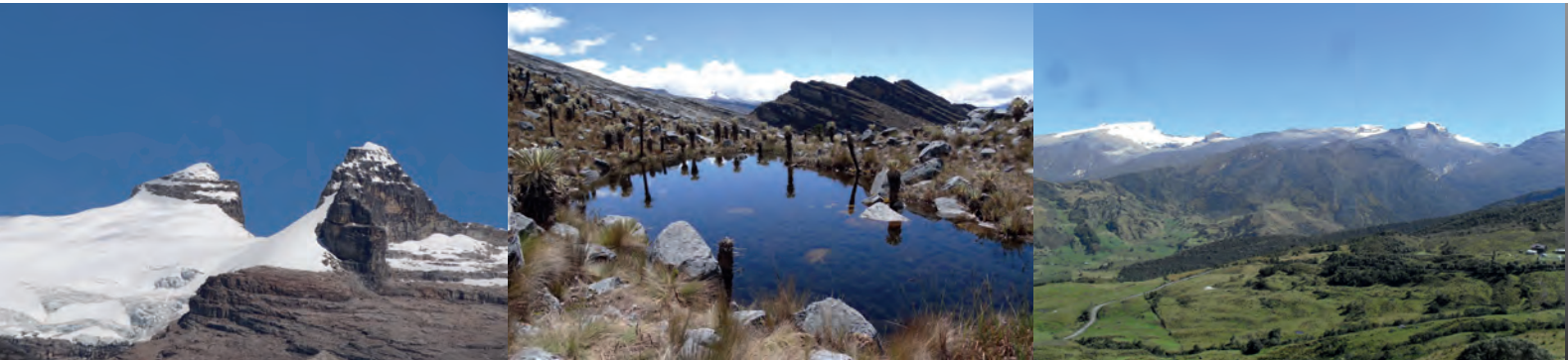
Sierra Nevada del Cocuy, Boyacá, Colombia