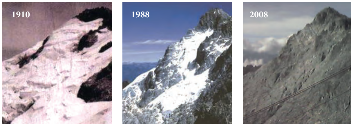
Glacier Espejo Pico Bolivar (5002 m), Venezuela

Glaciers along the entire tropical Andes are in a state of retreat. The rate of retreat is accelerating. Many smaller and lower-elevation glaciers have already disappeared and many more will likely disappear over the coming decades. The current retreat is unprecedented since at least the mid-17th century.