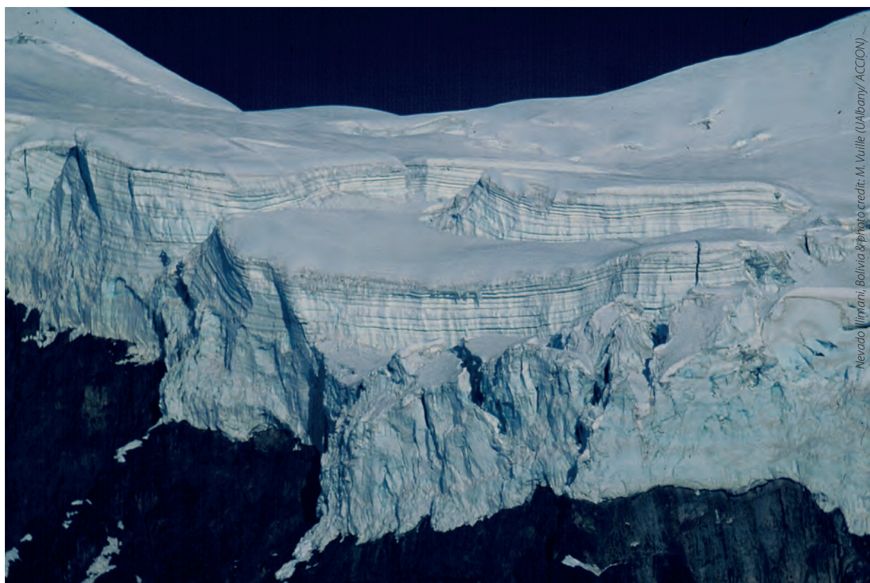
Nevado Illimani, Bolivia &

Water stress. The extent to which a region's development is limited by the available freshwater supply relative to its water demand.