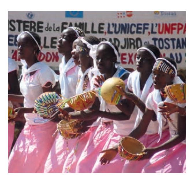
A moment from a Tostan's event (Senegal).

and resources, particularly mobile phones. Such pedagogy can also be seen as supporting women's strategic gender need for equal access to digital technologies. Acknowledging the existence of a digital gap, providers need to respond to and take account of the availability of resources in specific contexts. This might involve developing flexible, creative and innovative pedagogies in addition to ICT-based approaches, such as poetry (as illustrated in this paper) to enhance learners' literacy and health skills.