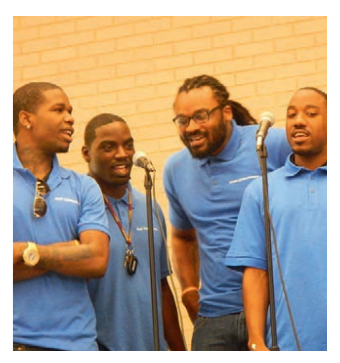
Free Minds Club and Writing Workshop (USA)

i. Understanding and identifying appropriate target groups: literacy and health for women, for men or everyone.