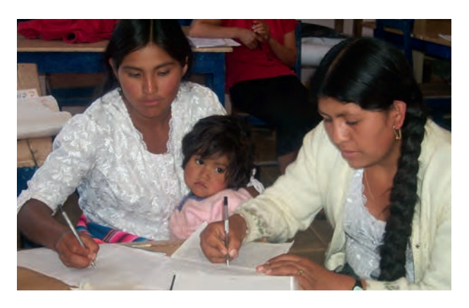
From the programme Bilingual Literacy and Reproductive Health (Bolivia).

The idea of literacy learning as involving oral skills as well as reading, writing and numeracy lies at the heart of the Adult Literacy Programme run by the National Women's Council (NWC) in Mauritius (UIL, 2016a). The programme focuses on enhancing women's self-confidence and autonomy through literacy and practical conversational skills to help them to stand up for their rights within the family. Women are also encouraged to seek support from trained counsellors or government services when faced with violence from their husbands. The literacy element of the programme learning to fill out forms or budgeting – is directly related to their lives, aiming to increase self-esteem while reducing dependence on men. As well as using the NWC literacy course books, the class facilitators use a 'real literacies' approach (see Rogers, 1999), using brochures available locally on healthy eating, AIDS, hypertension and other health issues. At first