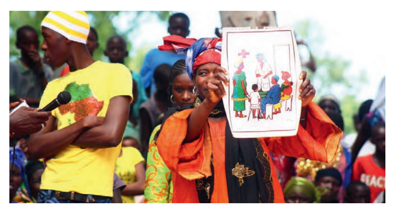
A health poster from the Community Empowerment Programme (Gambia).