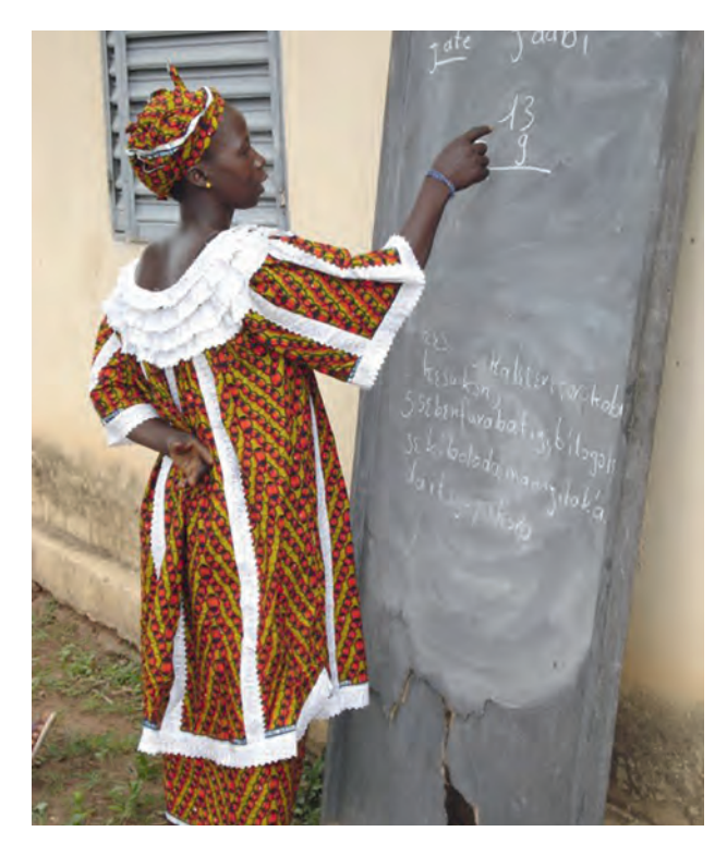
Jeunesse et Développement (Mali)

community organisations increased considerably, as well as access to health care services and facilities.