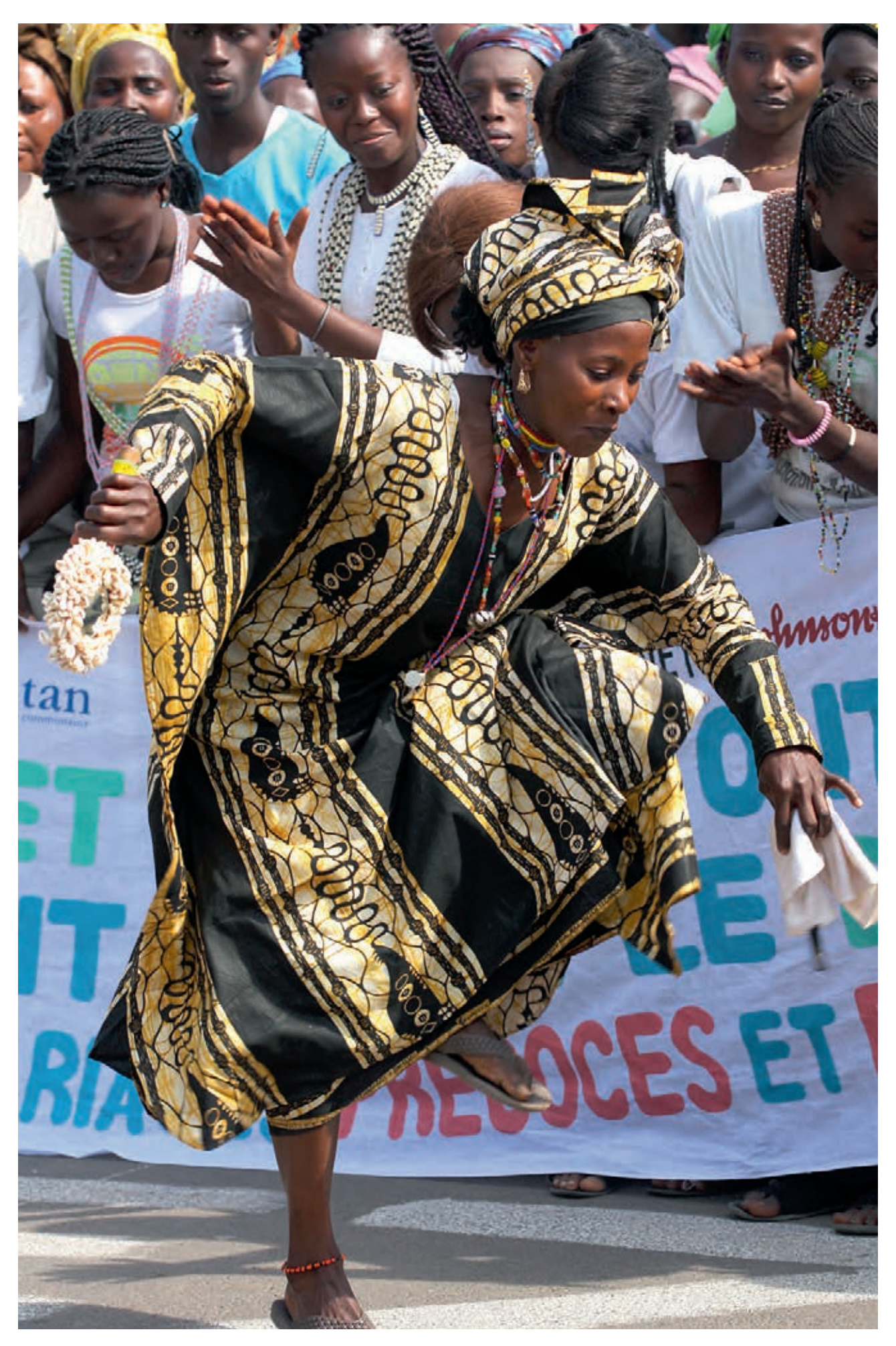
An event organised by communities that are participating to the Tostan's Community Empowerment Programme (Senegal).