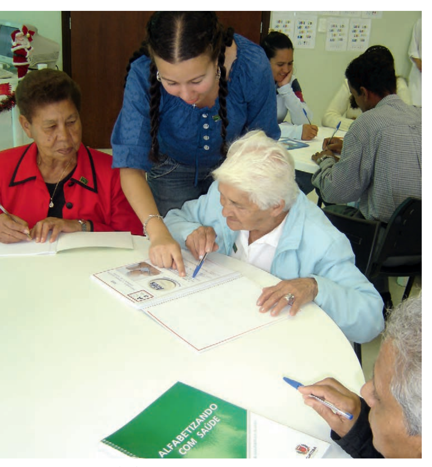
Alfabetizando com Saúde (Brazil)

Whilst the ACEP programme in the Philippines adopts what they term a 'learning by doing' approach to nutrition knowledge, the Alfabetizando com Saúde programme in Brazil focuses on gaining health-related information through reading published materials. Food security and issues around poverty are central to improving nutrition and suggest that literacy programmes may need to incorporate agricultural and economic