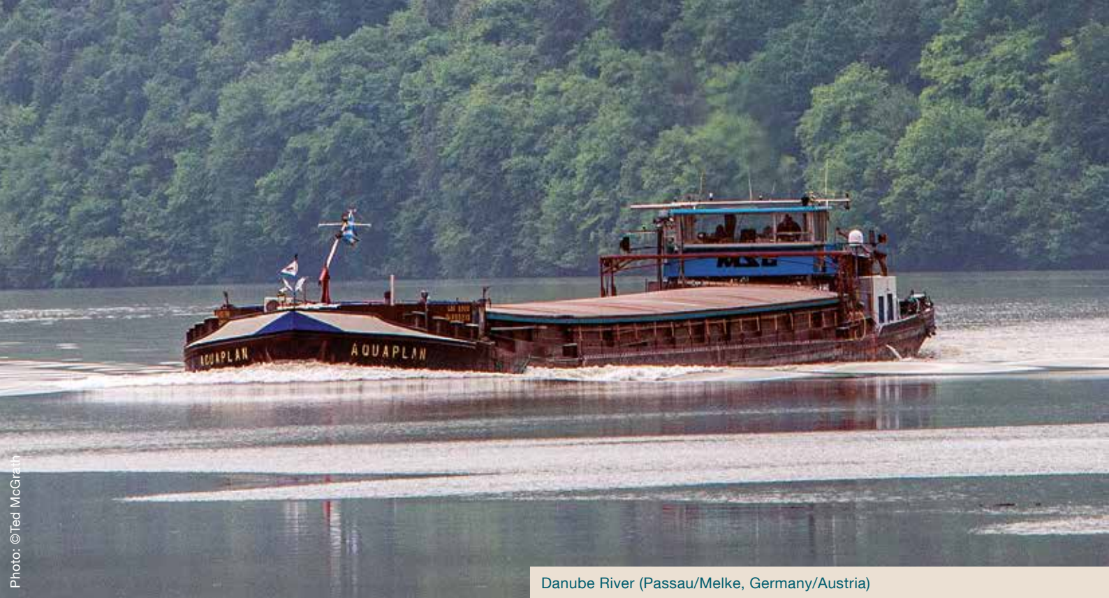
Danube River (Passau/Melke, Germany/Austria)

approach to water management based on river basins, combining emission limit values and quality standards; to promote sustainable water use based on a long-term protection of available water resources; and to provide for public involvement in decision-making regarding water management (WFD, Art. 1). All of these objectives feed into the Directive's main environmental objective of achieving good status for all waters by 2015 (WFD, Art. 4).