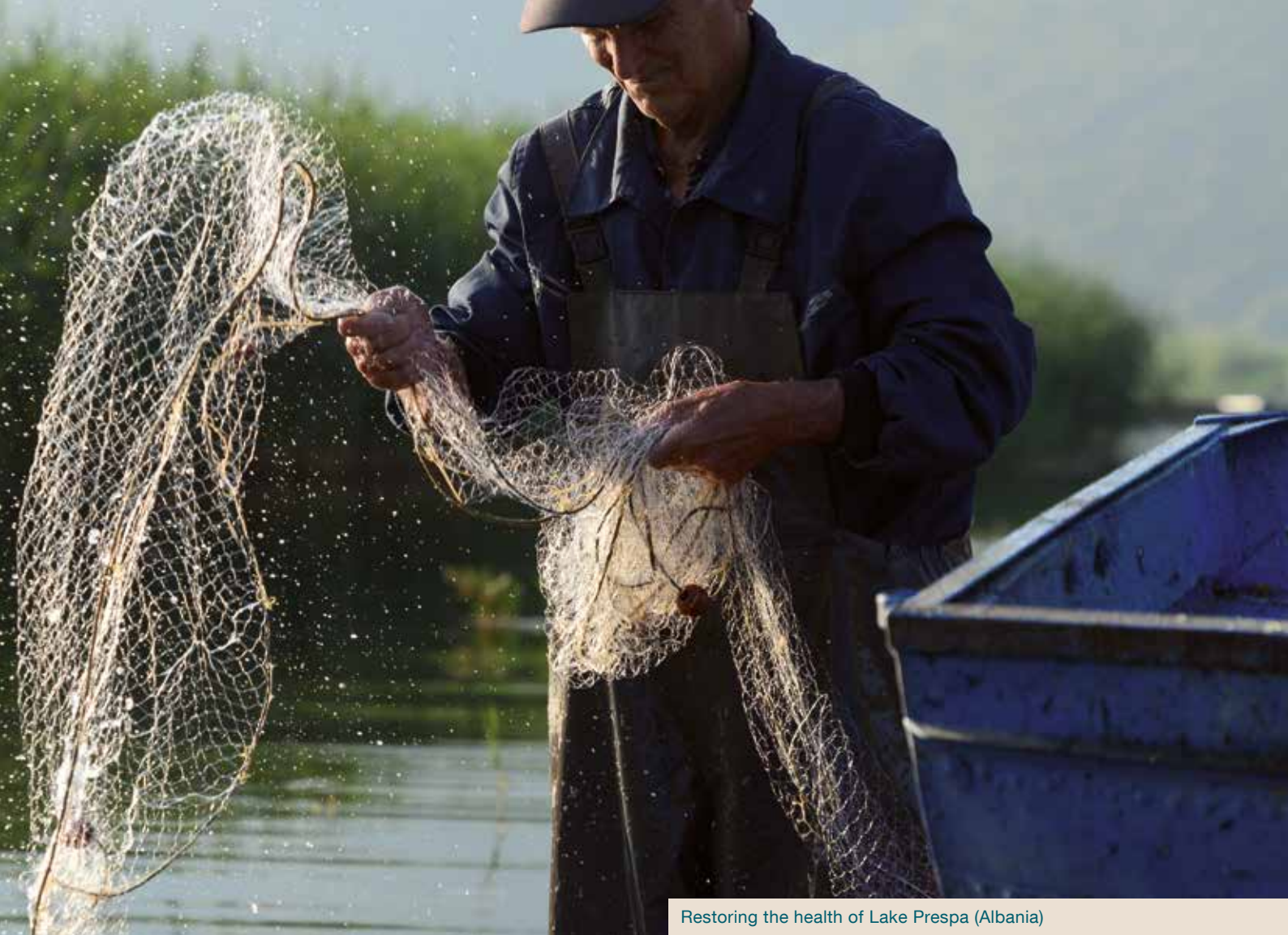
Restoring the health of Lake Prespa (Albania)

change adaptation in transboundary river basins, from the local to the international level. There has been a concerted effort to develop legal and regulatory frameworks for climate-proofing water law at the national level in some countries. Elsewhere, national water law must be updated or adopted to align with international commitments and ensured that water law reforms are gender-inclusive. This requires the strengthening of the capacity of community groups and local and national authorities to promote enforcement. At the basin level, a basin-wide approach should be implemented to consider and share the multiple benefits from the different uses of water, and to share the costs of protection in an equitable manner (Moynihan, 2015b). Many basin treaties should be continually amended, to ensure that they are consistent with modern rules and principles of international environmental law on climate change adaptation and environmental protection of transboundary watercourses. Such an enabling environment is fundamental to the development of ecosystem-based adaptation strategies.