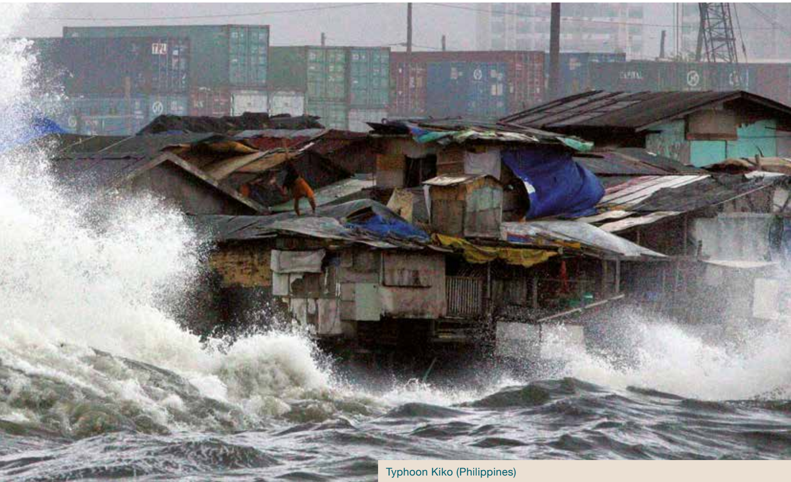
Typhoon Kiko (Philippines)

United States of America, 1961), which includes a dam operation adjustment mechanism, stipulating that Canada will adjust the operation of hydropower dams to mitigate flooding downstream in the USA; and the Mekong Agreement (MRC, 1995a; Art. 6), which sets maximum river flow rates (WMO, 2006).