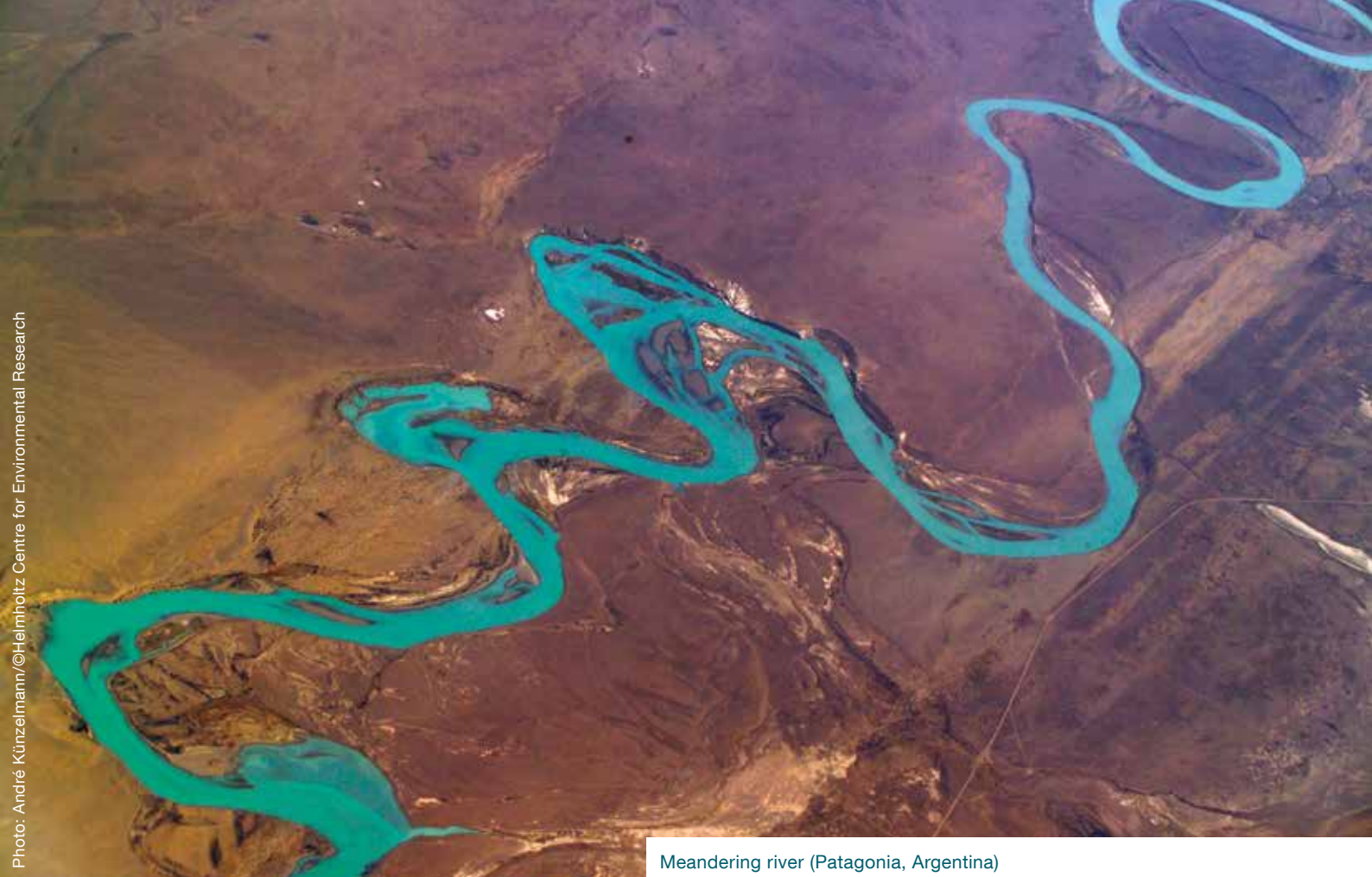
Meandering river (Patagonia, Argentina)

Climate change is causing more frequent and more severe floods and droughts. Our current state of preparation in the management of the worsening adverse impacts of floods and droughts is inadequate. Improved risk regulation will therefore be critical to any adaptation measure. When integrating measures of risk regulation into climate change law, putting too much blind trust in (sound) science-based risk regulation is the wrong approach, and could backfire. A key approach to effective risk regulation and prevention is to recognize the diversity of local knowledge, the different perspectives on risk, as well as political concerns. Legal rules providing for prior exchange of data and information on measures of prevention undertaken by authorities at various levels of governance, as well as continuous monitoring and exchange, are important adaptation tools to prepare against the effects of flood and drought events.