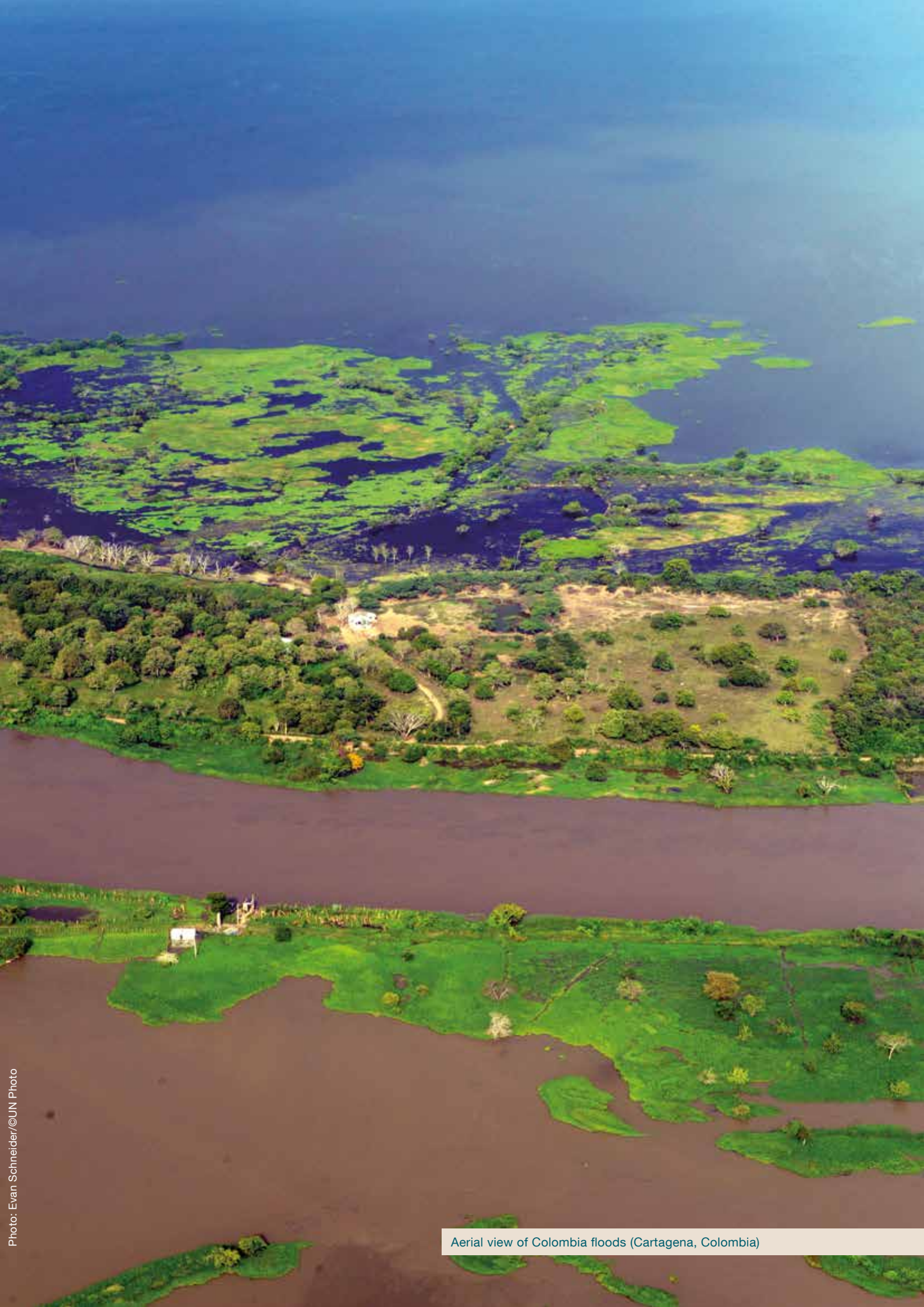
Aerial view of Colombia floods (Cartagena, Colombia)