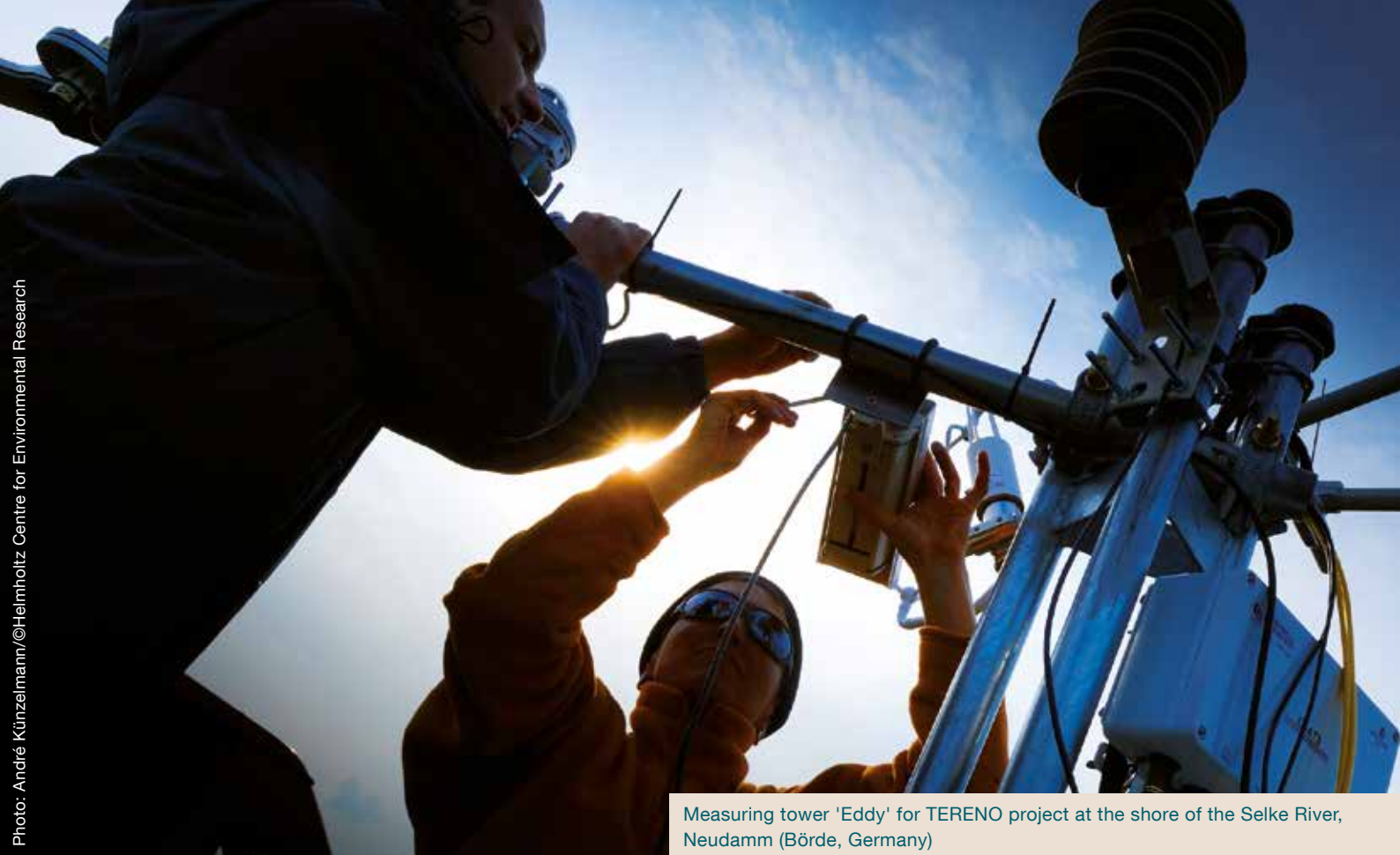
Measuring tower 'Eddy' for TERENO project at the shore of the Selke River, Neudamm (Börde, Germany)