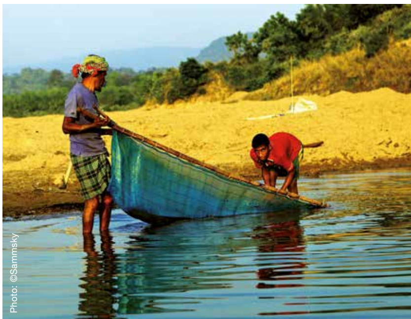
Coal Fishing (Jaintiapur, Sylhet, Bangladesh)

implementation of laws and policies. Seen from this perspective, the ecosystem approach does not preclude other existing management and conservation approaches adopted by countries. Approaches to management, such as biosphere reserves, protected areas, and single-species conservation programmes, could be integrated in a way that addresses the complex nature of ecosystems (CBD, 2000).