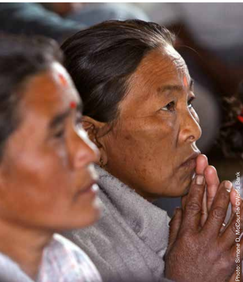
Women speak about Water Supply and Sanitation program in Nepal (Pokhara, Nepal)