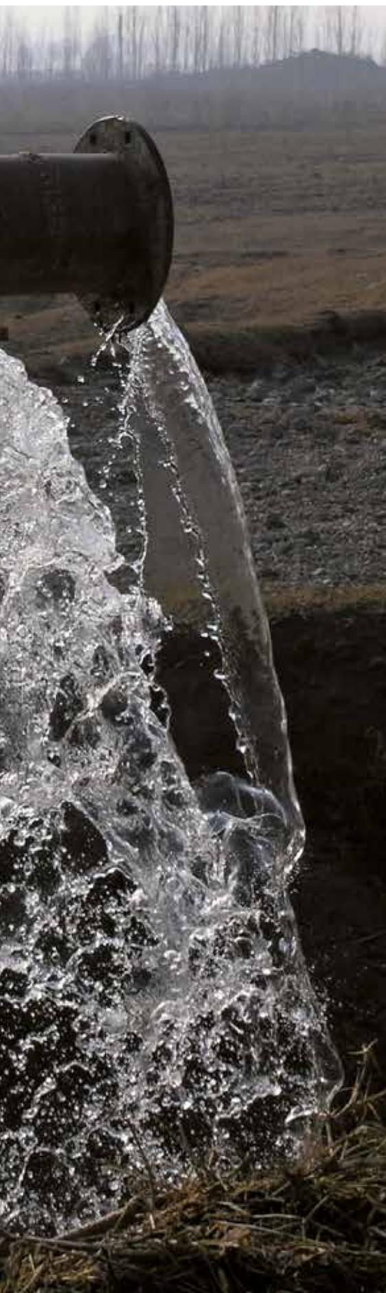
Ferghana Valley (Kyrgyzstan, Tajikistan, Uzbekistan)

Source: Authors, based on UNECE (2012b).