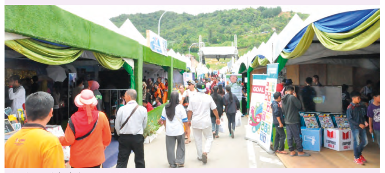
Crowds visiting the booths during Hari UNESCO Malaysia 2017

The celebration consisted of awareness programmes and campaigns on the relationship between Man and Nature. Programmes were carried out to incite the public interest in Mount Kinabalu, as well as to highlight various efforts of agencies and public organizations towards conservation of Mount Kinabalu, while maintaining the Sustainable Development Goals (SDGs).