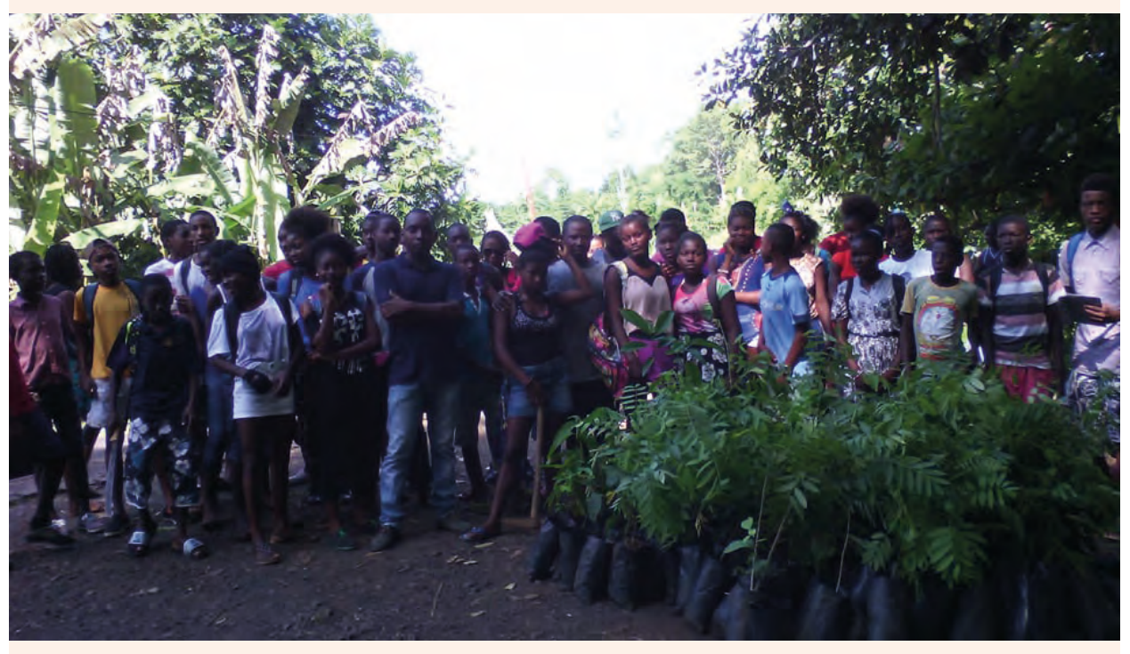
Activités de protection environnementale

Les photos témoignent de l'activité de protection environnementale, avec la plantation d'arbres, organisée par l'École de Desejada. Cette activité, visant à l'ODD 13, a consisté en la plantation d'arbres dans les zones déboisé du district de Lobata, île de São Tomé, en partenariat avec la Direction des Forets, qui a fourni les pépinières des arbres. L'adhésion des étudiants démontre leur engagement envers les questions environnementales, en particulier dans notre pays, qui est un état assez vulnérable.