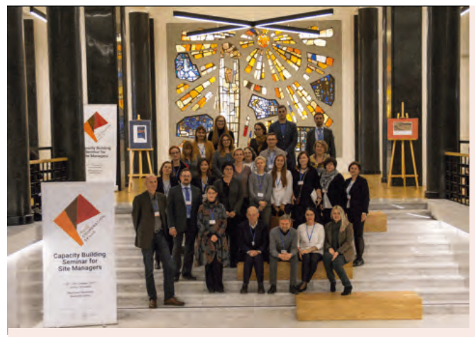
Capacity Building Seminar for World Heritage site managers

The year 2017 also witnessed the inscription of Polish-Lithuanian joint nomination "The Act of the Union of Lublin document (1569)" on the MoW International Register.