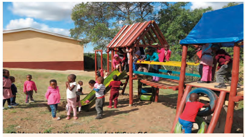
Children playing in the playground at Kugeza CLC

The Swaziland National Commission, in collaboration with the Ministry of Tourism and Environmental Affairs (MTEA) have established a National Man and Biosphere (MAB) National Committee, which is part of the initiative towards implement the MAB programme in Swaziland and establishing at least one MAB Reserve in Swaziland. Collaborative measures were also established between the MTEA and the Department of Environmental Affairs (DEA) of the Republic of South Africa, and in this regards South Africa is supporting Swaziland in this new initiative for the country.