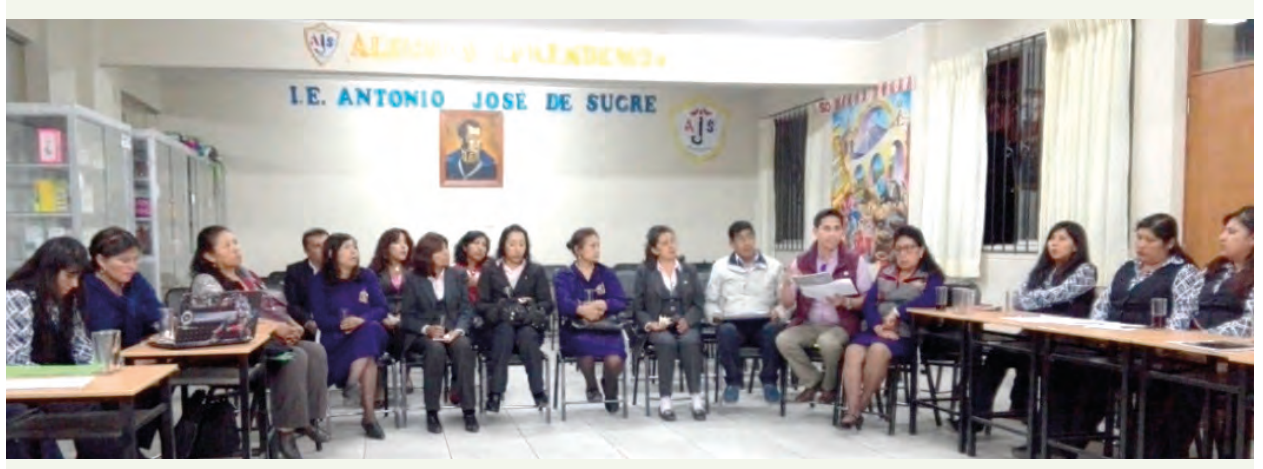
A meeting of the ASPnet of Arequipa, formulating strategies aligned with Sustainable Development Goals (SDG)

The most significant activity was the technical assistance provided to ASPnet Peru, in particular for supporting projects aimed to Peace, Human Rights, Sustainable Development, World Citizenship, Interculturality and Cultural Heritage. 41 schools were visited by the coordinator of the ASPnet Peru.