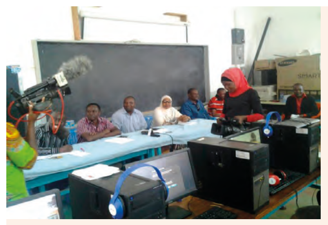
Media interviewing a Participant with visual impairment

In communication and information, the National Commission implemented various workshops and forums on Internet Governance and Media and Information Literacy. A particular focus of the MIL workshops was on training secondary schools students and sensitized them on the importance of MIL in education. Further, the National Commission, in collaboration with UNESCO Dar-es-Salaam Office, commemorated different UNESCO days including World Radio Day and World Day for Audiovisual Heritage.