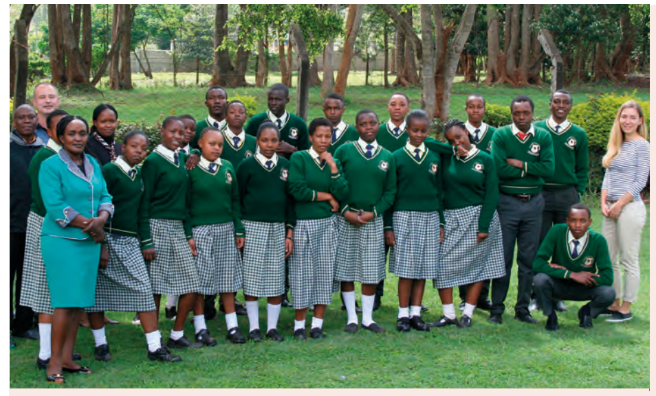
Czech education project "Basic PC and Internet Course" in Africa

Finally, the Secretariat continued to publish monthly its online newsletter providing information about important UNESCO events and Commission activities.