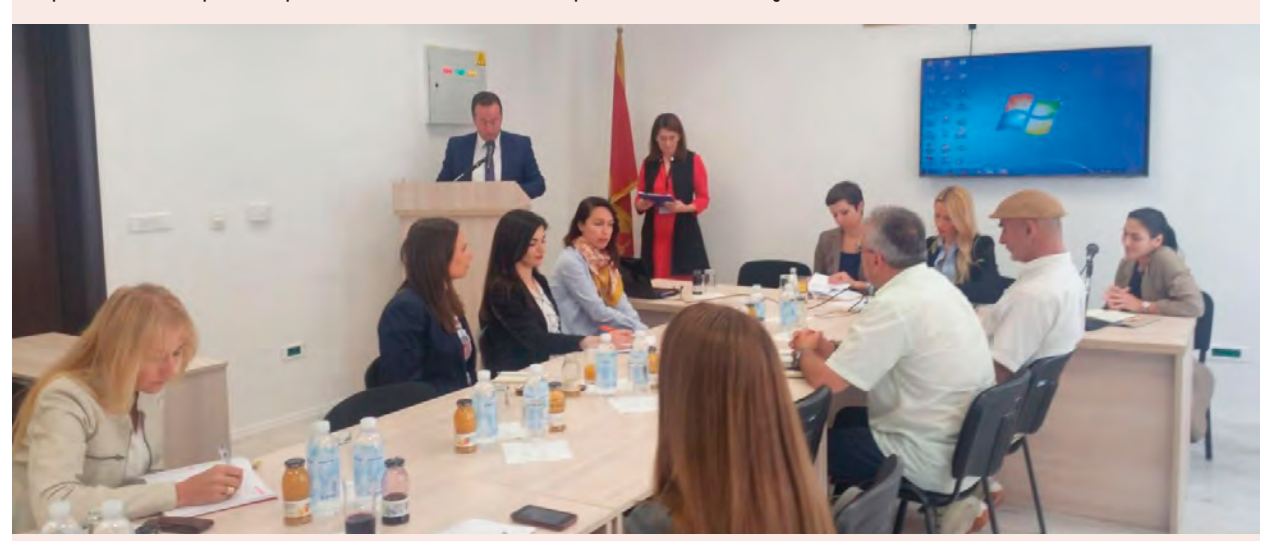
First meeting dedicated to the establishment of the MAB Committee for Tara River Basin Biosphere Reserve held in the core of Tara River Basin Biosphere Reserve area, Mojkovac, May 2017

Last year, a significant improvement was registered in the implementation of the activities to carry out for Tara River Basin as part of the Man and Biosphere Programme. That improvement was based on the valuable cooperation between the Montenegrin authorities and the UNESCO Office in Venice with support of UNDP in Montenegro. Based on this cooperation, Montenegro submitted a report on this programme, which will hopefully prevent further implementation of Exit Strategy which had previously started for this biosphere reserve. More importantly, serial consultation with local authorities were organized by different stakeholders and that activities resulted in a concrete offer from the Municipality of Mojkovac to provide offices and equipment as a support to the Managing body which is now being established. In cooperation with UNDP, a draft Action Plan was prepared, which will be adopted by the relevant authorities. MAB programme was defined as one of the priorities of all municipalities sharing the concerned area and it is especially important for the municipalities Žabljak and Plužine whose territories are also part of UNESCO World Heritage Sites: Stećci — Medieval Tombstones and National Park Durmitor.