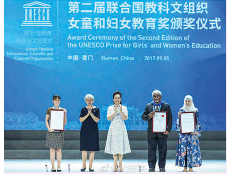
UNESCO announces winners for Girls and Women's Education Prize 2017

In the fields of culture, information and communication, China has been closely cooperating with UNESCO for a fruitful outcome. In 2017, China's Kulangsu historic international settlement in Fujian Province and Hoh Xil in Qinghai Province were inscribed on UNESCO's World Heritage List. Two documentary heritage items were listed on the International Memory of the World Register, including Chinese Oracle-Bone Inscriptions and the Archives of Suzhou Silk from Modern and Contemporary Times. Four Chinese cities have been selected to join the UNESCO Creative Cities Network (UCCN).