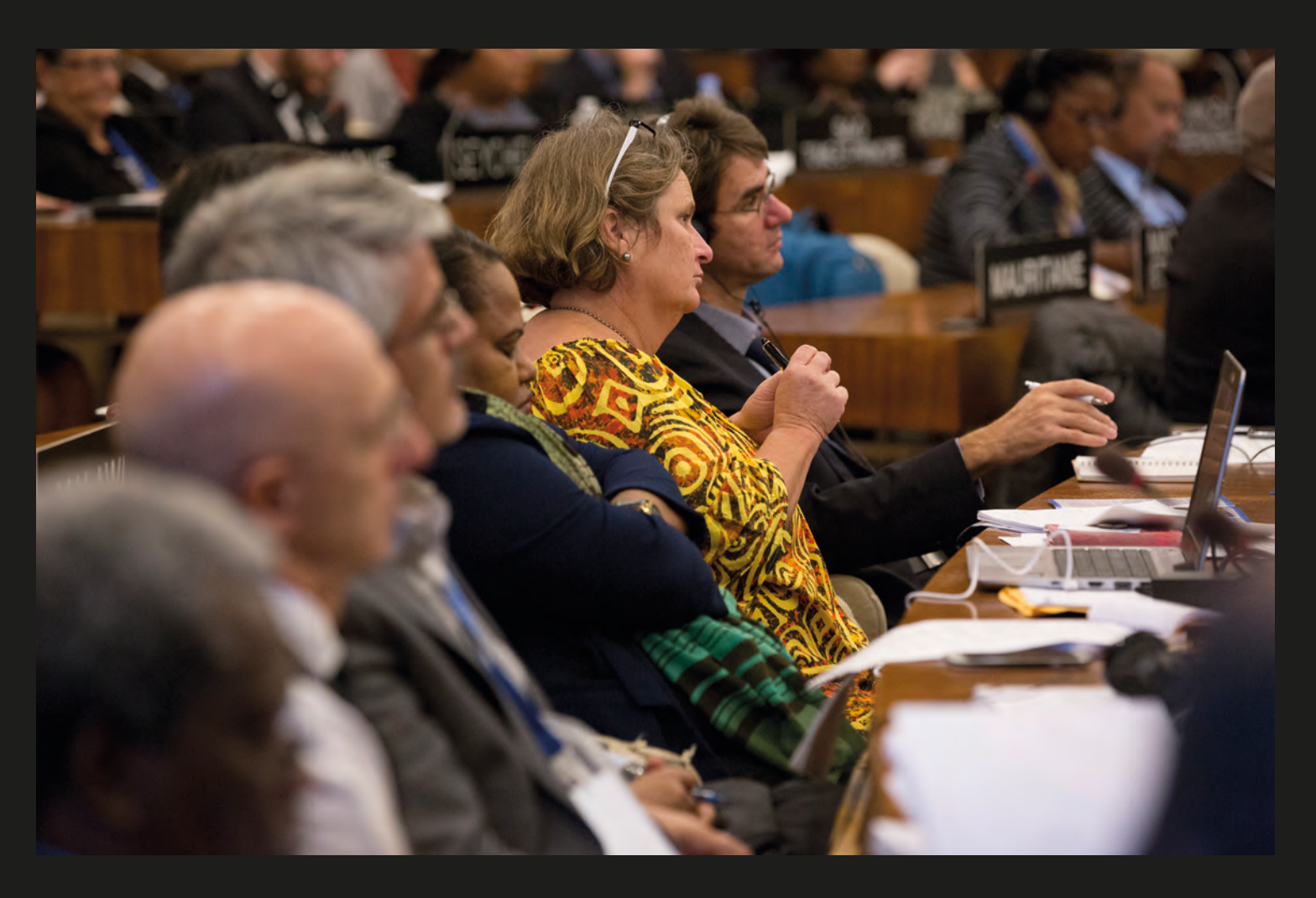
4^{\text{th}} Interregional Meeting of the National Commissions that took place on 27 October 2017 at UNESCO Headquarters in Paris.