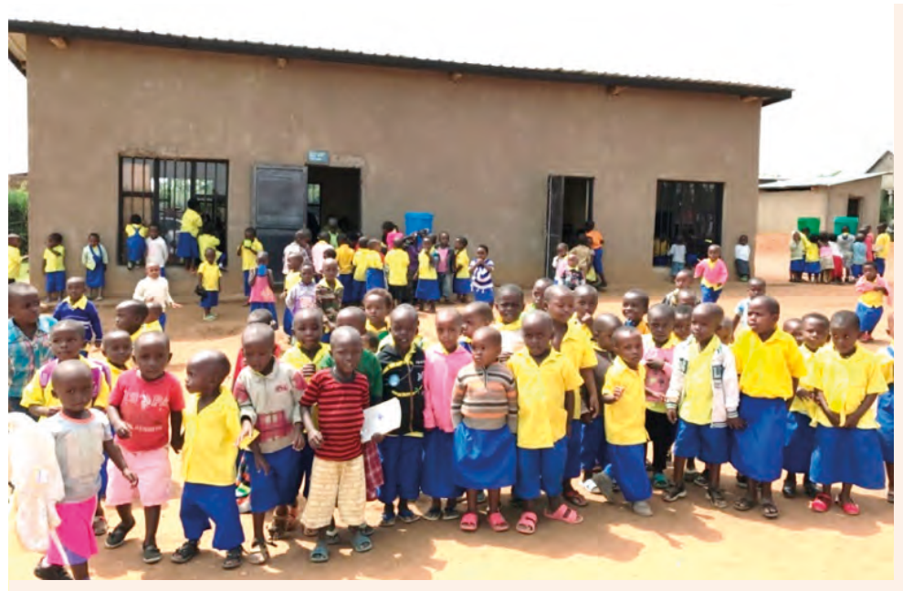
Children's in the ground of the ECD Temporary CLC in Mayange Sector, Bugesera

A three days validation workshop on the volcanoes biosphere periodic review report was held in Musanze district from 8 to 10 May 2017. This workshop brought together different partners, national and international working in the field of tourism, environmental conservation, management of Rwanda national parks, representatives of civil society and representatives of beneficiaries community and UNESCO Headquarters.