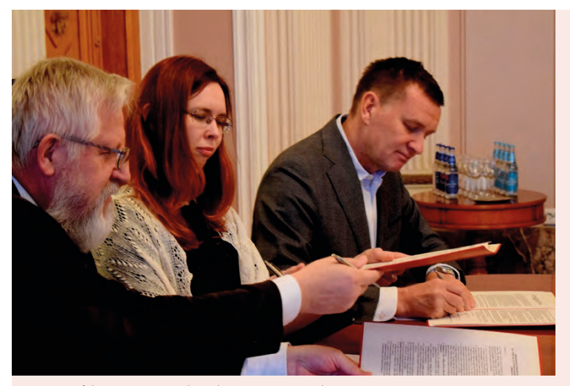
Signing of the Agreement to launch UNESCO-L'Oréal For Women in Science Programme in Estonia

In 2017, Estonia continued and finished its term as a Member of the Executive Board. As Estonia held the Presidency of the Council of the European Union in the second half of 2017 the National commission also had a role in assisting our Permanent Delegation in Paris, supporting cultural events in the Headquarters etc. The sharing of our experiences via expert advice has also become more and more important and we aim to continue contributing to multilateralism through our experts. We continued our excellent partnership with Samsung in digital competences and with L'Oréal Baltic. Together with L'Oréal Baltic and the Estonian Academy of Sciences we launched for the first time the UNESCO-L'Oréal For Women in Science Programme in Estonia.