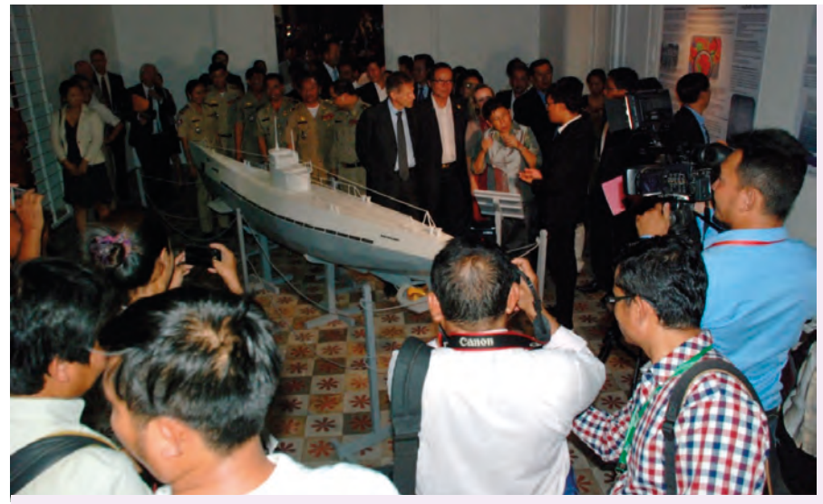
L'inauguration de l'exposition par la Présidente de la Commission Nationale

Dans le domaine de la culture, le Comité pour la protection des biens culturels en cas de conflit armé, réuni au Siège de l'UNESCO à Paris du 29 au 30 novembre 2017, a accordé le statut de « protection renforcée » à Angkor, site culturel du patrimoine mondial, au 25<sup>ème</sup> anniversaire de son inscription sur la Liste du patrimoine mondial. Le Cambodge a été réélu membre du Comité pour un 2ème mandat de 4 ans, de 2018 à 2021 et en a obtenu la présidence pour l'année 2018. A sa 41 ème session à Cracovie en juillet 2017, le Comité du Patrimoine mondial a inscrit « la Zone des Temples du site de Sambor Prei Kuk » sur la Liste du Patrimoine mondial. Enfin, concernant la Convention de 2003, à la suite de l'inscription « Chapei Dang Veng » sur la Liste représentative du patrimoine culturel immatériel de l'humanité, nous avons obtenu un financement pour la mise en œuvre du plan de sauvegarde par le Département de l'Immatériel du Ministère de la Culture et des Beaux-Arts, en vue de la formation de la génération à venir.