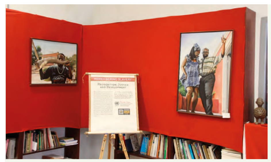
Exhibition of 13 informative posters related to Slavery, the Slave trade and Decade

Presentations were made for the Council of Ministers and Parliament on UNESCO and its role and responsibilities. Relations were strengthened with the visit of the Secretary-General of the Netherlands National Commission. Four Participation Programmes were implemented.