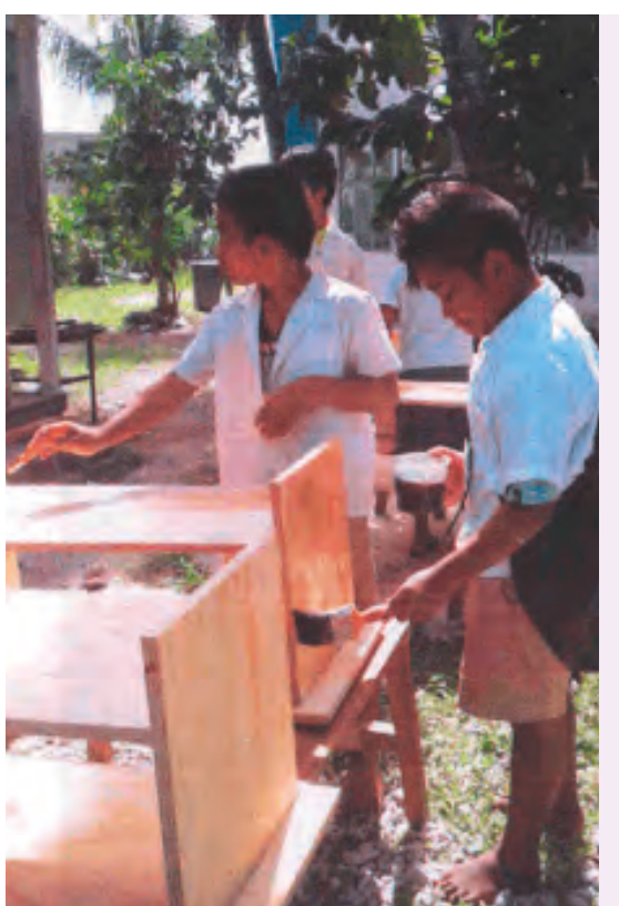
Re-Entry project at Nauru College

The National Commission thanks its regional partners for their continued support and collaboration in ensuring awareness of the latest developments and contributing towards resolving issues.