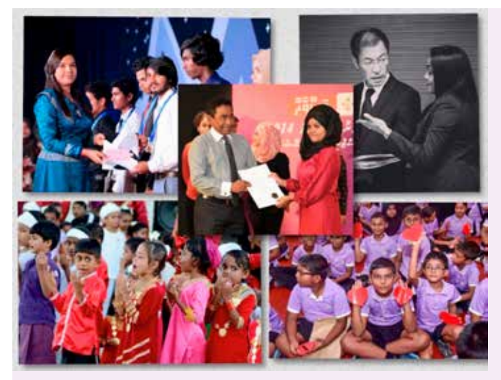
The establishment of MEMIS to prioritize the need to address education priorities and challenges through evidence-based decisions, would pave the way for providing quality education for all and catering for the needs of every individual student, because every child counts.

On 13 June 2012, the Government of Maldives established and opened the Baa Atoll UNESCO Biosphere Reserve Office under the Ministry of Environment and Energy in the capital of Baa Atoll, Eydhafushi. The outcome of this designation was a high-level political interest to roll out such conservation and sustainable development measures throughout the Maldives. The Maldives Biosphere Reserve work was kicked off with a National Conference followed by the adoption of the National Biosphere Reserve Implementation Plan. Much work is being done on communication and outreach to complete a stakeholder and community engagement component. However, as it was not possible to meet the 2017 deadline, it was decided to delay the submission of the application to September 2018. Hence, work for finalizing the application is ongoing.