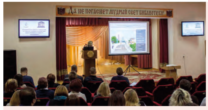
Presentation of the Children's Legal Website © National Center of Legal Information of the Republic of Belarus

Also, the National Commission coordinated the implementation of six projects approved under the Participation Programme.