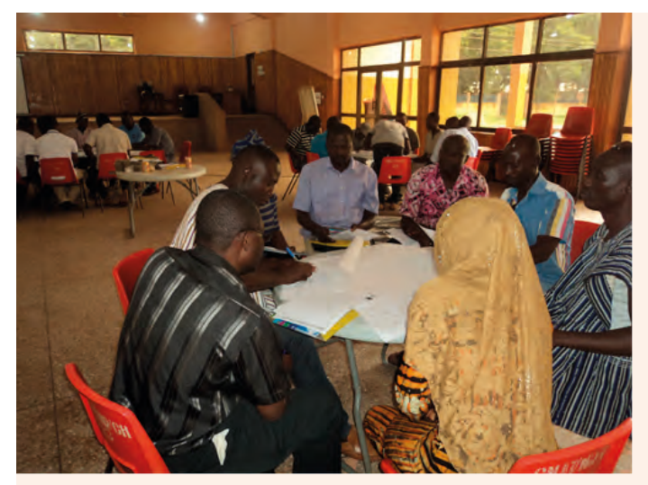
Participants in group discussions

In commemoration of the International Youth Day, the Commission collaborated with BlankCheque (an event organizing company) to create awareness of the day and the importance of the contribution of the youth to the development process. The celebration took place on the street of Asafo, a suburb of Kumasi in the Ashanti Region of Ghana. Activities for the day included an interactive session with the youth of Asafo.