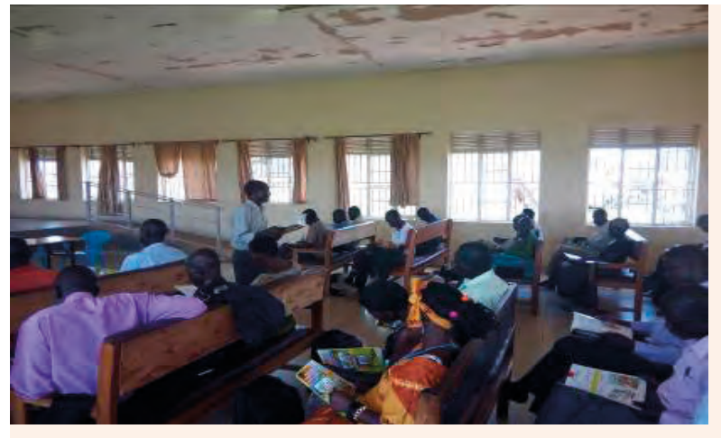
A trainer guiding teachers (Patrons of the Peace Club members) through the Peace training Manual

Under the ASPnet programme, the National Commission promoted "Whole School Approach" to Climate Change Action in Schools" in Uganda and built the national Capacity of the ASPnet Schools on the Whole Institutional Approach to Climate Change project, 3 – 5 July 2017.