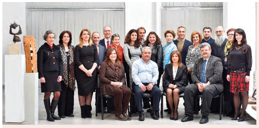
Members and collaborators of the Cyprus National Commission for UNESCO

In the fields linked to the diversity of cultural expressions, the Commission and the Cultural Services of the Ministry of Education and Culture produced the bilingual (Greek and English) publication "Cultural Expressions and Pluralism: Aspects of Contemporary Creativity in Cyprus". The publication includes updated information on main cultural policy issues and priorities in Cyprus and on funding opportunities available for the production and dissemination of cultural goods and services.