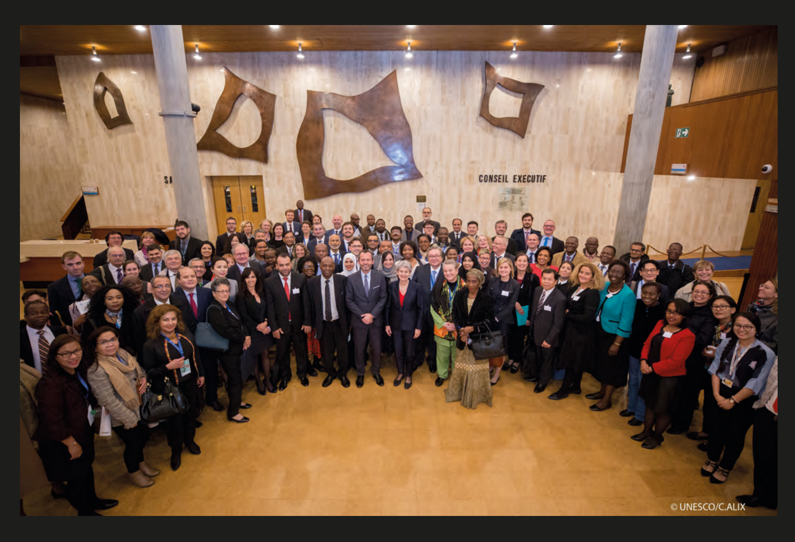
4^{\text{th}} Interregional Meeting of the National Commissions that took place on 27 October 2017 at UNESCO Headquarters in Paris.