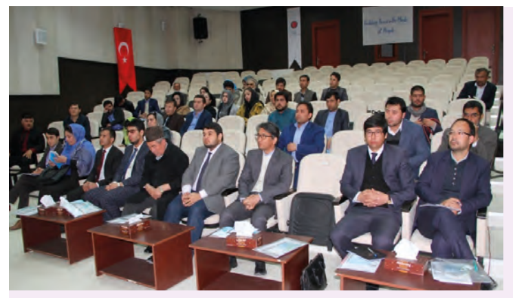
Opening ceremony of the Strategic Plan Development Workshop, Kabul-Afghanistan @ Afghanistan National Commission for UNESCO

ANCU has achieved membership in three national committees namely the National High Literacy Committee of the Islamic Republic of Afghanistan, the Scientific and Cultural Committee of the Islamic Republic of Afghanistan and the Culture and Arts Committee of the Chief Executive Office of Islamic Republic of Afghanistan. This accomplishment has enabled ANCU to take an active part in policy making, planning and monitoring of literacy, scientific, cultural and art-related activities and assignments of Afghanistan.