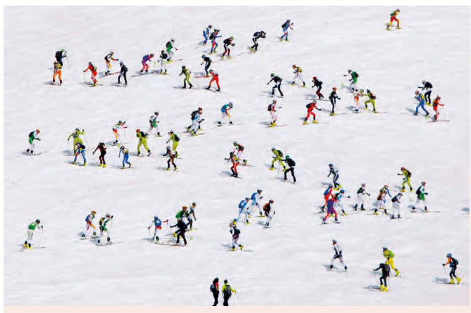
Journée internationale de la montagne (11 décembre) et Année internationale du tourisme durable pour le développement

La rencontre des commissions nationales de la région Europe à Thessaloniki en Grèce, a été l'occasion de renforcer nos liens avec de nombreuses commissions nationales et ouvrir de nombreuses perspectives de projets futurs.