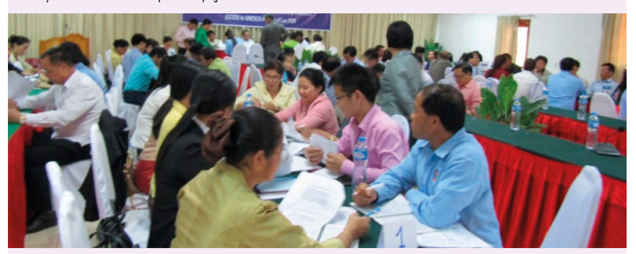
Lao National Commission for UNESCO organized the Training Workshop to promote GCED concept and raise awareness for principals and teachers from 33 UNESCO ASPnet Schools

However, GCED is a relatively new term for most of the Lao people, including education administrators and teachers to train Lao children to be global citizens. Therefore, LNCU organized the Training Workshop to promote GCED concept and raise awareness amongst principals and teachers from 33 UNESCO ASPnet Schools in 5 Provinces of Lao PDR so that they can further disseminate and implement this program at schools and communities.