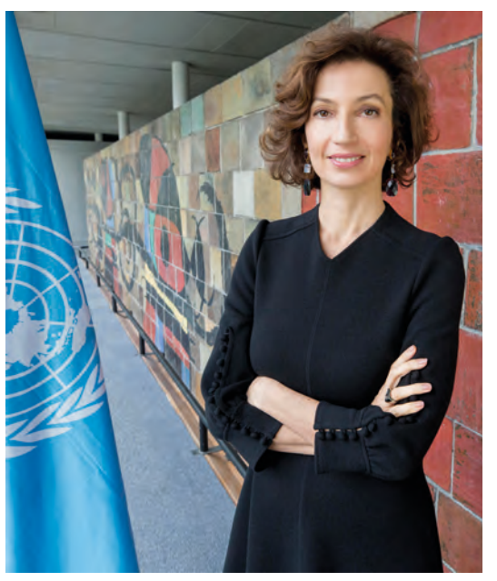
Portrait officiel de Madame Audrey Azoulay

Le Rapport annuel des Commissions nationales pour l'UNESCO, est un outil important pour le partage d'informations et de bonnes pratiques entre les Commissions nationales. Il est conçu, entre autres, pour rendre visibles et accessibles leurs réussites, réalisations et défis à un éventail plus large de personnes et d'organisations.