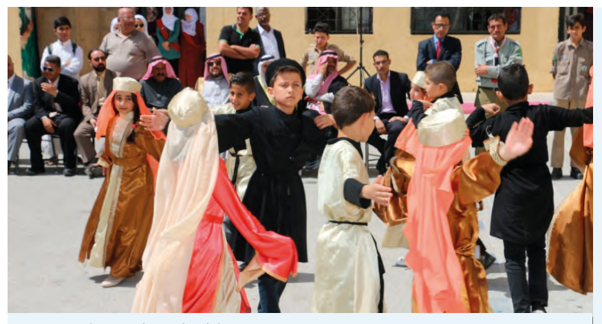
\textbf{Circassian dance to show cultural diversity} \\ \textcircled{o} \\ \texttt{Jordan National Commission for Education, Culture and Science} \\

Four requests were approved under the Participation Programme 2016-2017. These projects were related to enhancing capacity for ASPnet school teachers on designing educational activities for sustainable development, National inventory and documentation, the factors associated with the variation in school readiness between male and female enroller as well as designing the Ministry of Education's e-gov portal.