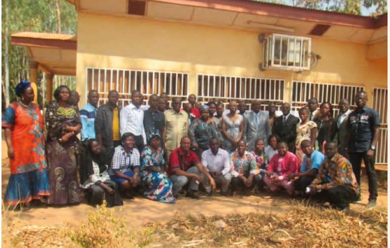
Photo de famille : Formation au Logiciel R

par l'UNESCO en 2016-2017 ont été exécutés : (i) Les textes administratifs de l'Université de Bangui ont été révisés dans le cadre du Programme de participation (Loi, Charte des examens, Statuts de l'Université de Bangui et 3 Arrêtés structurant des comités d'encadrement du LMD) ; (ii) l'ampleur et la typologie des violences faites aux femmes lors des différentes crises centrafricaines ont été investiguées dans les villes où réanaient les tensions. Les résultats ont été présentés et débattus lors d'une série d'ateliers communautaires. Ces violences en général, le viol en particulier, demeurent diversement perçues par une société centrafricaine encline à la mise à contribution des enfants, à l'excision et à la polygamie ; (iii) une formation en biostatistique couplée à la promotion du logiciel R a mobilisé, avec succès, une cinquantaine de scientifiques nationaux ; (iv) une équipe pluridisciplinaire d'exploration des sites du patrimoine culturel et naturel a parcouru le centre et l'ouest du pays. Le rapport de l'étude a été validé en atelier le 19 mai 2017. La liste indicative de 2006 a ainsi été complétée.