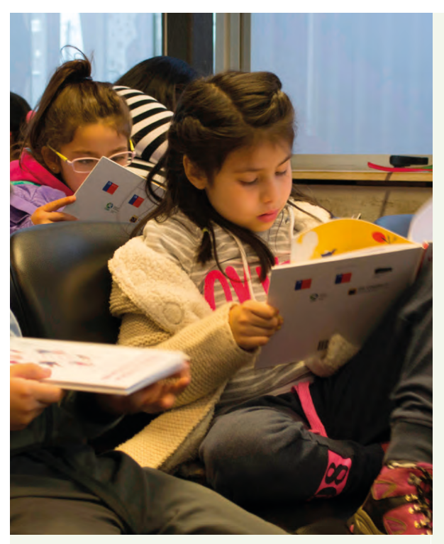
Children reading the Illustrated Human Rights Declaration for the First Childhood presentation. Bilingual edition Spanish-Mapudungun. September 2017

During 2017, the Commission developed an investigation about the documental and material architectural heritage, about the oral history of the CPEIP, national institution in charge of the educational politics of Chile in the last fifty years. This investigation puts in relationship the objectives of the Memoria del Mundo programs, Heritage, Material and education of the organization. The investigation allowed the support of protection of archive material, particularly the documents of the Education Reform of the 1960s. The publication about the investigation will be launched in February 2018. In 2017, the National Commission elaborated and launched a Human Rights Illustrated Declaration for early childhood education.