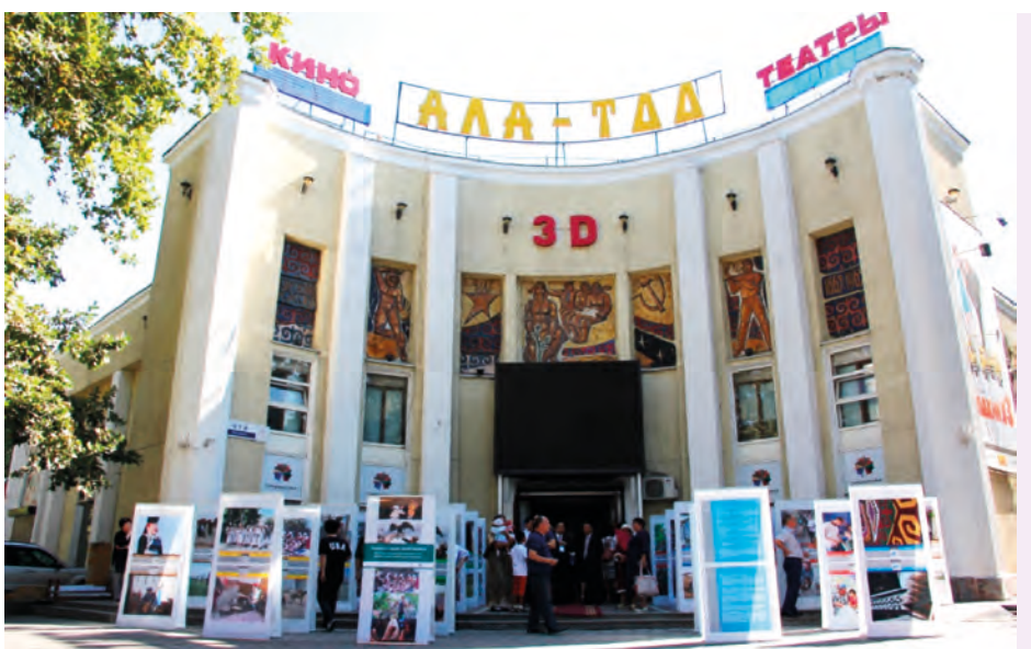
ICH Film Festival and Photo exhibition in July 2017, in Bishkek, Kyrgyzstan

On 14 November, during the 21st session of the General Assembly of States Parties to the World Heritage Convention, the Kyrgyz Republic was elected a member of the World Heritage Committee amongst 12 newly elected members.