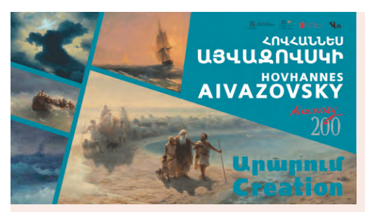
The Exhibition "Hovhannes Aivazovsky: Creation"

The Commission has actively participated in the meetings of the 1954, 1970, 1972, 2003 Conventions. It continued cooperation with the UNESCO Category 2 Regional Centres for the safeguarding of Intangible Heritage in Sophia and Teheran.