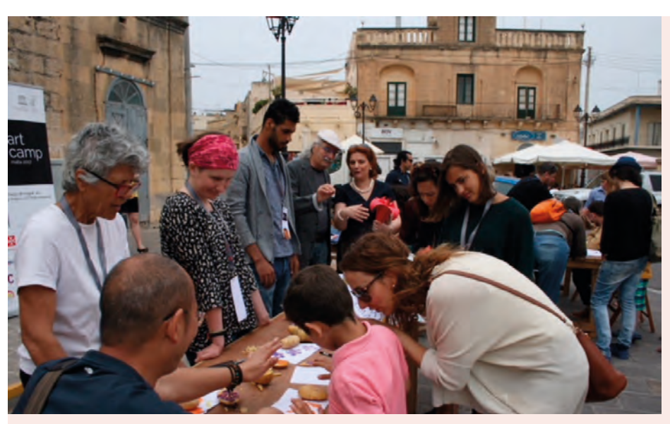
Art Camp artists interacting with the community in Xaghra Gozo during a community outreach event as part of the Art Camp programme

In October, the National Commission sent a representative to Namibia, who attended, as an observer, the Workshop on the Memory of the World, which was held at Windhoek.