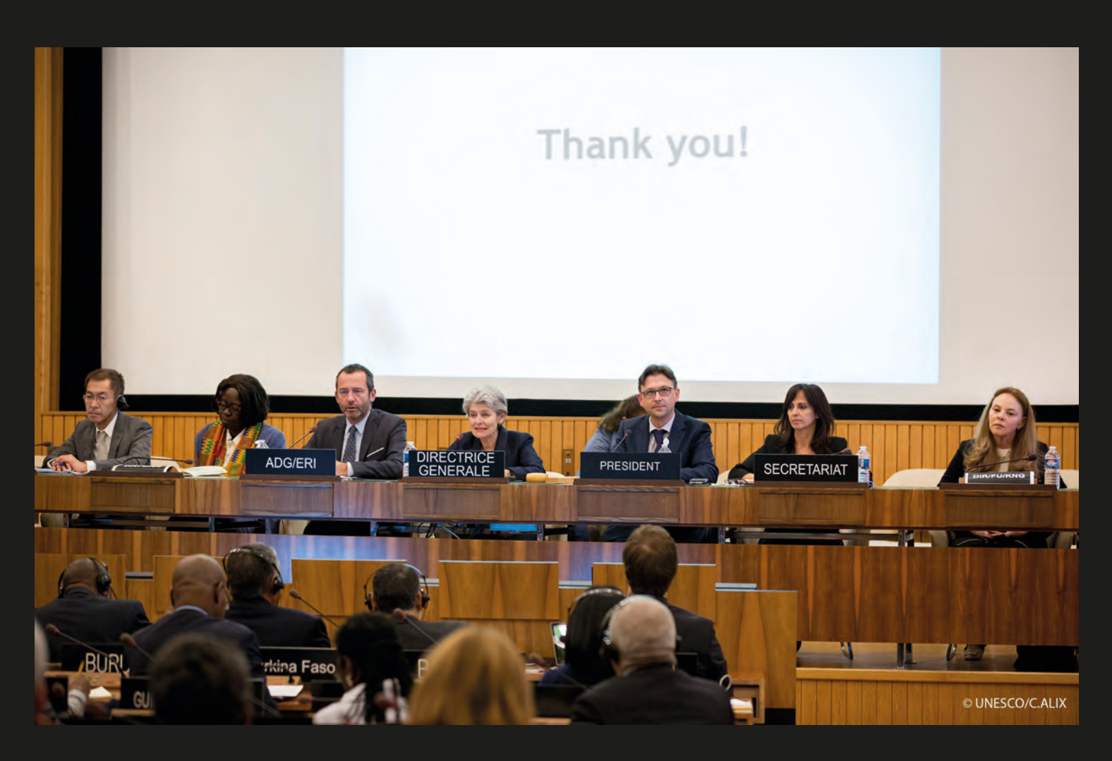
4^{\text{th}} Interregional Meeting of the National Commissions that took place on 27 October 2017 at UNESCO Headquarters in Paris.