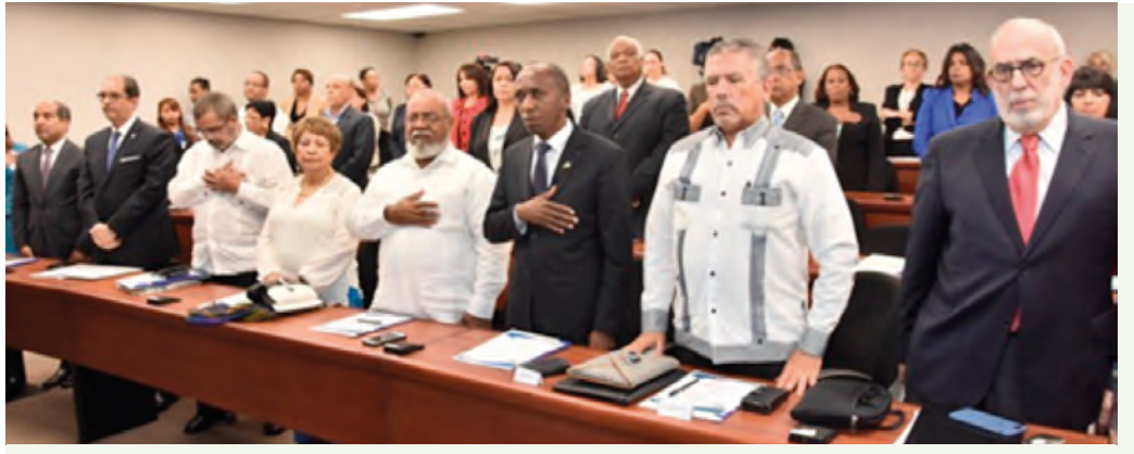
The group of participants during the event

The National Commission participated in a training "Guardarenas Methodology – An introduction to the Sandwatch Database", organized in collaboration with the Honduras Commission for cooperation with UNESCO.