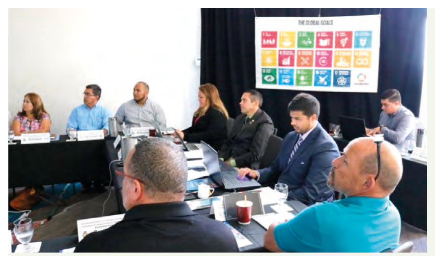
Workshop: A Rapid Assessment Framework of Co-Benefit and Trade-offs Among Sustainable Development Goals, held Sept 4 – Sept 15 2017 at Hotel Renaissance Ocean Suites. Oranjestad Aruba.

An important day in 2017 was 20 October, when Aruba marked 30 years as an Associated Member of UNESCO.