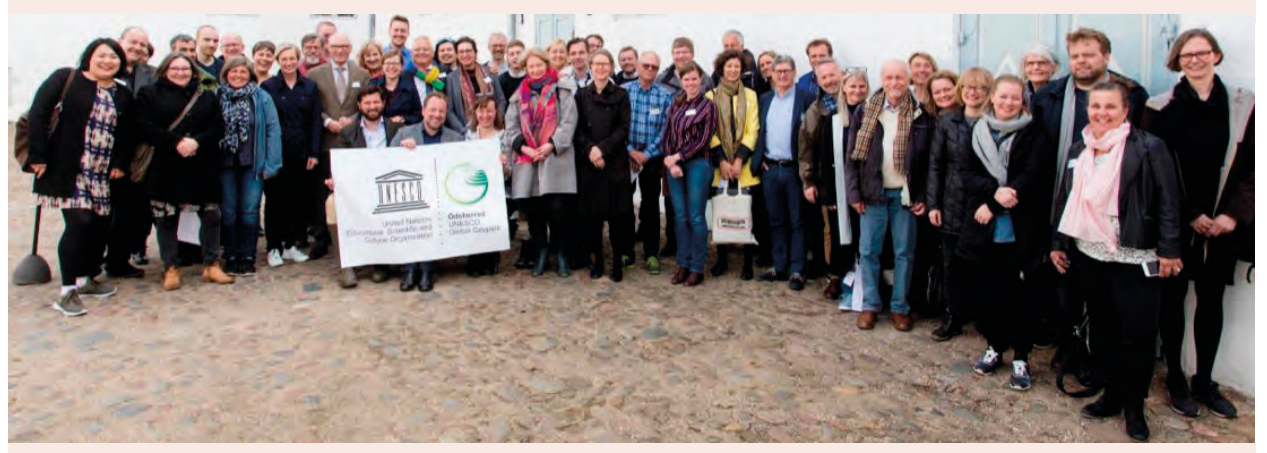
Participants at the first national meeting for all UNESCO sites and designations at the castle of Dragsholm, May 2017

UNESCO visibility, local involvement and impact. With an encouraging and growing number of cities, municipalities, sites and institutions aspiring and qualifying for UNESCO designations and participation in UNESCO Programmes, the need for national networking, sharing of experiences and quality assurance is growing. In May 2017 representatives from approved and aspiring World Heritage sites, UNESCO Global Geoparks and Man and Biosphere reserves in Denmark and Greenland gathered in the UNESCO Global Geopark of Odsherred to discuss exactly how to strengthen local involvement, and the overall visibility and impact of UNESCO in local development, including through sustainable tourism. Many good ideas were shared and the foundation for future professional cooperation was laid. Furthermore, the seminar was planned as a UNESCO contribution to the overall activities of the 2017 International Year of Sustainable Tourism for Development.