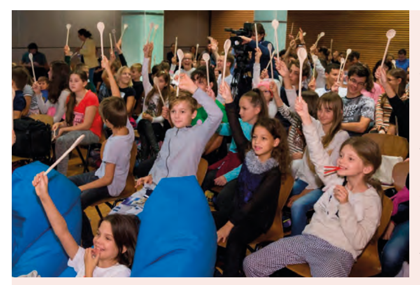
Pupils are voting about their favourite dish made from locally produced ingredients during the launching event of the World's Largest Lesson 2017, in Hungary.

Two Hungarian cities joined the UNESCO Global Network of Learning Cities: Pécs and Kaposvár.