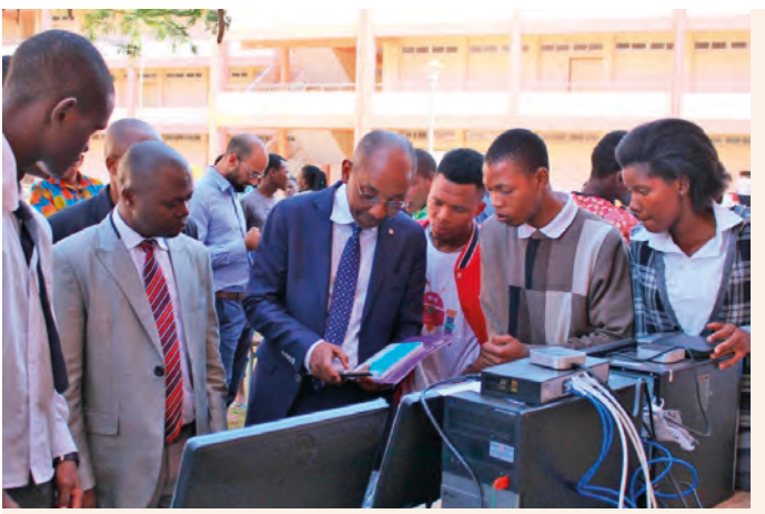
Students from Armando Guebuza Industrial Institute explaining the use of intranet to the UNESCO Representative in Maputo and the National Director for Technical and Vocational Education

The activities mentioned above were financed with funds provided by the Government of Mozambique through the State Investment Budget, the UNESCO Regional Office for Southern Africa (ROSA), the German National Commission for UNESCO, as well as other National and International partners.