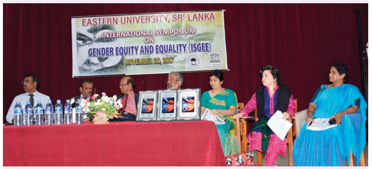
International Symposium on Gender Equity and Equality

The objectives of the project were to create awareness among student leaders, academics, government officials and community leaders on gender equality and equity, sexual and gender based issues as well as existing laws and gaps in the legal system. It was also aimed at conducting in-depth studies on such issues within the University System, preparing a Lobbying Document to be presented to relevant authorities in all three languages (Sinhala, Tamil and English) and developing a preventive mechanism for prevention of Gender Based violence and Discrimination at all levels of administration.