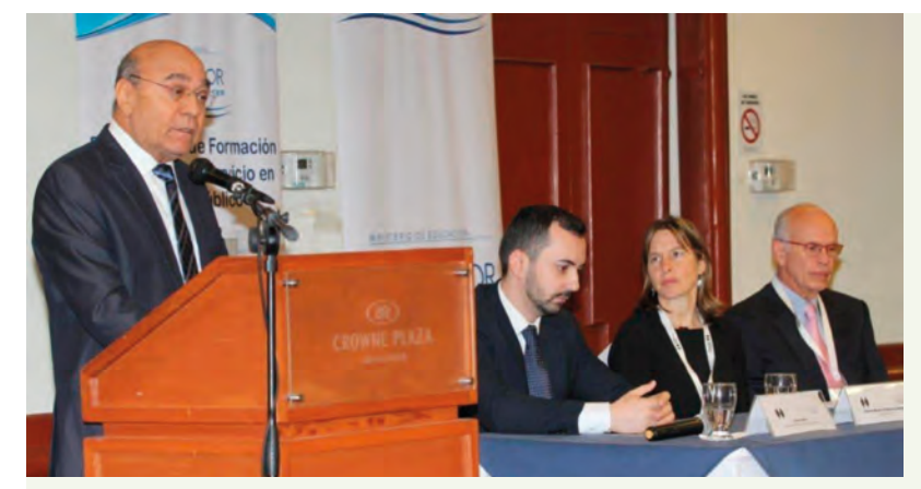
Inauguration of the Seminary «Teaching and Learning about the Holocaust and Related Matters"

Within the framework of the project "Building Resilient Communities and Integrated Tsunami Warning Systems in Central America", the seminar "Tsunami threat" was developed on the Salvadorian coast, with the aim of providing basic knowledge about tsunami threats, study planning, response and preparation for emergency and disaster situations.