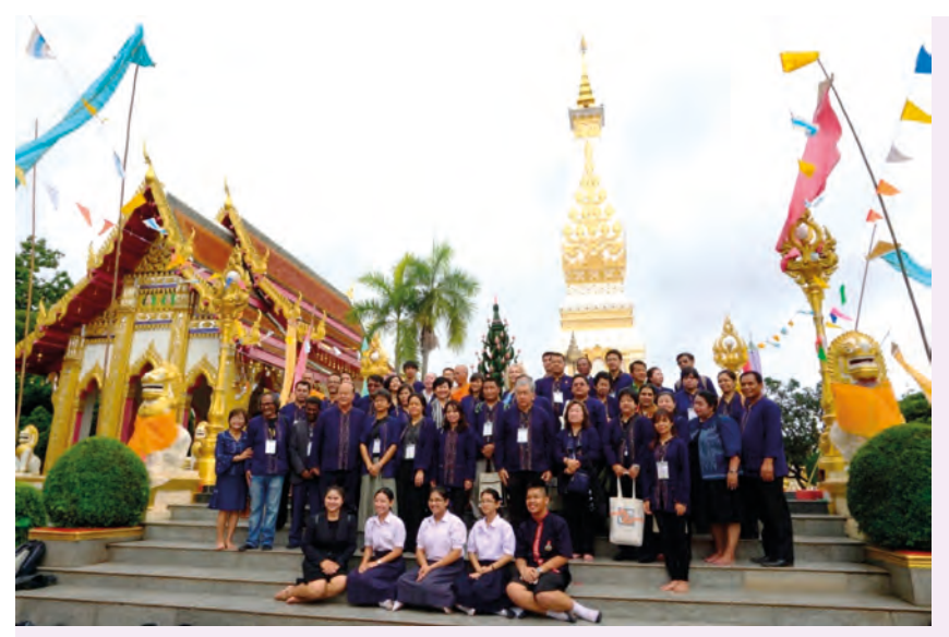
\begin{tabular}{ll} All Participants had a group photo in front of That Phanom Temple, Nakhon Phanom Province \\ \\ \end{tabular}

The Thai National Commission has been carrying out an Exchange Programme of the Staff Members of the National Commissions for UNESCO since 1970. The purpose of this programme is to strengthen cooperation and understanding between the National Commissions for UNESCO of the participating countries. In 2017, a staff member from each of the participating National Commissions (China, Japan, Korea, Bangladesh and Sri Lanka) attended the programme between 4 and 12 September 2017. These officials had a chance to visit UNESCO regional officials, an ASPnet school in Ayutthaya province, World Heritage Site – Ayutthaya Historical Park, Satun Geopark in Satun province and related activities.