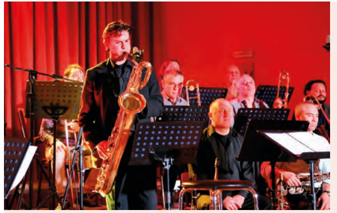
Concert of the Big Band of the Bulgarian National Radio \ensuremath{\texttt{@}} A to JazZ

Under the motto "Ancient Thrace: Myth and Reality", the 13th International Congress on Thracology was held in September 2017, in the town of Kazanlak – the valley of the Tracian kings. Over 200 eminent and world known scientists in Thracology from 25 countries participated in the forum presenting their new research and works.