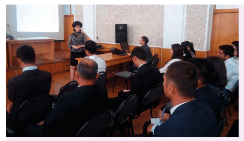
Training Course on Renewable Energy Technologies

The governmental delegations of Uzbekistan participated in the 39th session of the General Conference of UNESCO, the 41st session of the World Heritage Committee, the 6th session of the Conference of Parties to the International Convention against Doping in Sport and the 12th session of the Intergovernmental Committee for the Safeguarding of the Intangible Cultural Heritage.