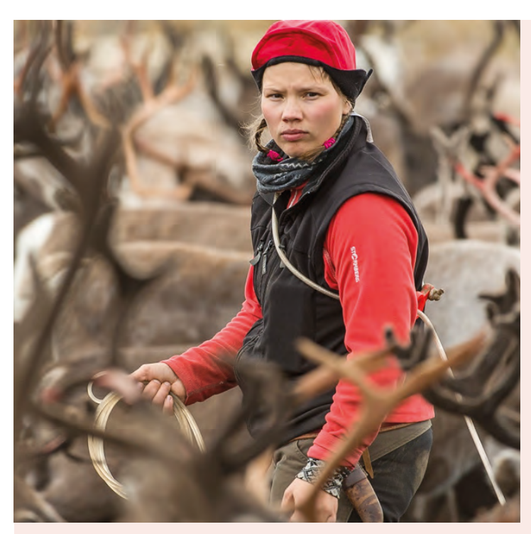
Reindeer herding in the MAB candidate Vindelälven

A new system for the nomination of UNESCO Chairs has been introduced where the Swedish Research Council develops proposals, relating to a set of criteria elaborated by the National Commission based on UNESCO's Medium-Term Strategy and the 2030 Agenda. The aim is to link the Swedish UNESCO Chairs closer to national priorities and our areas of special competence as well as to UNESCO's priorities.