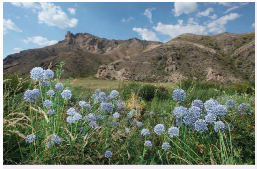
\textbf{Karatau} @ \ \, \text{National Commission of the Republic of Kazakhstan for UNESCO} \ \, \text{and ISESCO}

Overall, in 2017 Kazakhstan National Commission has demonstrated its continuing commitment to further enhancing UNESCO's activities and visibility at national, regional and global levels.