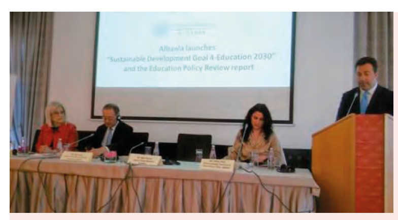
SDG4-Education 2030 and the Education Policy Review © Ministry of Education, Sports and Youth

The Albanian National Commission has been in contact with its regional and world homologues in exchanging experiences and undertaking common projects.