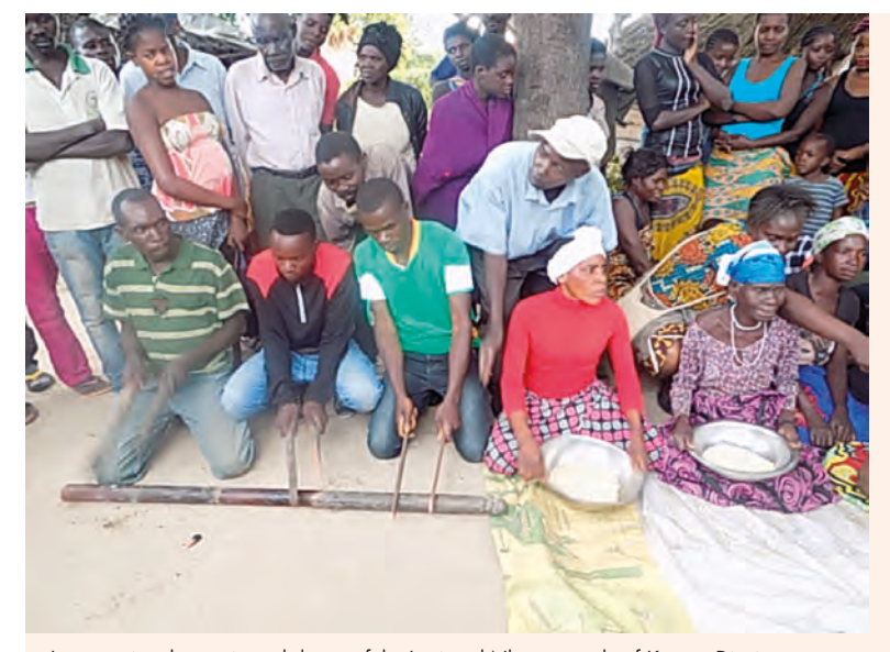
Inventorying the music and dance of the Lozi and Nkoya people of Kaoma District

Other activities included the Regional Meeting for Teacher Standards and Competencies in Lusaka (14-15 June 2017), organised in collaboration with UNESCO Regional Office for Southern Africa and SADC Secretariat; the 7<sup>th</sup> Regional Centre of Expertise Conference on Education For Sustainable Development (2-4 August 2017) held in Lusaka; the AfriMAB Southern Africa Sub-Region Workshop on Biosphere Reserves (28-29 August 2017) held in Cape Town; the 12<sup>th</sup> Session of the Intergovernmental Committee for the Safeguarding of Intangible Cultural Heritage (3-9 December 2017) in Jeju Island of the Republic of Korea; and the 39<sup>th</sup> Session of UNESCO General Conference (30 October – 14 November 2017) in Paris, France.