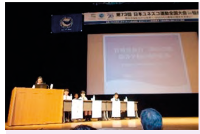
Panel discussion at the 73<sup>rd</sup> National Conference of the UNESCO Movement, held in Sendai, Miyagi.

Furthermore, JNCU is actively working towards achieving SDGs by participating in the international conferences of the Intergovernmental Oceanographic Commission (IOC) and the International Hydrological Programme (IHP).