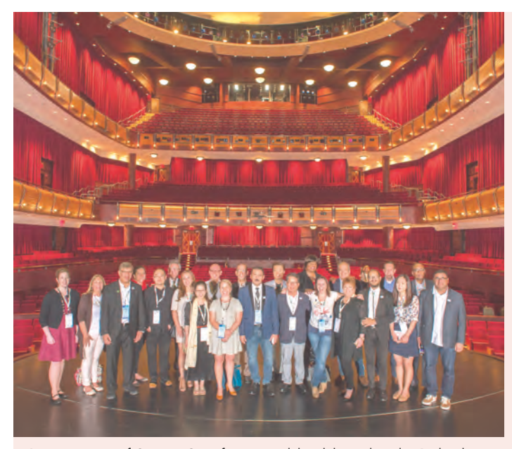
Representatives of Creative Cities from around the globe gathered in Paducah for the 2017 UNESCO Creative Cities of Crafts & Folk Art Annual Meeting, September 24-27, 2017

This year's Annual Meeting highlighted the newly formed Alliance for Education, Science and Culture (ESC), an initiative of Americans for UNESCO, a non-profit organization established in 1984 to build public support for UNESCO programmes in the United States, and to encourage U.S. engagement with the organization. The Alliance, which includes several current and past Commissioners, aims to mobilize individuals, communities, business leaders, and leading institutions to support and advance ESC in the United States.