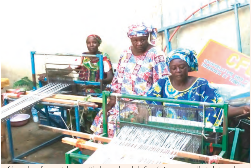
Séance de renforcement des capacités des membres de la Coopérative aux nouvelles techniques de tissage artisanal sur de nouveaux métiers à tisser

La Commission, grâce à ses consultants psychopédagogues, a également aidé une ONG active dans la défense des éléphants, dans la formation, en pédagogie de l'éducation environnementale, des enseignants exerçant dans les villages relevant de sa zone d'action.