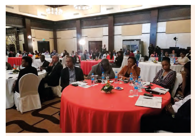
Delegates in working groups

From July to December 2017, many activities were organised by the Commission in Mauritius: Regional Conference and Ministerial Roundtable for Eastern Africa and adjacent Indian Ocean Islands to strengthen synergies for the protection of cultural heritage; International Day for the Universal Access to Information (IDUAI); UNESCO International Scientific Committee on Indentured Slave Route; UNESCO International Scientific Committee on the Slave Route Project; a seminar on Biosphere Reserve; and the UNESCO Merck African Research Summit (UNESCO-MARS), which was organised by the Ministry of Health and Quality of Life in collaboration with UNESCO and the Merck Foundation. The Opening Ceremony was graced by Mr Engida Getachew, Deputy Director-General of UNESCO.