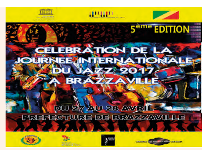
La journée internationale du jazz : un succès au niveau national

Un concert de clôture exécuté par le groupe musical Congo-NDULE-JAZZ, le 28 avril qui a connu la participation d'un large public et des autorités politiques.