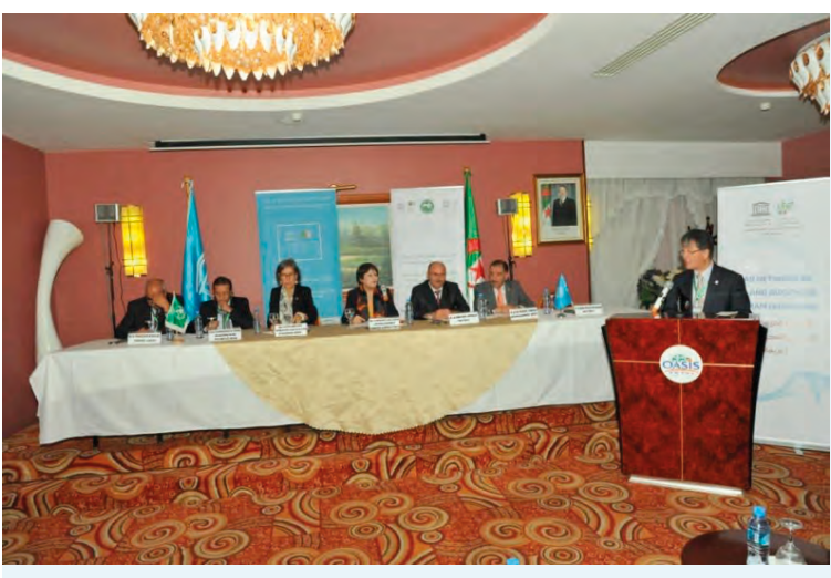
9ème Réunion du Réseau ArabMAB et Atelier régional sur les Réserves de biosphère