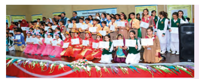
Group Photo of the Awards and Certificates Distribution Ceremony of Mitsubishi Asian Children's Enikki Festa @ Pakistan National Commission for UNESCO

During the 39th session of UNESCO General Conference, Pakistan was elected a member of several UNESCO bodies, including the Intergovernmental Committee for Promoting the Return of Cultural property to its Countries of Origin or its Restitution in Case of Illicit Appropriation (ICPRCP) for 2018-2021, the Intergovernmental Council of the International Programme for the Development of Communication (IPDC) for 2018-2021, Intergovernmental Council of the Management of Social Transformations (MOST) Programme for 2018-2021 and the Committee on Conventions and Recommendations of the Executive Board for 2017-2019.