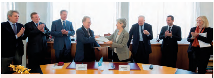
The Signing Ceremony for a Memorandum of Understanding for the protection and restoration of cultural property in conflict areas, notably in the Middle East between UNESCO and the State Hermitage Museum (Russian Federation)

In the field of Sport, the Commission substantially assisted the preparatory and working processes of the 6th International Conference of Ministers and Senior Officials Responsible for Physical Education and Sport (MINEPS VI) that was held in Kazan and gathered around 700 delegates from more than 100 UNESCO Member States. As an outcome of the Conference, the Kazan Action Plan was adopted as a voluntary overarching reference for fostering international convergence amongst policy-makers in physical education and sport, as well as a tool for aligning international and national policy in these fields with the key relevant international documents.