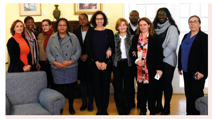
Participants du Workshop de renforcement des capacités des Commissions nationales des pays de langue portugaise (Afrique et Timor-Leste)

Une exposition sur le Patrimoine mondial, patrimoine subaquatique, réserves de biosphère, géoparcs et chaires UNESCO au Portugal préparée par la Commission nationale a été lancée au siège de l'UNESCO dans le cadre de la candidature du Portugal au Conseil exécutif.