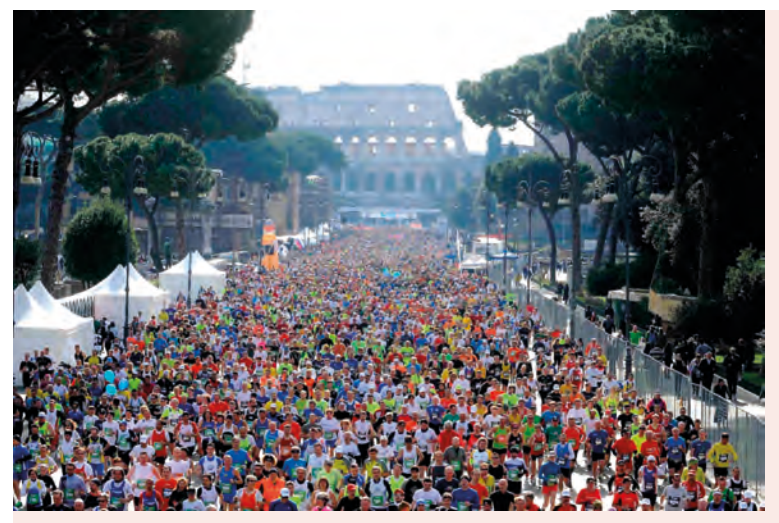
Rome Marathon 2017: running through history

The Commission has also been cooperating with Rai Italia for the television programmes "Community and Italian Beauty", showing to Italians living abroad, Italian World Heritage sites and elements inscribed on the Lists of Intangible Cultural Heritage, in 2017 and 2018.