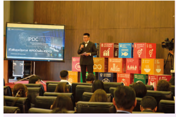
"IPDCtalks: Mongolia" forum on 28 September 2017

In the course of the year, four projects were successfully implemented within the framework of UNESCO's Participation Programme 2016-2017 and the national conferences on bioethics, safe school campaign, gender-based violence, youth employment and the promotion of the rights of persons with disabilities were organized in the field of social and human sciences. Furthermore, the National Commission organized the third "Model UNESCO Mongolia" conference in collaboration with UNESCO Beijing Office and UNYAP.