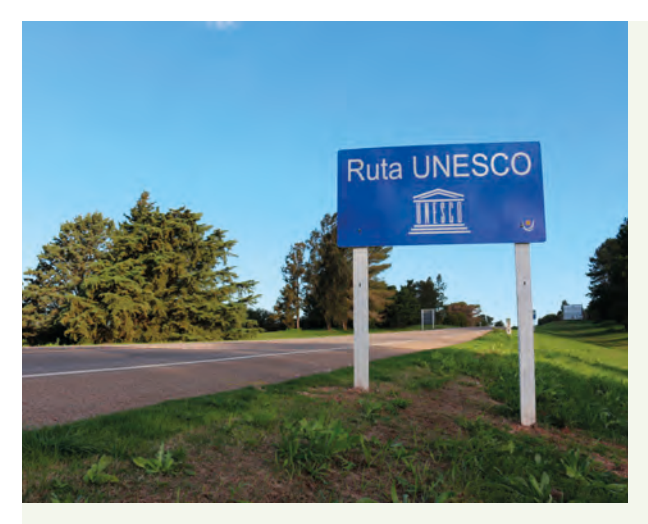
UNESCO Routes, Uruguay

Within the 2016-2017 Participation Programme, four projects were implemented with a great variety of themes related to the UNESCO Programme such as heritage, citizen mediation, art web tool for children, and "Ajedreteca" didactic bags.