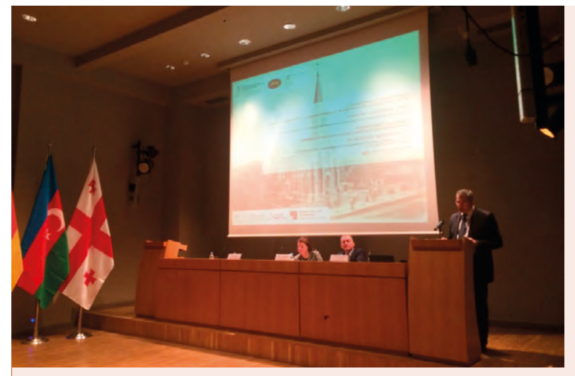
The conference entitled "Common Heritage for Intercultural Dialogue and Development" organized in the framework of the 200th anniversary of the German settlements in Georgia was held at the National Museum of Georgia, in December 2017