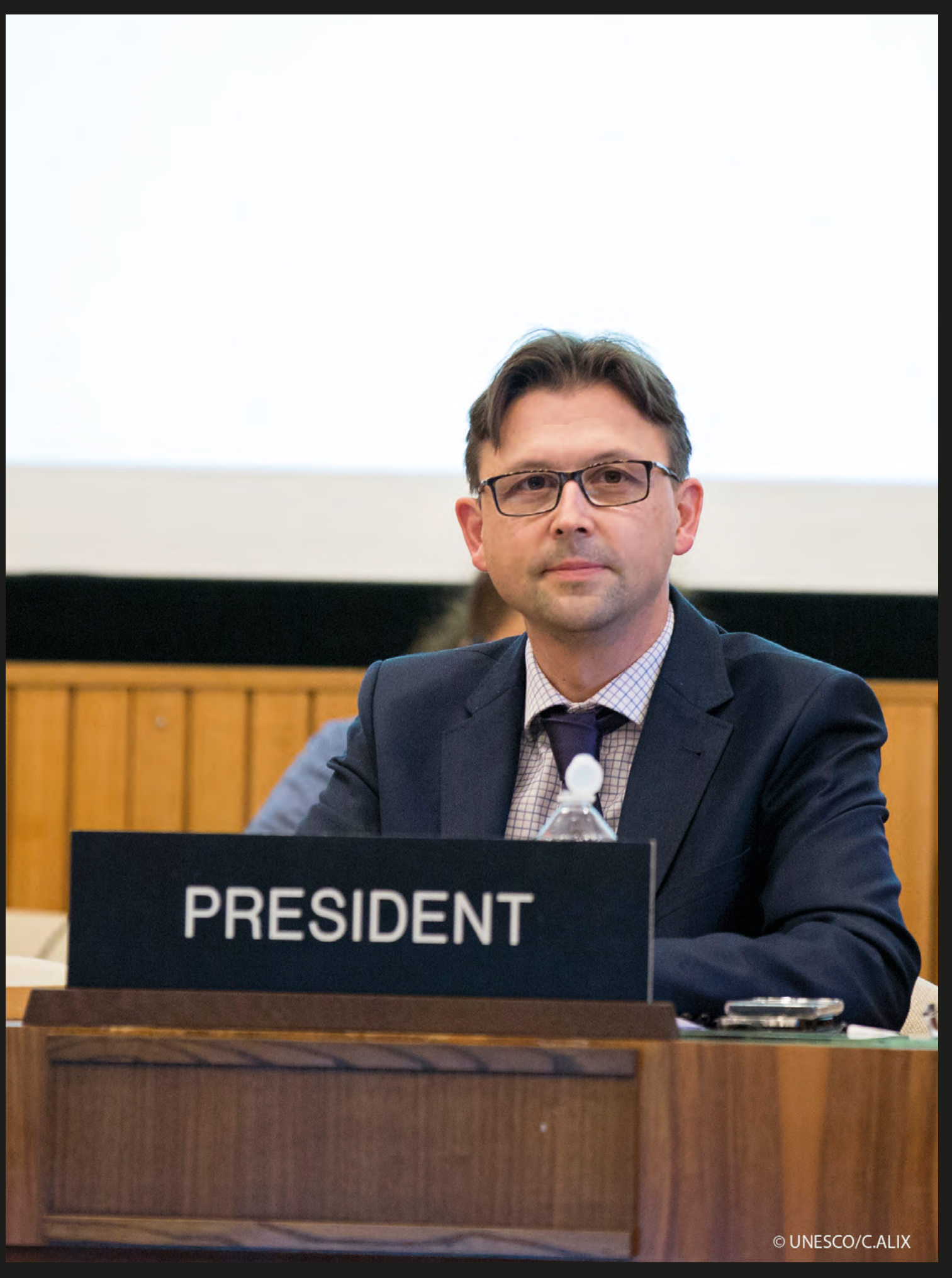
4^{th} Interregional Meeting of the National Commissions that took place on 27 October 2017 at UNESCO Headquarters in Paris.