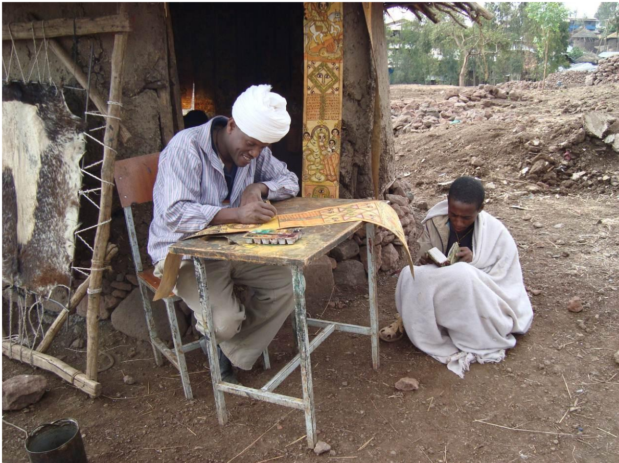
Figure 11 Traditional building as art workshop and study area for Lalibela clergy