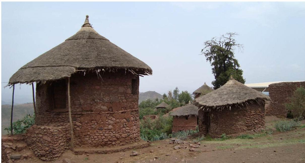
Figure 4 Unoccupied circular tukuls in church compound

The traditional housing of Lalibela is characterised by two main types of buildings: the circular one-storey tukul houses (ground and one floor), with external staircases leading to the upper level and the rectangular one-storey residences (ground and one floor). There are also circular single room buildings on only one level. In both cases, the walls are built of stone laid in mud mortar. The interior surfaces of the walls are often plastered with a rich mix of earth, straw and cow dung. The earth is mixed with straw from the teff plant ( Eragrostis tef ) and the mixture is applied to the wall after undergoing necessary processing. Sometimes cow dung is used almost completely on its own as a plaster for the internal and external wall surfaces.