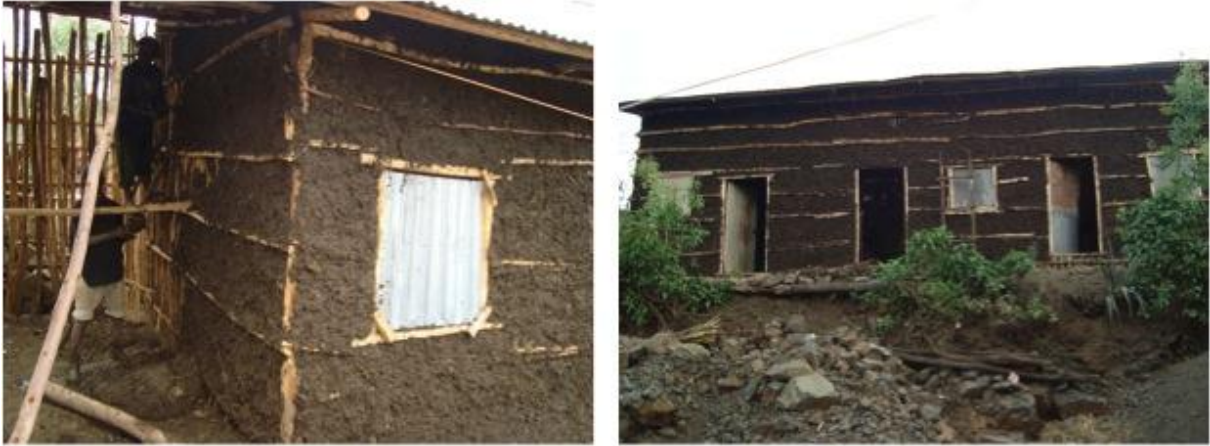
Figure 10 New earth buildings under construction in Lalibela