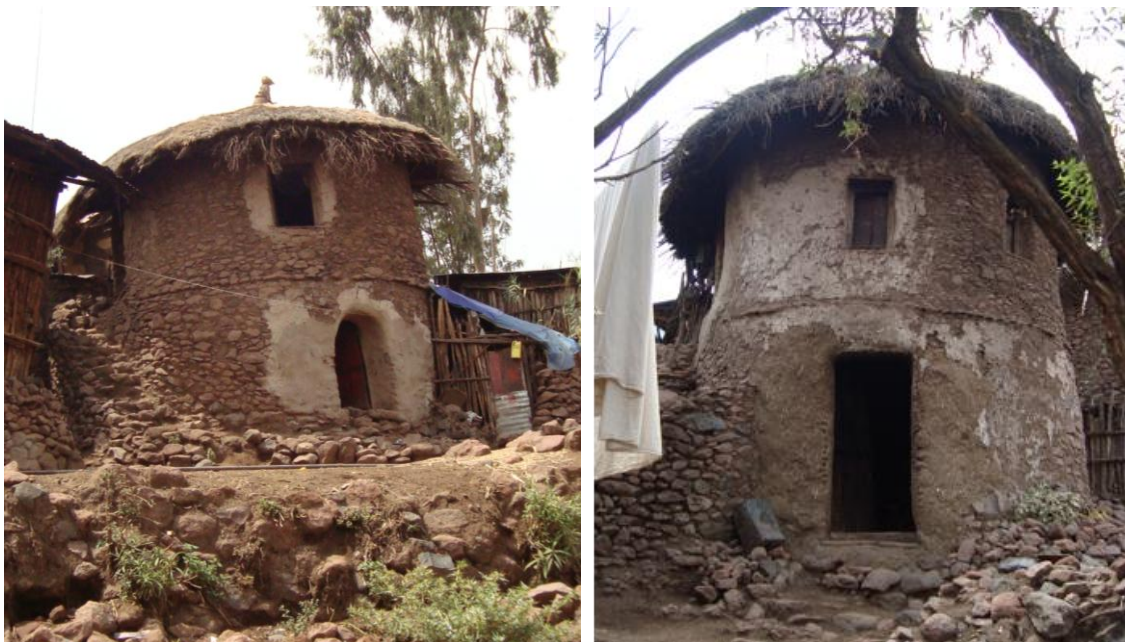
Figure 2 Tukuls in Hadish Adi

The oldest buildings in Lalibela are in Hadish Adi, Chefregotch, Sebat Weira, May Dagm and Tecco. Of these, Hadish Adi is in very close proximity with the church compound. The socio-economic situation assessment by WUB Consult records that buildings that are over 20 years old constitute 91.26% of building stock in the village (WUB Consult (d), 2010).