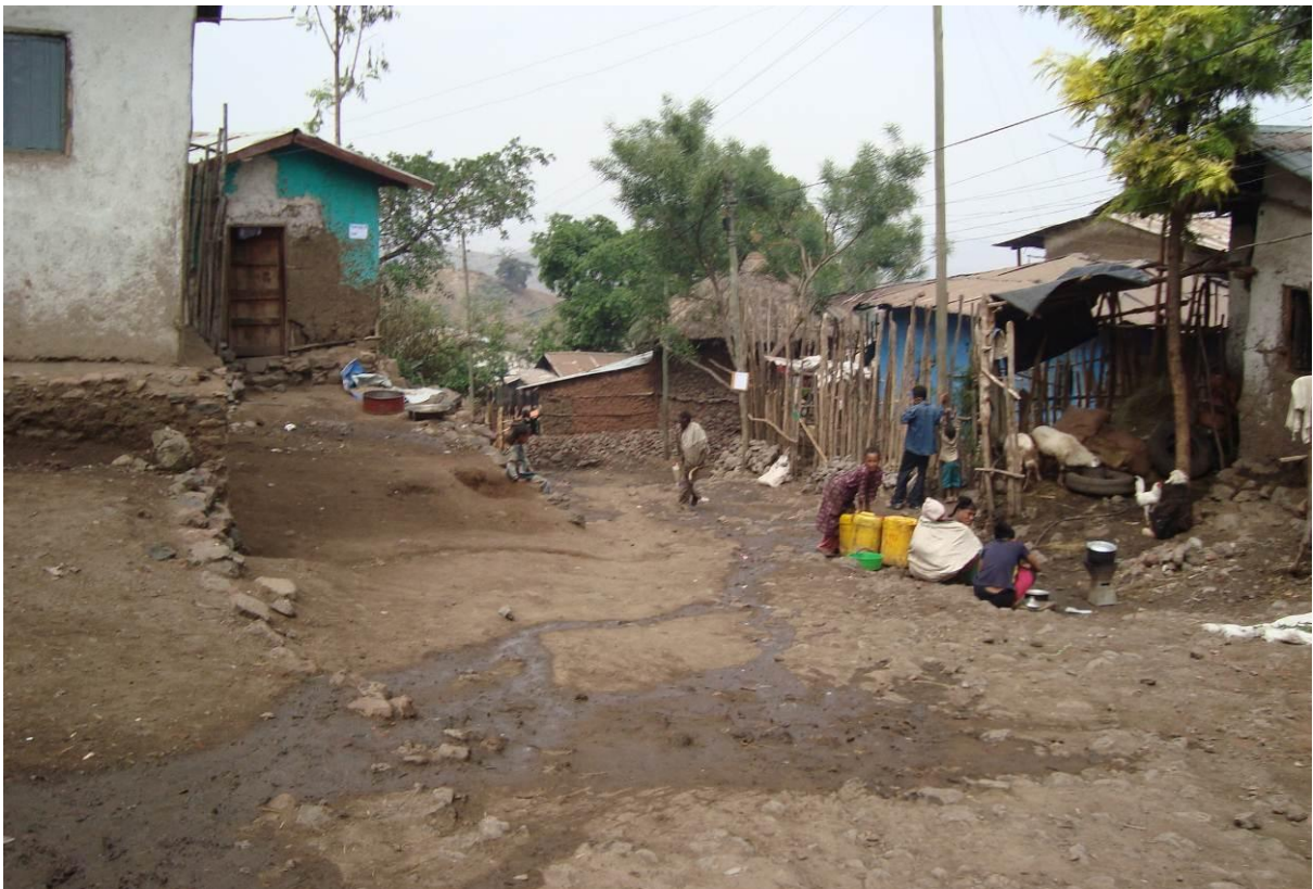
Figure 12 Street scenes in Hadish Adi. Note the state of conservation of the wattle and daub buildings