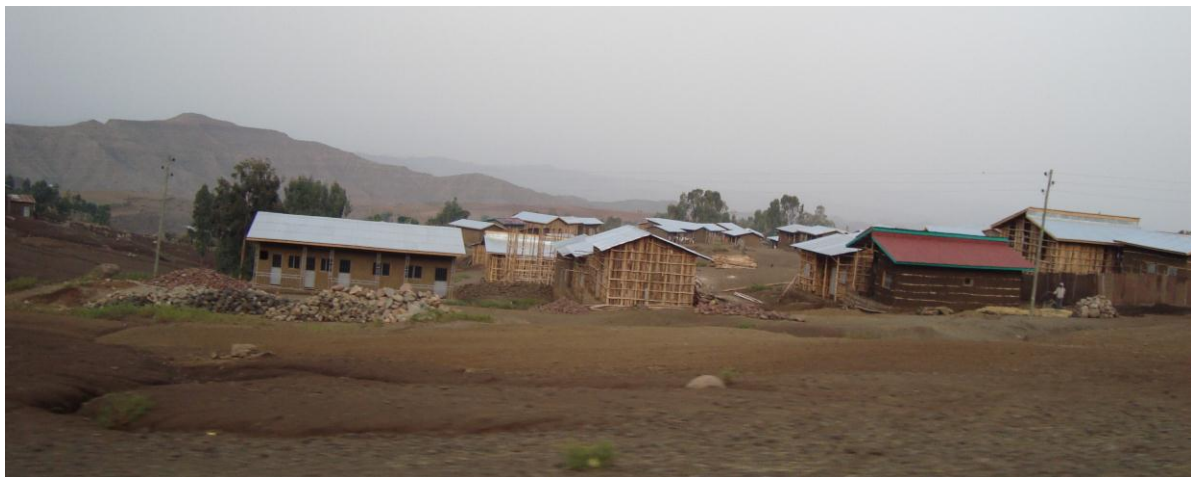
Figure 7 New buildings around Lalibela

Lalibela consists mainly of dispersed settlements that spring from a central node around the churches and spreads out into the surrounding country side, most of which is not built up due to the nature of the topography. About 80% of the buildings around the churches, and in outlying areas, are made of earth, in different combinations with wood and stone. Most of these buildings have galvanised iron roofs irrespective of the material of wall construction. The older sections of the town can be clearly marked out by the colour of their iron roofs that have been oxidised and have changed colour. There are very few private residences built in concrete blocks. One of the dominant challenges in the residential areas around the church is that of human waste disposal. 74.8% of the houses in Hadish Adi do not have toilet facilities (WUB Consult (c), 2010), and this leads to the use of the open areas around the village as toilets. This greatly diminishes the experience of the site, especially during viewing from the top of the Sebat Woyra (Seven Olives) Hill.