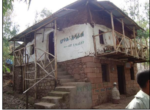
Figure 14 NGO building based on traditional model