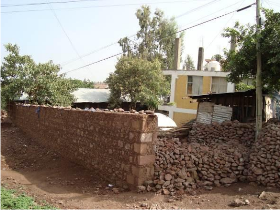
Figure 13 Stone wall laid in earth mortar