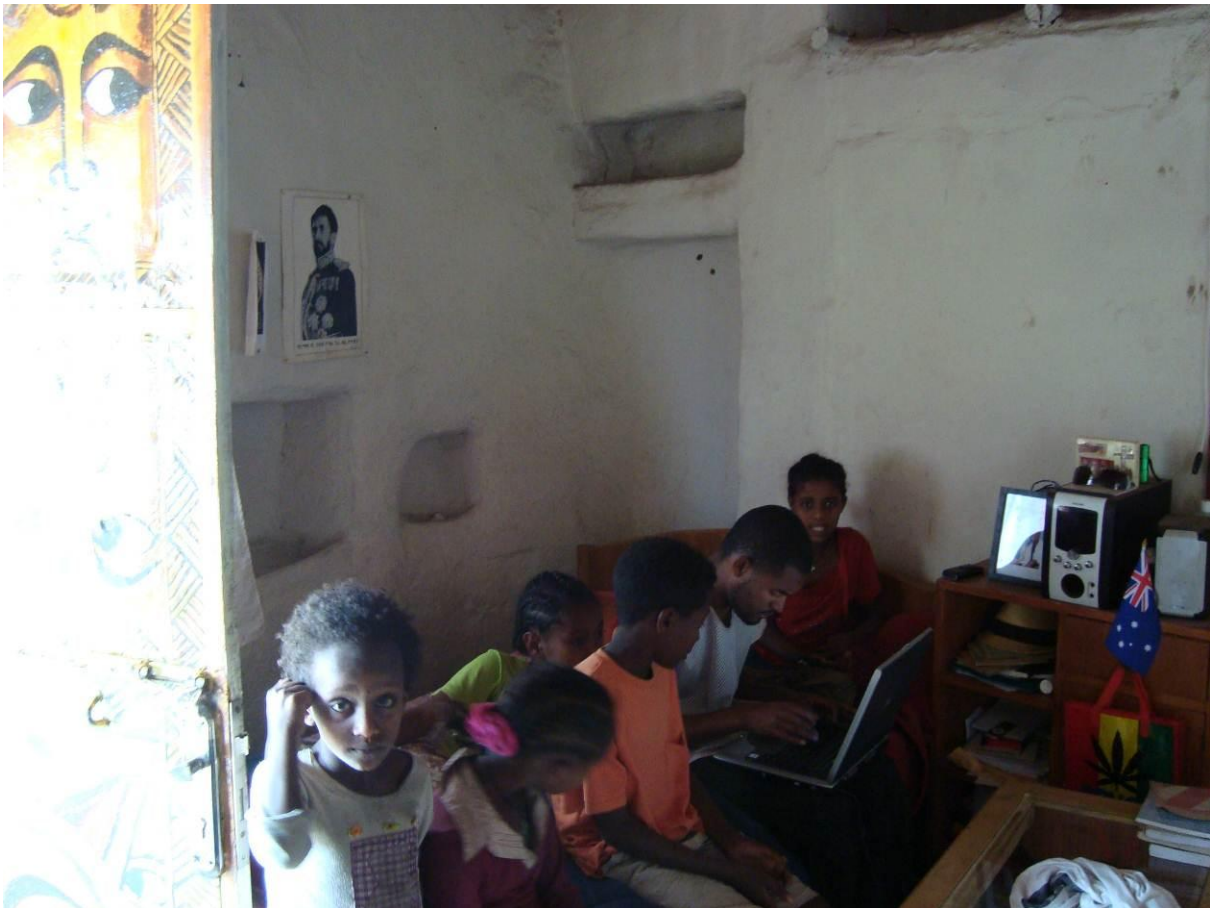
Figure 16 Sandro Angelini's 1967 tukul