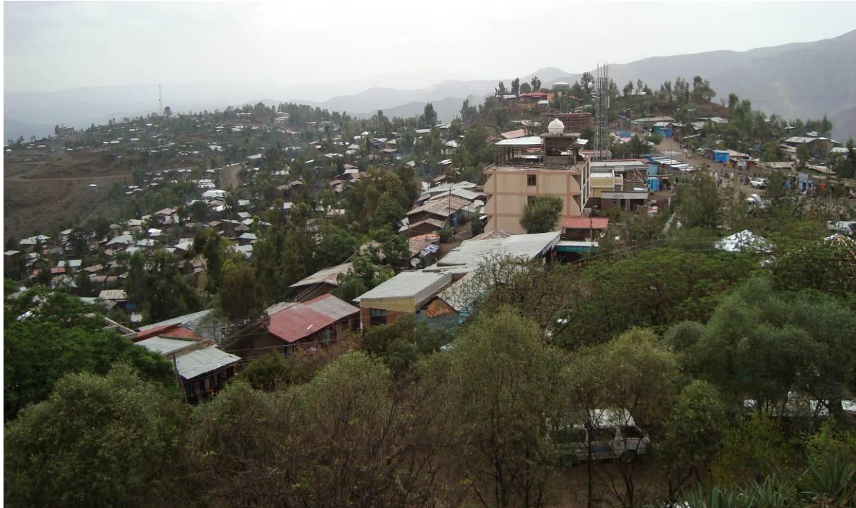
Figure 8 Urban sprawl of Lalibela, viewed from the Sebat Woyra Hill

census) to 13.3% in 2009 6 . This remained the observation at the time of the mission. Most new stone construction is taking place around the investment interests of hotel developments – in the context of reinforced concrete structures and stone clad walls.