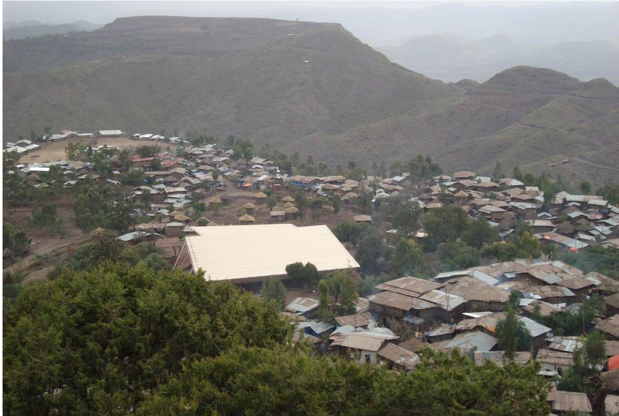
Figure 1 Part of church compound affected by first stage of resettlement programme. Note the new thatch on the remaining buildings. Dense concentration of buildings in right foreground is part of Hadish Adi village