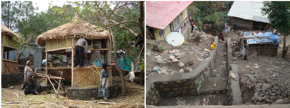
Figure 9 Ongoing development project in Lalibela (L) shelter construction in park (R) drainage construction, July 2010

The current drive by the multi lateral programmes that are currently underway is aimed at addressing these socio-economic challenges. This invariably could create a situation in future that improved economic conditions might also lead to increased desire for ‘modern’ concrete houses. This is where the danger lies. If the earth houses are viewed as unsanitary or unable to allow for the conveniences of modern life, people will need little motivation to switch over once their economic bases are improved.