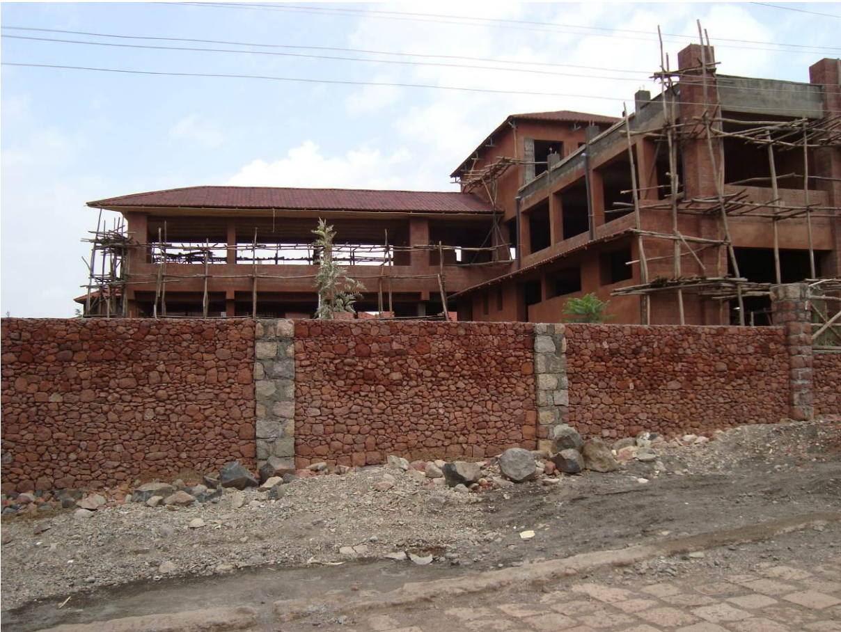
Figure 15 Hotel Construction outside the protected zone. Note mixed use of stone and concrete