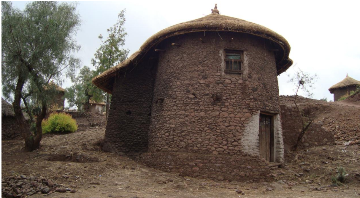
Figure 6 Variation of traditional tukul building in church compound

The wooden poles used for the creation of the structural frames for the earth buildings are often eucalyptus trees, exotic trees imported into the region from Australia, under the reign of Menelik II in the late 19 th to early 20 th century. The apparent preference for this method over the stone buildings is most likely one of economic expediency. The continued use of the wooden poles and the accelerated rate of growth of the town also raise questions of possible deforestation, one that