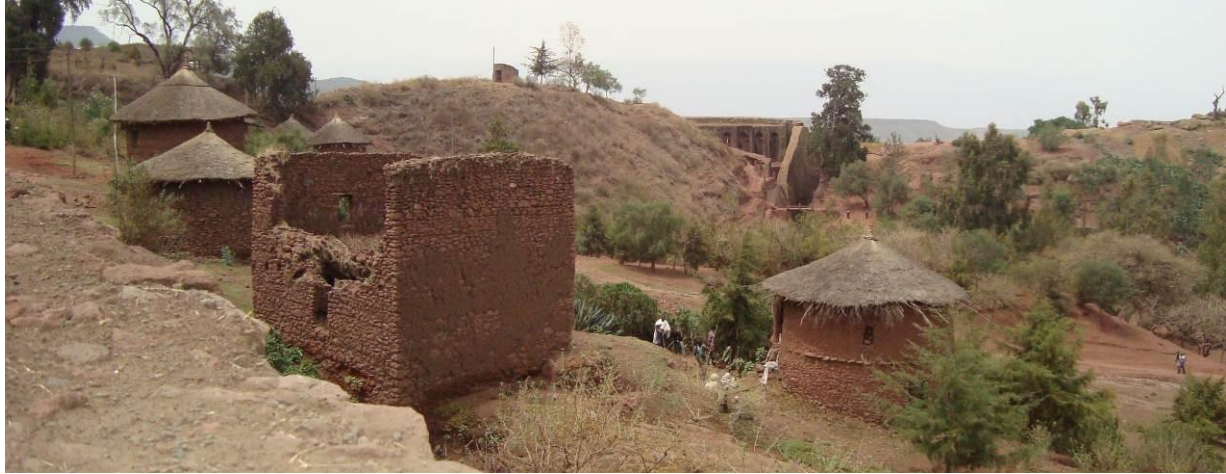
Figure 5 Remains of a square-shaped traditional building in church compound

prescribes conservation measures. 4 He further goes on to identify the presence of rectangular buildings that had emerged as a result of ‘new economic rules’ and which were ‘irreversible’ in character (Angelini, 1970). Today, there are few new recently constructed traditional tukul houses around the protected areas. Angelini also built a house based on the traditional model in 1967, which he modified to include water areas. The building is still functional and occupied. The dominant housing types in Lalibela today are adapted from the traditional buildings. These are rectangular row houses with walls of wood frames (wattle) infilled with earth (daub) and covered over with corrugated iron roofs.