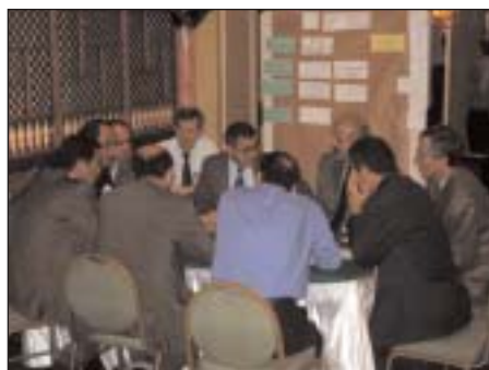
Participants at the Damascus workshop

A regional workshop was held in Damascus, Syrian Arab Republic, from 21-22 October 2003 to launch the "Regional Projects of Five Arab States for Cooperation in the Field of Technical and Vocational Education and Training (TVET)" as initiated and supported by the German Technical Cooperation Agency (GTZ).