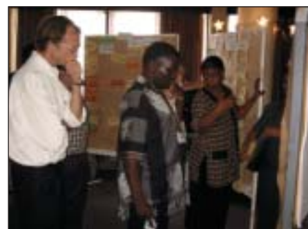
LLWF Workshop in Tanzania

The workshop was structured in working groups. There was a general consensus that these groups needed to be guided towards agreed outcomes. A professional Chief Moderator from Germany was therefore engaged to train 12 selected par-