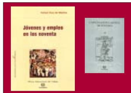
Examples of publications

tries of this region. As the analysis of the lessons learnt from the different actions carried out in this region progress, the quality and relevance of the training programmes for young people will continue to improve.