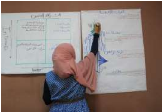
Participant mapping solutions of conserving built and natural environment

UNESCO Regional Office for Science in the Arab States-Cairo took the lead of the Environment track through a real case scenario inspired by the history and culture of the city of Alexandria. The track's main aim was to engage youth in reflecting on their role in promoting harmony in the relationships between human and nature and in re-stitching the path towards strong engagement of the private and public sectors in nature conservation. The sessions guided participants on how to become engine for