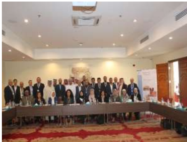
Keynote speakers and participants from twelve Arab States joining the 2-days dialogue on Geoparks.

Building on the outcomes and recommendations of a first Arab experts meeting held in Cairo in 2016, the second regional geopark meeting brought together a wider group of stakeholders including government representatives, scientists and practitioners to mobilize efforts at the governance level as well as academic and research to promote the concepts, practices and approaches of UNESCO Global Geoparks in the Arab region. The second meeting of this 2-day dialogue was held on November 15 and 16, 2017 in Amman in Jordan. It brought together a wide group of 25 participants from 12 countries including government representatives, scientists, planners and practitioners.