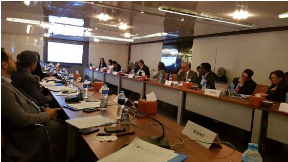
ESCWA-UNESCO 9th Capacity Building Workshop for Arab Climate Change Negotiators