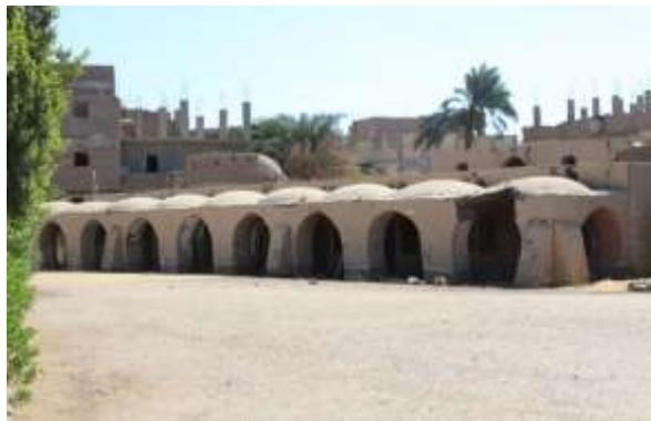
The Mosque

Various meetings took place between NOUH and UNESCO Cairo Office, where a detailed work plan was approved. The project was officially announced to the public on 13 November 2017 in NOUH, where a photo gallery of Hassan Fathy's work was put on display. The ceremony was organized by NOUH in collaboration with UNESCO Cairo Office and the American University in Cairo (AUC). The site of the Khan was officially handed over from the Governor of Luxor for the launching of the first phase on 15 October 2017.