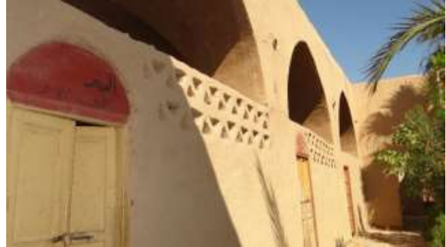
The Khan begging rehabilitation