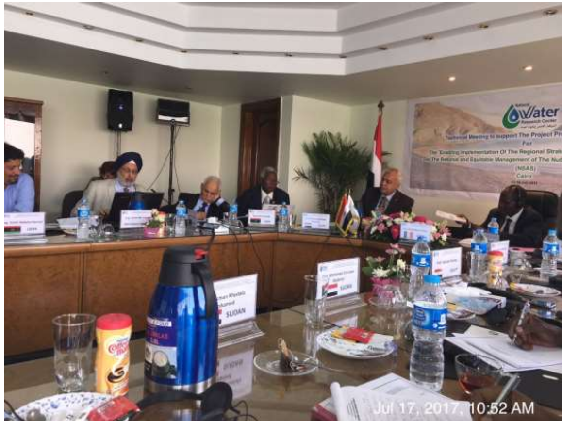
Members of the Joint Authority of the Nubian Sandstone Aquifer (Shared between Sudan, Libya, Egypt, and Tchad) discuss the UNESCO proposal for support of cooperation on Shared Management of the Aquifer

Following a request from the National Water Research Centre (Egypt), UCO extended its support to the Joint Authority of the Nubian Sandstone Aquifer (Egypt, Libya, Sudan, and Tchad) to organize a technical meeting on the UNESCO UNDP-GEF proposal “Enabling implementation of the Regional SAP for the rational and equitable management of the Nubian Sandstone Aquifer System (NSAS)”. The meeting was held on July 2017 in Cairo and was attended by all members of the Joint Authority (JA) and the JA Secretariat. A number of national technical experts also attended the meeting.