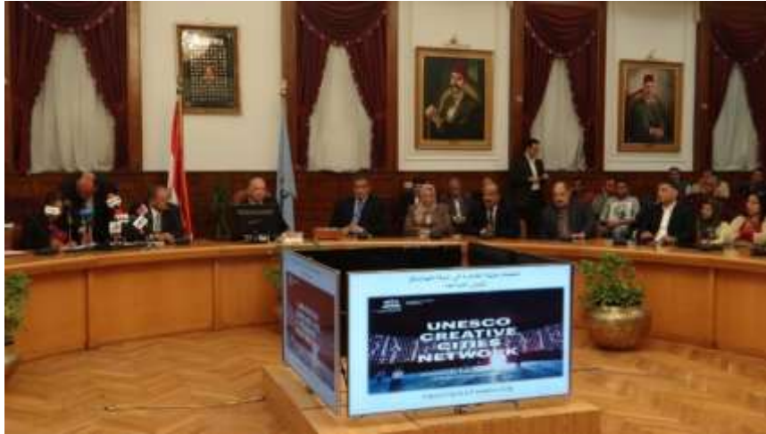
The governor of Luxor and the Director UNESCO Cairo at the round table

In a ceremony held at the Governorate of Cairo on November 1, 2017 the crucial role of cities in promoting sustainable development focused on people was enhanced by the Governor of Cairo, the Director of UNESCO and the Egyptian National Commission for UNESCO.