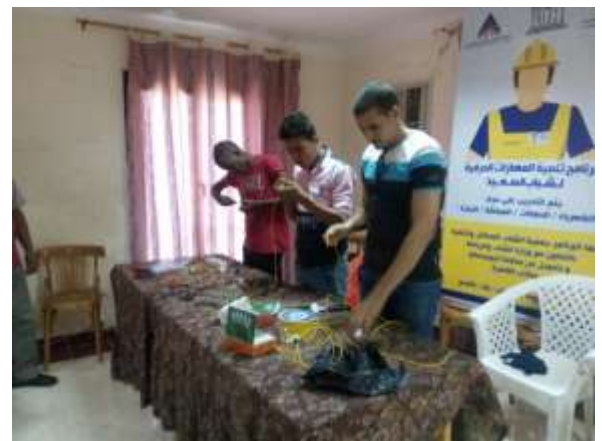
Youth from Upper Egypt participate in vocational capacity-building workshops on electricity

Cooperation between UNESCO and MoYS is on-going. In the summer of 2016, a series of workshops were successfully organized in Tanta, Port Said and Cairo under the theme "A Society with Gender Equality and Non-Violence". These workshops helped to sensitize young Egyptian men and women to these vital issues through the use of artistic expression.