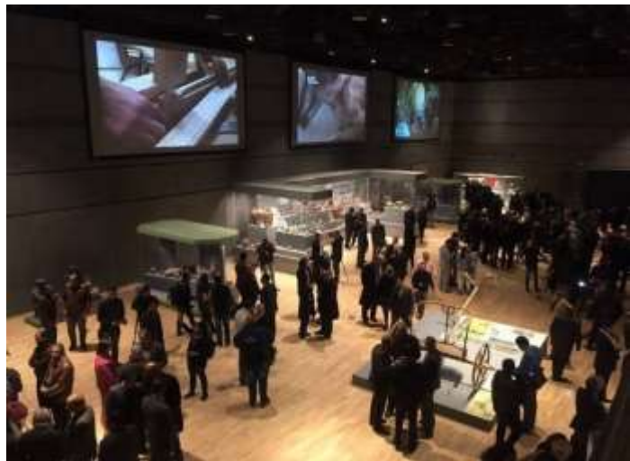
Temporary Exhibition Hall showing “Egyptian Craft through the Ages”

The inauguration of the exhibit was a result of a collaborative effort between the UNESCO Cairo Office and the Ministry of Antiquities of Egypt. It was one of the recommendations of the 18th session of the Executive Committee of the International Campaign for the Establishment of the Nubia Museum in Aswan and the National Museum of Egyptian Civilization in Cairo. It is a step towards establishing NMEC as an educational lighthouse protecting the different facets of Egyptian Civilization through crafts, history, languages, depicting Egypt as a pioneer in philosophy, architecture, medical sciences, arithmetic, and astronomy.