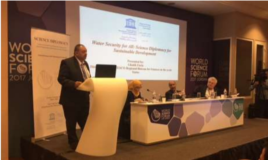
Mr. Ghait Fariz, Director of UNESCO's Regional Bureau for Sciences for the Arab States presents the "Water Security for All Initiative during the special session at the World Science Forum 2017.

In line with the outcomes of the 1999 World Conference on Science (WCS), and the 2015 Budapest Declaration on The Enabling Power of Science, the 2017 Jordan Science for Peace World Science Forum (WSF) 2017 was successfully organized in Dead sea, Jordan; 7-11 Nov.2017 with the participation of over more than 3,000 science leaders from more than 120 countries.