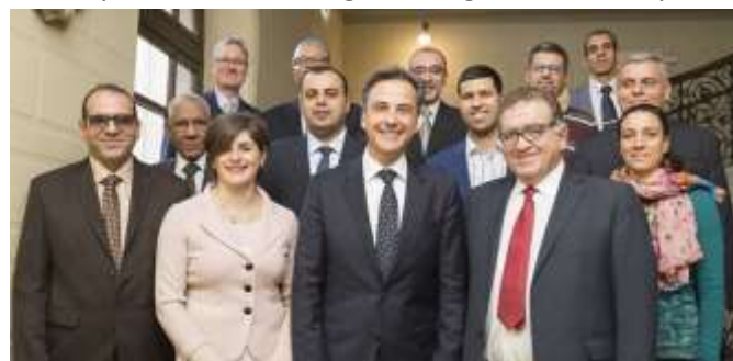
Participants of the study tour meet with the Mayor of Graz