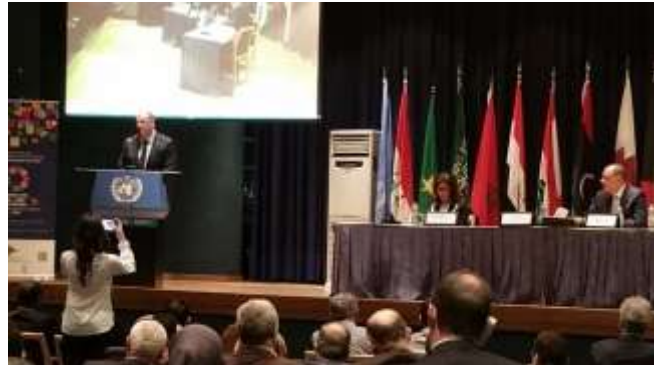
Representative of Prime Minister delivering opening remarks at UNESCO Arab High-Level Forum on WSIS and 2030 Agenda (UNESCWA Sec General a.i. and Chief of ICT Policies are at the dais)

The event entitled the “Arab OER Forum: Advancing a Regional Agenda”, brought together more than 50 national, regional and international experts from the governmental, intergovernmental, academic, civil society and the private sectors working in the field of OERs. It provided an opportunity to reflect on specific challenges faced by the Arab States, identify and share areas where the Arab OER Forum was advancing efforts and explore how it could effectively support implementation in the Arab States of the decisions of the Second World OER Congress.