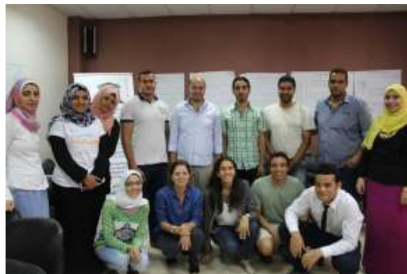
Young participants during the International Youth Day 2017 celebration in Abu Qir city in Alexandria.

Environment Ethics lines of thoughts- those that craft unconsciously human's mindsets that are at the base of human relationships with nature. At the end of the youth camp, the essence of discussions was revealed during the role-play presented by the participants. Youth expressed that humans during their self-development paths are transformed from being self-centered to turning outwards to others and embrace