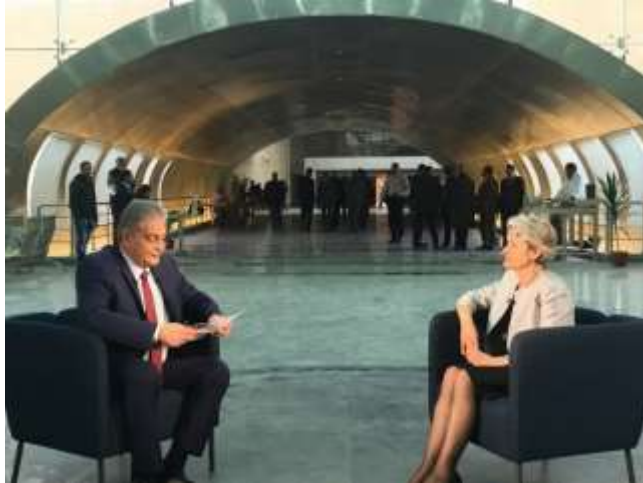
H.E. Ms. Irina Bokova, Director General of UNESCO, interviewed for the Egyptian Television on the night of the “soft” opening of the NMEC

On 15 February 2017, the temporary exhibit “Egyptian Crafts through the Ages” was inaugurated. The official opening took place in the presence of H.E. Prof. Dr. Khaled El-Enany, Ministry of Antiquities of Egypt and H.E. Ms. Irina Bokova, Director General of UNESCO, as well as personalities from the cultural and political spheres. The exhibit showcases objects that portray the development of four crafts from the beginning of the Egyptian Civilization to the present day. The four crafts highlighted in the exhibition are pottery making, jewelry making, woodworking, and textile production.