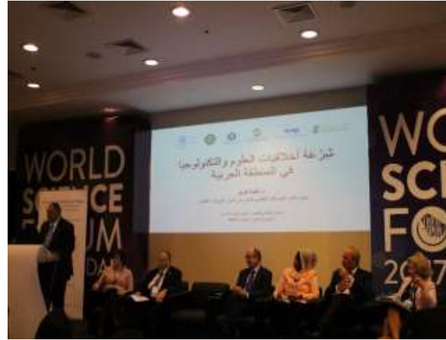
Special session on the Arab Charter at the World Science Forum.

Panelists and participants confirmed the usefulness of the Charter and its relevance to the challenges facing science and technology in the region. The role of the Charter in enhancing the quality of research in the region and protecting vulnerable groups was highlighted. Freedom of research, open access to knowledge, and the ethics of emerging technologies such as big data and artificial intelligence were among the questions raised in the session. Several participants stressed the importance of operationalizing the Charter through its adoption by universities and other stakeholders, and the elaboration of an evaluation and follow-up mechanism.