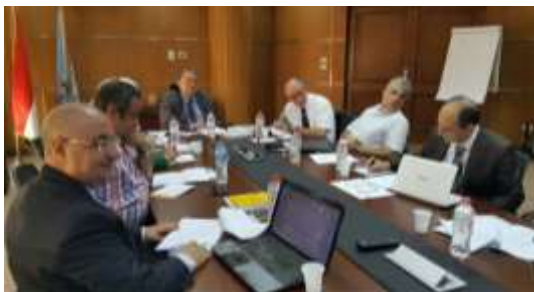
Participants at the expert consultation on the Arab Charter of Ethics of Science and Technology (Cairo, 1 October 2017)

UNESCO Cairo Office organized an expert meeting to discuss and review the preliminary draft of the Arab Charter. The meeting, which was held at the UNESCO Cairo office on 1 October 2017, was attended by distinguished representatives from the National Council for Scientific Research in Lebanon, the League of Arab States, the Academy of Scientific Research and Technology in Egypt, the Royal Scientific Society of Jordan, and Institut Pasteur