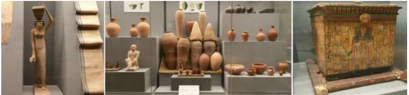
A selection of the treasures on display at the National Museum of Egyptian Civilization. UNESCO provided technical guidance in the construction of the museum and training of its personnel and continues to provide operational oversight. The museum opened to the public early in 2017.