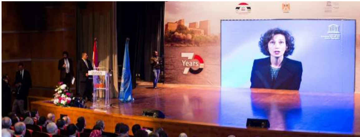
UNESCO's Director-General, Ms. Audrey Azoulay addressed the gathering by video message.

On Wednesday 6 December 2017, the United Nations Educational, Scientific and Cultural Organization (UNESCO), in cooperation with the Ministry of Higher Education and Scientific Research in Egypt and the Egyptian National Commission for UNESCO, celebrated the 70th anniversary of the establishment of the UNESCO Regional Bureau for Sciences in the Arab States in Cairo.