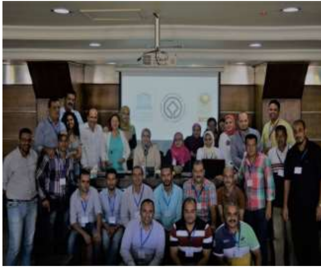
Participants during the training session of the workshop

More than 30 inspectors and sites managers, from the six Egyptian cultural sites inscribed on the World Heritage List and from several sites inscribed on the World Heritage Tentative list, came to the UNESCO Cairo new premises in sixth of October City to attend the one-week seminar. The main focus was enhancing the technical skills of Ministry's employees, sites managers and inspectors in the Management Plan for the sites under their responsibility.