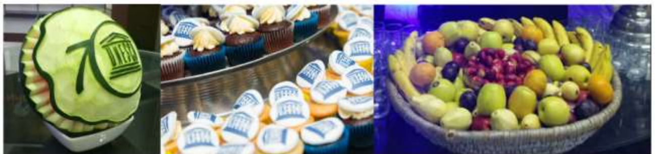
Selection of items from the buffet