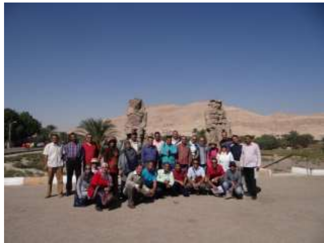
Participants in the workshop on "Management of Heritage Sites"

This workshop built on the outcomes of the previous biennium's initiatives supporting capacity building courses in the framework of the implementation of the Convention concerning the Protection of the World Cultural and Natural Heritage, adopted by UNESCO in 1972. Participants shared the motive that cultural heritage is our legacy from the past that we live with today and that we have the responsibility to pass on to future generations.