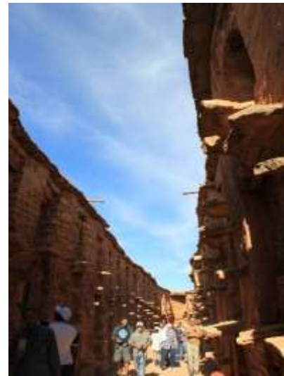
Arganeraie Biosphere Reserve field visit @UNESCO/E. Sattout.

The UNESCO Regional Office for Sciences in the Arab States in close cooperation with the UNESCO Office in Rabat, ISESCO, ALECSO and the Government of Morocco organized the 2nd IHP-MAB initiative meeting to promote the biosphere reserve as an observatory to monitor climate change and to share lessons learned on sustainable development in the Arab and African region. The meeting gathered more than 50 participants from the Arab and African countries in the Royal Atlas Hotel in Agadir in Morocco from November 17 till 19, 2017. The field visit to the Arganeraie Biosphere Reserve (ABR) showcased community involvement, biodiversity conservation and ecosystems restoration as well as the importance of indigenous knowledge and cultural preservation. It is worth noting that the IHP-MAB initiative stemmed from UNESCO's COP initiative entitled 'Changing minds, not the climate'.