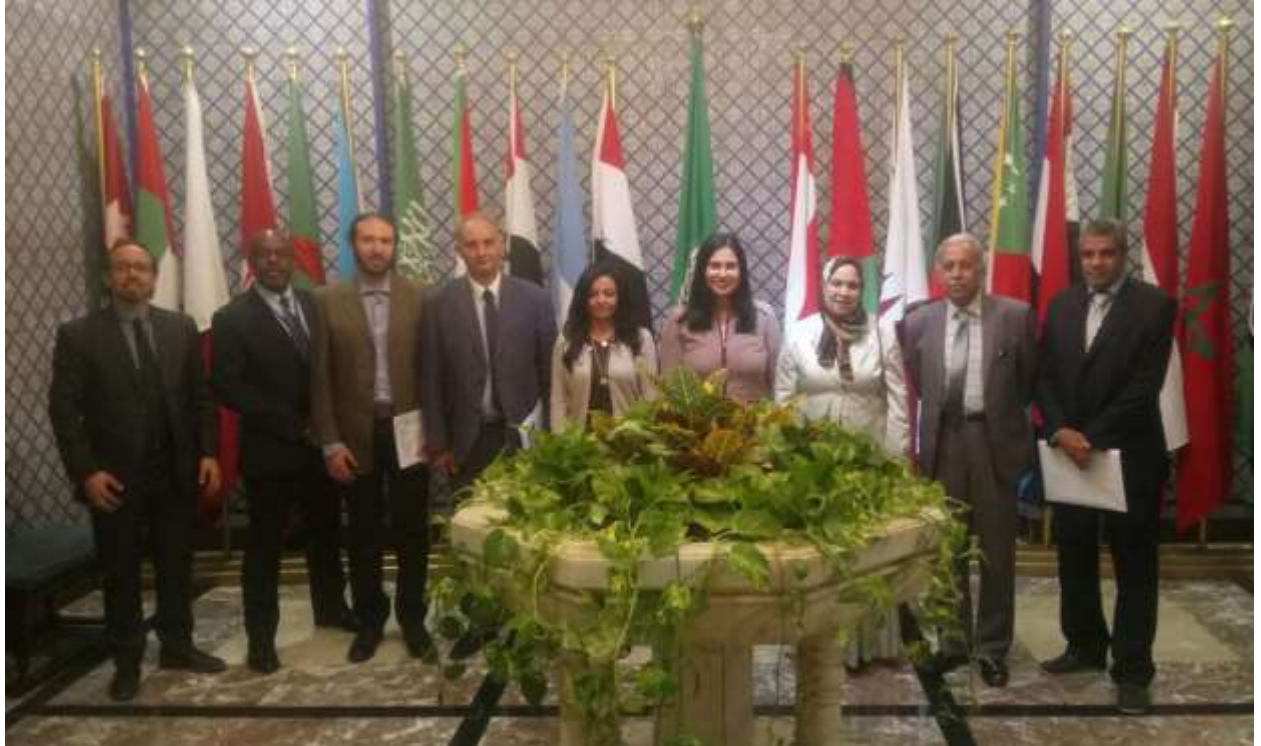
Participants at the First Preparatory Meeting for the seminar "A Message to Media Professionals"

The UNESCO Cairo Office has been deepening its cooperation with the League of Arab States (LAS) across the 5 programme areas of Education, Natural Sciences, Social and Human Sciences, Culture as well as Communication & Information. In the field of Communication and Information, efforts are currently underway between LAS, UNESCO and the United Nations Office of Counter-Terrorism's UN Counter-Terrorism Centre (UNCCT) to develop a joint project that seeks to remove conditions in the region that are conducive to the spread of terrorism and extremism. The project aims to achieve this by strengthening capacities in media and information literacy amongst youth and media professionals in order to create a climate enhanced dialogue, respect and mutual understanding. The initiative is expected to launch in 2018.