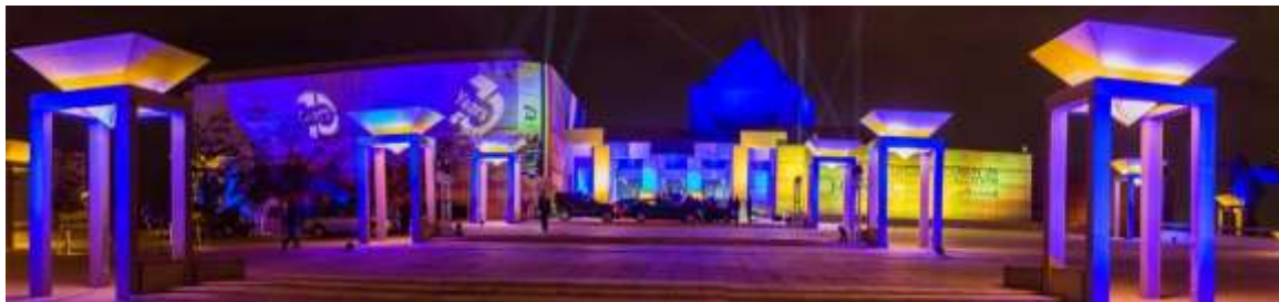
National Museum of Egyptian Civilization lit up for UNESCO's 70th Anniversary Celebrations

The celebrations to mark this major event - held under the slogan “70 years of building peace in the minds of men and women in the Arab region” - were organized at the National Museum of Egyptian Civilization under the patronage of H.E. Mr. Sherif Ismail, Prime Minister of the Arab Republic of Egypt.