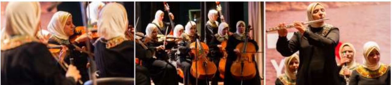
The Light and Hope Orchestra is composed of visually impaired female, Egyptian musicians. They regularly perform in global capitals delighting and inspiring audiences.

The UNESCO Regional Bureau for Sciences in the Arab States is part of UNESCO's global network of 52 field offices. Established in 1947, the Cairo Office holds the distinction of being amongst the oldest UNESCO Field Offices in the world. Through targeted interventions, it is supporting Arab countries to achieve the 2030 Sustainable Development Goals.