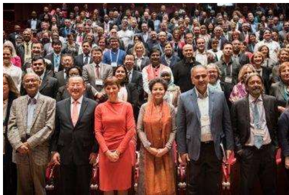
The 2nd World OER Congress was attended by Representatives of governments, international organizations, universities, professional bodies and other global experts