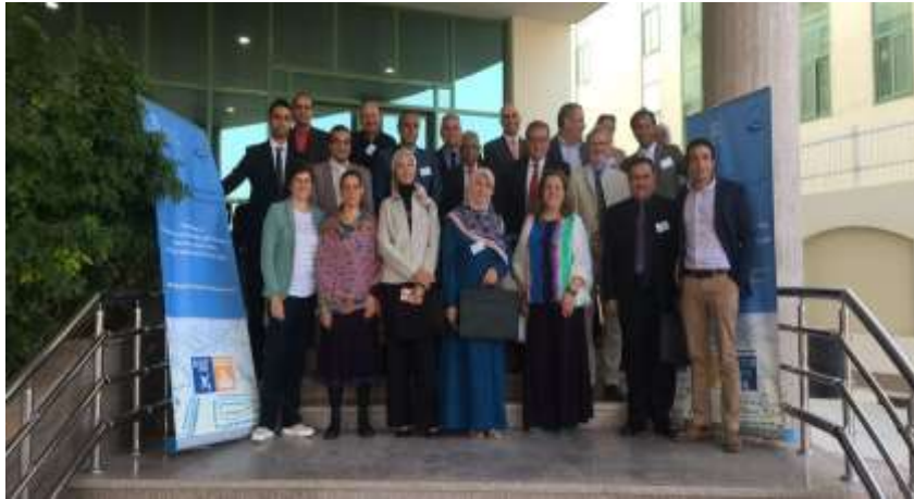
Group photo following the conclusion of the workshop