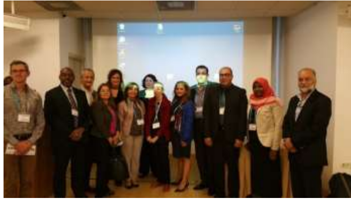
Panelists in the Arab OER Forum session organized during the Second World OER Congress

An online platform hosted by ALECSO has served as a repository for the community's outputs, while a Whatsapp group and mailing list serve as the primary means for communication. The Forum currently has projects underway in Egypt, Jordan, Palestine, Sudan and Tunisia.