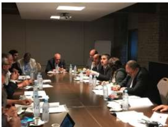
Preparatory meeting of representatives from the Arab countries discussing the SOI framework @UNESCO/E. Sattout.

The importance of SOI in the Arab region and the need to maintain a momentum in the application of ecosystem-based approaches overseeing environmental, economic and social aspects as the driving forces to keep the pace of operationalizing the SOI was highlighted. UCO expressed its support to the initiative on sustainable oases and referred to the UNESCO Man and Biosphere Programme and Geoparks Programme as resourceful learning grounds for the initiative. Thus, UNESCO committed to provide all the support needed in close coordination with UNESCO Office in Rabat.