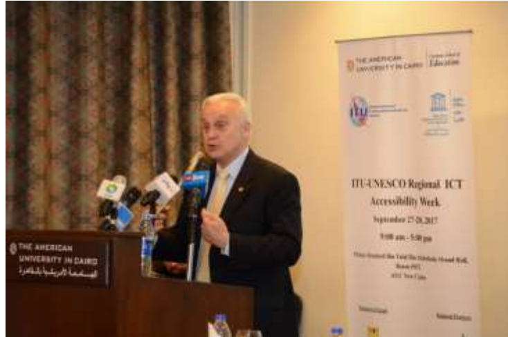
President of the American University in Cairo during opening session of the High-Level Symposium

ITU-UNESCO High-level Symposium, Overcoming Divides and Achieving the SDGs -Supporting the inclusion of people with disabilities and vulnerable group: This event attracted the participation of three Ministers of Government who in their keynote addresses explored impacts in the education, research and ICT Sectors. An expert panel of stakeholders involved in supporting the implementation of the SDGs in Egypt examined ongoing initiatives aimed at overcoming barriers to information and social inclusion. The event served to establish the outlines of a road map for follow-up actions.