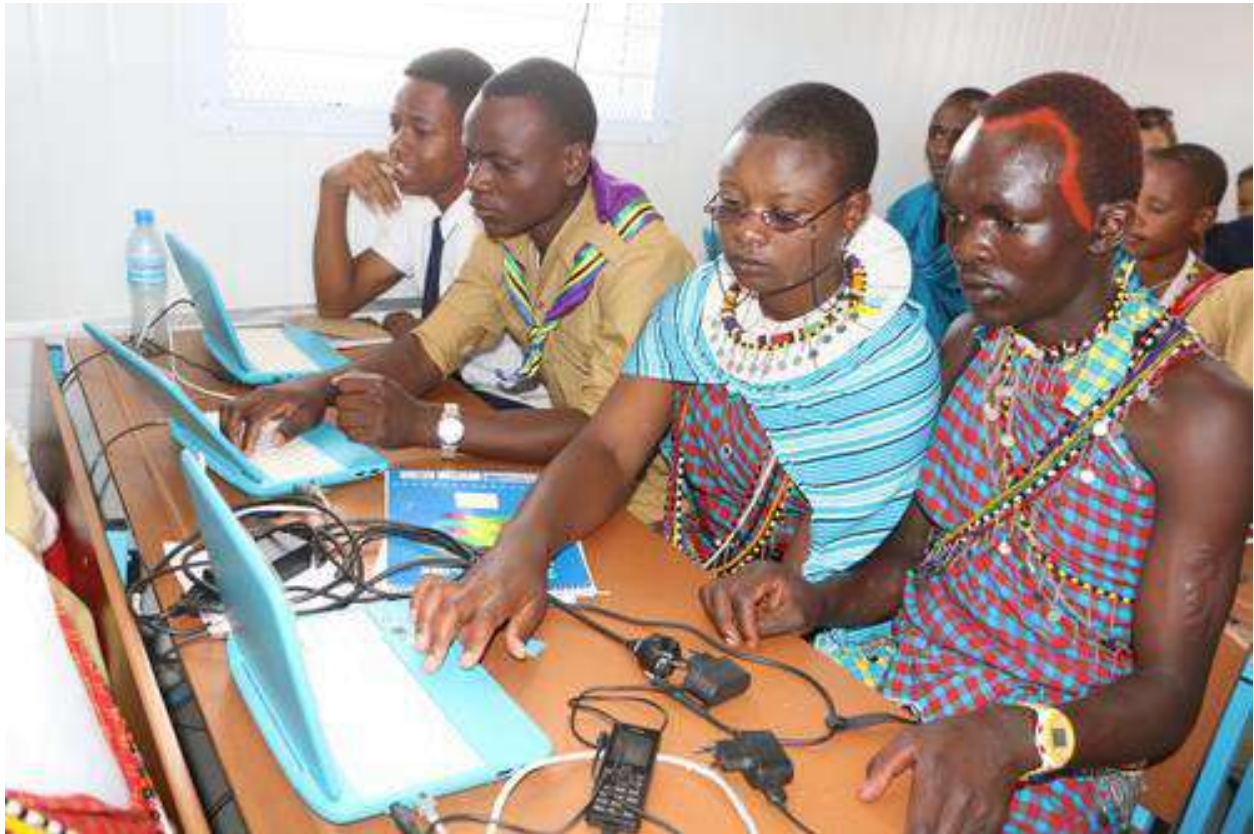
Training in the Internet School @UNESCO Dar es Salaam, Tanzania

International Literacy Day , celebrated each 8 September, was celebrated in Rwanda, South Sudan, as among others, highlighting the success of literacy, skills and ICT projects implemented in Tanzania. The theme of the day was “Literacy in a digital world”.