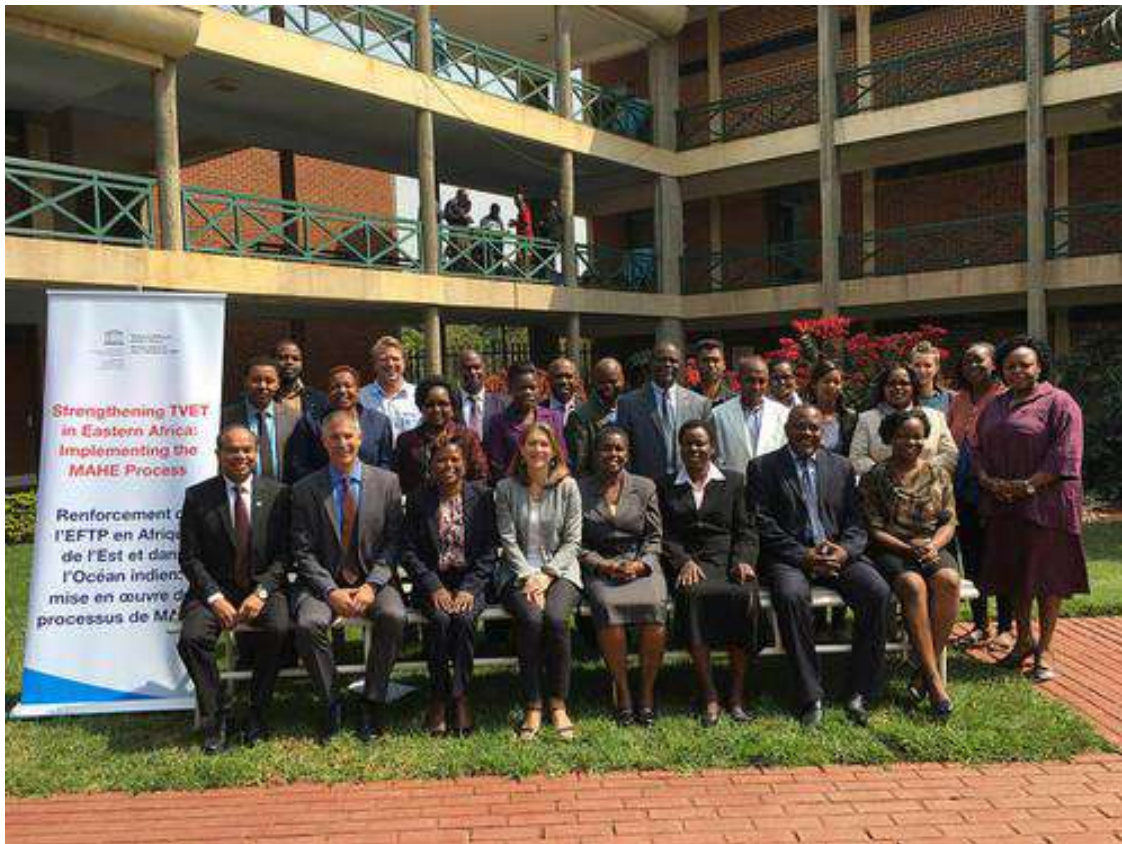
Participants of the Regional Workshop @UNESCO

In July 2017, as a follow-up to the Mahe Process, UNESCO conducted a regional research on quality assurance of TVET qualifications in 13 Eastern African countries. The process is an initiative of the following six key recommendations made in the Regional Forum, which was organized in Mahe of Seychelles in 2016. The initiative aims at strengthening TVET in Eastern Africa through the following recommendations: (i) developing quality assurance, (ii) enhancing the quality of TVET teacher training, (iii) strengthening the teaching of entrepreneurship, (iv) promoting transition to self-employment, (v) developing and strengthening partnerships with the private sector and (vi) developing and strengthening funding mechanisms for youth enterprise start-ups. The methodological workshop consisted in preparing the national experts from ministries of education for the methodologies in collecting and analyzing data in view of the development of national reports. UNESCO will use the reports to produce regional guidelines that will assist countries in undertaking better quality assurance of TVET qualifications. A network of experts on quality assurance of qualifications in the sub-region has been established for future technical cooperation and peer learning, including regarding the production of national reports. National reports were finalized in Djibouti, Seychelles, Mauritius and Kenya.