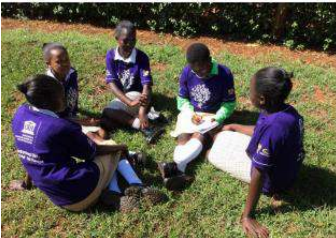
Girls STEM Camp at Kaaga Girls' High School