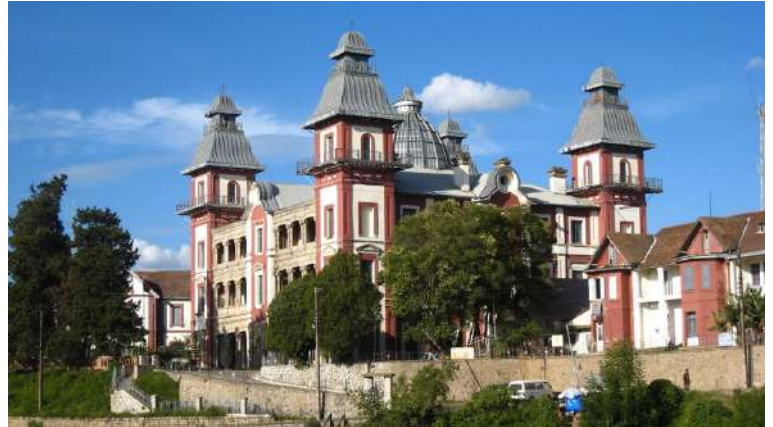
In the photo on the right: Palais d'Andafiavaratra