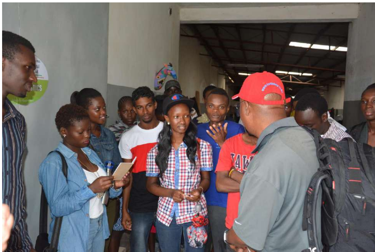
Students from Pwani University visited the private company Regeneration Africa, in Malinda, to learn more about waste management and environment, during World Environment Day 2017

On the occasion of World Environment Day and World Oceans Day 2017, UNESCO Regional Office for Eastern Africa and its partners, which included UN Environment and UN Information Center (UNIC), partnered with Ocean-Sole, Local Ocean Trust, Regeneration Africa and several other community organizations in, and around Malindi and Watamu Beach, in the coastal region of Kenya, creating an alliance, #CleanSeas, to sensitize those communities about the importance of behavior change as far as environmental protection and conservation were concerned.