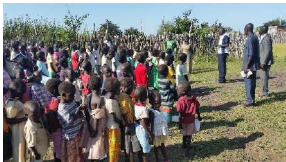
Pupils in one of 93 CGS schools are attending a morning line-up flag raising ceremony in Imatong State of South Sudan (November 2015)

630 youth in Juba town were trained in ten skills areas and graduated successfully in November 2017. The AES Directorate has also been supported with IT and office equipment. The project has also contributed to the renovation of a community-learning centre in Juba town operated by the Whitaker Peace and Development Initiative (WPDI).