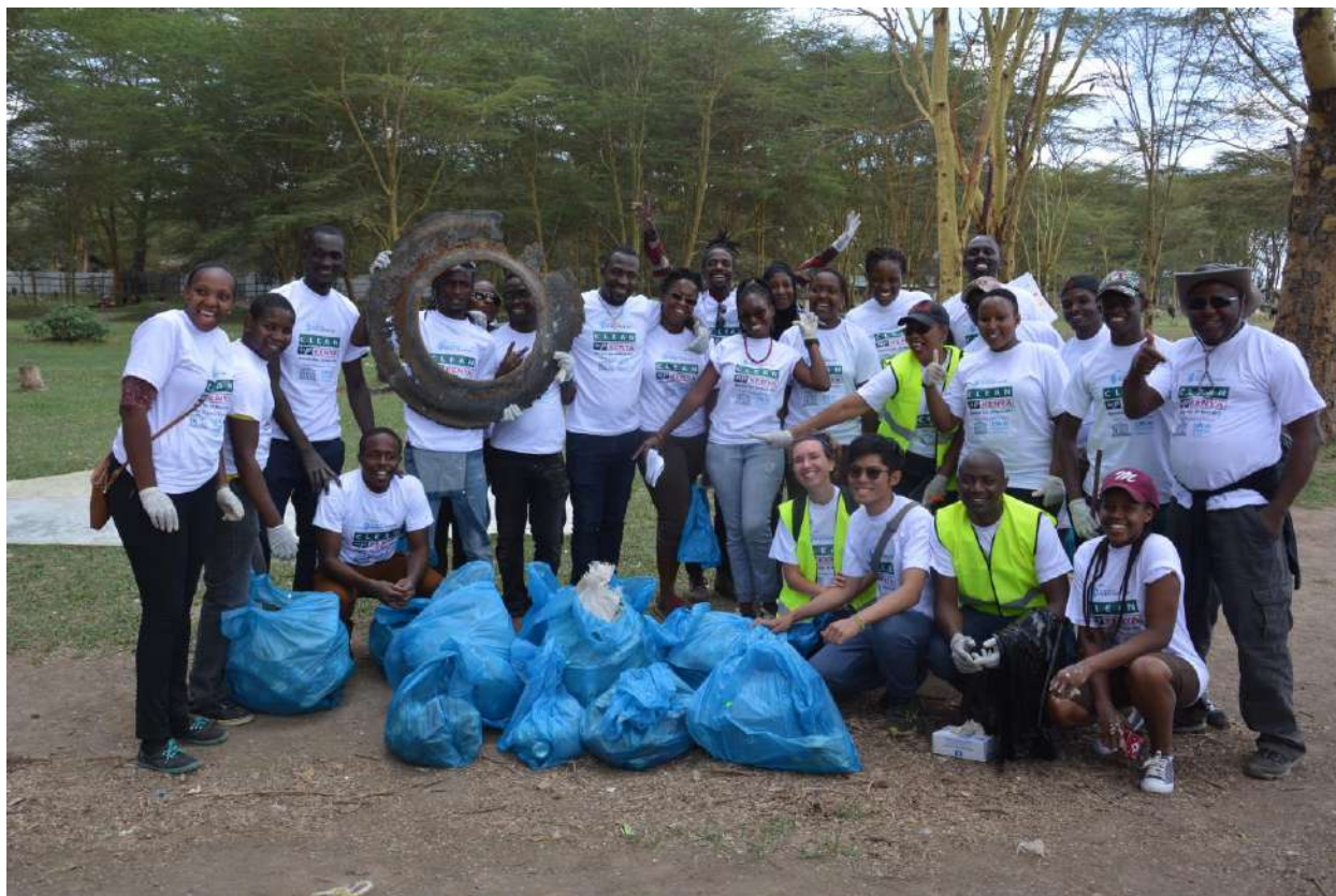
Cleanup at Naivasha, 22 March 2017 Kenya

The cleanup at Lake Naivasha took place at five official sites, namely; Kenyatta Avenue, Nakuru-Nairobi Road, Karagita, Karagita public beach and Kamere. Over 3 tons of litter ranging from plastics, glasses, clothes, rubber and papers, were picked at the sites, highlighting the growing problem of marine litter. The litter was sorted on site, with about 70% taken to Karagita Community Cooker where the litter will be used as fuel.