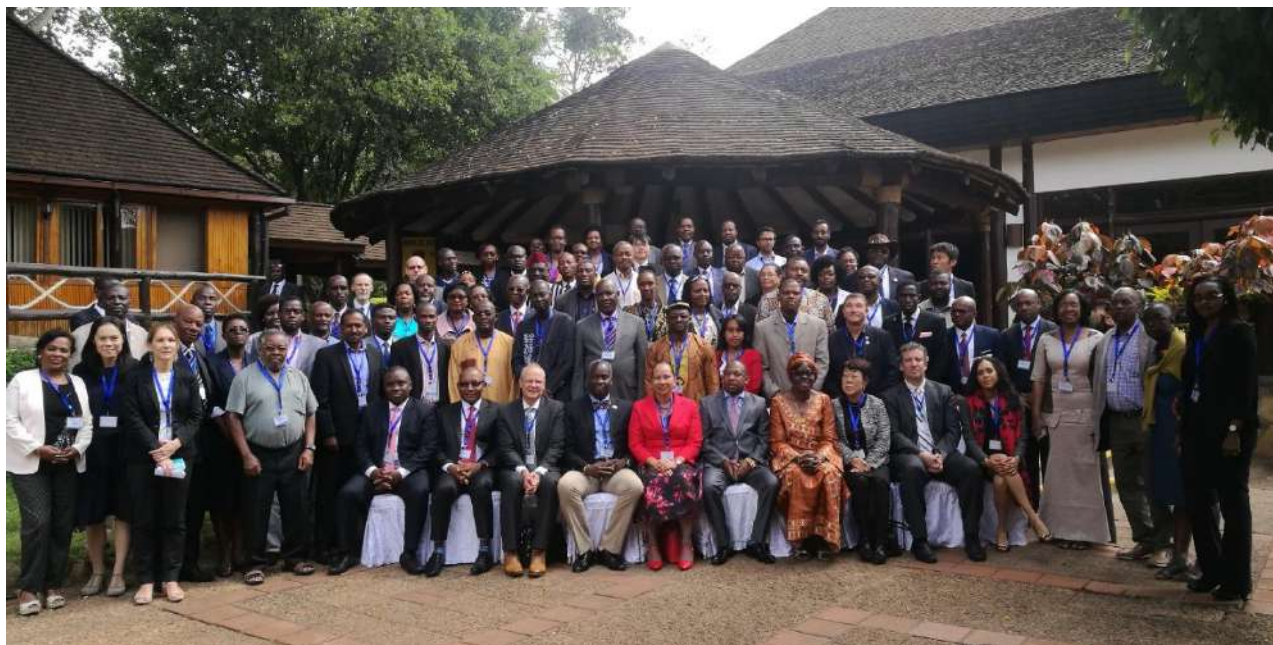
Participants of the Sub-Saharan Africa Conference on ESD: Local sustainable solutions for cities and communities, which was held at Safari Park Hotel in Nairobi, Kenya in December 2017

Furthermore, bringing together more than 100 participants, the Sub-Saharan Africa Conference on ESD: Local sustainable solutions for cities and communities took place in Nairobi in December 2017, highlighting the importance of the interlinkage between education (Sustainable Development Goal-SDG4) and sustainable cities and communities (SDG11), and long-term and effective partnerships (SDG17). Focusing on the implementation of the ESD Global Action Programme (GAP), this conference was supported by the Government of Japan and organized by UNESCO in coordination with IOM, FAO, UN Environment, UNFPA, UN-Habitat, UNHCR and UN Women. After 2-days extensive sharing of experience and debate, experts agreed on key recommendations for cities and communities to use education for People, Planet, Peace, Prosperity and Partnership (5Ps), which are the core elements of SDGs.