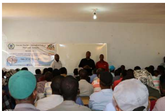
New accessibility ramps developed at a school in Kirehe District to facilitate wheelchair mobility following training initiatives on inclusive education in Rwanda (September 2017)

Media and Information Literacy (MIL) tool was also adapted to the Rwandan context to collect data on pre-service teachers' and principals' experience of MIL in the 16 teacher training colleges (TTCs) of UR including their perceptions of the requirement of MIL competencies in their profession; an infrastructure needs assessment was also conducted for the 16 TTCs (as of 2018, the TTCs are officially under the overview of REB). These studies support evidence-based interventions by UNESCO. In supporting learners living with disabilities , the UNESCO Guidelines for the Inclusion of Persons Living with Disabilities on ODeL was integrated into the Digital Talent Policy (DTP) of the Ministry of Information Technology and Communication (MITEC); an implementation strategy was also developed for the National Council for Persons with Disabilities (NCPD). In terms of Knowledge Society support, the contextualized Rwanda Knowledge Society Policies Handbook was learning materials developed by UNESCO and the Ministry of Education of Kenya, with the support of the Government of Azerbaijan, and approved by Kenya Institute of Curriculum Development.