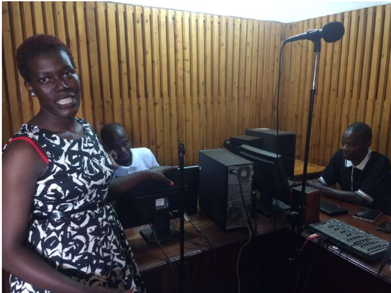
Mama Fm in Kampala broadcasting daily programming with enhanced ICT knowledge to give women a voice in Uganda

programming and diffusion, managing daily contacts, and the use of broadcast software.