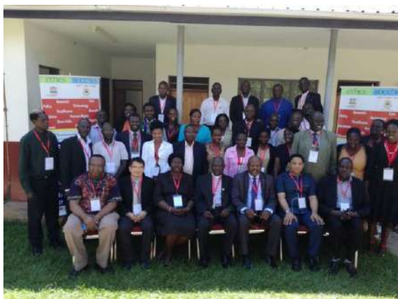
Participants at the ETTT in Uganda