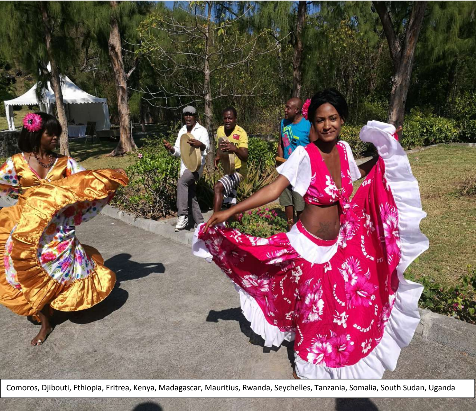
Comoros, Djibouti, Ethiopia, Eritrea, Kenya, Madagascar, Mauritius, Rwanda, Seychelles, Tanzania, Somalia, South Sudan, Uganda