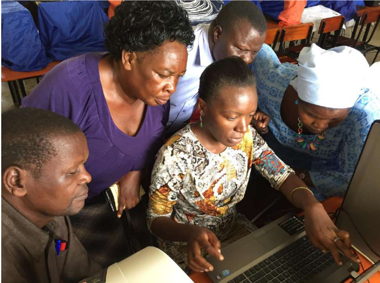
A teacher-training to improve teachers' educators' competency on the use of ICT as a pedagogical tool for quality teaching and learning in the targeted teacher training institutions and beyond, Kampala, Uganda @UNESCO

The UNESCO ICT-CFT provides a framework for capacity building in ICT integration in teaching and learning, which covers six areas: Understanding ICT in Education, Curriculum and assessment, Pedagogy, ICT, Organization and administration, Teacher professional learning. Each area covers three levels: Technology literacy, Knowledge deepening, Knowledge creation.