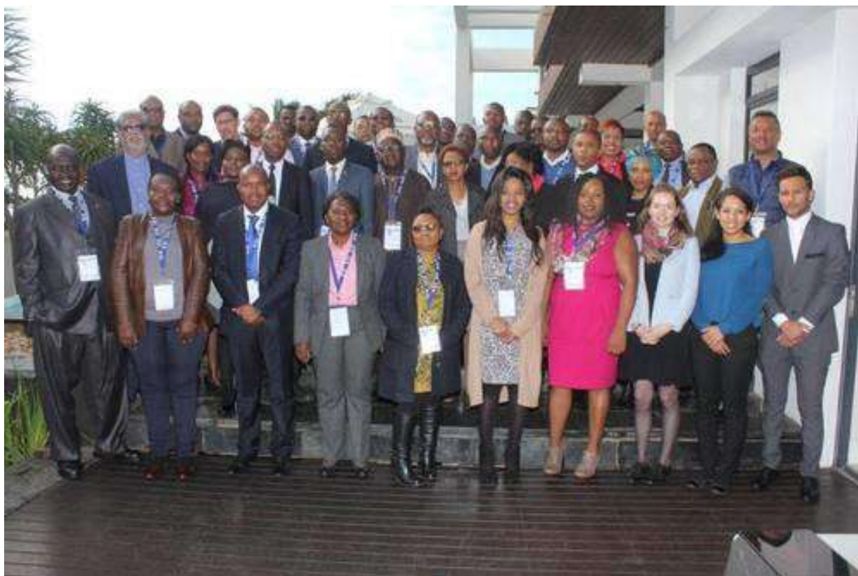
Participants of the sixth African regional committee meeting at Port Elizabeth, South Africa

The main results of the meeting included an agreement to establish a communication information exchange e-platform within African Member States with a focus on knowledge sharing, resource materials dissemination, capacity development and partnerships including, among others, civil society organizations, African economic communities, higher education institutions, UNESCO institutes, sister UN agencies and other partners and a communiqué addressed to Member States and UNESCO.