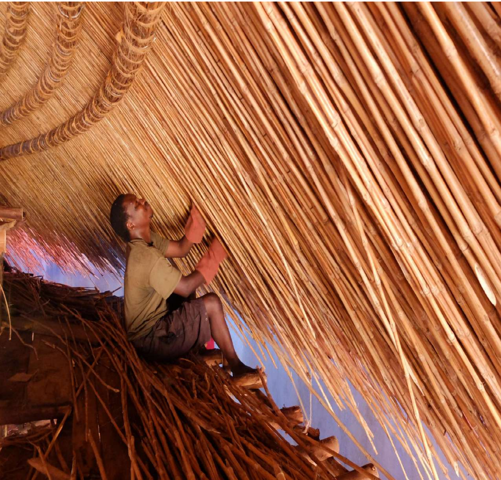
Following the fire that ravaged the Tombs of Buganda Kings at Kasubi World Heritage property in 2010, the site was added to the UNESCO List of World Heritage in Danger. UNESCO received funding from the Japanese Funds-in-Trust to launch a project on rehabilitating the property in view of its removal from the List of World Heritage in Danger (c) Sébastien Moriset, 2016.