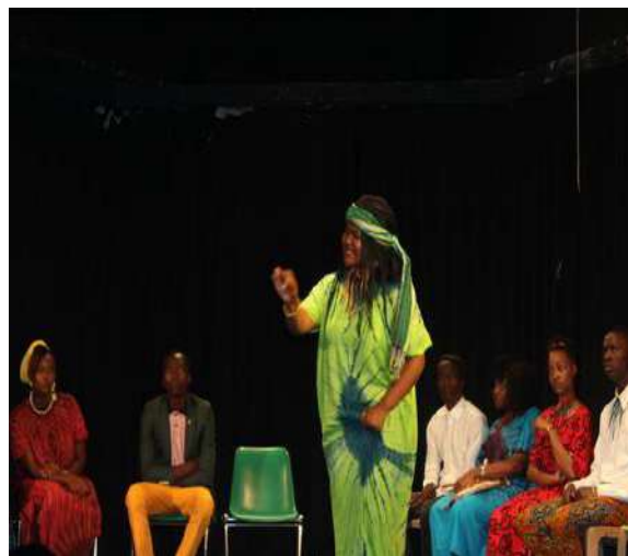
Performance at the National Theater Conference @UNESCO

Key stakeholders in Kenya came together for a two-day National Theatre Conference on 16 and 17 November 2017 at the Alliance Française in Nairobi in order to share views and experiences on harnessing the potential of theatre to contribute to sustainable development in Kenya. The conference brought together government counterparts, practitioners and academia in order to promote dialogue and to build synergies between universities offering creative and theater arts courses and industry players. It aimed to promote skills development for the production of quality theater products that can meet local content demand and attract regional and international markets. A theatre festival, which displayed productions by commercial theatre groups and the Kenyatta University theatre Troupe.