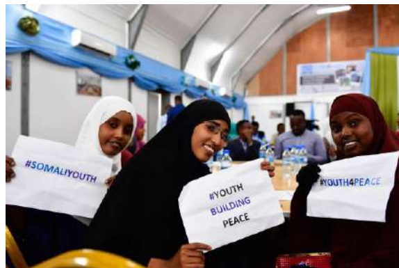
Somali Youth advocating for Peace

the key issues raised was youth illegal/irregular migration ( Tahrib ), participants underscored that while the lack of employment and the search for a better life is a significant factor forcing Somali youth to leave the country, lack of opportunities for young people to engage in decision-making or to voice their needs in their communities also pushes young people to take the risk of the dangerous journey.