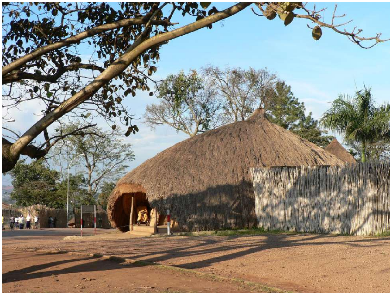
Ndogaobukaba Kasubi 2008

Danger', aims to set up an efficient risk prevention scheme at the site with all the equipment needed and support the cost of qualified supervision for the reconstruction of the destroyed roof. The project has faced some delays but has made progress towards its objectives. In addition to the Japanese-funded project, the King of the Buganda Kingdom is also investing considerable funds to the rehabilitation of the site. The International Council on Monuments and Sites (ICOMOS), an Advisory Body to the World Heritage Committee, is providing technical advice and guidance towards the reconstruction process as well as in the development of a Master Plan for the conservation and management of the site.