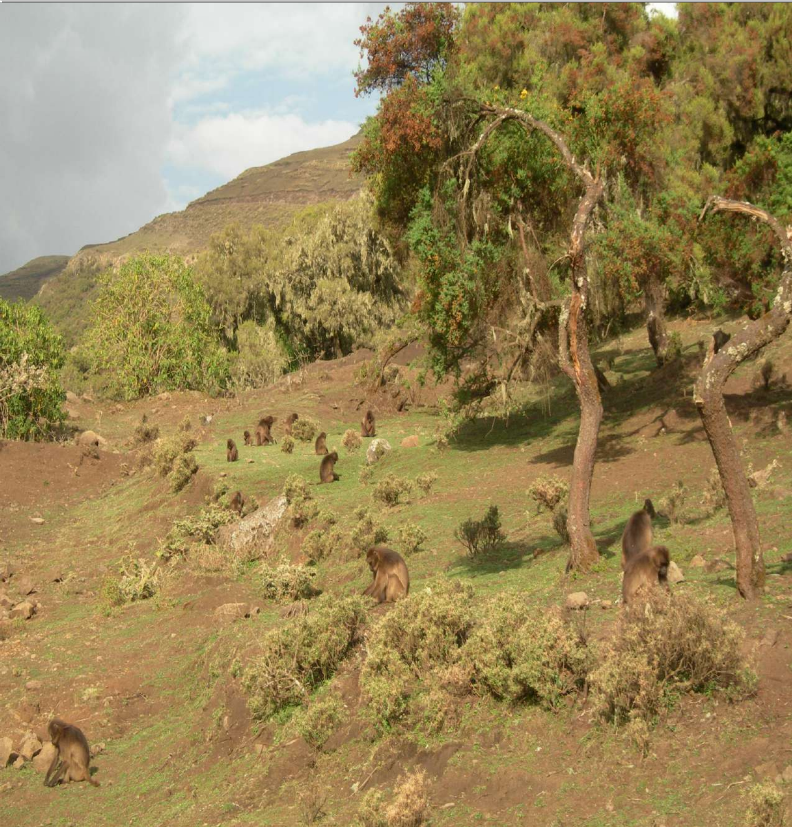
Simien national Park in Ethiopia