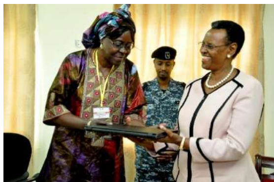
The First lady and Minister of Education – Hon Janet Kataaha Museveni receiving IT equipment for the UNESCO Regional Director through the CFIT project (March 2017)

capacities of ICT personnel from the 23 beneficiary institutions on Sustainable Management of ICT Infrastructure were enhanced.