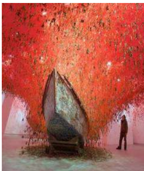
©Chiharu Shiota, The Key in the Hand, Japan Pavilion at the 56th International Art Exhibition - la Biennale di Venezia, 2015, Italy/Japan

Regional Study reveals urgent need for cultural indicators in Eastern Africa region