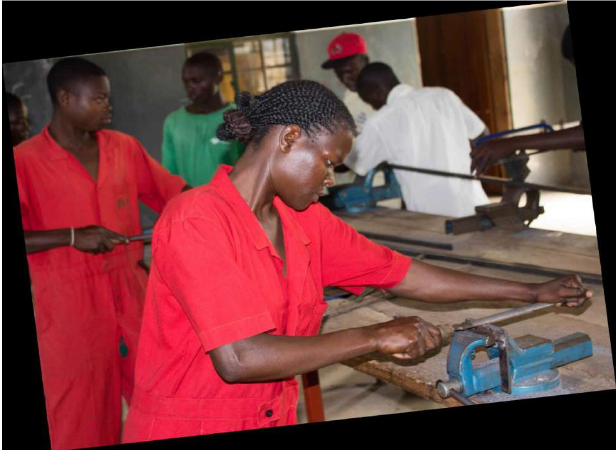
Banner of the BEAR validation workshops carried out in Eastern Africa

The Better Education for Africa's Rise, BEAR II project validation workshops took place in Ethiopia, Kenya, Madagascar, United Republic of Tanzania and Uganda in September 2017. For the whole month, UNESCO and these five beneficiary countries carried out validation workshops to conclude the planning phase of the project at country level. This project supported by the Republic of Korea is focusing on three major components: Quality, Relevance and Perception of Technical and Vocational Education and Training (TVET). It was an opportunity to discuss the proposed interventions for TVET in prioritized sectors among the relevant ministries in each country, and to build synergies between stakeholders to assure the ownership and an inclusive consultation process. The BEAR II project is a five-year joint initiative supported by UNESCO and the Republic of Korea, through which UNESCO provides technical support to strengthen TVET systems and stimulate ownership and job creation in partner countries. The official launch of BEAR II project was organized in Seoul, the Republic of Korea in December 2017 to celebrate the completion of the formulation phase as well as the onset of the inception phase. The launch event provided a platform to hold discussions amongst the Ministry of Education of the Republic of Korea, UNESCO and representatives of beneficiary countries of the project.