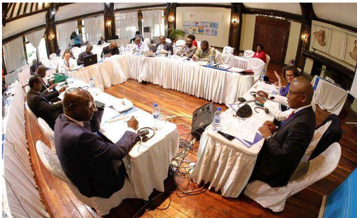
Participants of the session of the African Regional chapter of the International Coalition of Inclusive and Sustainable Cities (ICCAR), 7 December 2017, Nairobi- Kenya @UNESCO