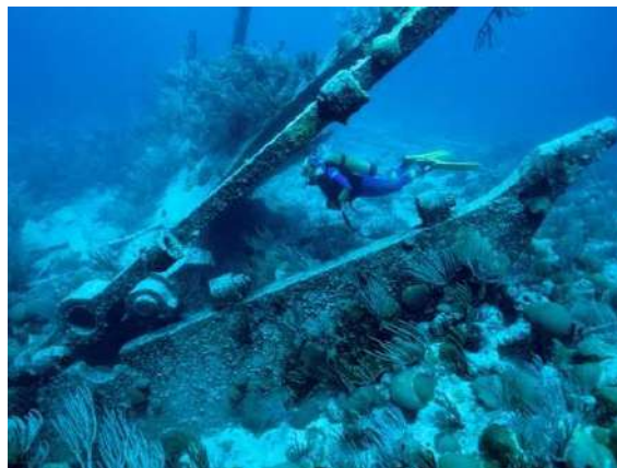
Pollockshields Wreck, Bermudas

Safeguarding underwater cultural heritage for sustainable development in Kenya