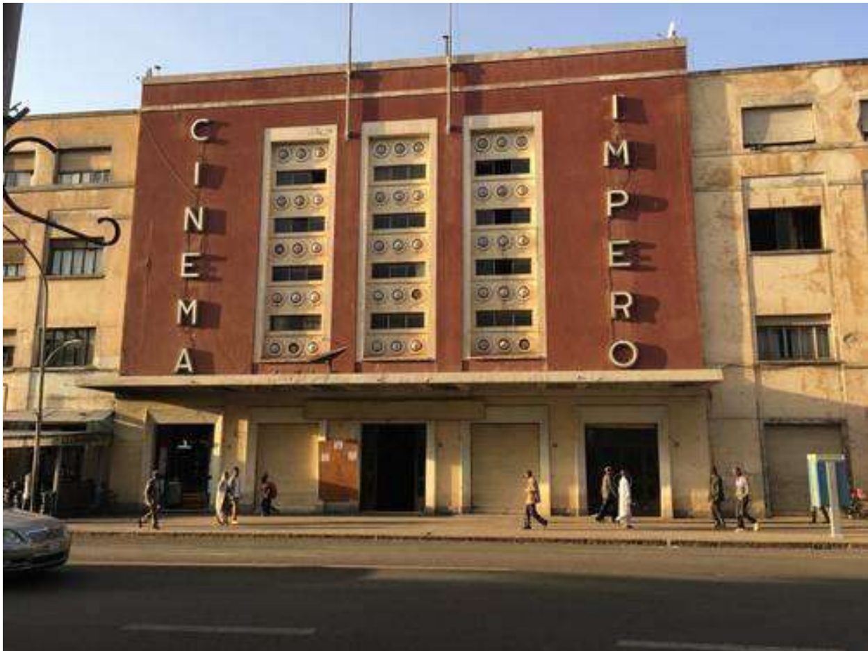
Cinema Impero in Asmara, Eritrea

An East African jewel and Eritrea's capital city, Asmara was inscribed on the UNESCO World Heritage List during the 41st session of the World Heritage Committee in July 2017. Asmara was recognized by the UNESCO World Heritage Committee as "an exceptional example of early modernist urbanism at the beginning of the 20th century and its application in an African context". The city is considered as having "Outstanding Universal Values" that make it rise above national heritage to be safeguarded and promoted as World Heritage. Despite this progress, the number of African sites represented on the World Heritage List remains low-with only 93 out of the 1073 natural and cultural heritage sites on the