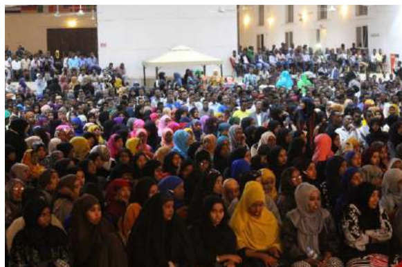
Audience at the Hargeysa International Book Fair

its visions of supporting literacy, education and other development activities going on in Somaliland through activities of Forum for Youth within the Hargeysa International Book Fair, including professional courses on creative writing, creative photography, film script writing and also supporting youth from regions outside of Hargeysa to join, discuss and debate on issues that concerned them.