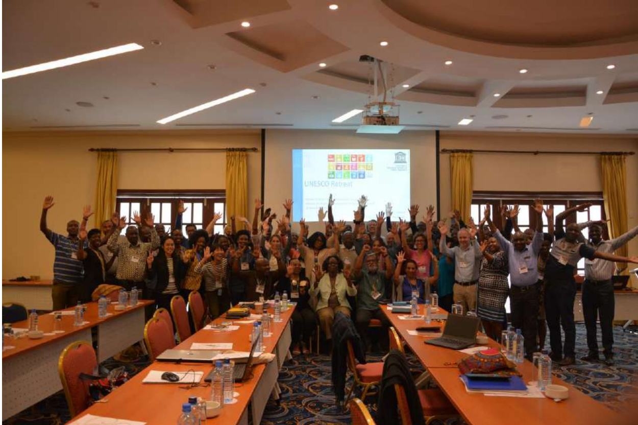
UNESCO staff from East Africa at UNESCO Annual retreat in Nakuru, 22 to 24 November 2017