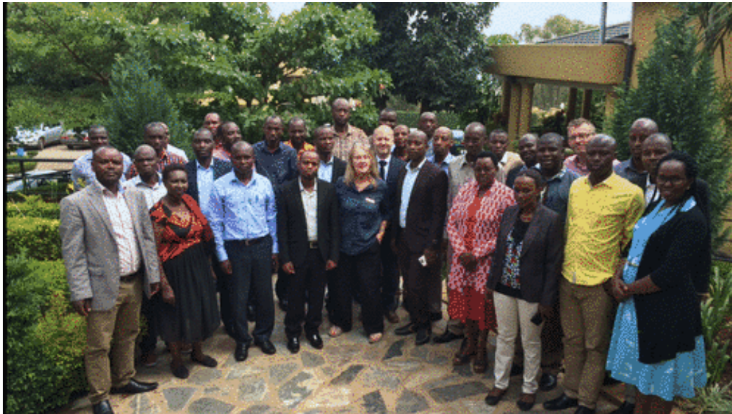
Workshop for Rwanda's 30 District Directors Of Education to train participants on inclusive and innovative teaching methodologies and a roll-out

UNESCO, in collaboration with the Rwanda Education Board (REB), developed a new Teacher Development and Management Framework (TDMF). UNESCO held a series of meetings with senior stakeholders of the Department of Teacher Education Management and Professionalization (TDM), the University of Rwanda, College of Education, Development Partners and civil society to review the proposed framework, gather feedback and prepare for final validation and implementation. Responding to the advent of the new competency-based curriculum, new policy initiatives, teacher statutes, and a perceived misalignment between pre- and in-service teacher training in primary and secondary education, the Rwanda Education Board (REB) with the technical support of UNESCO, is developing a new Teacher Development and Management Framework (TDMF) to enhance the teacher development system, including initial teacher education, continuous professional development and teacher management, to ensure efficiency and maximize educational outputs.