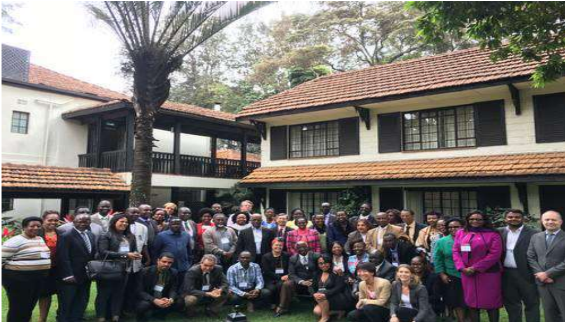
Participants of the ESD and GCED technical workshop: transforming and sustaining our world through learning, which took place at Southern Sun, Mavfair in Nairobi, Kenya in July 2017