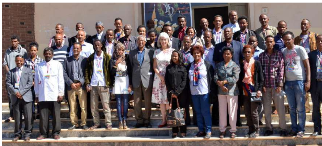
Participants in the April 2017 training on intangible cultural heritage in Eritrea

Moreover, the Africa region is home to 15 of the 54 sites on the List of World Heritage in Danger, due to threats ranging from war and conflict to uncontrolled development and natural disasters. The Africa Region represents almost 28 percent of the List of World Heritage in Danger. East African sites on the List of World Heritage in Danger include Rainforests of the Atsinanana in Madagascar, Tombs of Buganda Kings at Kasubi in Uganda, and Selous Game Reserve in the United Republic of Tanzania. The UNESCO Regional Office for Eastern Africa is now working with the national authorities in Eritrea to mobilize funding for the restoration and rehabilitation of 14 of the most iconic buildings in the capital as well as for the development of a sustainable tourism programme.