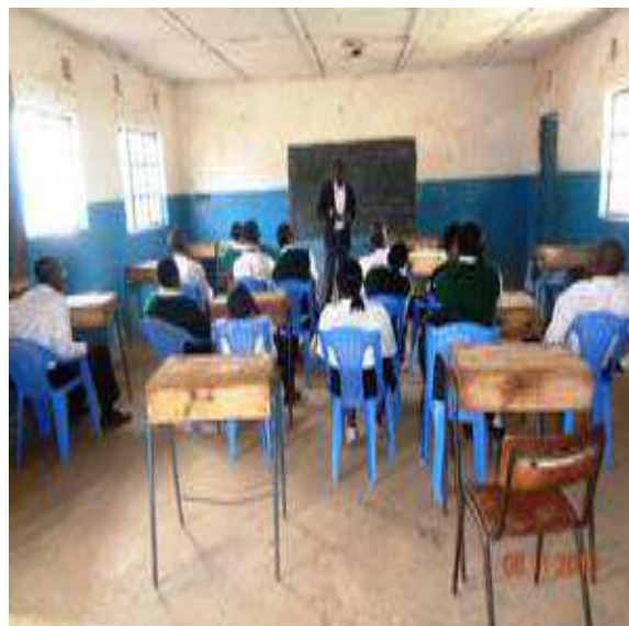
A Learners peer group session at Kibra Academy documented through the digital camera donated to the school (July 2017)

education and training curriculum as well as in the education management information system (EMIS). As result, there was a capacity building for over 100 teachers drawn from Kibera ( the