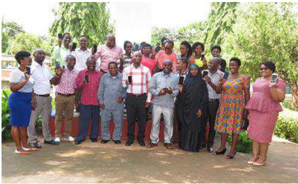
Group Photo with Teachers Colleges Tutors showing their smart phones to demonstrate their readiness for Mobile Learning (November 2017)

Ministry of Education, Science and Technology, whereby 2,500 children from between 9 and 10 years old from 167 remote and under-privileged communities are benefitting from the project. In August 2017, a workshop was conducted to discuss and brainstorm on the methodologies, tools and modalities for the Social and Emotional Impact Study. Seventeen (17) international and national experts in Education, Sociology and Psychology attended the workshop, which kick-started the implementation of the Social Emotional Assessment Study.