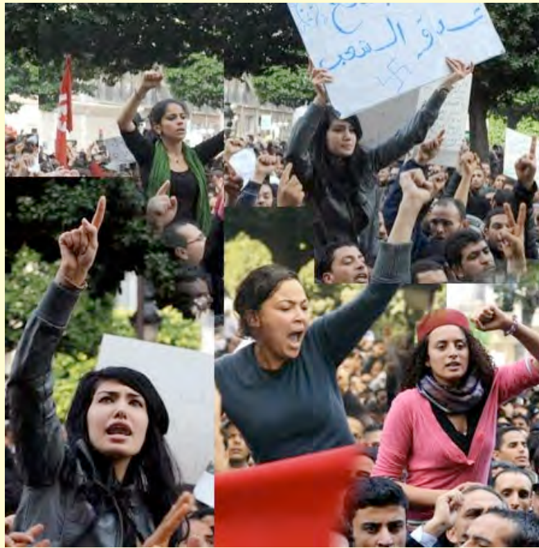
Photo, Jasmin Revolution in Tunisia in 2011