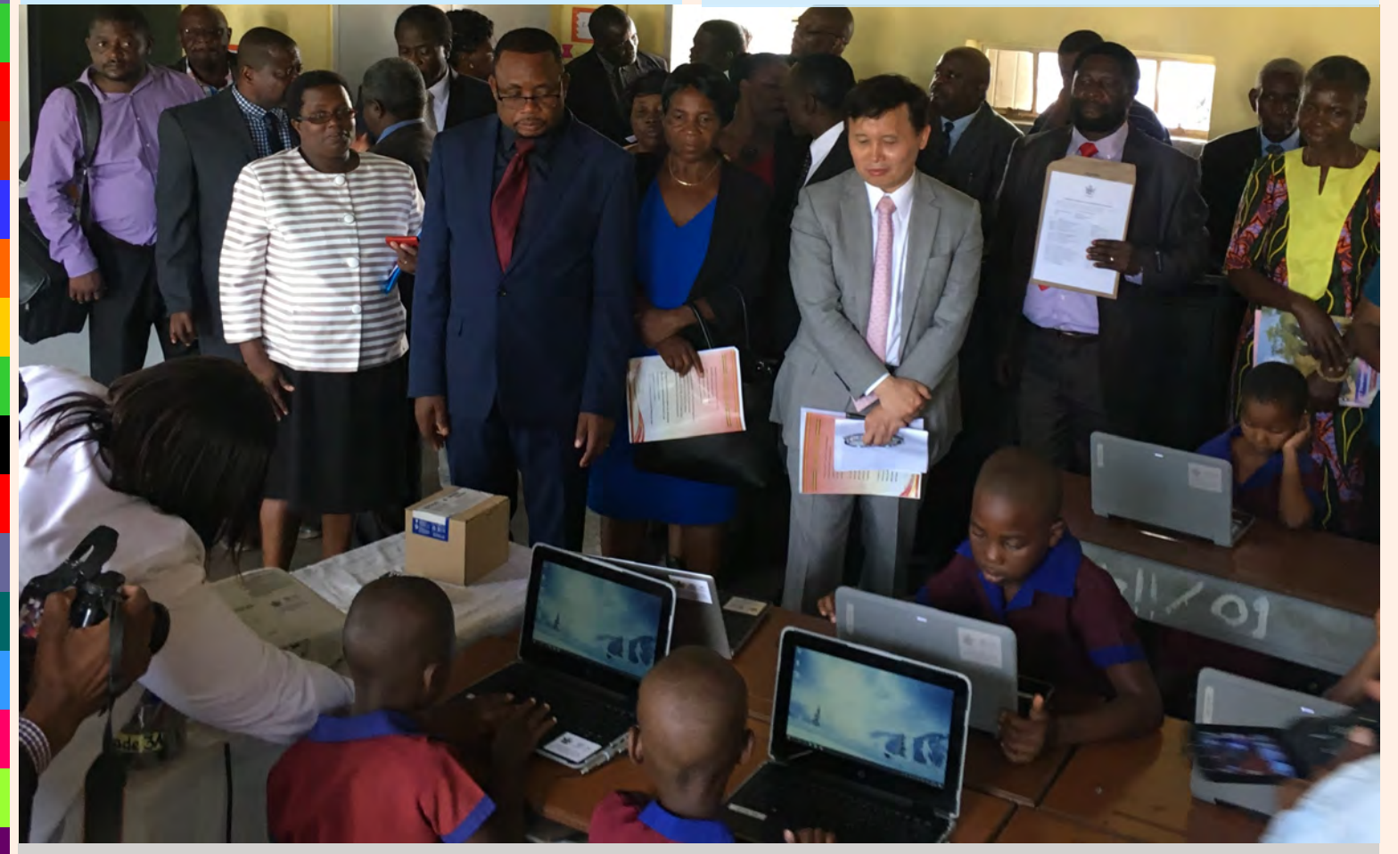
His Excellency Mr. Jaichel (gray suit) and Minister Mavima (navy blue suit) observe school children using ICTs

The Ambassador of the Republic of Korea to Zimbabwe, His Excellency Cho Jaichel said Korea was committed to assisting Zimbabwe to come up with its own ICT embedded education policy. He added that the project will go a long way in creating a better educational environment in the schools. Read more <u>here</u>.