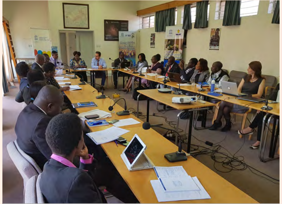
Researchers, policy-makers and UNESCO staff engage in discussion about the Management of Social Transformation programme at UNESCO Regional Office for Southern Africa

UNESCO Regional Office for Southern Africa (ROSA) in partnership with the Zimbabwe National Commission for UNESCO hosted a one day meeting on 22<sup>nd</sup> February 2018 in Harare to raise awareness about the <u>Management of Social Transformation</u> (MOST) programme.