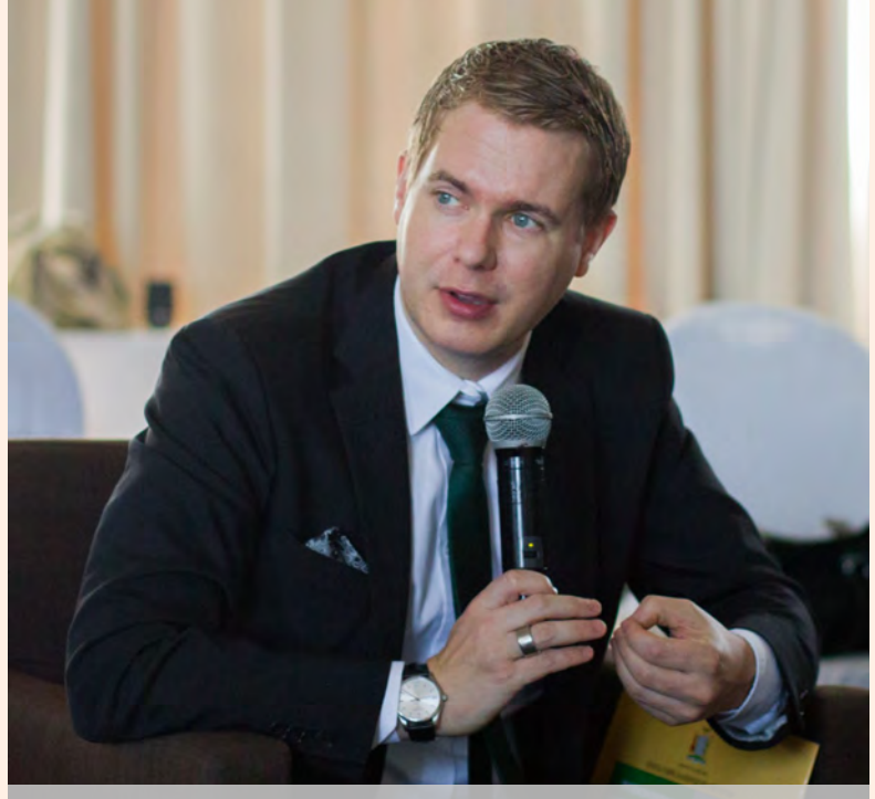
Honourable Gustav Fridolin

Funded by the governments of Sweden and Ireland, the O3 Programme, aims to reach 10.7 million learners, in 45 000 primary and secondary schools, 30 000 preservice teachers, and 186 000 in-service teachers between 2018 and 2020. An additional 30 million people (parents, guardians, religious leaders, and young people out of school) will also be reached through community engagement activities and 10 million young people through social and new media platforms. Read more here