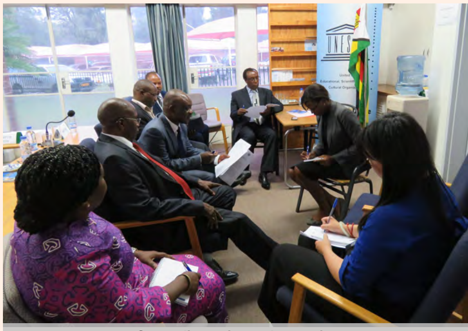
Group discussion at the meeting

"The world's biggest economies such as USA, Japan, Germany and the United Kingdom got where they are today because of their reliance on a