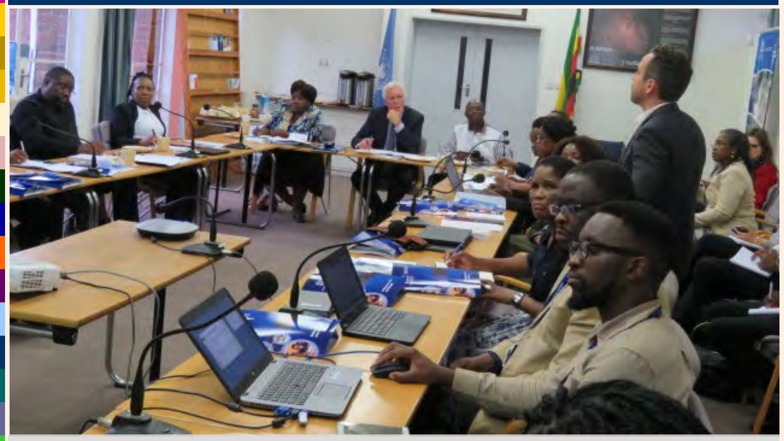
ROSA staff and Secretaries General following the presentations at the meeting