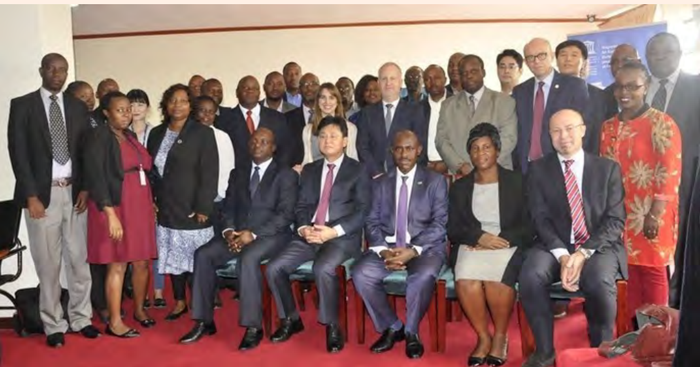
Delegates at the regional meeting

Following the regional meeting that took place in Harare (Zimbabwe) in May 2016, this event was the first occasion for the three teams to come together and learn from progress attained in the respective beneficiary countries. It also represented a chance to better prepare for the final implementation phase of the project, due to end in June 2019, with a view of enhancing collaboration among countries, engaging in joint activities and exchanging resources and learning experiences.