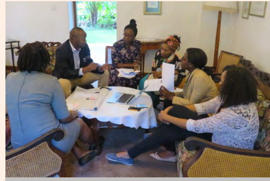
Group discussion at the workshop

The joint project acknowledges that while persons with disabilities are a key constituency in Zimbabwe (an estimated 7 percent of the population), they remain invisible in all levels of society and face numerous challenges in accessing healthcare, jobs, education, and justice. It thus seeks to strengthen the capacity of women and girls with disabilities to shape public discourse.