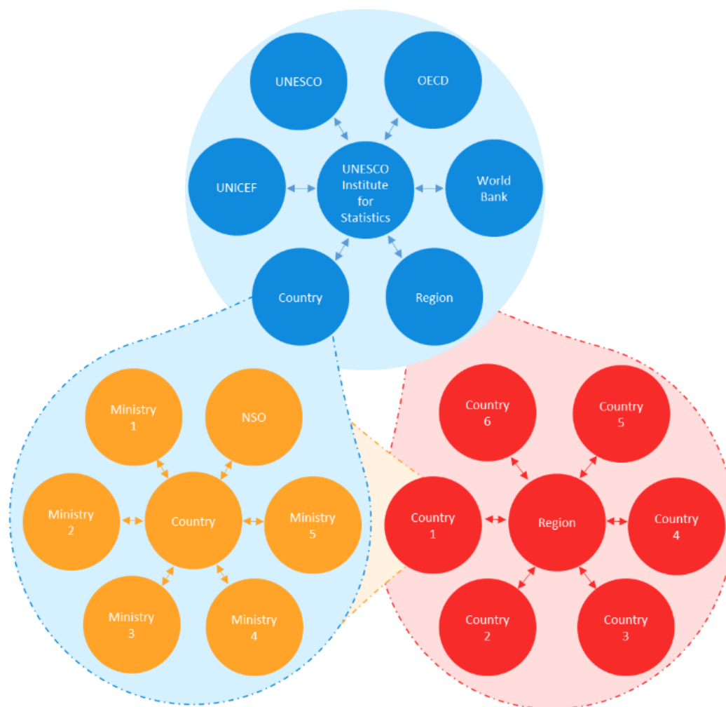
Figure 1. Flow between countries and regional and global actors

The website itself is, in some sense, the least interesting aspect. It will include datasets, key indicators, metadata, links and documents.