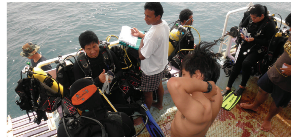
BELOW: Dive log keeping; an important task for the non-divers.