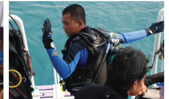
LEFT: Project briefing.