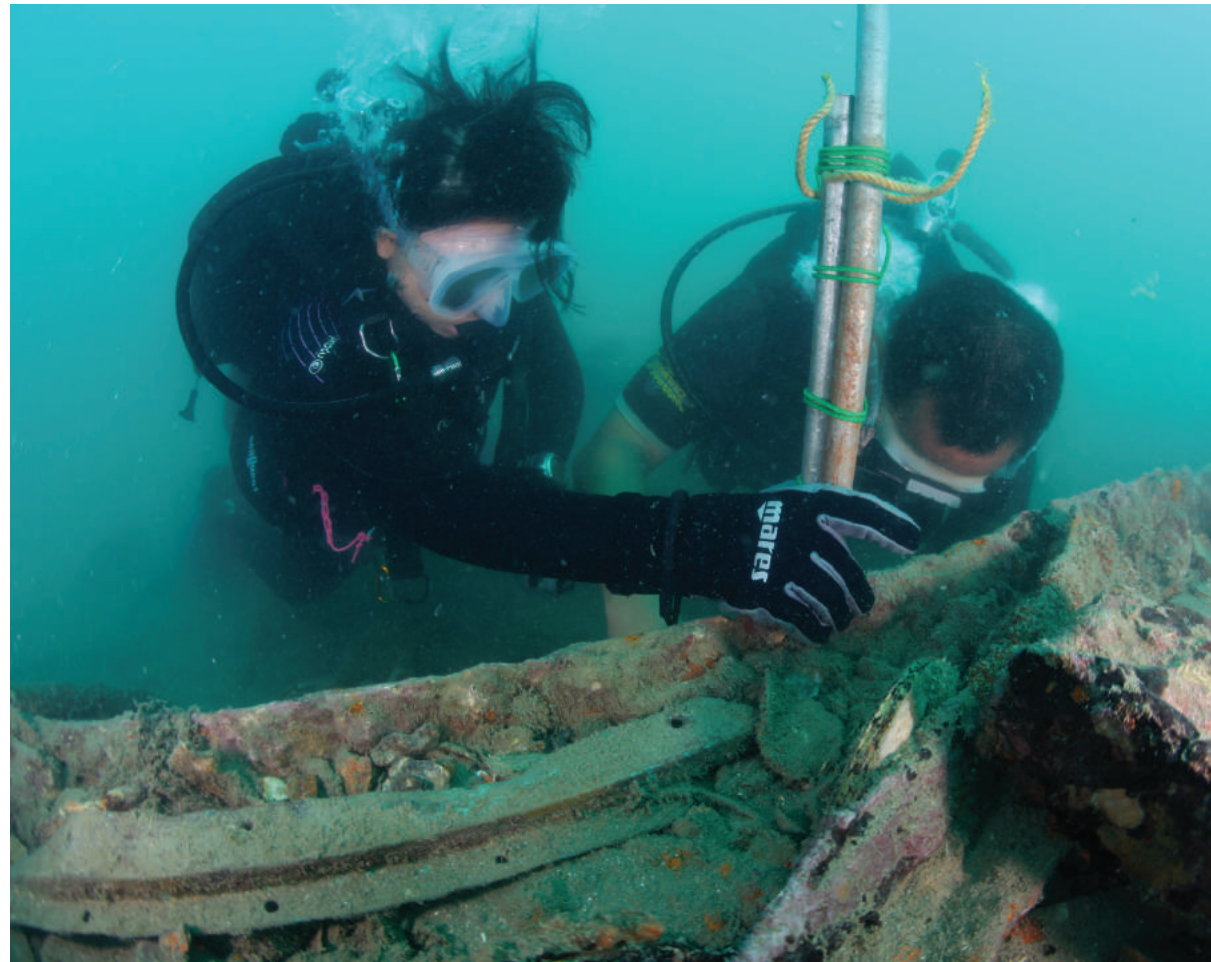
TOP LEFT: Diver using a drawing grid to record the site source.