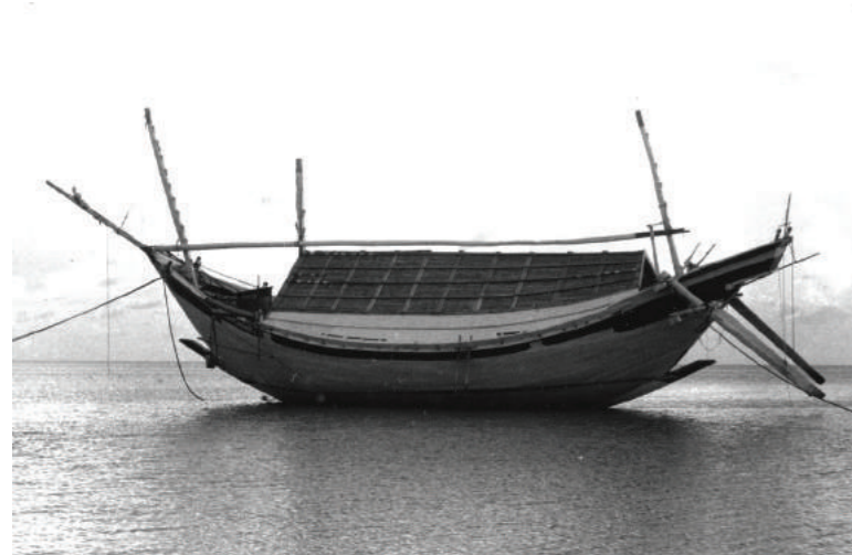
A large janggolan with the sailing rig removed, laid up for the monsoon. In Madura, janggolans are dedicated to freight work, usually carrying a salt cargo.