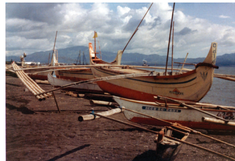
A double outrigger banca on the beach. Batangas Bay.

Boats with two outriggers have been used in western Melanesia and in Indonesia from at least the eighth to the ninth century, as witnessed on the Borobudur relief in Java (Manguin, 1980; Jahan, 2006). Yet, from eastern Melanesia eastwards, there is no evidence for such crafts. Instead, in all European accounts for the region, boats with only one outrigger are recorded.