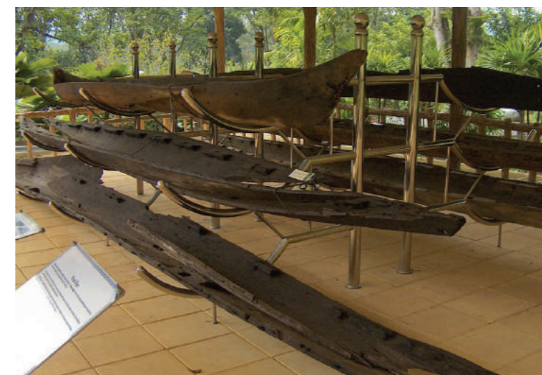
Lash-lug boats displayed at the Bujang Valley Archaeological Museum.

The planks of the Khuan Luk Pat boat of Kolam Pinsi were found in Palembang and dated to the fifth to seventh century. The planks clearly appeared to have belonged to a sturdy hull that had been stitched together and fastened to the frames by way of lashed-lugs (Manguin, 1993, pp. 261).