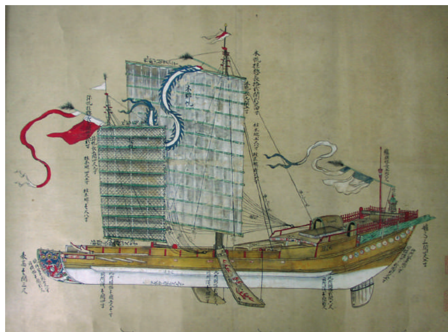
A nanjing or sand ship has a flat bottom that allows it to theoretically be beached or to travel in river channels. On this Chinese merchant ship depicted on the eighteenth century picture scroll 'Tosen no Zu' (Matsura Historical Museum), it is possible to clearly see the flat transom and the leeboards. This type of ship belongs to a Northern type of Chinese boat building tradition.

The earliest material evidence of Chinese river boats that date back earlier than the tenth century, consists of three planked river boats (Peng, 1988, pp. 32) and of the remains of the Tang Dynasty Rugao river boat (Green, 1986). Additional information provided by the Qing Ming scroll (1085-1145 AD) gives a more accurate idea of what the fluvial junks looked like. From here, it is possible to identify the basic characteristics of the Chinese fluvial junks that were retained until later periods.