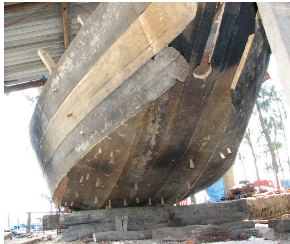
Boat building in Southern Viet Nam, demonstrating the South-East Asian tradition of using wooden pegs.

Shipwreck remains show vessels from this period are a blend of designs; the V-shaped hull, the keel and a thin pointed bow of the South-East Asian tradition, with the partitioning of the hull in compartments following the Chinese tradition. Yet, these 'bulkheads' are not watertight and frames share the structural strength. Additionally, shipwreck remains show the use of iron nails similar to those used by the Chinese, alongside wooden dowels. In some instances, the ships included either Chinese steering systems with an axial rudder or South-East Asian with a lateral rudder (MgGrail, 2001, pp. 299-301, Flecker, 2007).