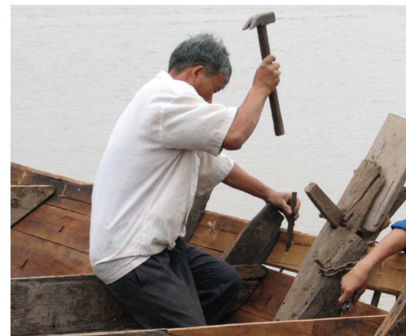
Boat building in Northern Viet Nam, demonstrating the Chinese tradition of using iron nails.

of material evidence, there is little remaining about the boats that existed during that time period (Kimura 2006; Sasaki, 2006).