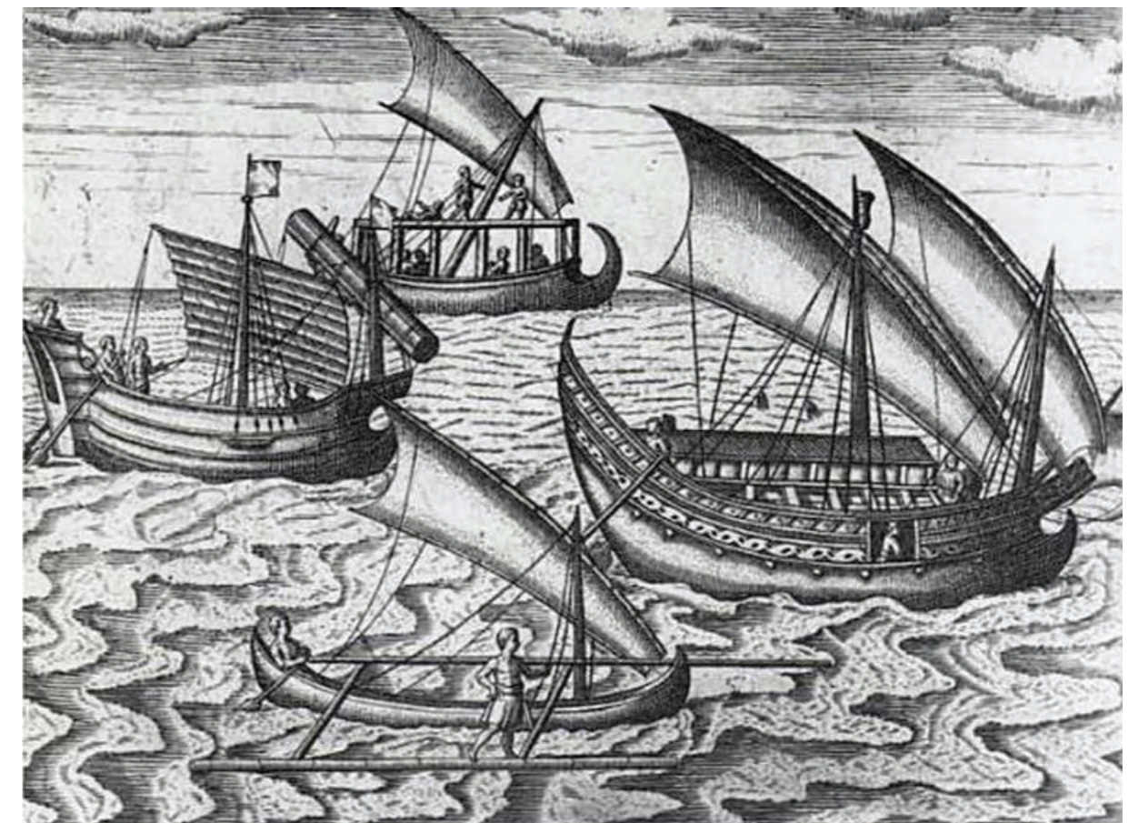
A late sixteenth century drawing of double outriggers and a Javanese jong in the Banda Sea. © De Bry 1629, plate 28

As these boats are classic examples of South-East Asian tradition, from the sixteenth century the words junco, jonque and junk are terms commonly used to describe all kinds of large ships encountered in the region (McGrail, 2001, pp. 308), as well as Chinese ships.