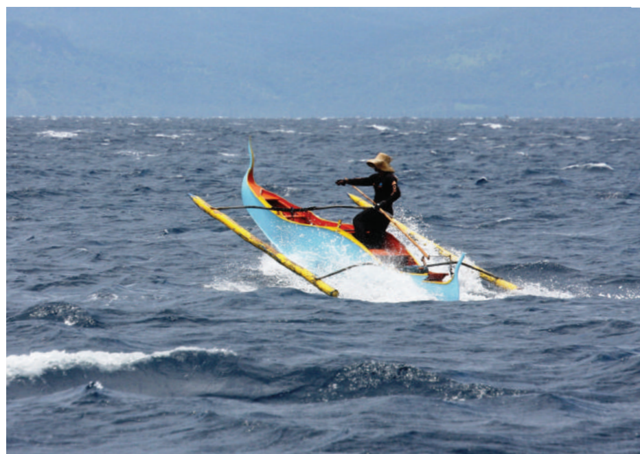
A modern outrigger boat in Mindanao, Sarangani Bay, Philippines.

Outrigger boats and paired boats are the most advanced crafts, clearly capable of ocean voyages when Europeans encountered them. Both types may have been used for ocean voyages during the settlement of Oceania, however, for reasons of speed, manoeuvrability and capacity, it may have been that outrigger boats were preferred for exploratory voyages and paired boats for colonization.