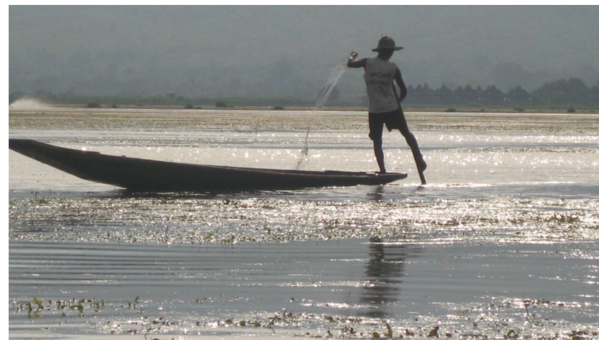
There are still so many maritime traditions that have yet to be documented, such as the fascinating single leg rowers of Inle Lake, Myanmar.