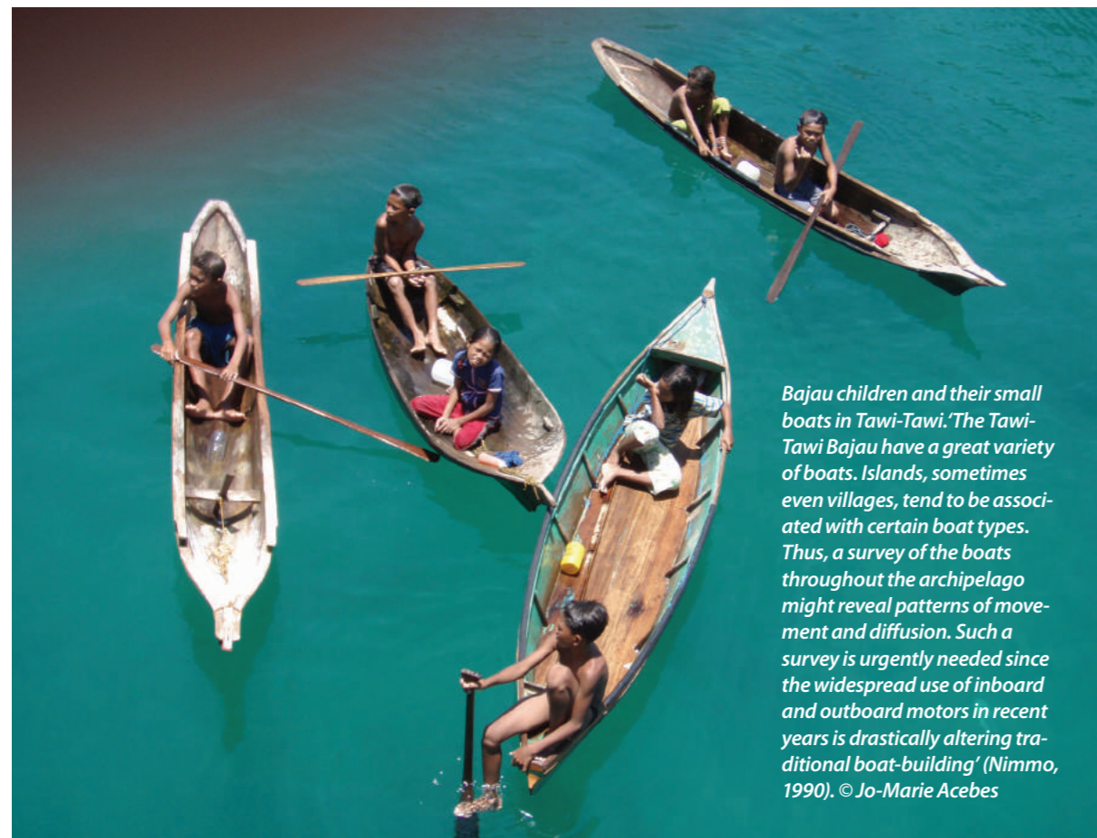
Bajau children and their small boats in Tawi-Tawi. The Tawi-Tawi Bajau have a great variety of boats. Islands, sometimes even villages, tend to be associated with certain boat types. Thus, a survey of the boats throughout the archipelago might reveal patterns of movement and diffusion. Such a survey is urgently needed since the widespread use of inboard and outboard motors in recent years is drastically altering traditional boat-building' (Nimmo, 1990).

Water is not our natural environment; humans are instinctively uncomfortable with it. It is unstable, presenting structural problems. When water is combined with winds and tides, structural problems increase dramatically. Worse yet, when vessels sank in this unfriendly element there was no haven for their occupants; they could not walk away from a disabled ship as they could from a broken wagon, nor could they come back later and retrieve its payload. It is no wonder that shipbuilders were so cautious with new designs and that global travel evolved so slowly.