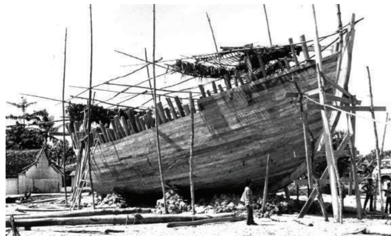
This lete-lete under construction in Gayam, Sapudi is a good example of a perahus. This contemporary design has been influenced by Dutch boat building in the Madura region. © Kurt Stenross