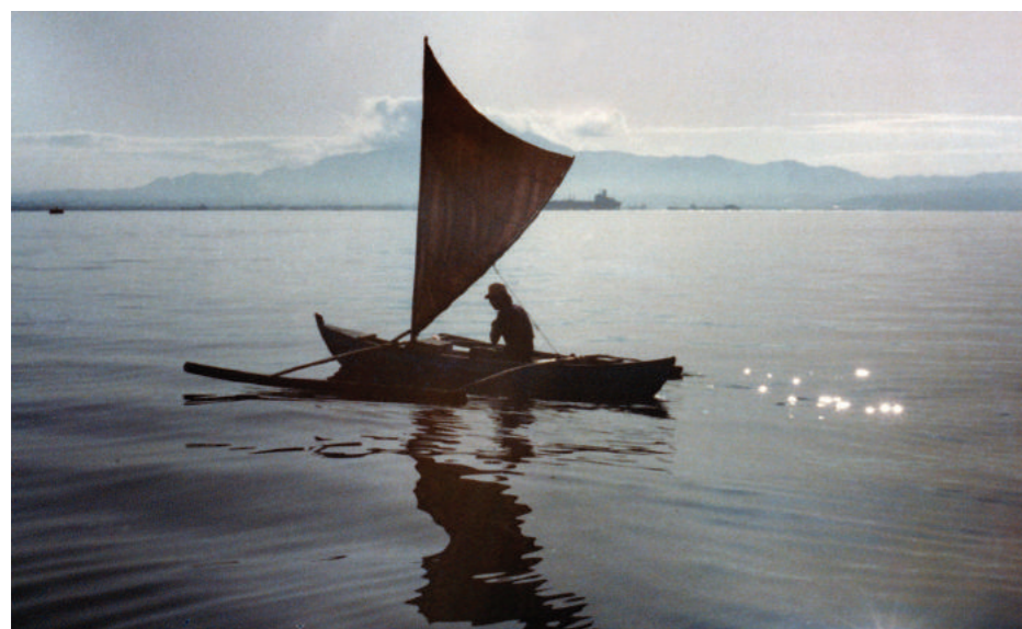
Modern example of an outrigger boat, known as a banca in the Philippines. Batangas Bay, Saint Bernardino Strait.

Although the evidence for watercraft from c. 1500 BC to 1300 AD is negligible (McGrail, 2001, pp. 338), linguistics suggests that Proto-Polynesians began their oceanic voyaging abroad outrigger boats with sails. Otherwise, it is on European accounts, starting with the travel logs of Magellan and Del Cano's circumnavigation voyage of 1520 that an image can be formed, completed with ethnographic data relative to much later periods. The late eighteenth century and the nineteenth century are golden ages for pre-ethnographic studies done by captains, seamen and intellectuals who accurately recorded the boats they encountered on their travels. The work of Admiral Pâris (1843), the father of nautical ethnography, is an excellent example of the interesting descriptions compiled on traditional crafts of the region.