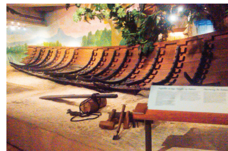
One of the Butuan boats, Philippines National Museum.