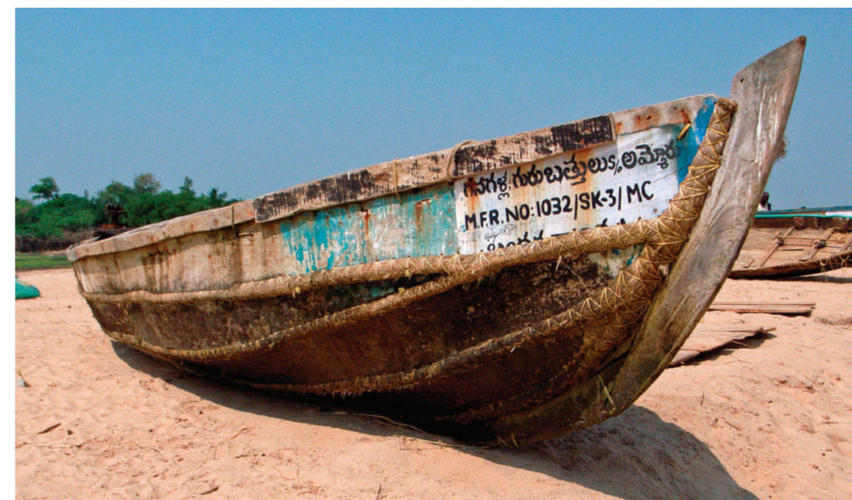
Indian Ocean tradition: a sewn boat of India, Orissa.

Boats with planking fastened by bamboo fibre cords were recorded from the seventeenth to the twentieth century in Malaysia, Borneo, Sarawak, Moluccas and the Philippines. This traditional technique can still be seen today in the form of small river crafts used in the region surrounding the ancient capital city of Hue in Central Viet Nam.