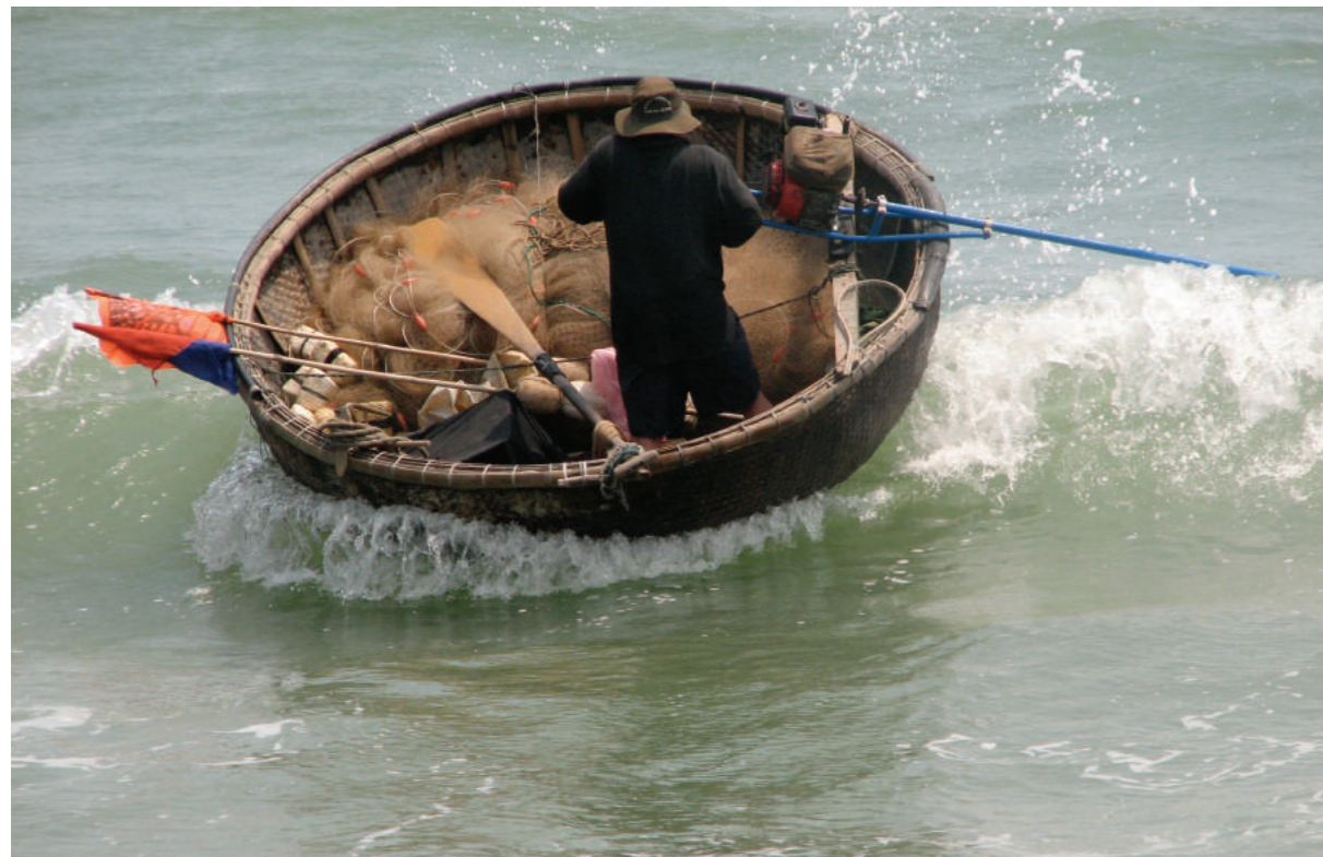
A small round basket boat known locally as a Ghe Thung Chai .

The great advantage of using bamboo is that it is resilient to wood-boring organisms. The material contains a high level of silica, not favoured by Xylophagidae and Teredinadae (such as the shipworm Teredo navalis and Bankia sp. ), as the bamboo laths are usually too thin to host them (Aubaile-Sallenave, 1987, pp. 81).