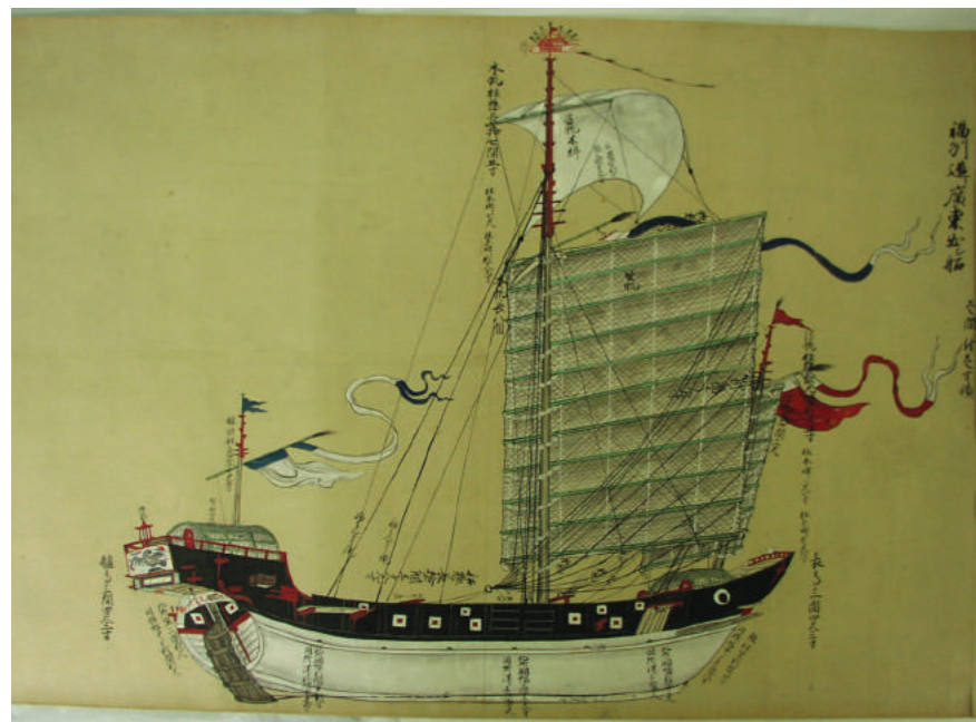
A fuzhou ship is typically a Southern Chinese shipbuilding tradition. It is possible to recognize the bamboo battened sails, a clear hanging axial rudder and a keel. This ship also figures on the eighteenth century picture scroll 'Tosen no Zu' (Matsura Historical Museum).

The Chinese junks were constructed shell first with a single layer of carvel planking and fastened with iron nails and clamps. They have a flat bottom design to suit their riverine environment, an overhanging flat transom and the stern is typically the largest part of the vessel.