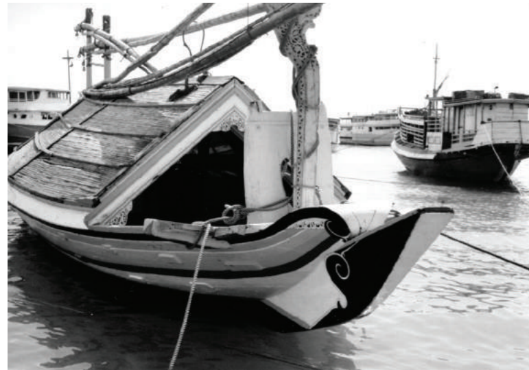
Planked boat: a golekan also known as the 'Madura trader' originate from Madura. Distinctly different from boats in Java, the golekan have a shallow form and small capacity, but are striking crafts, with an intricately decorated stem and stern.

Evolution can be quite slow and most of the time it is not well documented, due to a substantial lack of material evidence. However, some general traditions for South-East Asia have been identified and are discussed in this section.