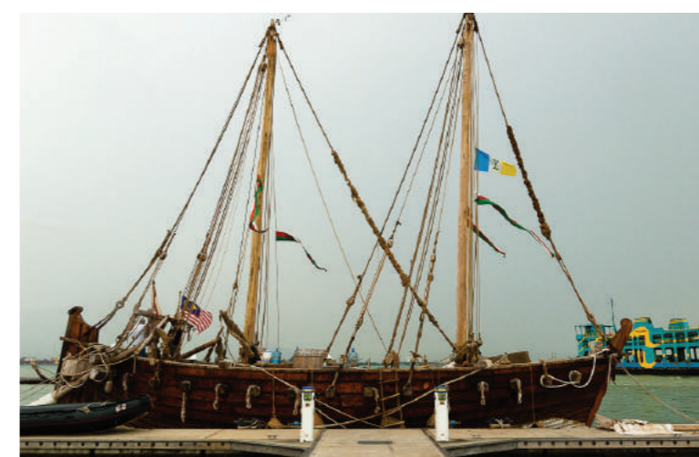
The Jewel of Muscat, a stitched boat replica based on the Belitung shipwreck.