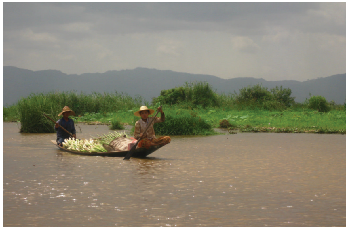
Small traditional boats are still used, but are fast disappearing along with traditional crafts and ways of life. Inle Lake, Myanmar.

Unfortunately, through events such as the Tsunami in 2004, these traditions are disappearing much faster than is anticipated and further research is required to preserve maritime cultural heritage and craft traditions. It is hoped that in the next few years new archaeological excavations, that incorporate a holistic approach, will increase the knowledge of past Asian shipbuilding technology.