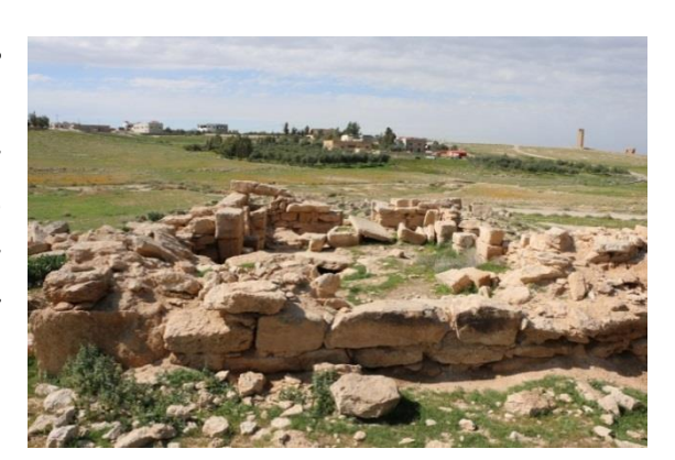
The Quarry Church

The Quarry church was excavated by Father Piccirillo, and the building with the rolling stone by DoA. They were not consolidated or conserved. They lack documentation, and suffer from some limited collapse, cracks, and vegetation growth.