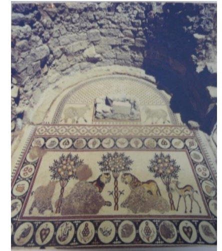
The Aps of the Lions

The complex of the church of the Lions consists of the church and a series of annex rooms and courtyards. The complex is well delimited to the north, west and south by streets, and to the east by a courtyard. Tombs were found outside of the entrance of the Church. They are built structures covered with slabs. The raised central presbyterium was well preserved with, exceptionally in situ, the steps leading to the ambo, the base of which was found at its original position. The main entrance was in the middle of the west wall. In the same wall a second door open on a closed small room covered by a stone flat roof supported by two arches.