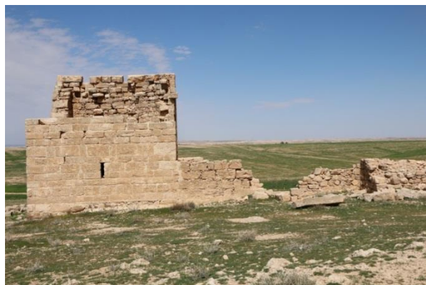
The Square Building