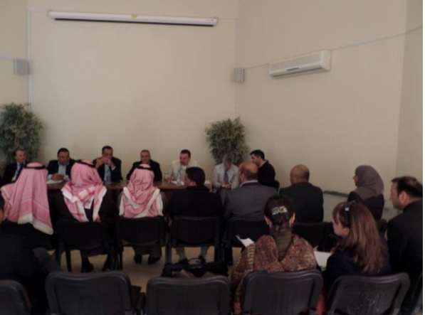
Meeting between the team of site management plan and the local community

The cleaners responsibilities are to remove rubbish from the site, especially near St. Stephen and Bishop Sergius churches