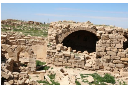
The Byzantine Villa

Between 2003 and 2007 excavations were conducted at the Reliquiarium (Madhkhar) Church by Ali al-Khayyat (DoA), followed by Father Piccirillo (2006; Abela and Pappalardo 2004).