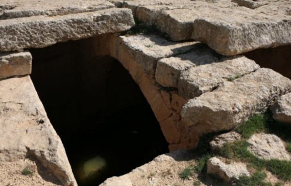
Reservoirs and Cisterns