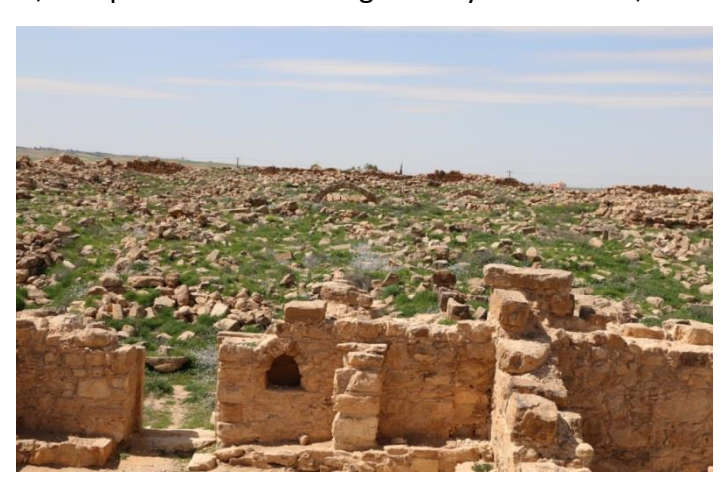
Twins Church and the Castrum

crystalline limestone and chert and thicker banks of phosphatic chert, and the lower Bahiya Coquina Member, 30 - 40 m thick; composed of thick banks of limestone alternating with thin layers of marl; the limestone is composed of layers of oysters and gastropods and contains 60% of carbonates and 40% of phosphates and silica; this rock provides an excellent building material. (2001 SECA report, p.17)