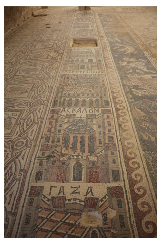
St. Stephen Mosaic Floor

The richness of the inscriptions and the quality of the motifs of the mosaic pavement of the church of Saint Stephen make it one of the most important archaeological monuments of Jordan. In this mosaic of the Abbasid period, we find a combination of many of the themes which had become progressively more popular in the earlier mosaics of Jordan: portraits of benefactors, hunting and pastoral scenes, scenes of a daily life, architectural representations, birds and flowers which fill the elaborate geometric patterns and inscriptions.