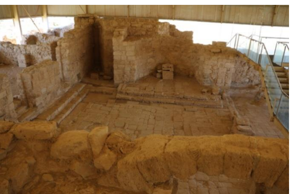
The Church of the Courtyard