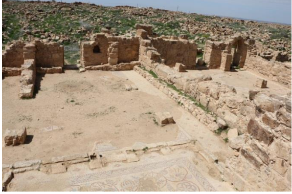
The Twins Church

The Church of the Rivers (578/79 or 593/94 A.D.) is the northern of the twin churches, it has a mono apse with three naves separated by two rows of three arches and a raised presbyterium, limited by chancel and flanked by two small rectangular chambers closed with doors. Three doors (one by nave) gave entrance through the western wall. Another door in the north wall, gives access into a