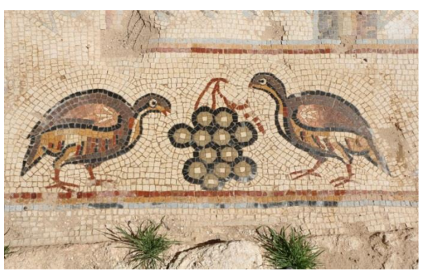
Mosaic of Twins Church

The Church of the Rivers (578/79 or 593/94 A.D.) is the northern of the twin churches, it has a mono apse with three naves separated by two rows of three arches and a raised presbyterium, limited by chancel and flanked by two small rectangular chambers closed with doors. Three doors (one by nave) gave entrance through the western wall. Another door in the north wall, gives access into a