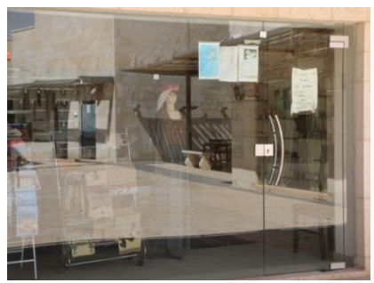
The Visitor Center of Umm ar-Rasas and its Facilities