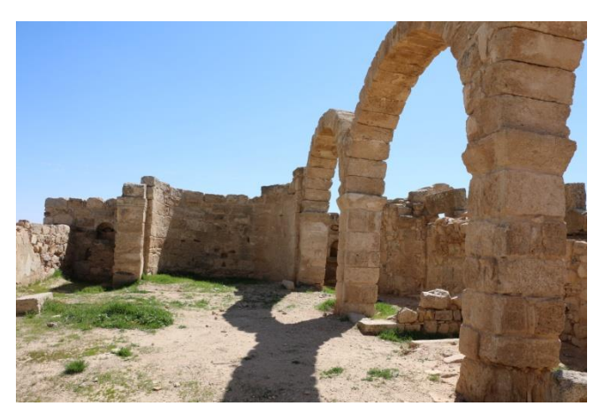
St. Paul Church

The mosaic plan of the central nave was divided in three panels with an autonomous alignment in respect to the presbytery step which results deviated in some degrees towards the south.