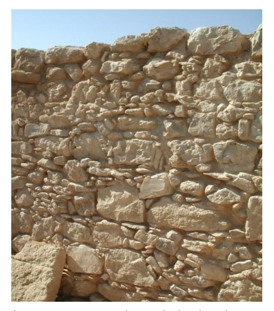
The Restoration work in Tabula Church 2005

The Tabula Church was not conserved with the exception of drainage channels that connect to the main cistern of the church.