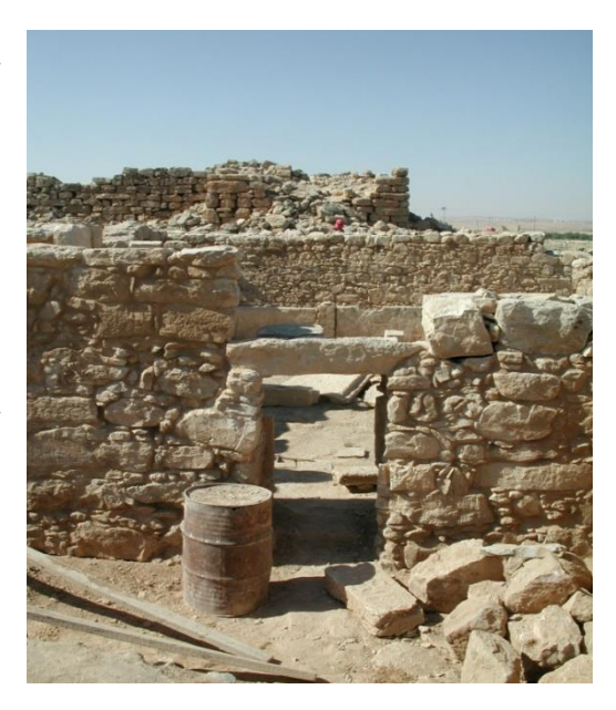
The Restoration work in St. Paul Church 2005

Cleaning of the mosaic floor was conducted by the Madaba Institute in 2003.