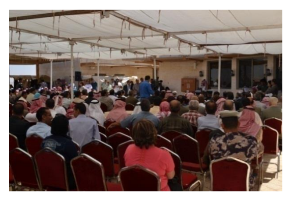
The Visit of Ms.Irina Pokova, UNESCO's director general to the site of Umm ar-Rasas, with HE Minister of Tourism and Antiquities and DoA Staff