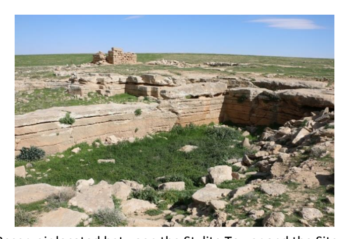
Reservoir located between the Stylite Tower and the Site

This unit comprises two groups of buildings. The first is a watch tower and a small church with associated quarries and cisterns, and the second is a building whose function is still undetermined, with an associated cistern. The entrance to this building could be blocked with a rolling stone which is still in situ. This unit is located between the castrum and the stylite tower complex, near the agricultural fields.