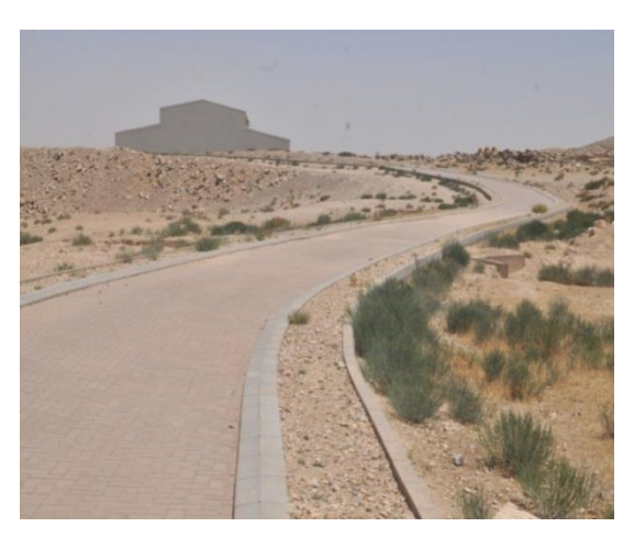
The Trail that leads to the St.Stephen Complex

A paved road leaves the visitor center to provide access for the disabled and VIPs to the St. Stephen complex. In this location there is a small parking area. A toilet building was also built in the slope below St. Stephen. It is currently closed because of lack of water supply.