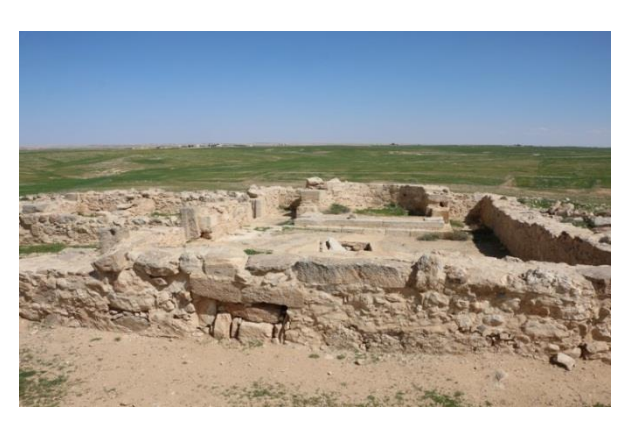
The Church of the Tower

It is a small three naves church with simple plastered floor with annexed premises and different dwellings around. It was excavated in 2001 by the Department of Antiquities, and no mosaics were found to form any part of its floor. What was found consisted of compacted white plaster. The plan of the church is a small basilica with one apse, oriented East-West. It has three small naves separated by two rows of two arches. The central nave had an elevated presbyterium flanked by small rectangular chambers completely open on the lateral naves.