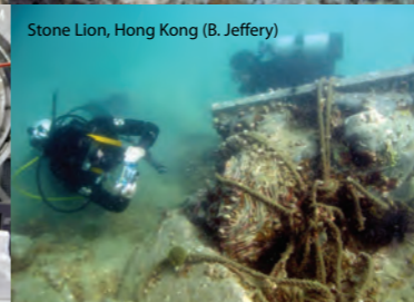
Stone Lion, Hong Kong