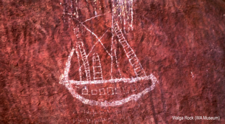
Walga Rock (WA Museum)