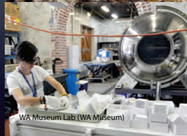
WA Museum Lab (WA Museum)