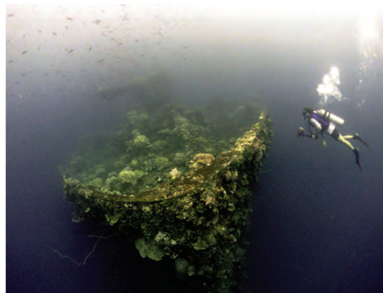
Fujikawa Maru

AIMA hosts an annual conference for its members, anyone interested in the ethical practice of maritime archaeology as well as underwater and maritime cultural heritage management. These are held in a different State or region each year and present an opportunity to hear papers on current projects, attend workshops, renew contacts and discuss many of the wide range of activities in which AIMA members are involved. Delegates come from all over Australia and overseas and have included representatives from Asia, the Pacific, Europe and North America.