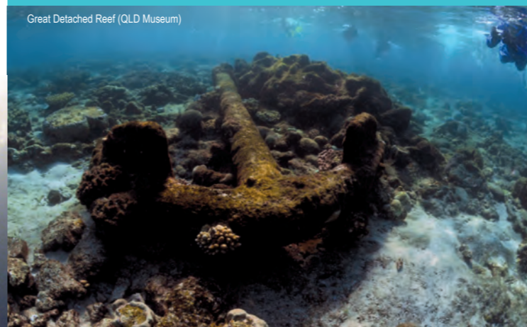
Great Detached Reef (QLD Museum)

AIMA is licensed to teach the Nautical Archaeology Society's (NAS - UK) four-part educational programme in Australia. The NAS is an international society whose avocational courses are taught to divers and non-divers around the world, aiming to advance education in maritime archaeology at all levels. AIMA/NAS courses are conducted around Australia and New Zealand by local maritime archaeologists. Participants are encouraged to carry out their own projects as part of the training scheme. More information about the courses can be found on the AIMA website.