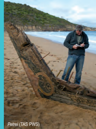
Petrel (TAS PWS)

A condition of the scholarship is that the recipient(s) publish a peer-reviewed paper either in the AIMA bulletin or as an AIMA special publication. See website for more details.