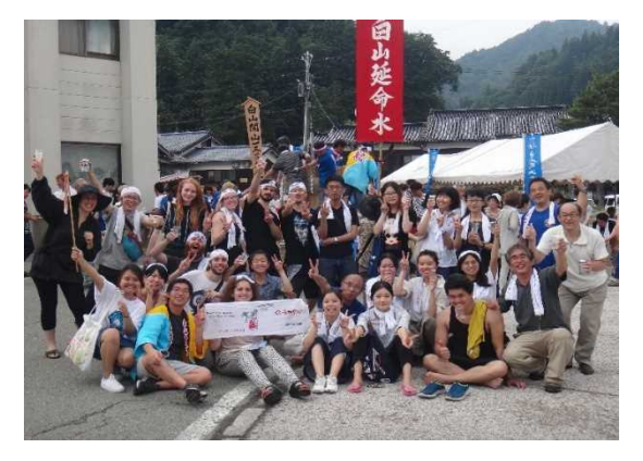
Photo 5: End of the course, and celebration of Mount Hakusan Festival with locals

the income of each other's, so that everything is equally shared.