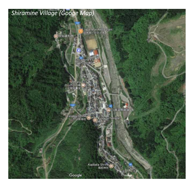
Photo 2: Shiramine village and 17 fieldworks with 17 SDGs evaluation practices

Local government is trying to implement many new policies to attract younger generations to live inside the rural areas, and there is an urgent need to educate the youth to act towards regional conservation and regeneration. Academic Institutions are also involved in implementing a new methodology into the curriculum to contribute for the revitalizations. however. regional unfortunately, due to the modern changes in the 21st century student's interest is exposed towards economical and technologically advanced societies and seizes the values towards rural societies.