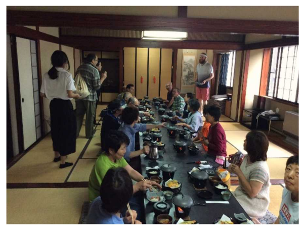
Photo 3: One of the 17 community-service activities. Helping in local restaurant to receive local customer

Raising the awareness in the youth towards the regional issues, would be very critical and important to educate the senses of belongings into the rural areas, as the acknowledgement of the fact that the issue exists can encourage the youth for the personal commitment to act towards the issues. For this reason, from 2016, Kanazawa University together with the local NPO Hakusan Shiramine Nature School and Mount Hakusan Biosphere Council has organized the educational course towards the sustainable regional development by using SDGs as the tool to raise the awareness in local issues. We decided to