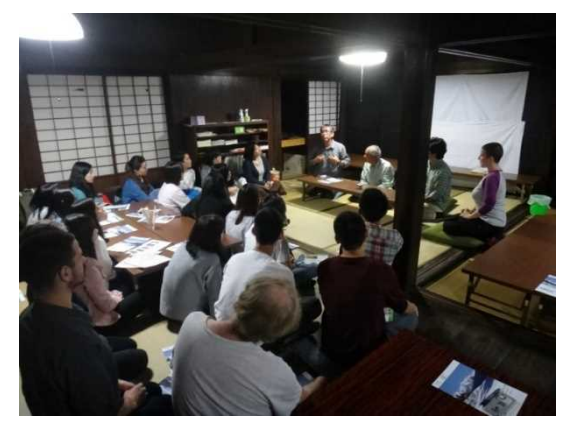
Photo 4: Workshop with locals about Elderly, Women and Youth activities in the village during the overnight camping