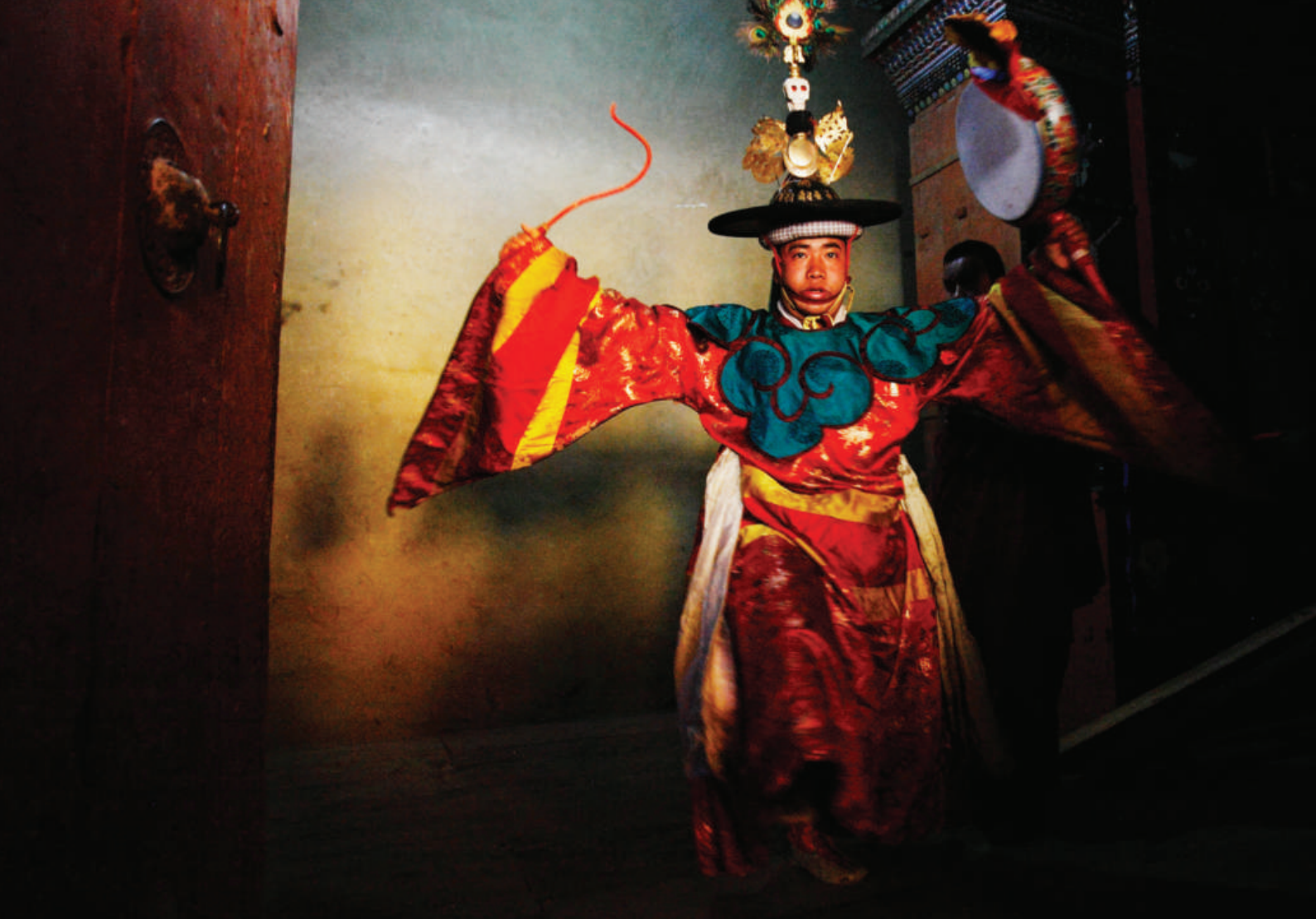
📍 The Mask Dance of the Drums from Drametse, Bhutan