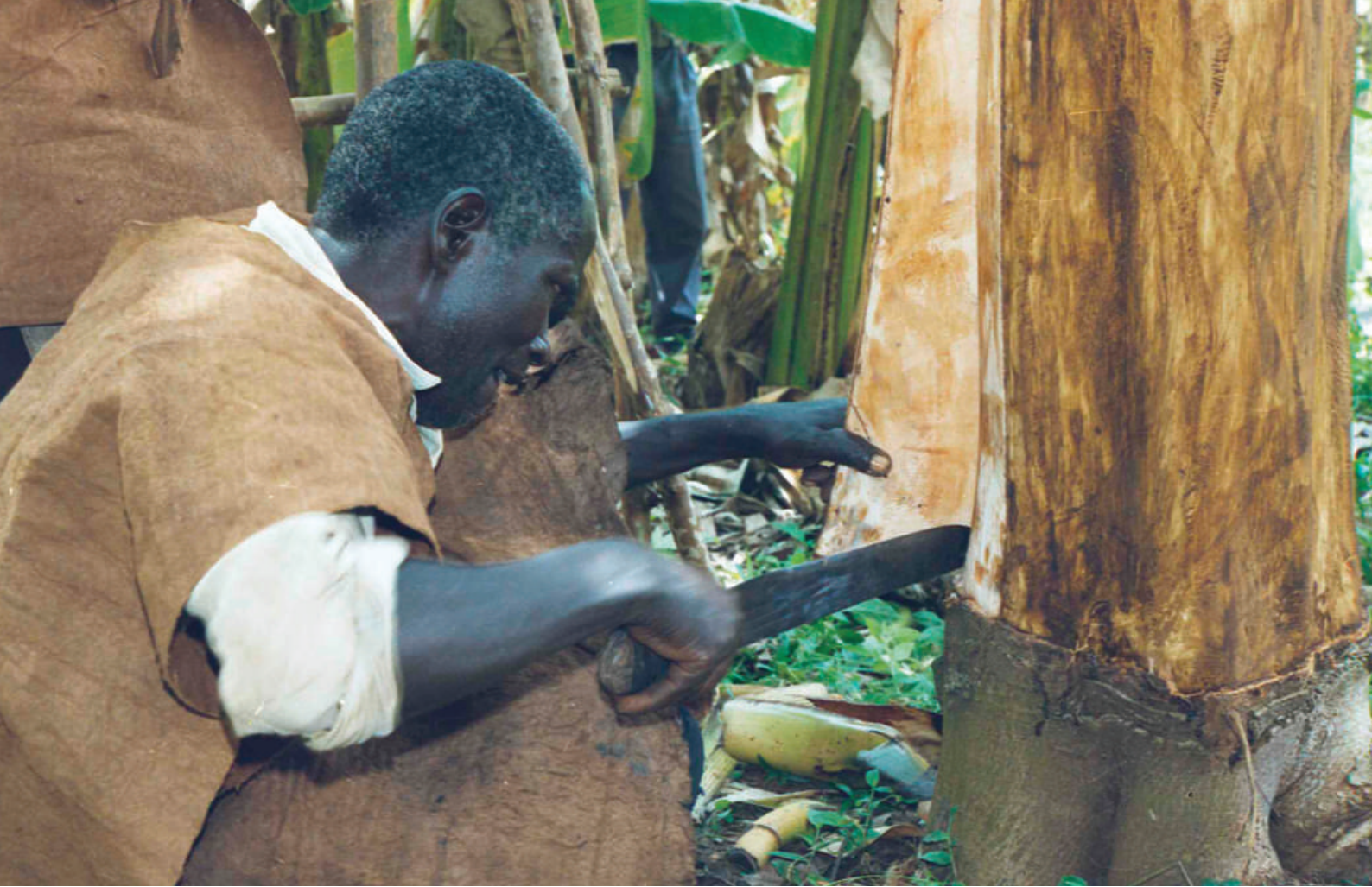
Barkcloth Making in Uganda

austere, resulting in fewer opportunities for artisans to express themselves. Young people in communities may find the sometimes lengthy apprenticeship necessary to learn many traditional forms of craft too demanding and instead seek work in factories or service industry where the work is less exacting and the pay often better. Many craft traditions involve ‘trade secrets’ that should not be taught to outsiders but if family members or community members are not interested in learning it, the knowledge may disappear because sharing it with strangers violates tradition.