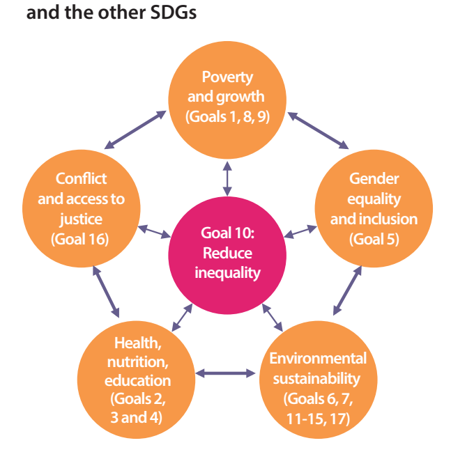
Figure S.2 Interaction of Inequality Goal 10