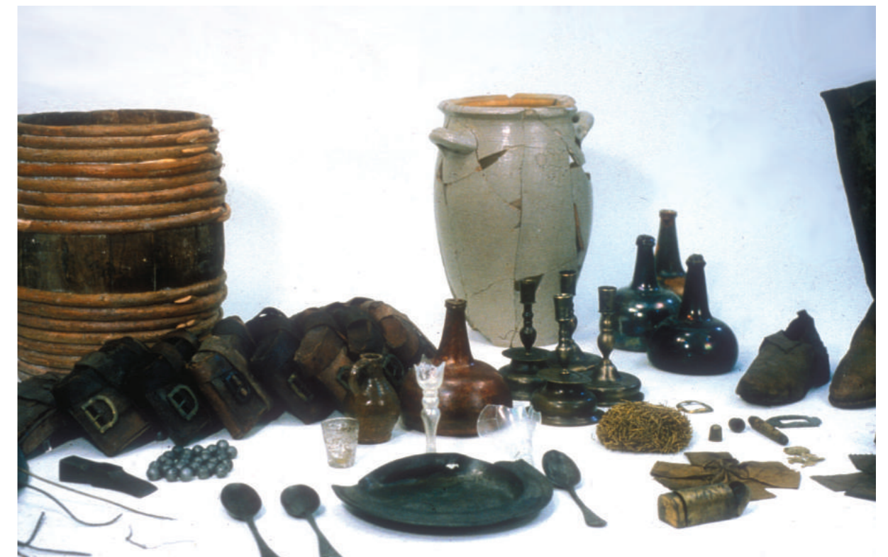
A selection of finds from the 1984-1986 archaeological research from the Amsterdam (1749).