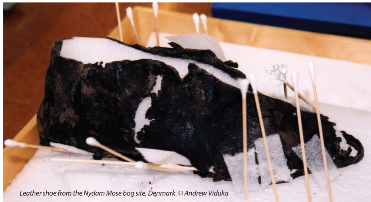
Leather shoe from the Nydam Mose bog site, Denmark.