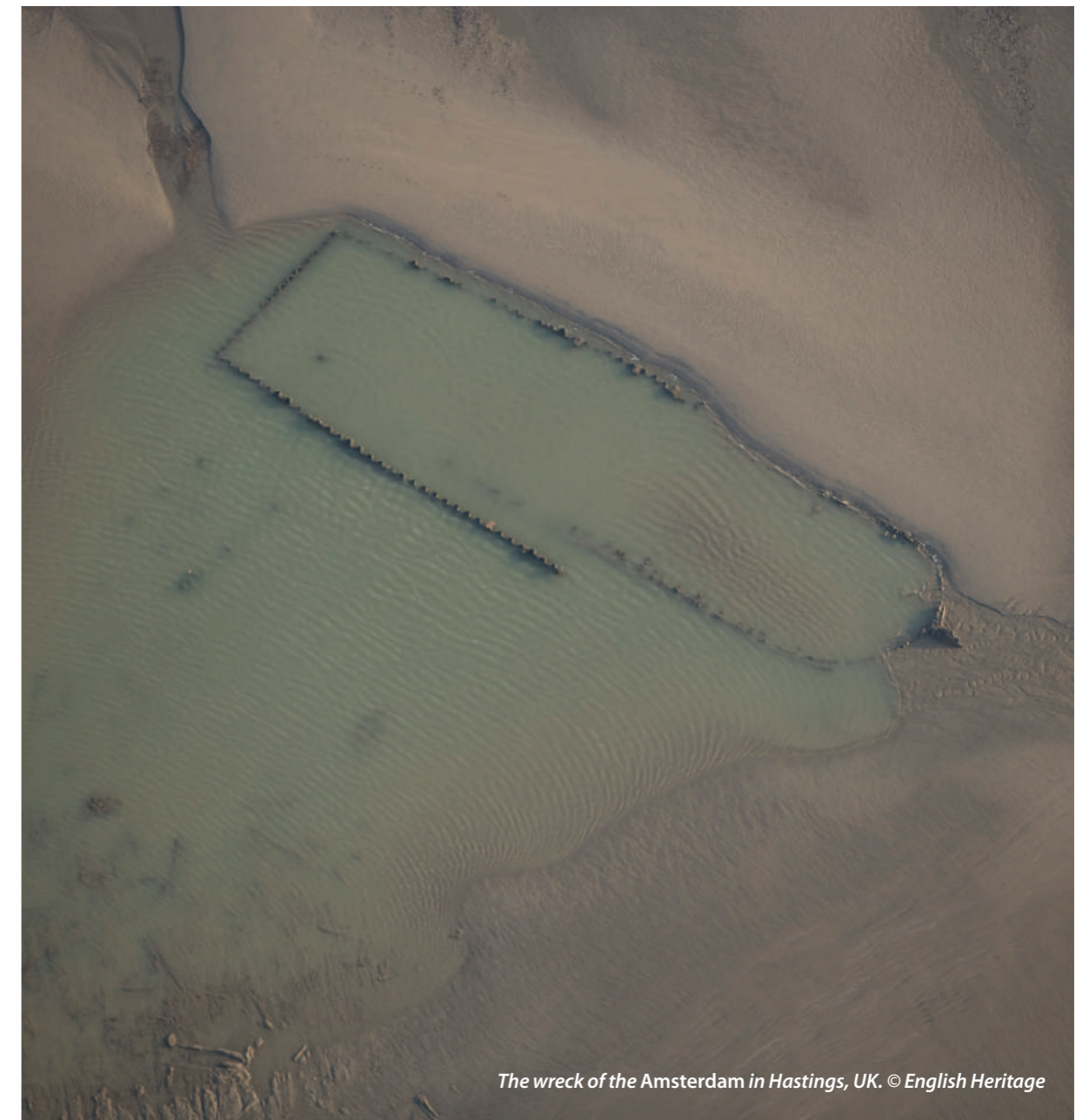
The wreck of the Amsterdam in Hastings, UK.

The shipwreck is complete up to the upper gun deck on the port side and the lower gun deck on the starboard side. Excavation work was concentrated on a 15 metres long section of the vessel, located at the stern (seaward end) of the site. About 3 metres of largely undisturbed archaeological deposit was excavated which consisted of a dense layer of artefacts and organic materials. These materials included ecological components and ecofacts, such as insects, botanical and faunal remains.