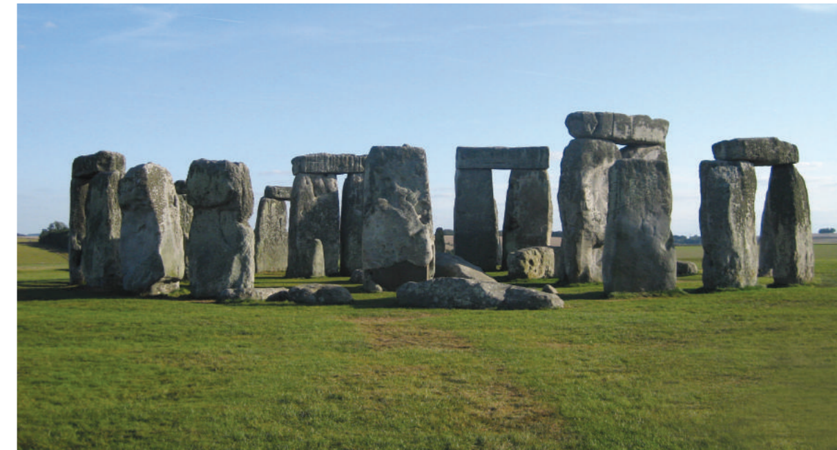
Stonehenge, one of the world's most famous artefacts.

This tangible evidence of human culture is collected by museums (see Unit 16: Museology), though the vast majority of material culture exists outside of museums, in people's homes and workplaces and the surrounding landscape.