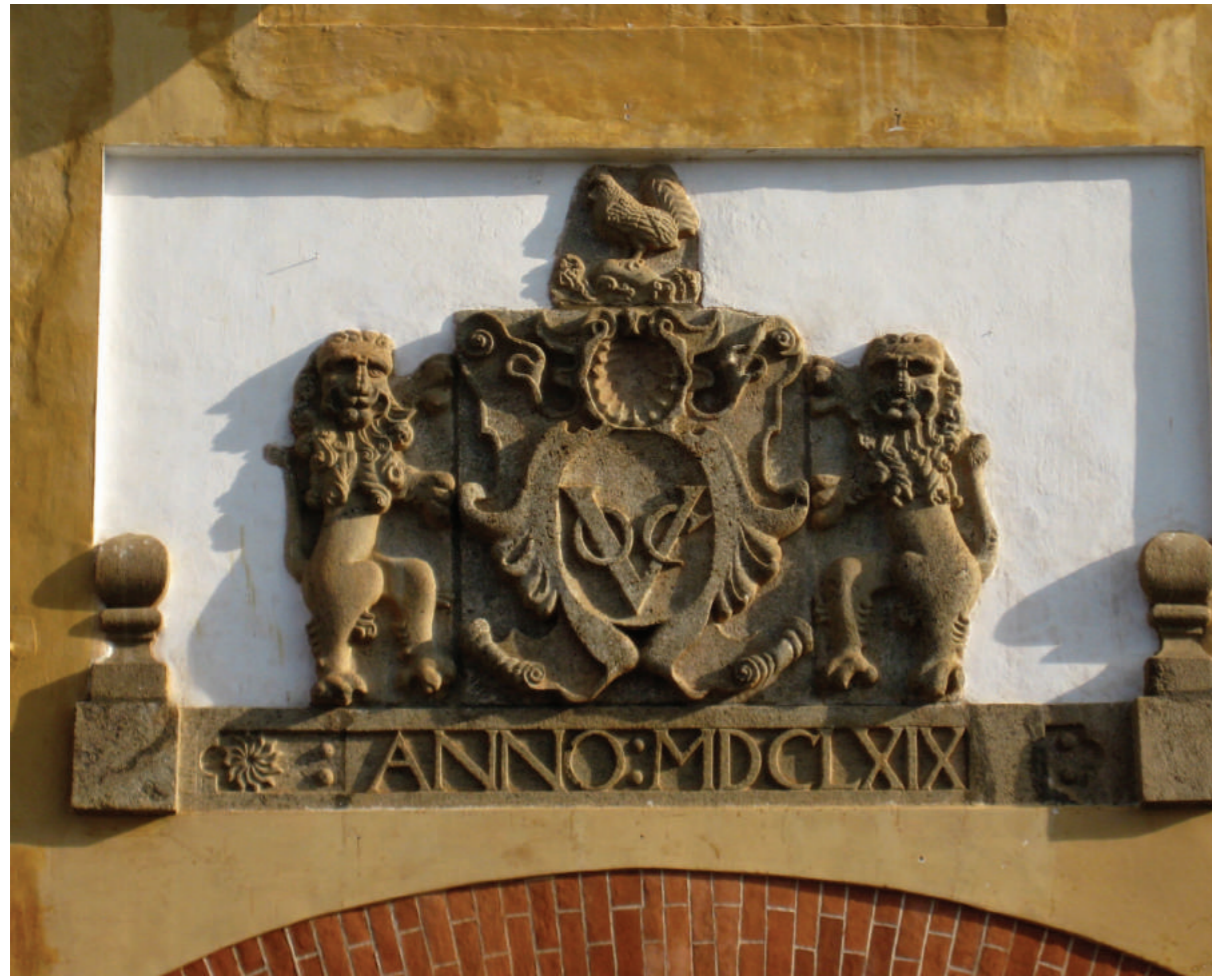
Dutch East India Company emblem on the wall of Galle Fort, Sri Lanka.