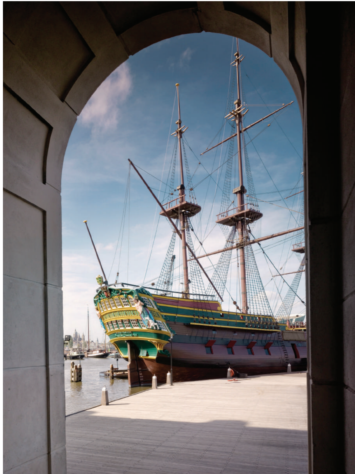
The replica of the VOC ship Amsterdam, September 2011.