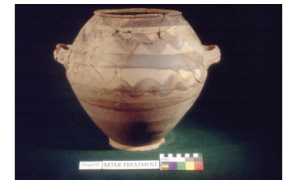
This Ovoid earthenware jar was broken and repaired in antiquity. It was later re-used as a burial urn and found containing the bones of a dog.

Context is the place where an object is found and the relationship or association of the object to everything around it (usually other artefacts). Its chronological position is inferred by its location within the stratigraphy. The careful documentation of context enables an artefact to be interpreted through various archaeological theories. Without context, an object loses much of its interpretive value and can be considered a loose find. A loose find is any artefact that cannot be accurately placed in context.