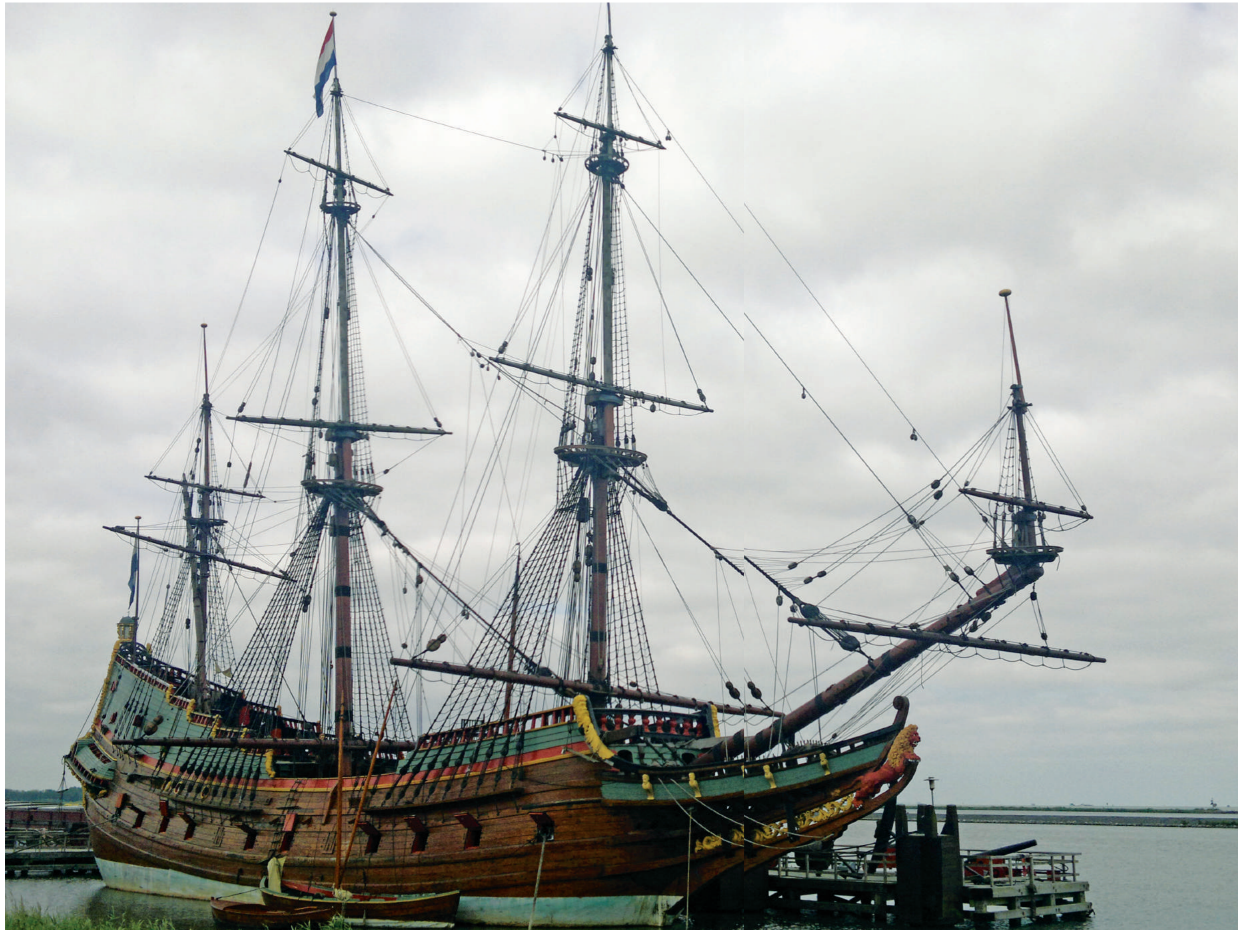
Replica of the Dutch East India Company vessel Batavia (1629) in Lelystad, the Netherlands.