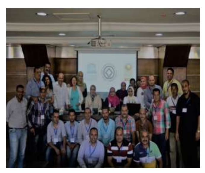
Participants during the training session of the workshop

More than 30 inspectors and sites managers, from the six Egyptian cultural sites inscribed on the World Heritage List and from several sites inscribed on the World Heritage Tentative list, came to the UNESCO Cairo new premises in sixth of October City to attend the oneweek seminar. The main focus was enhancing the technical skills of Ministry's employees, sites managers and inspectors in the Management Plan for the sites under their responsibility.