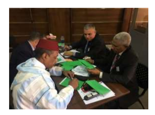
Group work during the workshop on "Concepts of sustainability and inclusiveness within the context of cities and their application in the Arab region" (Cairo, 27-28 September 2017)

Presentations and discussions addressed the regional development context in Arab cities. Participants exchanged their views and experiences in dealing with the consequences of rapid and unplanned urbanization, the refugee crisis, and the proliferation of informal settlements.