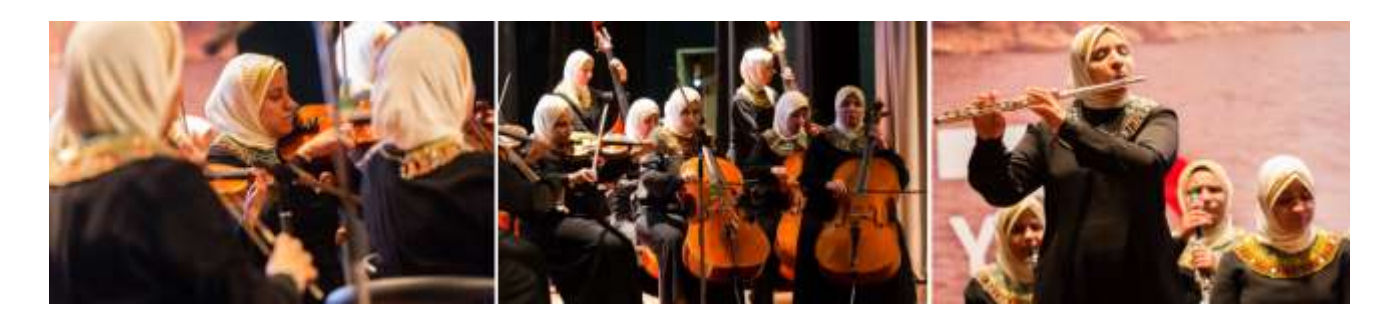
The Light and Hope Orchestra is composed of visually impaired female, Egyptian musicians. They regularly perform in global capitals delighting and inspiring audiences.

The UNESCO Regional Bureau for Sciences in the Arab States is part of UNESCO's global network of 52 field offices. Established in 1947, the Cairo Office holds the distinction of being amongst the oldest UNESCO Field Offices in the world. Through targeted interventions, it is supporting Arab countries to achieve the 2030 Sustainable Development Goals.