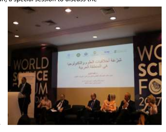
Special session on the Arab Charter at the World Science Forum.

Panelists and participants confirmed the usefulness of the Charter and its relevance to the challenges facing science and technology in the region. The role of the Charter in enhancing the quality of research in the region and protecting vulnerable groups was highlighted. Freedom of research, open access to knowledge, and the ethics of emerging technologies such as big data and artificial intelligence were among the questions raised in the session. Several participants stressed the importance of operationalizing the Charter through its adoption by universities and other stakeholders, and the elaboration of an evaluation and follow-up mechanism.