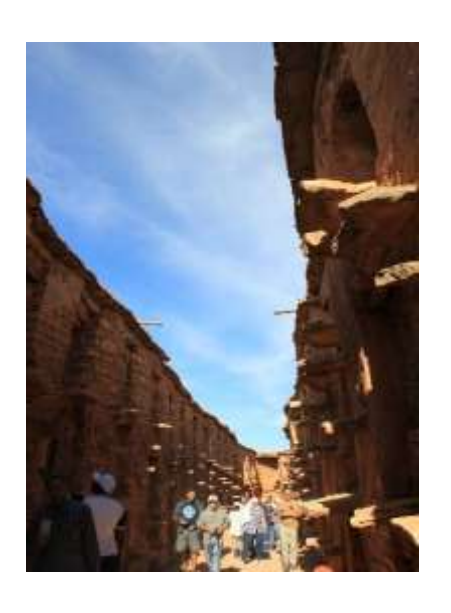
Arganeraie Biosphere Reserve field visit @UNESCO/E. Sattout.

The UNESCO Regional Office for Sciences in the Arab States in close cooperation with the UNESCO Office in Rabat, ISESCO, ALECSO and the Government of Morocco organized the 2nd IHP-MAB initiative meeting to promote the biosphere reserve as an observatory to monitor climate change and to share lessons learned on sustainable development in the Arab and African region. The meeting gathered more than 50 participants from the Arab and African countries in the Royal Atlas Hotel in Agadir in Morocco from November 17 till 19, 2017. The field visit to the Arganeraie Biosphere Reserve (ABR) showcased community involvement, biodiversity conservation and ecosystems restoration as well as the importance of indigenous knowledge and cultural preservation. It is worth noting that the IHP-MAB initiative stemmed from UNESCO's COP initiative entitled 'Changing minds, not the climate'.