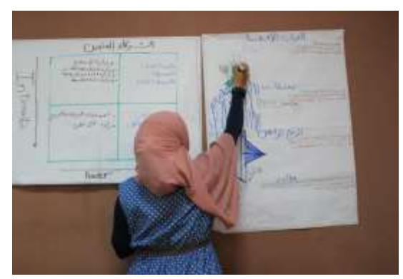
Participant mapping solutions of conserving built and natural environment

UNESCO Regional Office for Science in the Arab States-Cairo took the lead of the Environment track through a real case scenario inspired by the history and culture of the city of Alexandria. The track's main aim was to engage youth in reflecting on their role in promoting harmony in the relationships between human and nature and in re-stitching the path towards strong engagement of the private and public sectors in nature conservation. The sessions guided participants on how to become engine for