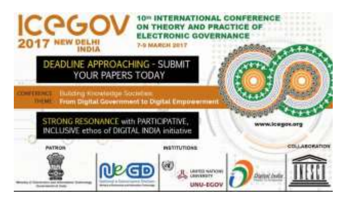
ICEGOV is the most important global e-government conference

The 3-day conference entitled "Building Knowledge Societies: From Digital Government to Digital Empowerment", was held under the patronage of the Ministry of Electronics and Information Technology, Government of India, UNESCO and the United Nations University's Operating Unit on Policy-Driven Electronic Governance (UNU-EGOV).