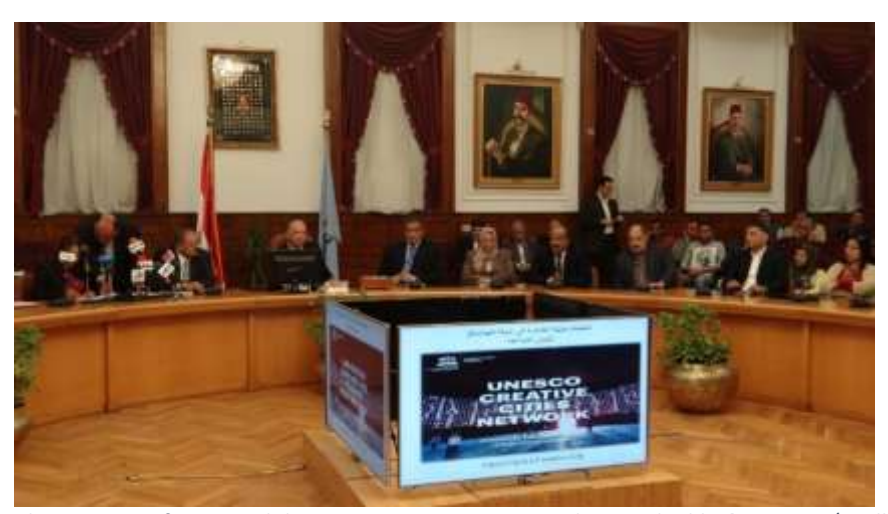
The governor of Luxor and the Director UNESCO Cairo at the round table

In a ceremony held at the Governorate of Cairo on November 1, 2017 the crucial role of cities in promoting sustainable development focused on people was enhanced by the Governor of Cairo, the Director of UNESCO and the Egyptian National Commission for UNESCO.