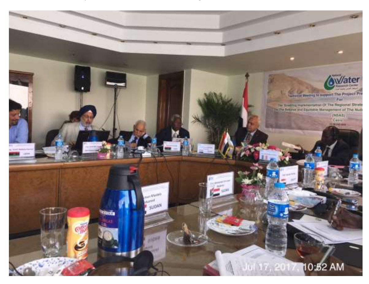
Members of the Joint Authority of the Nubian Sandstone Aquifer (Shared between Sudan, Libya, Egypt, and Tchad) discuss the UNESCO proposal for support of cooperation on Shared Management of the Aquifer

Following a request from the National Water Research Centre (Egypt), UCO extended its support to the Joint Authority of the Nubian Sandstone Aquifer (Egypt, Libya, Sudan, and Tchad) to organize a technical meeting on the UNESCO UNDP-GEF proposal "Enabling implementation of the Regional SAP for the rational and equitable management of the Nubian Sandstone Aquifer System (NSAS)". The meeting was held on July 2017 in Cairo and was attended by all members of the Joint Authority (JA) and the JA Secretariat. A number of national technical experts also attended the meeting.