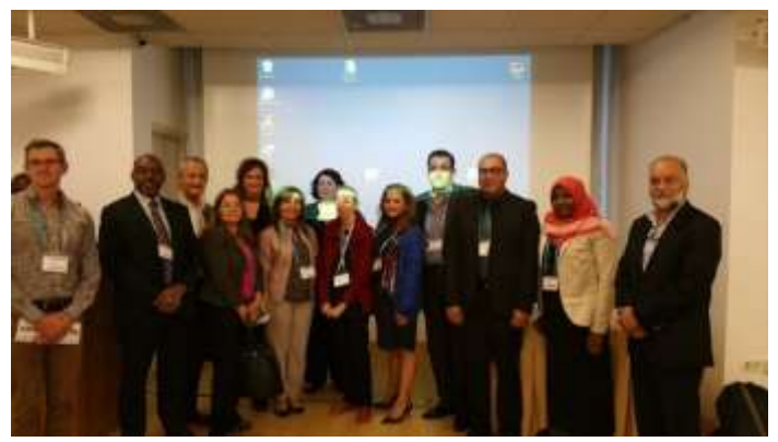
Panelists in the Arab OER Forum session organized during the Second World OER Congress

An online platform hosted by ALECSO has served as a repository for the community's outputs, while a Whatsapp group and mailing list serve as the primary means for communication. The Forum currently has projects underway in Egypt, Jordan, Palestine, Sudan and Tunisia.