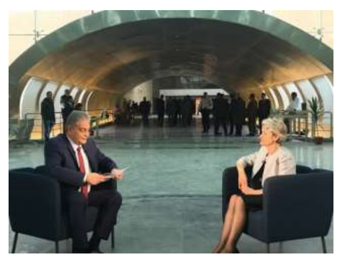
H.E. Ms. Irina Bokova, Director General of UNESCO, interviewed for the Egyptian Television on the night of the "soft" opening of the NMEC

Inauguration of the Temporary Exhibit of the National Museum of Egyptian Civilization in Cairo – NMEC: "Egyptian Crafts through the Ages"