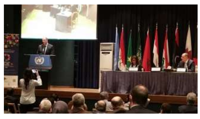
Representative of Prime Minister delivering opening remarks at UNESCWA Arab High-Level Forum on WSIS and 2030 Agenda (UNESCWA Sec General a.i. and Chief of ICT Policies are at the dais)

The event entitled the "Arab OER Forum: Advancing a Regional Agenda", brought together more than 50 national, regional and international experts from the governmental, intergovernmental, academic, civil society and the private sectors working in the field of OERs. It provided an opportunity to reflect on specific challenges faced by the Arab States, identify and share areas where the Arab OER Forum was advancing efforts and explore how it could effectively support implementation in the Arab