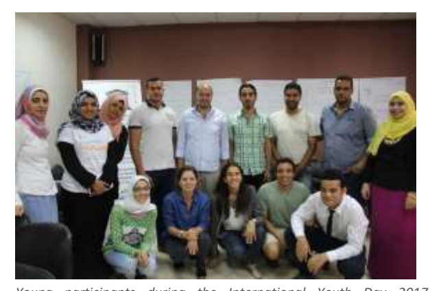
Young participants during the International Youth Day 2017 celebration in Abu Qir city in Alexandria.

Environment Ethics lines of thoughts- those that craft unconsciously human's mindsets that are at the base of human relationships with nature. At the end of the youth camp, the essence of discussions was revealed during the role-play presented by the participants. Youth expressed that humans during their self-development paths are transformed from being self-centered to turning outwards to others and embrace