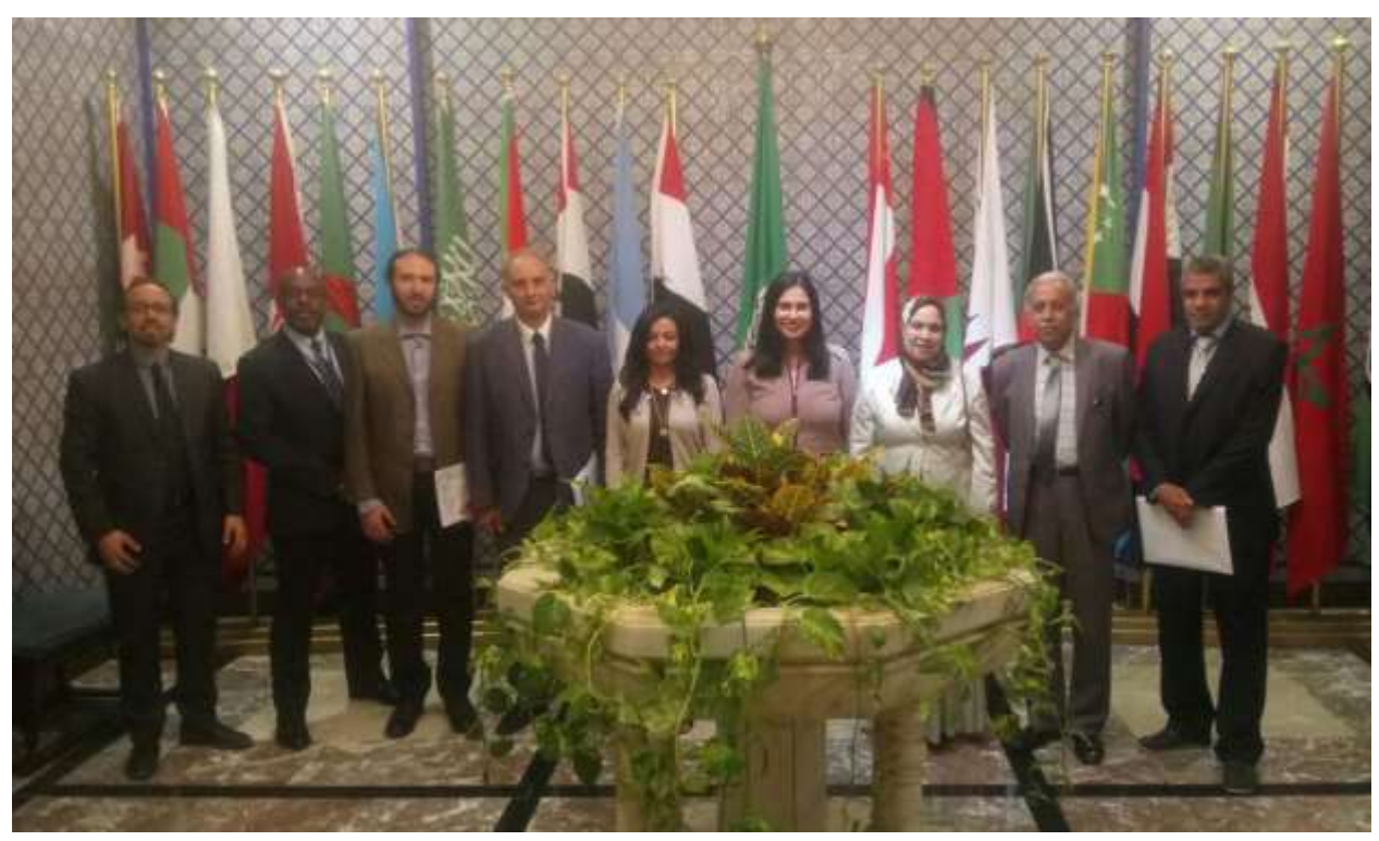
Participants at the First Preparatory Meeting for the seminar "A Message to Media Professionals"

The UNESCO Cairo Office has been deepening its cooperation with the League of Arab States (LAS) across the 5 programme areas of Education, Natural Sciences, Social and Human Sciences, Culture as well as Communication & Information. In the field of Communication and Information, efforts are currently underway between LAS, UNESCO and the United Nations Office of Counter-Terrorism's UN Counter-Terrorism Centre (UNCCT) to develop a joint project that seeks to remove conditions in the region that are conducive to the spread of terrorism and extremism. The project aims to achieve this by strengthening capacities in media and information literacy amongst youth and media professionals in order to create a climate enhanced dialogue, respect and mutual understanding. The initiative is expected to launch in 2018.