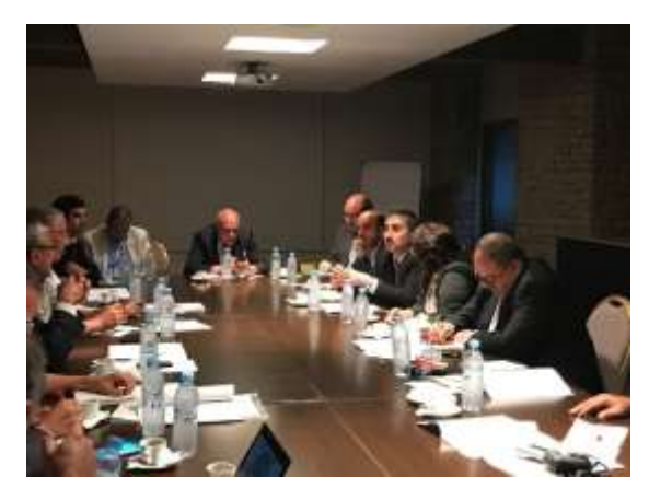
Preparatory meeting of representatives from the Arab countries discussing the SOI framework @UNESCO/E. Sattout.

The importance of SOI in the Arab region and the need to maintain a momentum in the application of ecosystem-based approaches overseeing environmental, economic and social aspects as the driving forces to keep the pace of operationalizing the SOI was highlighted. UCO expressed its support to the initiative on sustainable oases and referred to the UNESCO Man and Biosphere Programme and Geoparks Programme as resourceful learning grounds for the initiative. Thus, UNESCO committed to provide all the support needed in close coordination with UNESCO Office in Rabat.