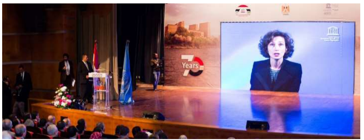
UNESCO's Director-General, Ms. Audrey Azoulay addressed the gathering by video message.

On Wednesday 6 December 2017, the United Nations Educational, Scientific and Cultural Organization (UNESCO), in cooperation with the Ministry of Higher Education and Scientific Research in Egypt and the Egyptian National Commission for UNESCO, celebrated the 70th anniversary of the establishment of the UNESCO Regional Bureau for Sciences in the Arab States in Cairo.