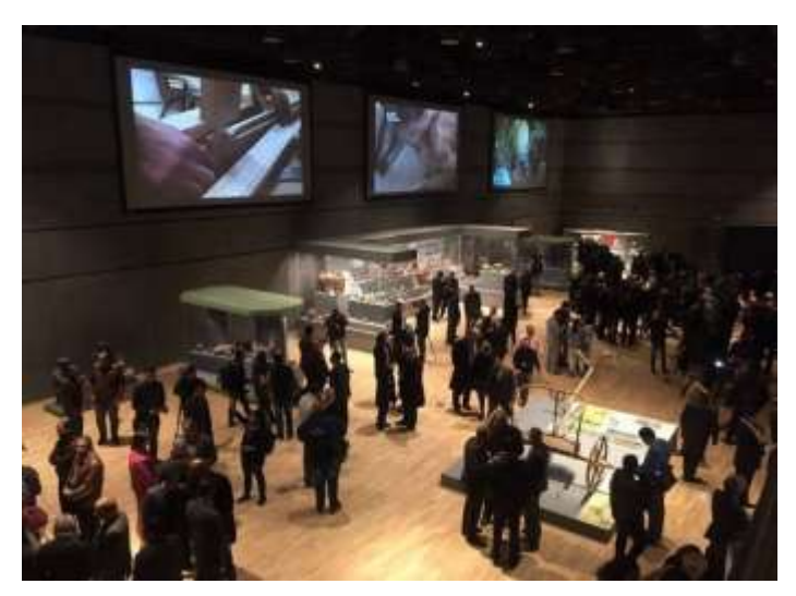
Temporary Exhibition Hall showing "Egyptian Craft through the Ages"

The inauguration of the exhibit was a result of a collaborative effort between the UNESCO Cairo Office and the Ministry of Antiquities of Egypt. It was one of the recommendations of the 18th session of the Executive Committee of the International Campaign for the Establishment of the Nubia Museum in Aswan and the National Museum of Egyptian Civilization in Cairo. It is a step towards establishing NMEC as an educational lighthouse protecting the different facets of Egyptian Civilization through crafts, history, languages, depicting Egypt as a pioneer in philosophy, architecture,