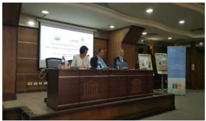
in the Arab region, which has become increasingly urban and increasingly diverse.