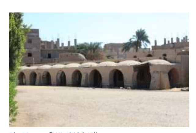
The Mosque

Various meetings took between NOUH and UNESCO Cairo Office, where a detailed work plan was approved. The project was officially announced to the public on 13 November 2017 in NOUH, where a photo gallery of Hassan Fathy's work was put on display. The ceremony was organized by NOUH in collaboration with UNESCO Cairo Office and the American University in Cairo (AUC). The site of the Khan was officially handed over from the Governor of Luxor for the launching of the first phase on 15 October 2017.