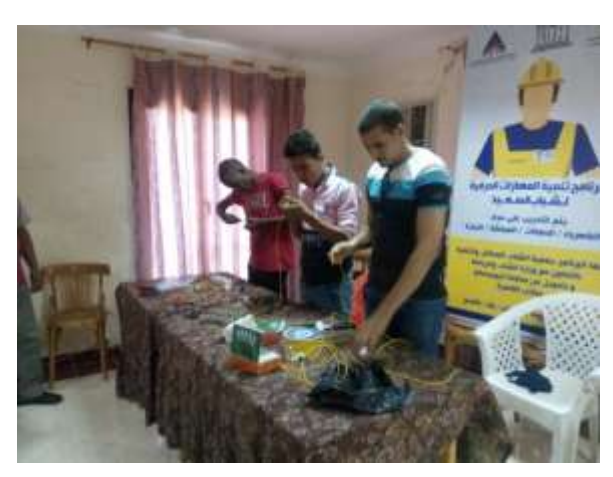
Youth from Upper Egypt participate in vocational capacity-building workshops on electricity

Cooperation between UNESCO and MoYS is on-going. In the summer of 2016, a series of workshops were successfully organized in Tanta, Port Said and Cairo under the theme "A Society with Gender Equality and Non-Violence". These workshops helped to sensitize young Egyptian men and women to these vital issues through the use of artistic expression.