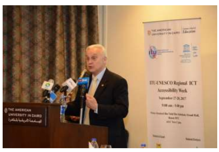
President of the American University in Cairo during opening session of the High-Level Symposium

ITU-UNESCO High-level Symposium, Overcoming Divides and Achieving the SDGs -Supporting the inclusion of people with disabilities and vulnerable group: This event attracted the participation of three Ministers of Government who in their keynote addresses explored impacts in the education, research and ICT Sectors. An expert panel of stakeholders involved in supporting the implementation of the SDGs in Egypt examined ongoing