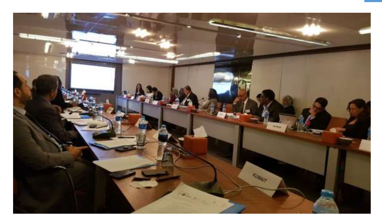
ESCWA-UNESCO 9th Capacity Building Workshop for Arab Climate Change Negotiators