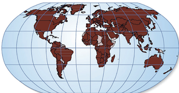
World map showing countries involved in IGCP projects in brown during 2017