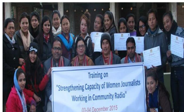
Participants of the training in Kavre district