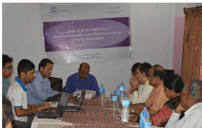
Consultation with stakeholders in eastern region Biratnagar, Morang