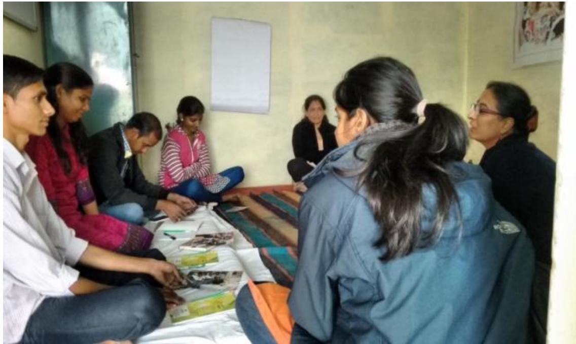
Figure 1: Glimpse from the training session

Here are a few visuals from the first training program conducted at Waqt ki Awaaz Community Radio station, in Kanpur Dehat