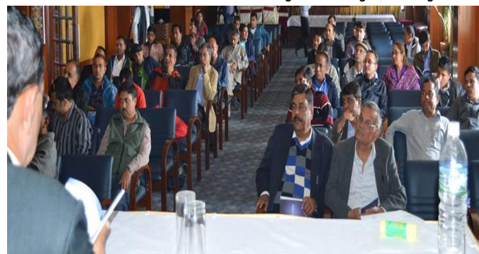
National Seminar organized in Kathmandu in 2 November 2015