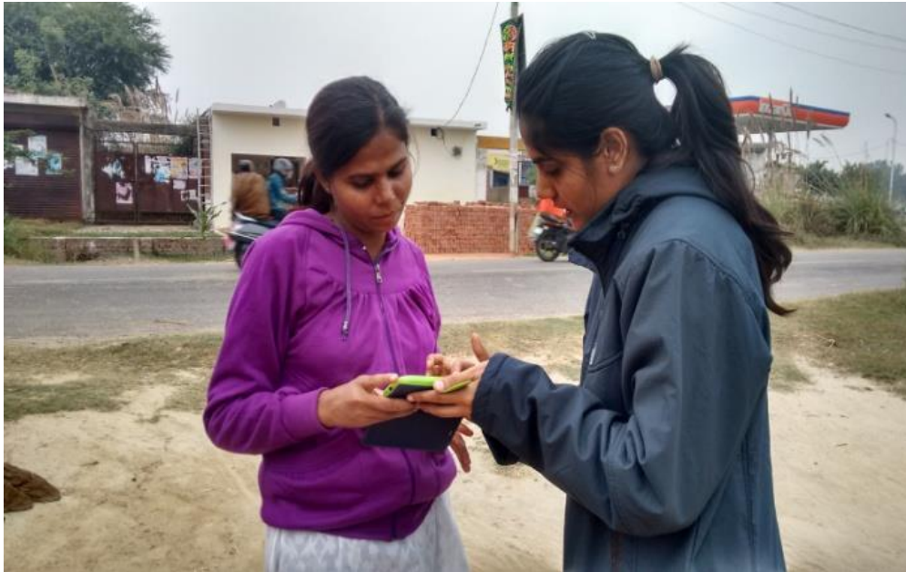
Figure 3: Field practice on mobile phone