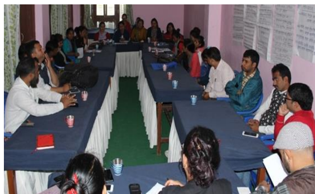
Discussion with owner, station manager and journalists in Nepaljung