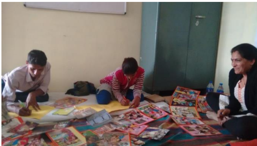
Figure 2: Participants working with visuals for story boards