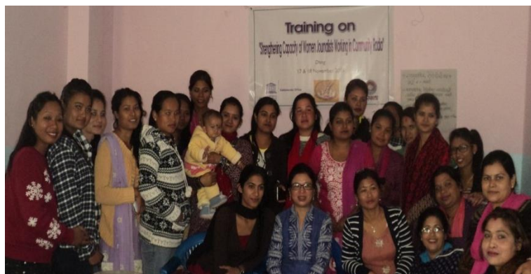
Participants of the training in Dang district