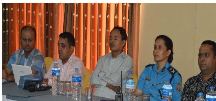
Consultation with stakeholders in western region Pokhara, Kaski