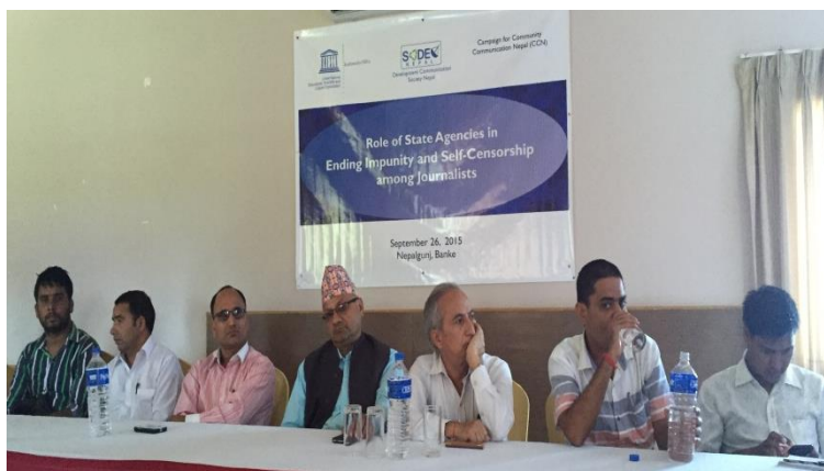
Consultation with stakeholders in mid-western region Nepaljung, Banke