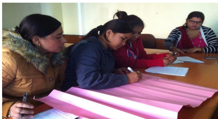
Training participants in group work in Dolakha district