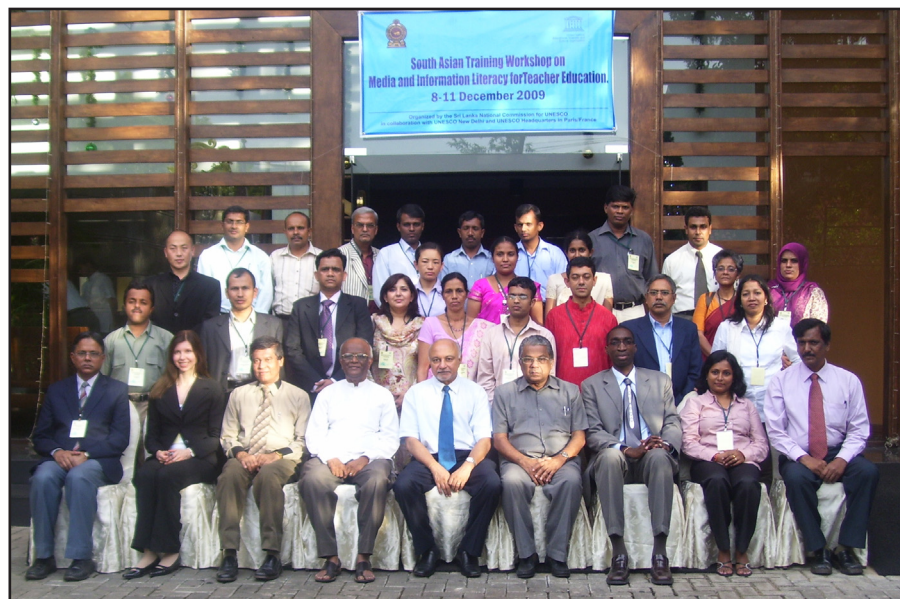
South Asian Training Workshop on Media and Information Literacy for Teacher Education

The background of participants and balanced geographical representation ensured that a wide variety of perspectives were brought to the working process.