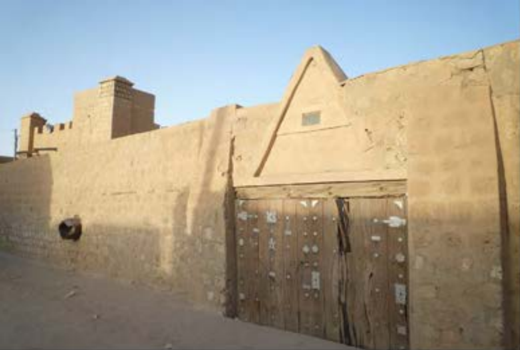
Sacred door of Sidi Yahia Mosque