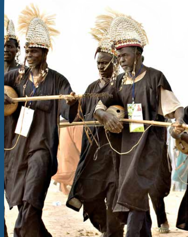
Cover: Nigeria

Strengthening capacities to safeguard intangible cultural heritage for sustainable development