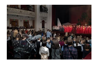
Performances in the framework of the international project «Children in opera»