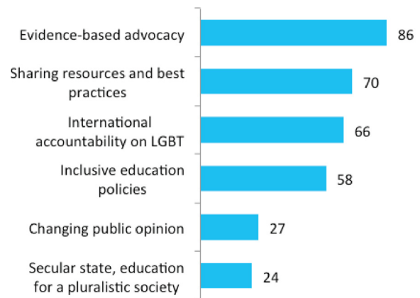
Figure 2: Where Would We Like to Be? (number of priority votes)

emerged as high priorities for the group: 1) Evidence-based advocacy; 2) Sharing resources and best practices; 3) International accountability on LGBT issues; and 4) Inclusive education policies. From this prioritization, it appears that there was consensus for the global network to focus work on and with educational institutions rather than on broader social problems, such as public opinion and state/religion.