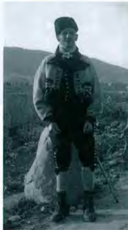
An old woman from Hallingdal wearing her every-day dress of traditional costume, and a man in his Sunday best from Telemark.

In this way folk costume regained their appeal, although with an altered form and different content. Theatre and dance performances with people wearing folk costumes came in fashion, exhibitions were arranged, and royals had themselves portrayed costumed in formal wear of the rural people. As a part of this interest, the clothes were modified to correspond with the taste and perceptions of the urban elite.