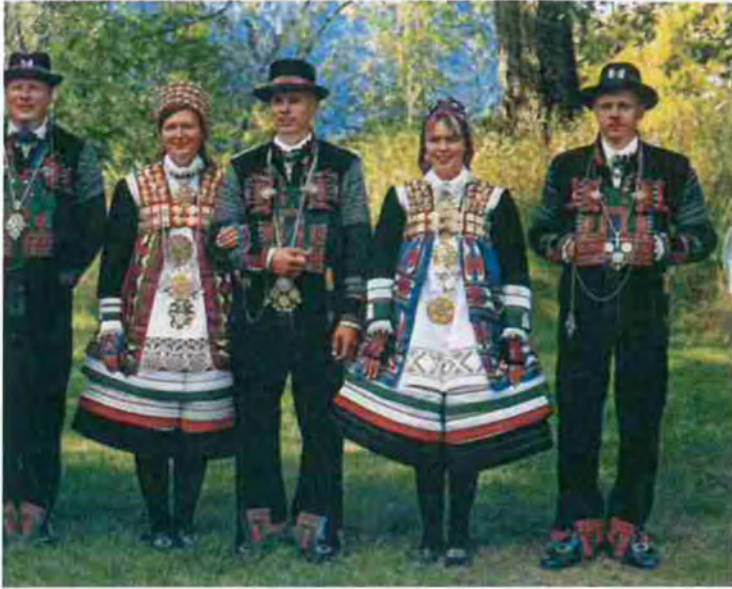
A bride and groom with their maid of honour, wearing traditional, ceremonial dress from Setesdal.