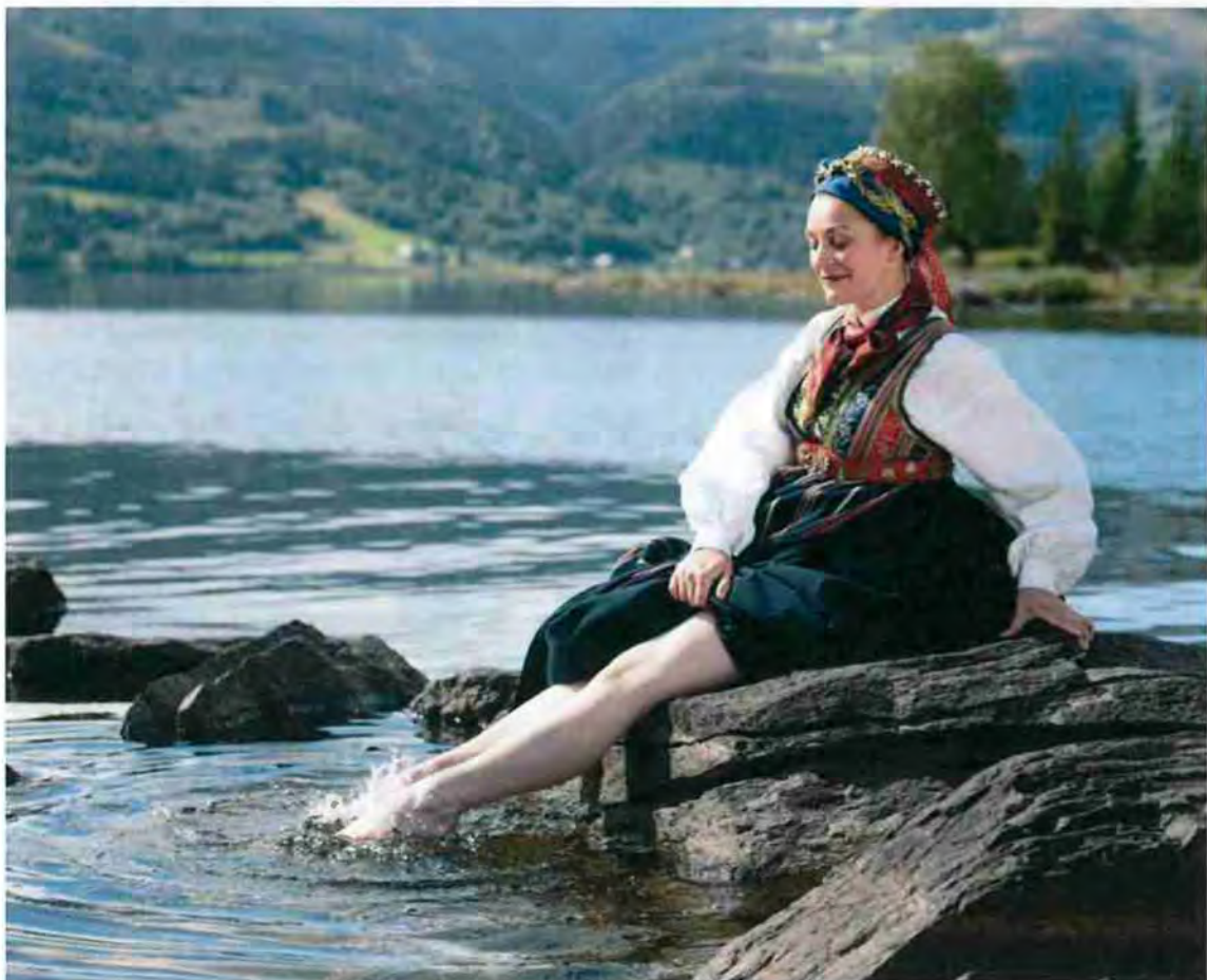
Woman in a reconstructed bunad from Valdres.