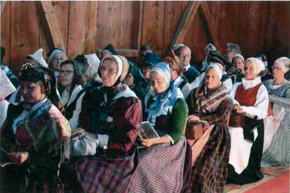
Nordic Costume Seminar in 2015, at mass in Reinli stave church.