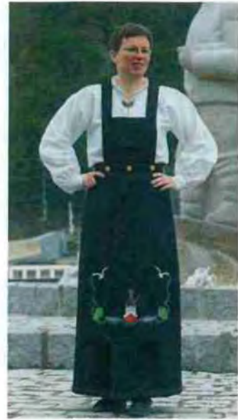
A modern interpretation of bunad, symbolizing coastal culture.