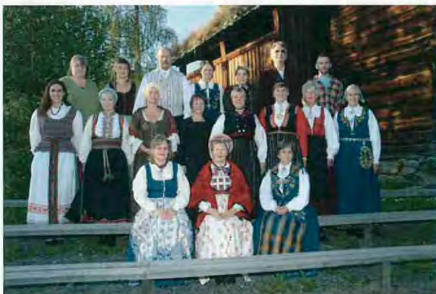
Students at "Costume and Society" classes in Valdres, 2006.

- NBF hosts the annual conference of bunad called "Fagdagane", every year in august, with four other NGO's. Last years conference had 140 participants, and aims to raise awareness and knowledge of traditional costumes and bunads.