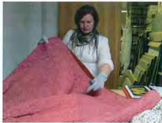
Fieldtrips: Documenting a wolf-skin winter coat in Hallingdal 2005 and a pink, quilted petticoat in Lofoten in 2011.