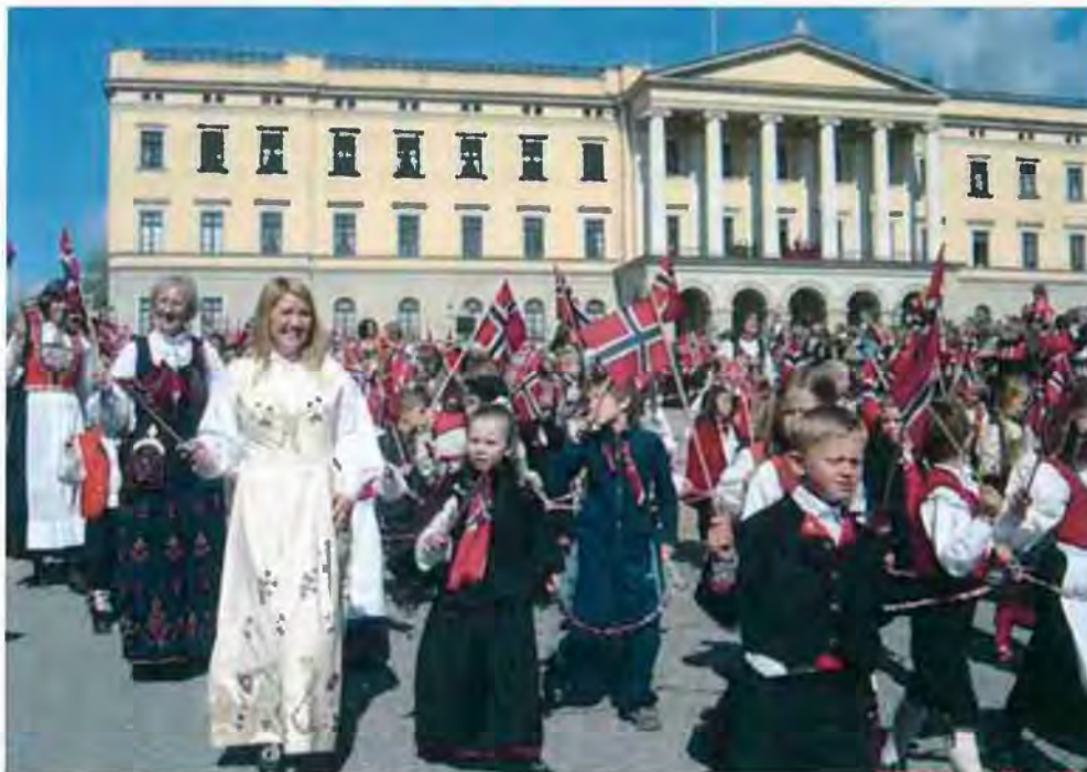
The children's parade in front of the Royal Palace in Oslo. 17 th of May.

Norwegians wear bunad at special occasions. Most commonly it is worn at public celebrations, like the National Day the 17 th of May, when people in bunads crowd the streets. Other occasions are family celebrations like weddings, the Christian confirmation, baptism and also funerals.