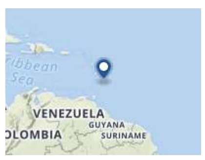
Data © OpenStreetMap Design © Mapbox

Population: 284,000 (2015) Youth population<sup>1</sup>: 36,000 (2015) Median population age: 38.5 (2015) Annual population growth (2010–2015)<sup>2</sup>: