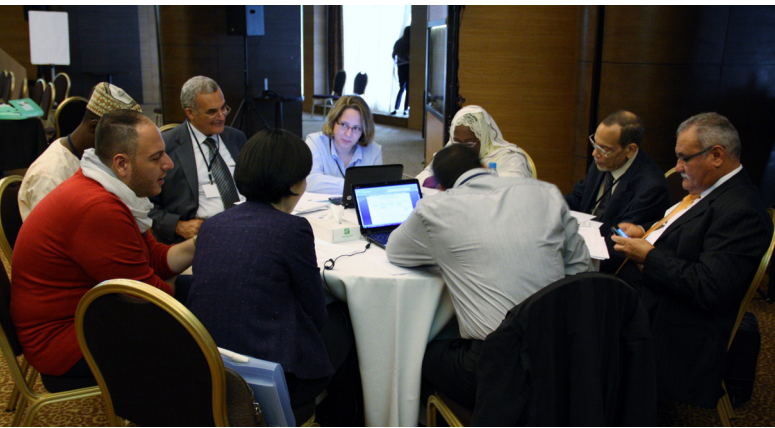
Participants during working group sessions

Working Group A: Iraq, Jordan, Lebanon, Syria, Yemen (Mashreq countries)