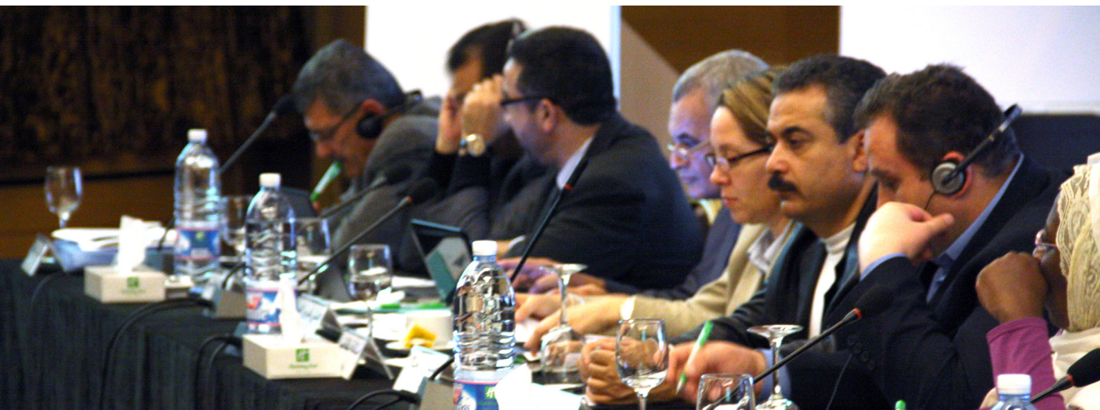
Participants during the discussion