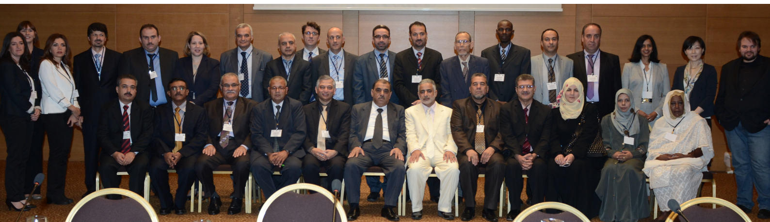
Participants of the Regional Expert Meeting

A group photo for the participants was taken at the end of the Opening of the Expert Meeting.