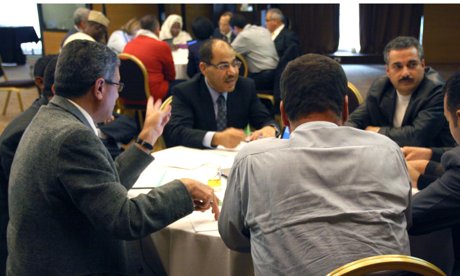
Participants during working group sessions

Twenty-five promising practices on TVET and EPE were received from coordinators and experts in UNEVOC centres in the Arab region. The Organizing Committee reviewed these promising practices during the development of the programme. A Synthesis Report on the Promising Practices will be prepared to facilitate more effort and cooperation within the UNEVOC Network on the work plans for 2014–15.