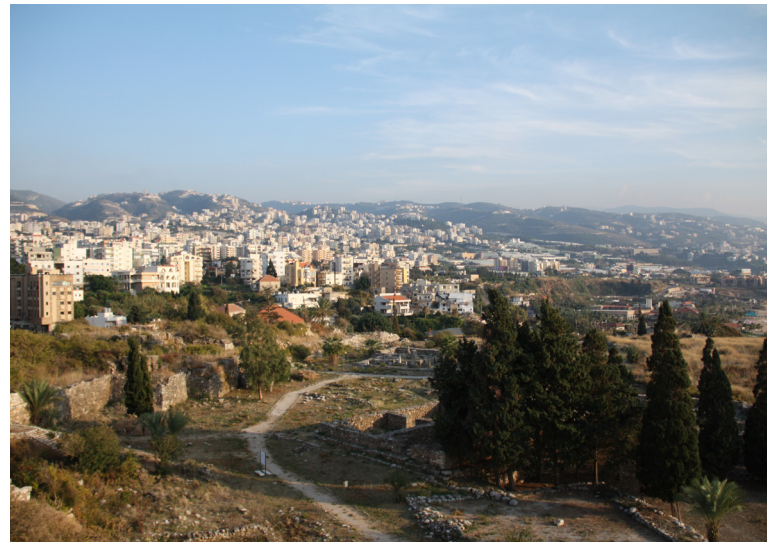
Byblos Historical Citadel