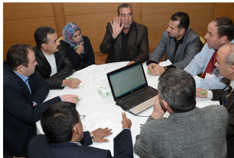
Participants during working group sessions

Qualification requirements for TVET teachers in Arab countries should correspond to real needs, and teachers in entrepreneurship should receive enough practical training. At present, the requirements focus