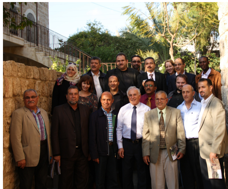
Participants during study visit at the ICHS Byblos