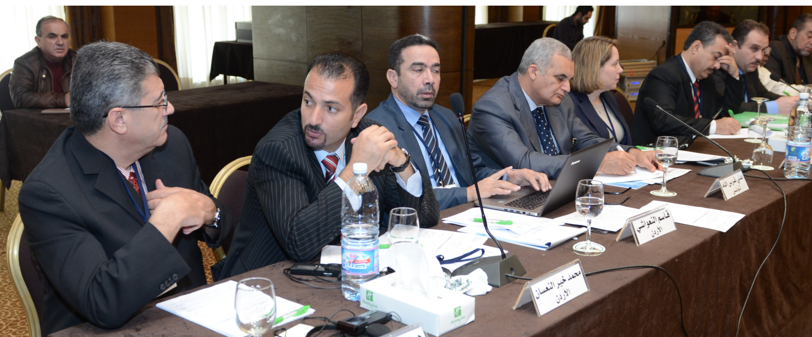
Participants during discussion round