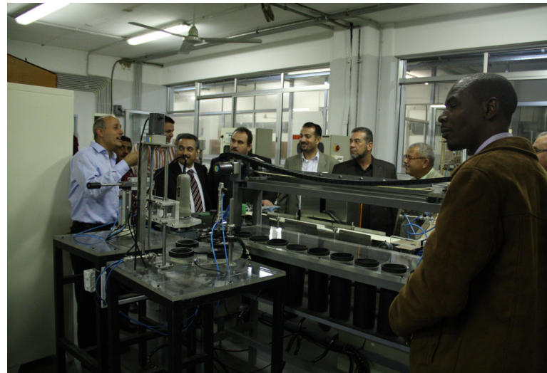
Study visit to the Higher Industrial Technical Institute in Dekwaneh