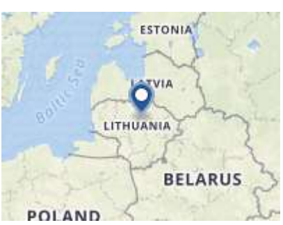
Data © OpenStreetMap Design © Mapbox

2,878,000 (2015) 367,000 (2015) 43.1 (2015) -1.63%