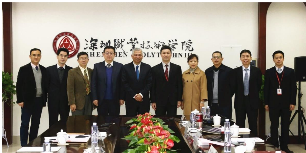
(Group photo of hosts and the visitor.)