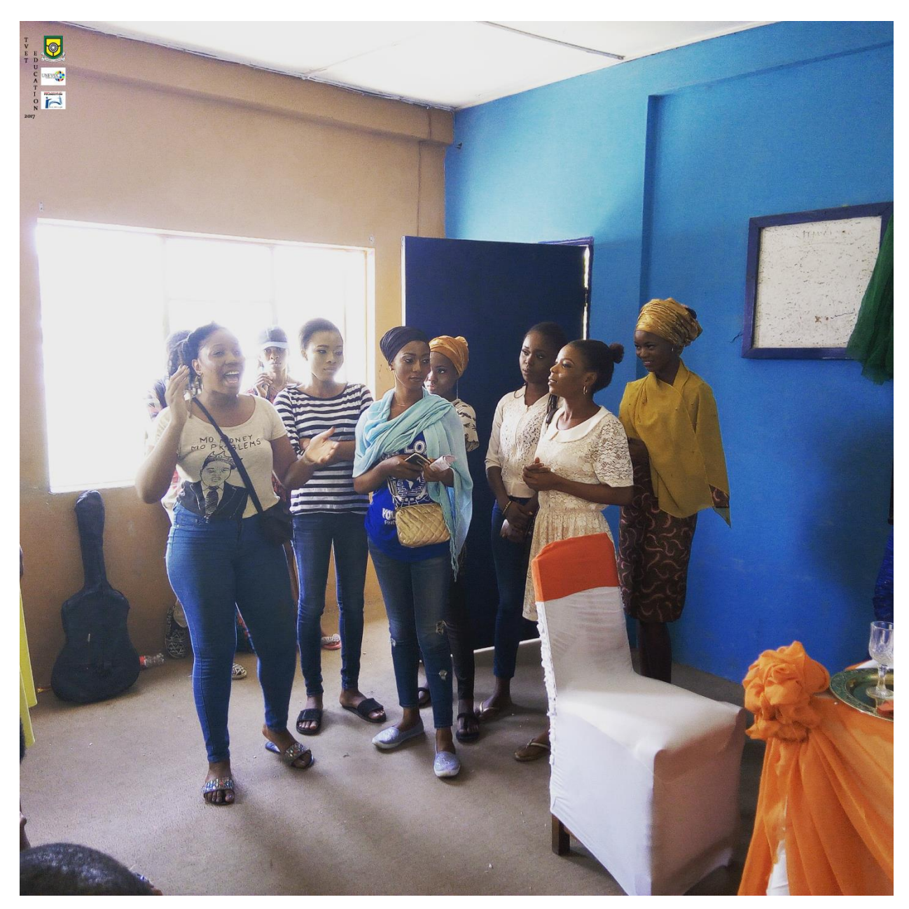
Pix – Make-up Artist/Modelling students sharing experiences