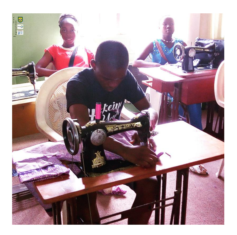
Pix – Students taking classes on dress making – styles, machine sewing