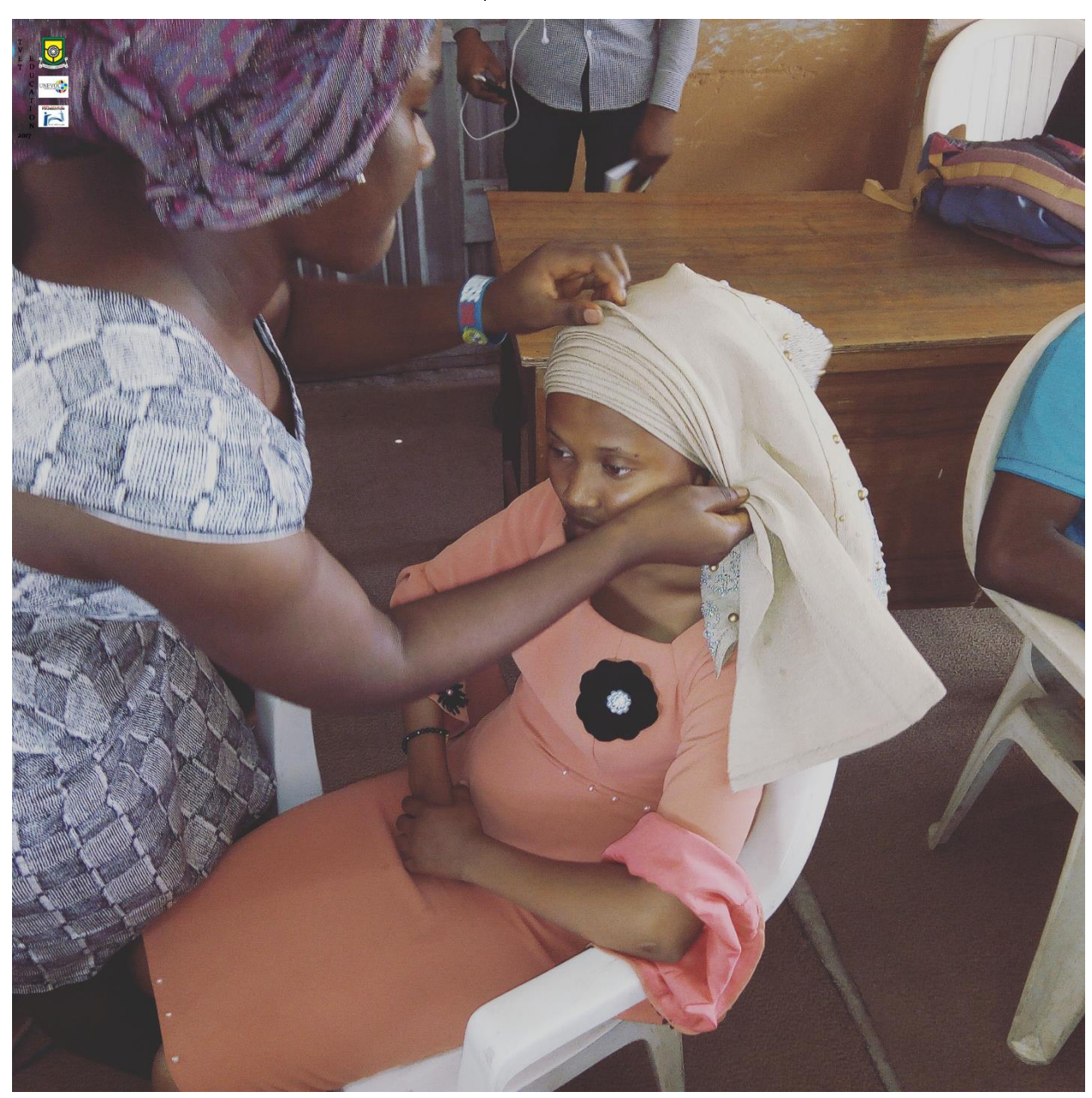
Pix – Head Gear/Gele Tying - students practising