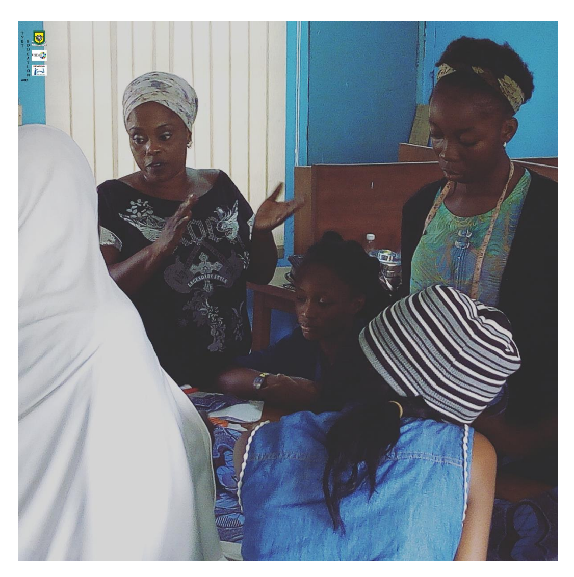
Pix – Students taking a class on dress making – measuring, cutting

The dress making class had both female and male students who were eager to engage their facilitators. The class started with the basics of dress making and gradually students were introduced to how to sew using machines. The leading facilitator educate the students on the marketability of a career on the line of both the textile and fashion industries while encouraging them. She thoroughly explained each rudiment involved in dress making till the students are well taught. Students classes start early in the morning 9 a.m. and lasted till 4 p.m. each day on both theories and practicals.