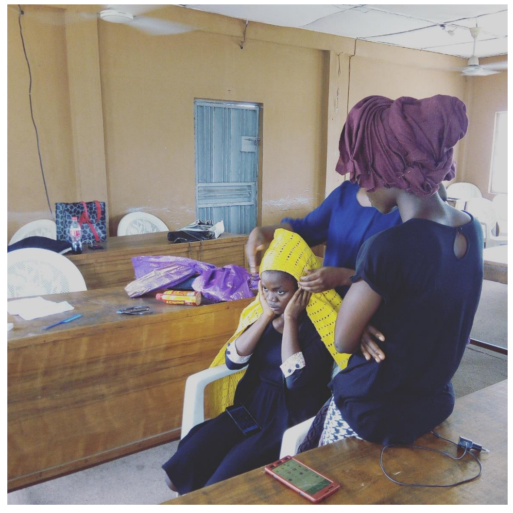
Pix – Head Gear/Gele Tying students training session