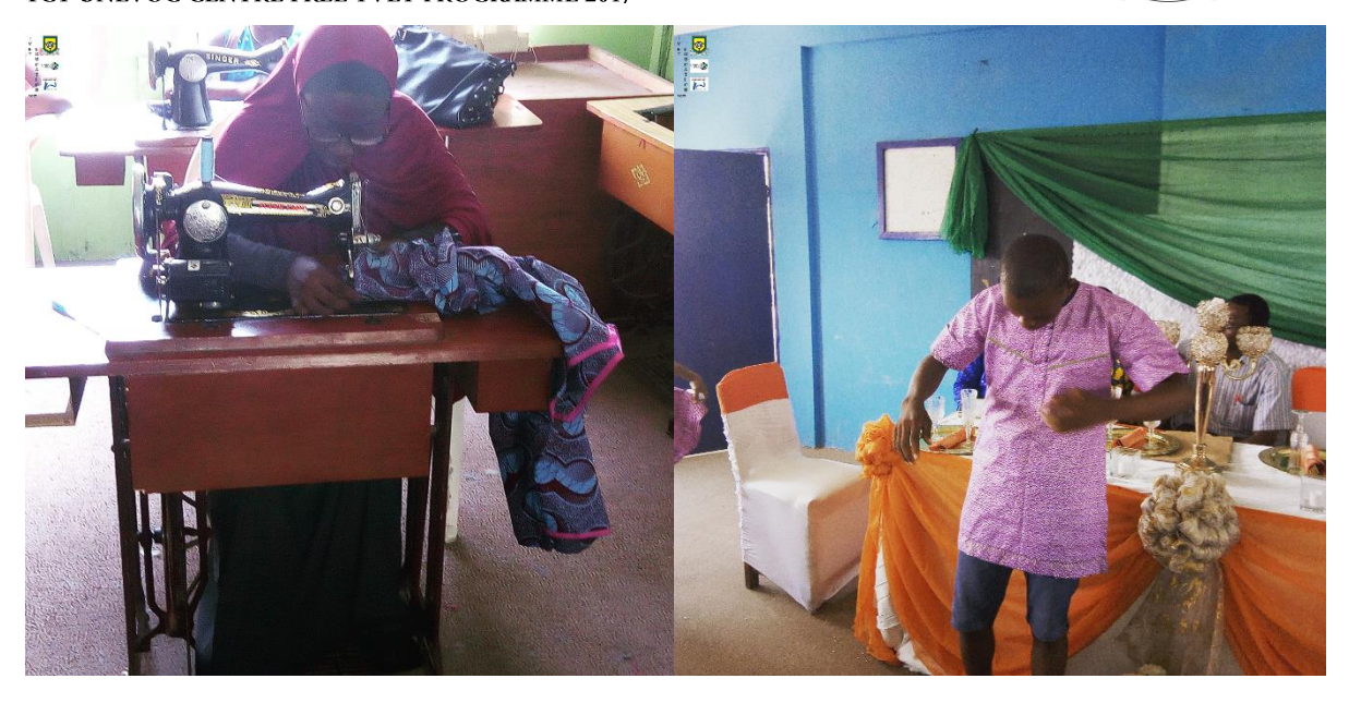
Pix – Sewing session and a finish product on display