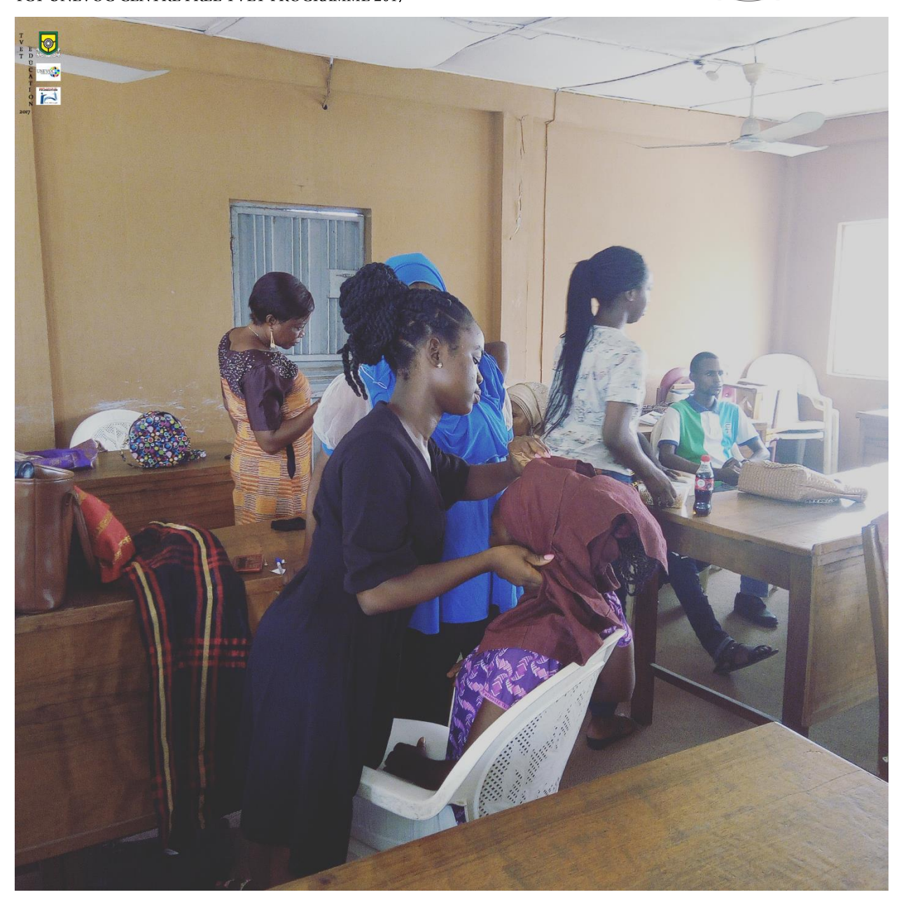
Pix – Head Gear/Gele Tying students training session