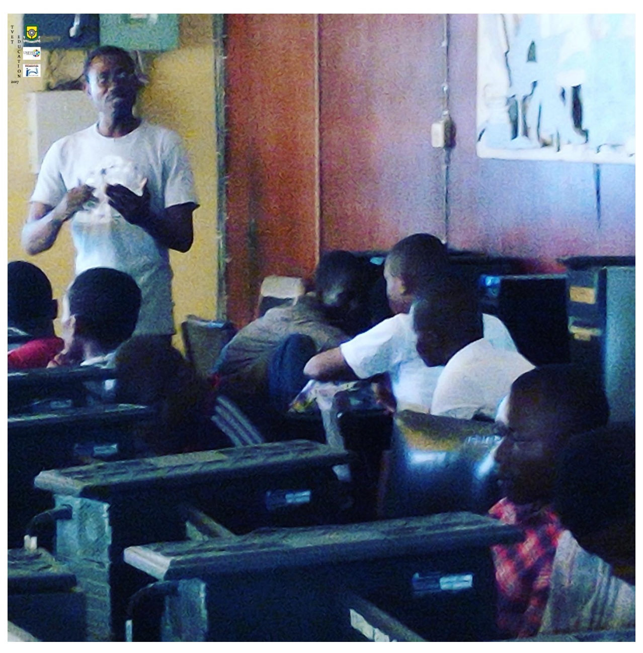
Pix – Web development - students' training session

The web development class had on board a seasoned facilitator whose years of experience endeared the teeming students and their passion to learn all it takes to be a programmer who can on its own manage the tools of the trade – HTML, CSS and Javascript to create websites and web applications. The web development class offers a unique opportunity for the students who wish to go along the career line in IT. The students were well taught and also provided with a well-equipped computer lab.