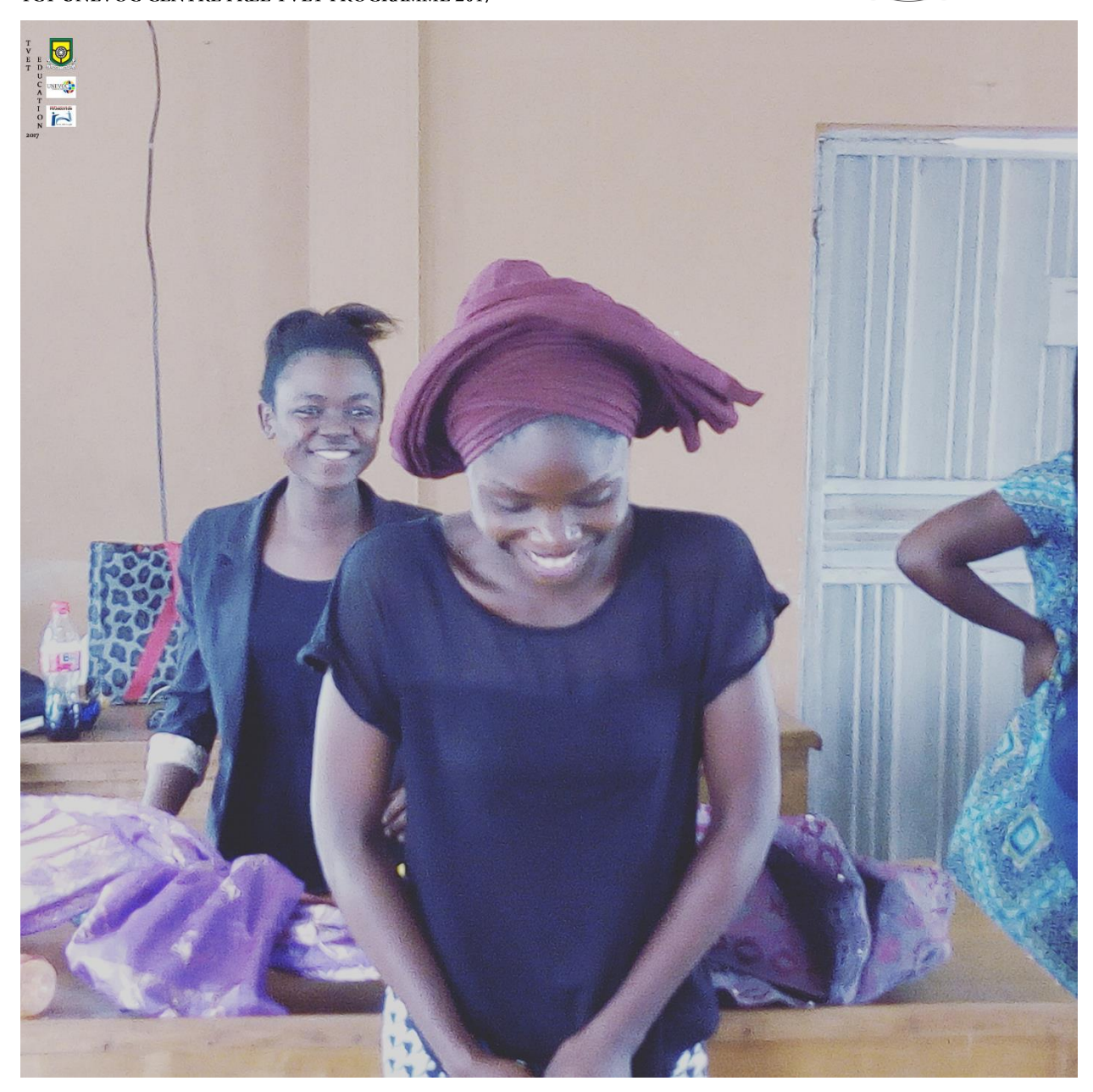
Pix – Head Gear/Gele Tying – a completed job