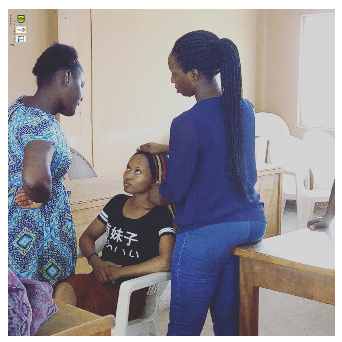
Pix – Head Gear/Gele Tying students training session