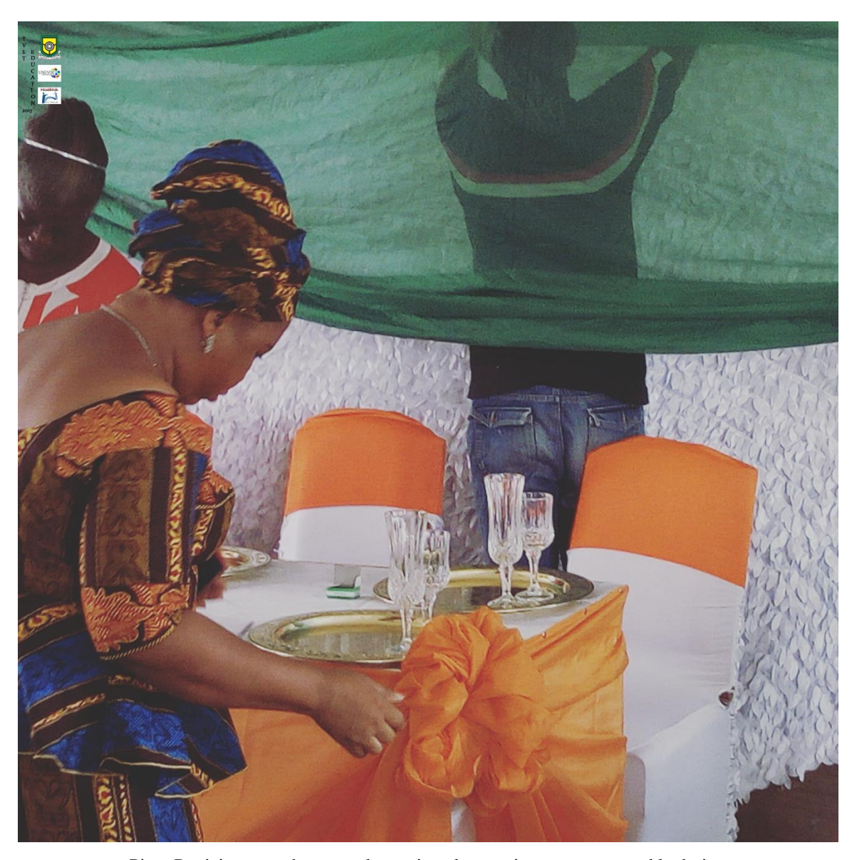
Pix – Participants at the event decoration class setting up an event table design