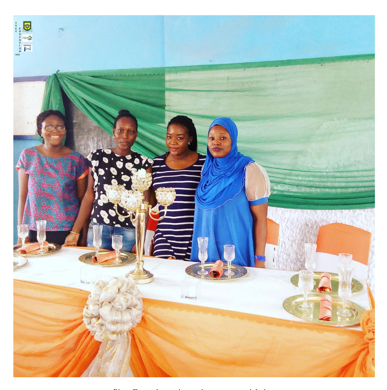
Pix – Event decoration assignment – partial view