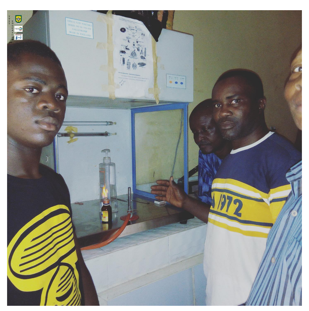
Pix – Mushroom production - students' practical session

Mushrooms are both medicinal and edible. The production and demand are on the high side. With seasoned facilitators and well equipped laboratory the students for mushrooms production classes were taught on how to produce and manage a mushroom farm.