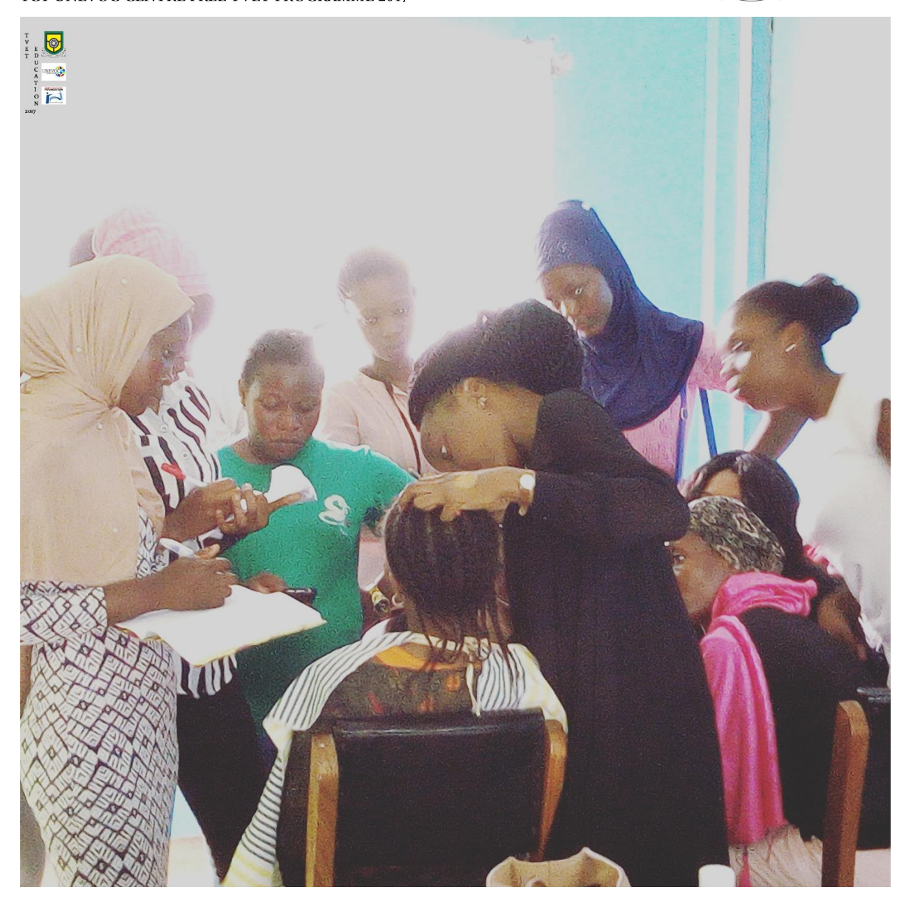
Pix – Make-up Artist students' session