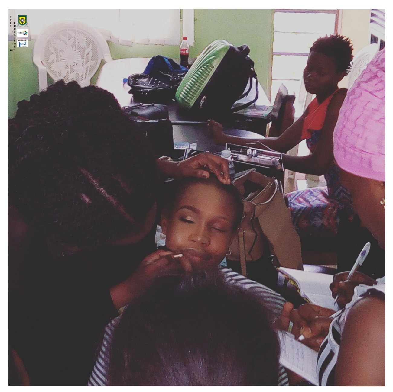
Pix – Make-up Artist Class training session

The students at the Make-up Artist class made a number of points just like the ones made at the Dress Making class. It was made known by both groups that the cost required for such opportune training is very high at private centres. This is another unique class with lots of students just like other trainings. The facilitators put the students on practical classes and also network them with leading industry experts. The marketability and demand on the Make-up Artist and Modelling career paths continue to rise.