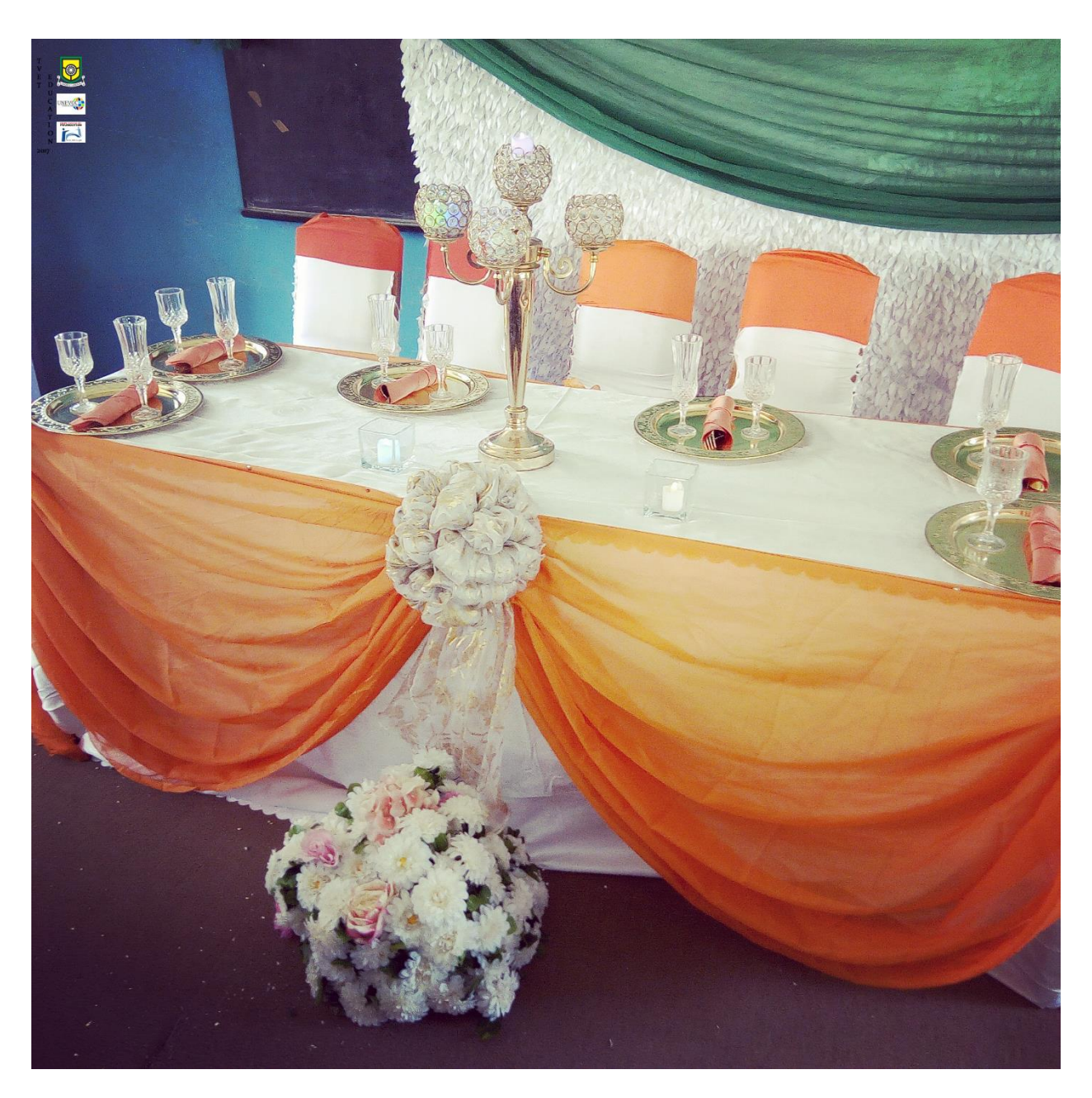
Pix – Event decoration assignment – complete view