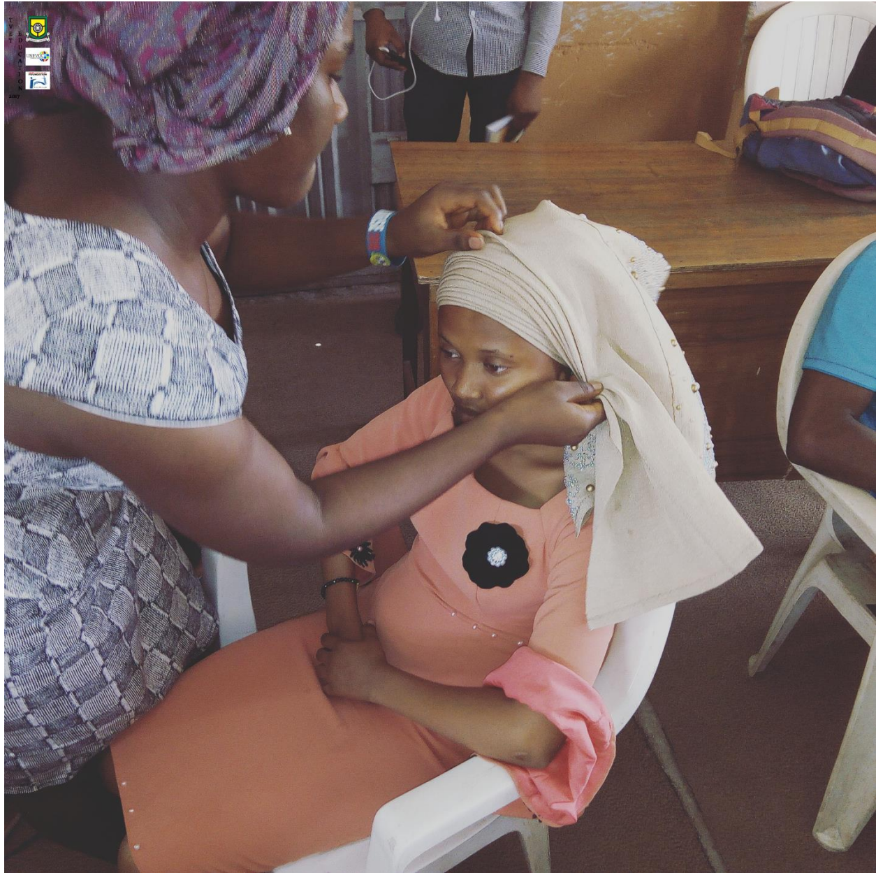
Pix – Head Gear/Gele Tying - students practising