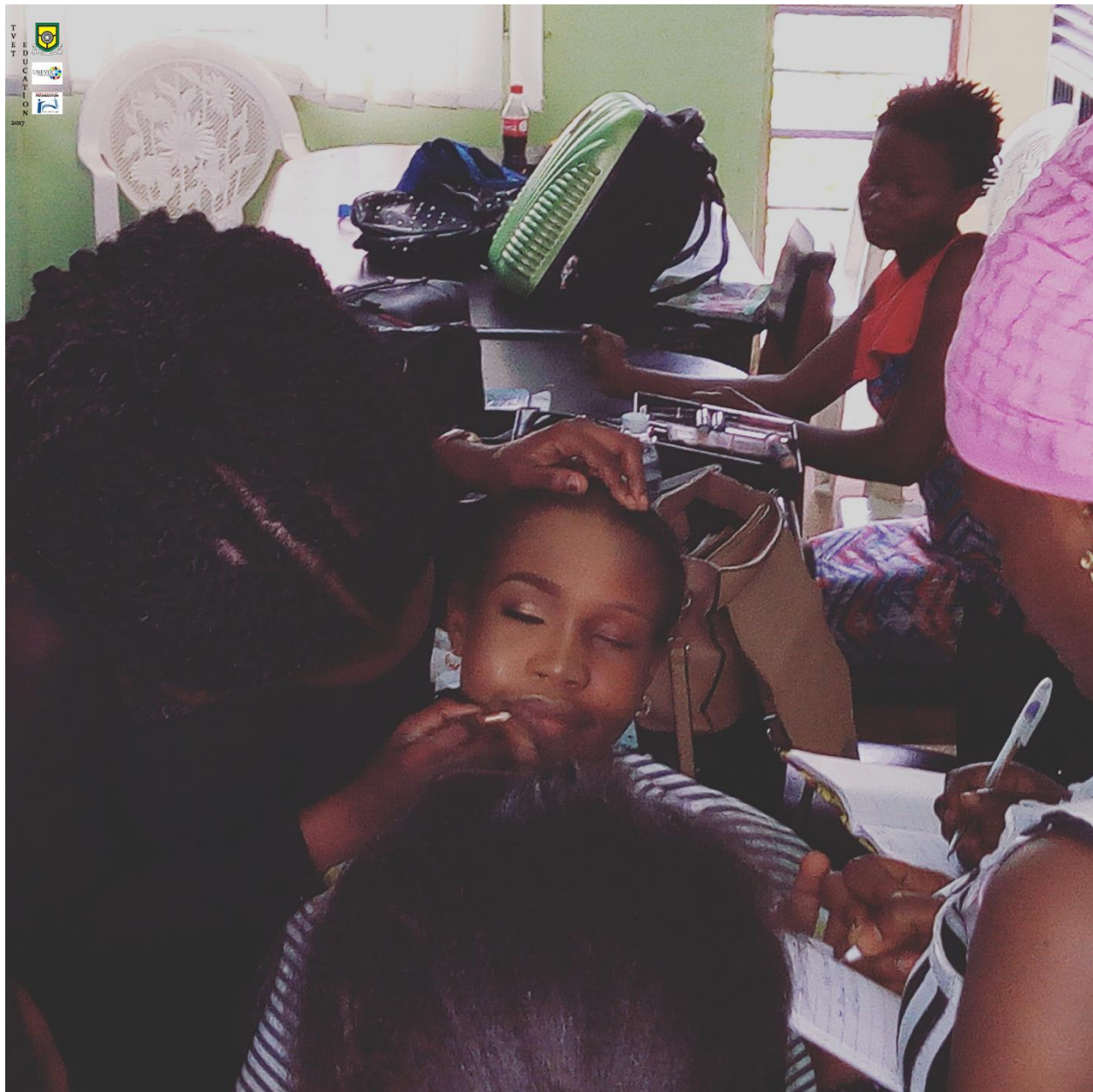
Pix – Make-up Artist Class training session

The students at the Make-up Artist class made a number of points just like the ones made at the Dress Making class. It was made known by both groups that the cost required for such opportune training is very high at private centres. This is another unique class with lots of students just like other trainings. The facilitators put the students on practical classes and also network them with leading industry experts. The marketability and demand on the Make-up Artist and Modelling career paths continue to rise.