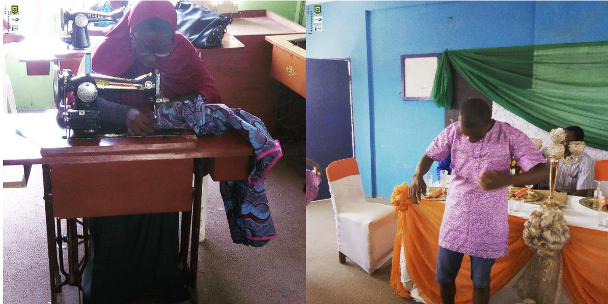
Pix – Sewing session and a finish product on display