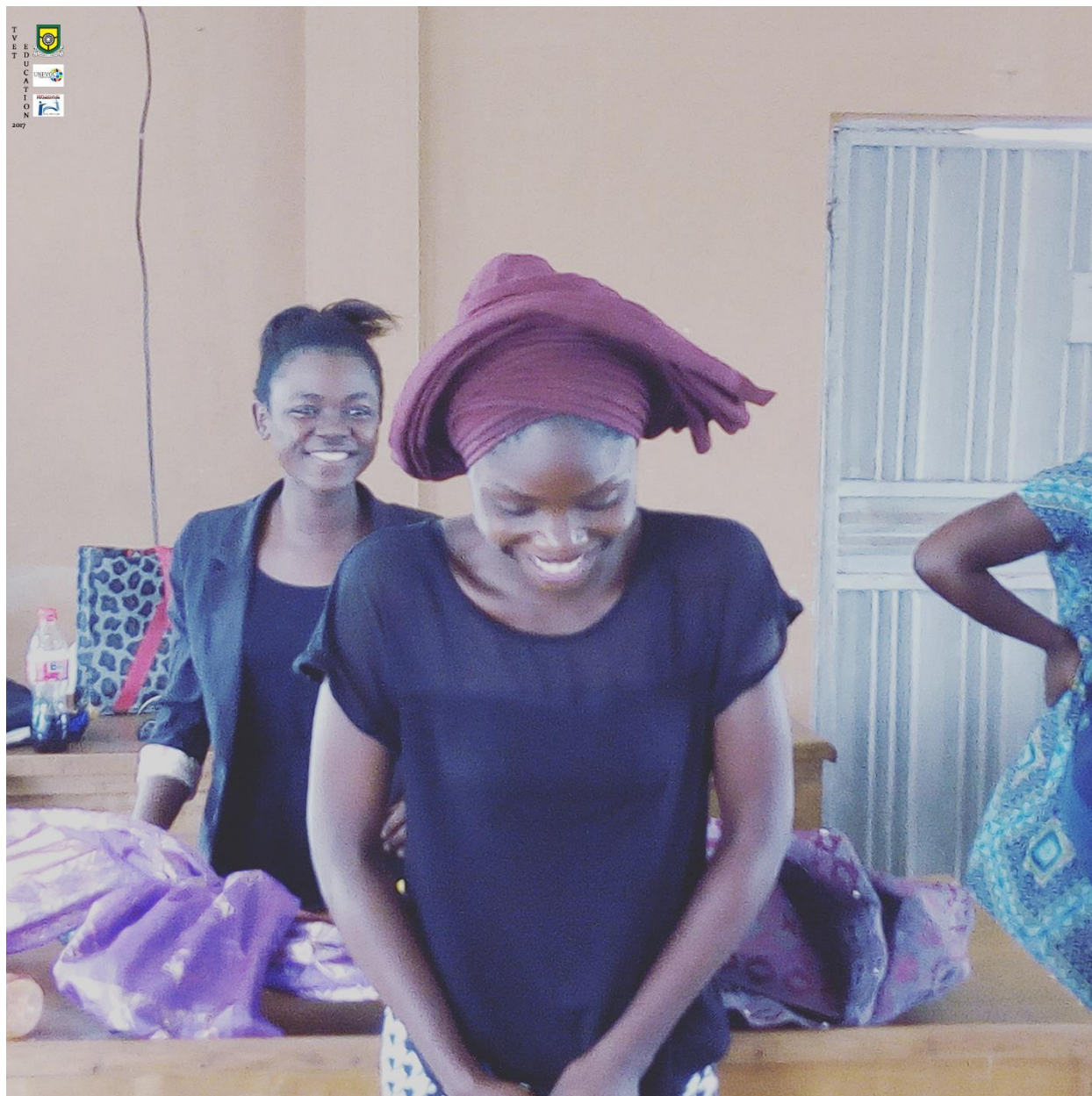
Pix – Head Gear/Gele Tying – a completed job