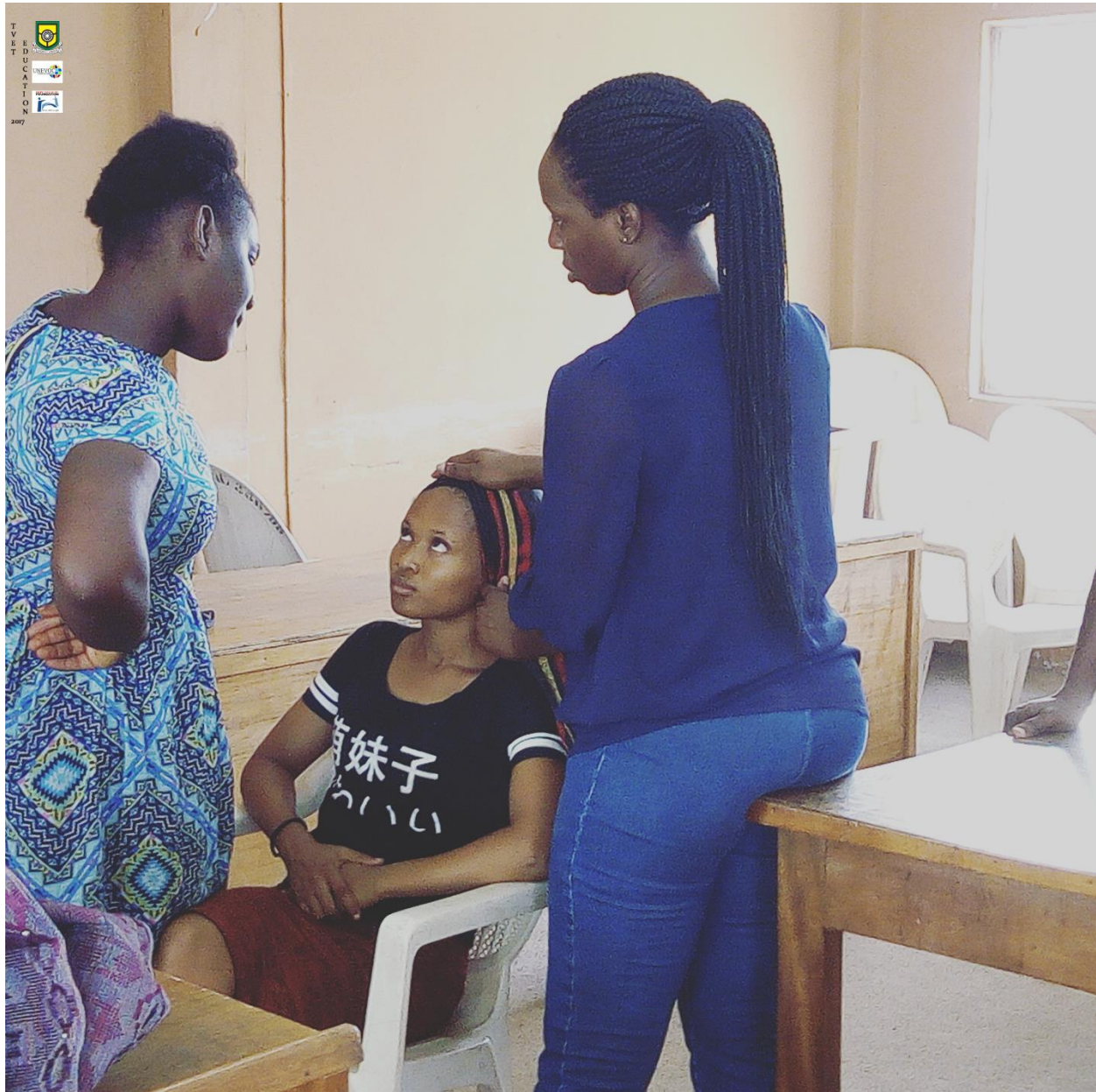
Pix – Head Gear/Gele Tying students training session