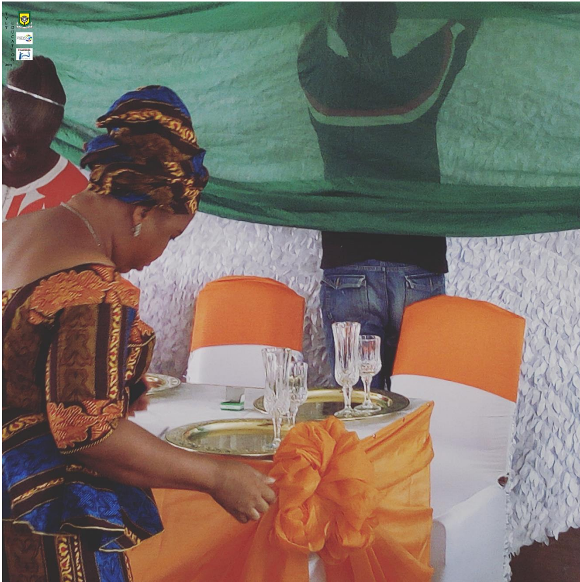
Pix – Participants at the event decoration class setting up an event table design