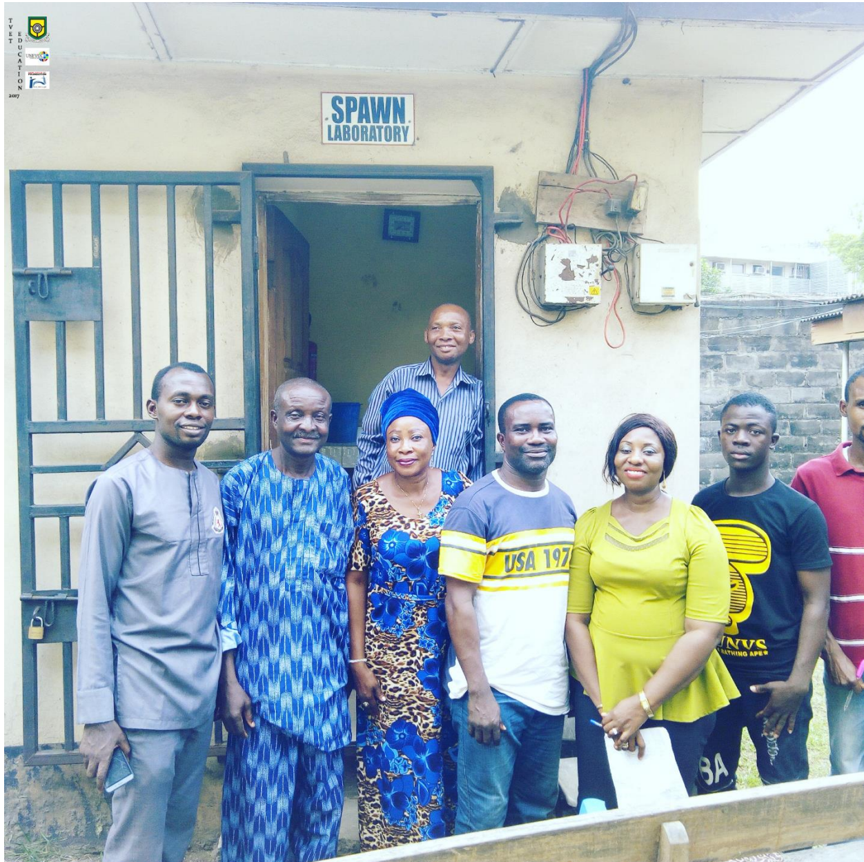
Pix – Mushroom production - students' training session