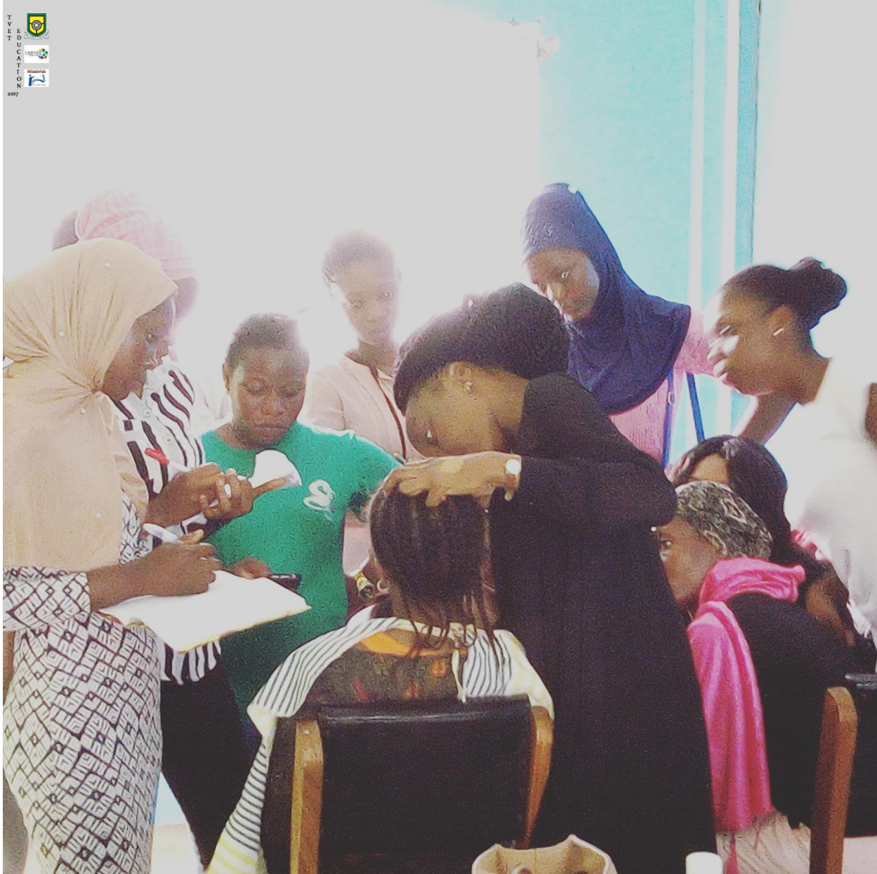
Pix – Make-up Artist students' session