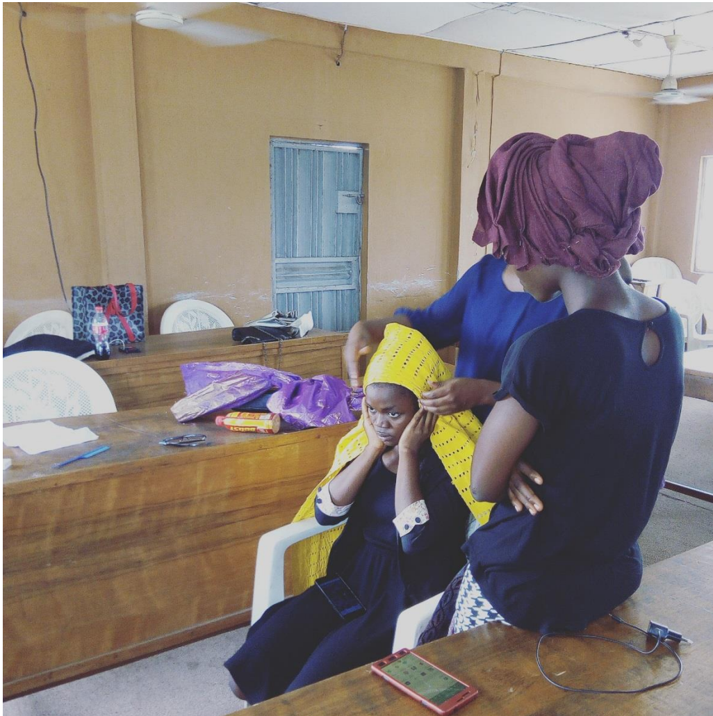
Pix – Head Gear/Gele Tying students training session