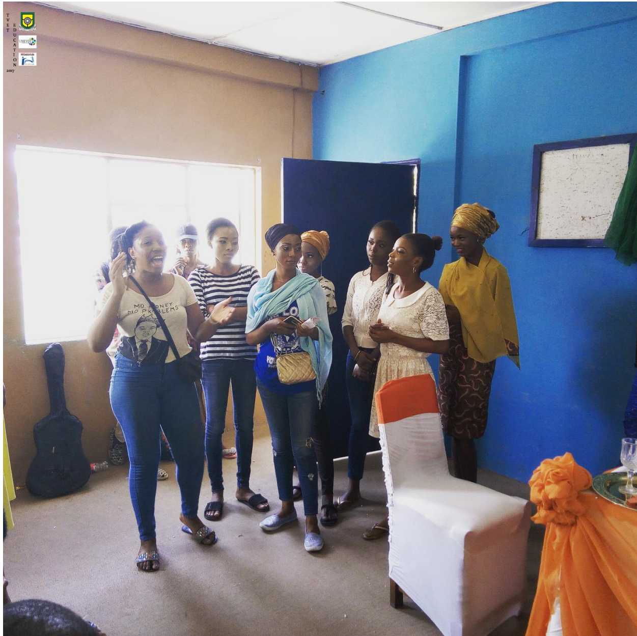
Pix – Make-up Artist/Modelling students sharing experiences