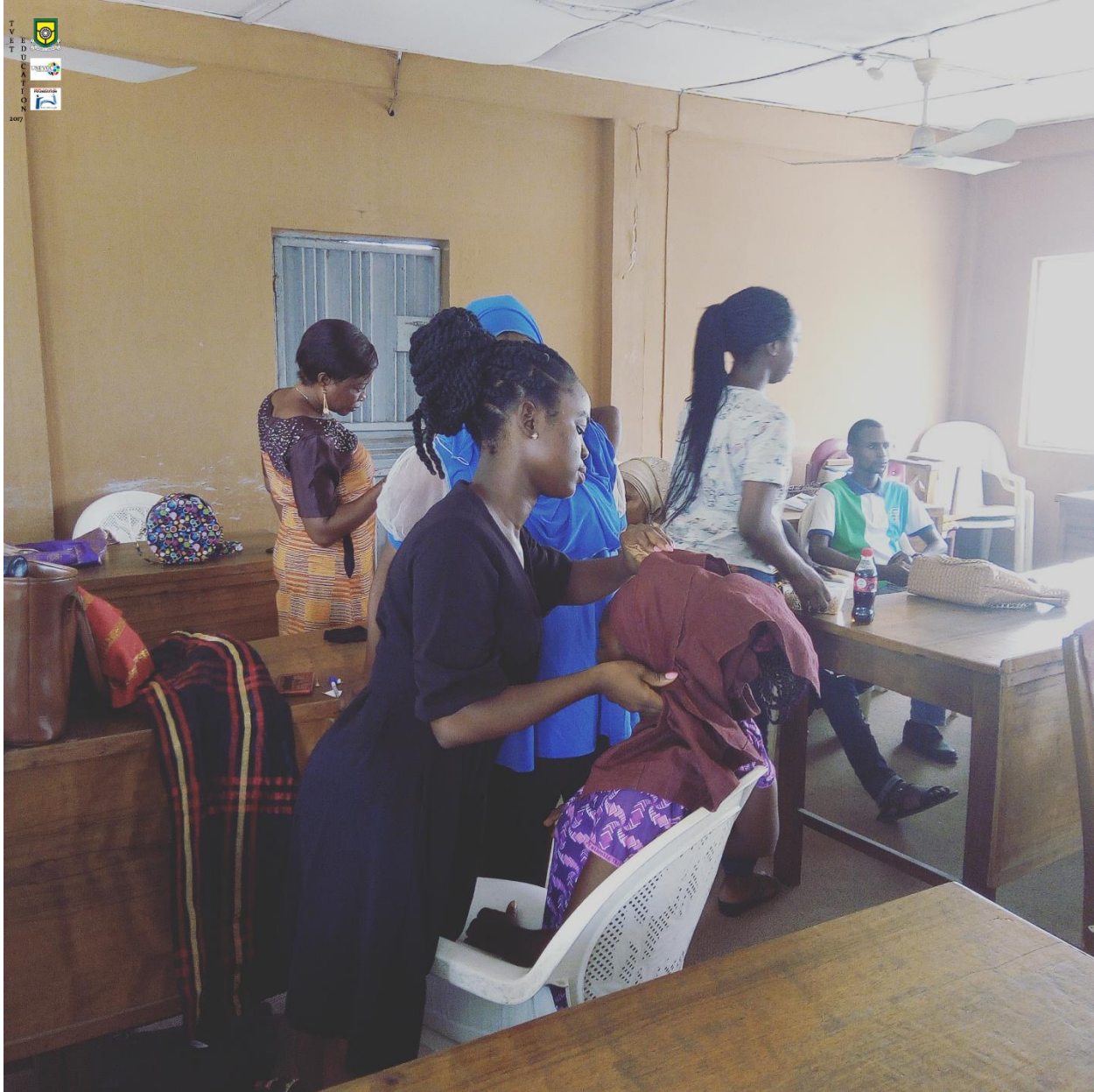
Pix – Head Gear/Gele Tying students training session