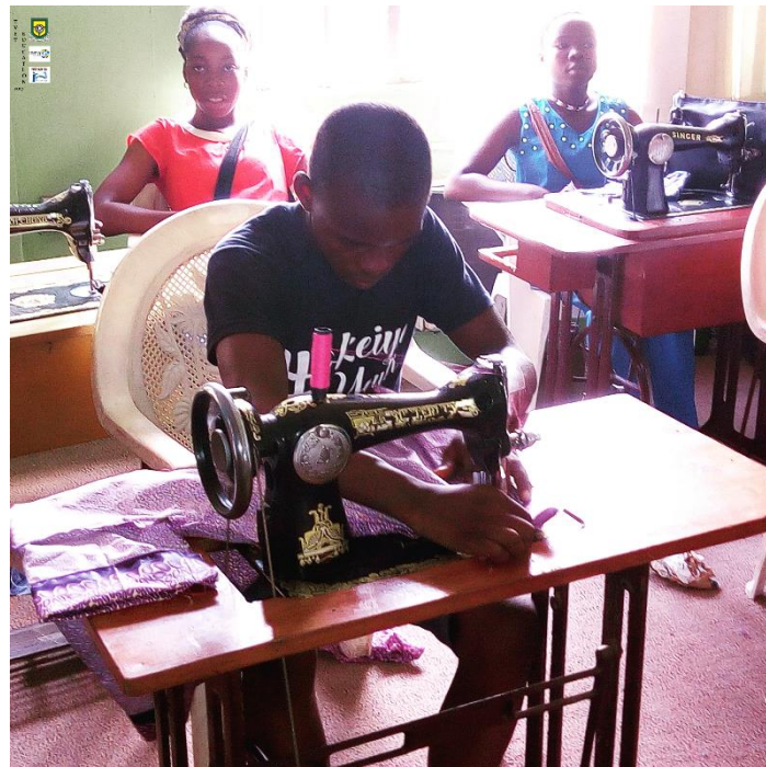
Pix – Students taking classes on dress making – styles, machine sewing