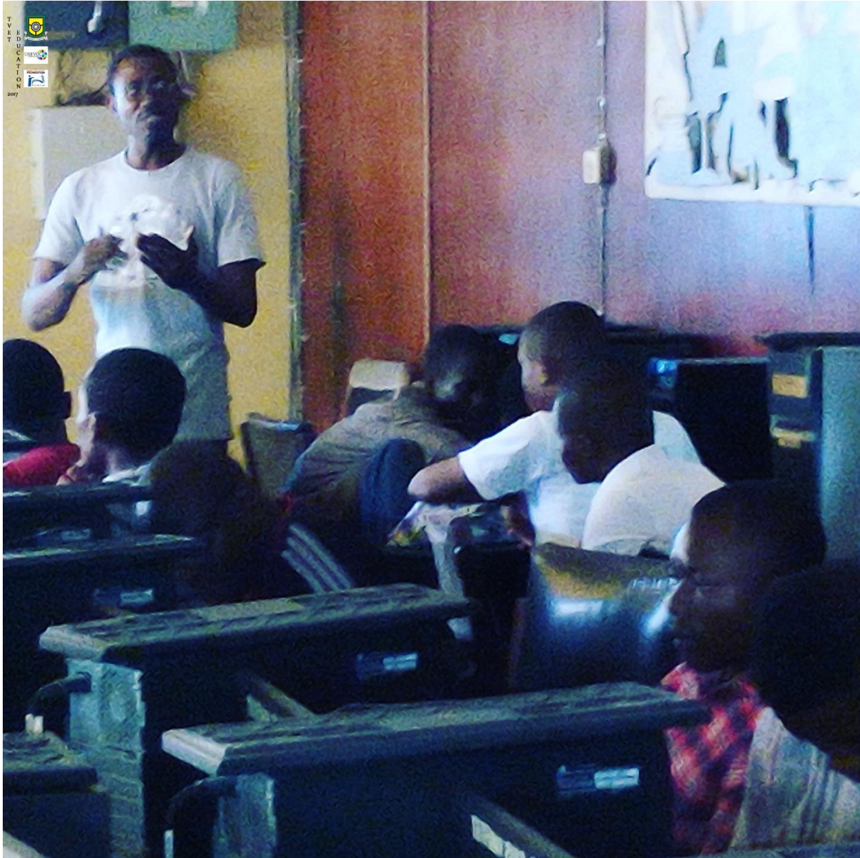
Pix – Web development - students' training session

The web development class had on board a seasoned facilitator whose years of experience endeared the teeming students and their passion to learn all it takes to be a programmer who can on its own manage the tools of the trade – HTML, CSS and Javascript to create websites and web applications. The web development class offers a unique opportunity for the students who wish to go along the career line in IT. The students were well taught and also provided with a well-equipped computer lab.