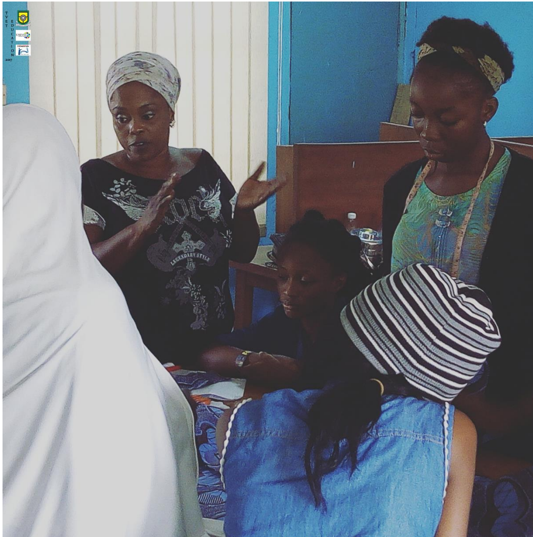
Pix – Students taking a class on dress making – measuring, cutting

The dress making class had both female and male students who were eager to engage their facilitators. The class started with the basics of dress making and gradually students were introduced to how to sew using machines. The leading facilitator educate the students on the marketability of a career on the line of both the textile and fashion industries while encouraging them. She thoroughly explained each rudiment involved in dress making till the students are well taught. Students classes start early in the morning 9 a.m. and lasted till 4 p.m. each day on both theories and practicals.