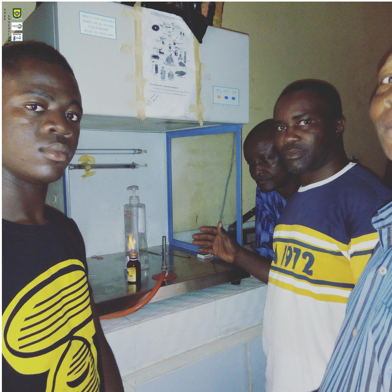
Pix – Mushroom production - students' practical session

Mushrooms are both medicinal and edible. The production and demand are on the high side. With seasoned facilitators and well equipped laboratory the students for mushrooms production classes were taught on how to produce and manage a mushroom farm.