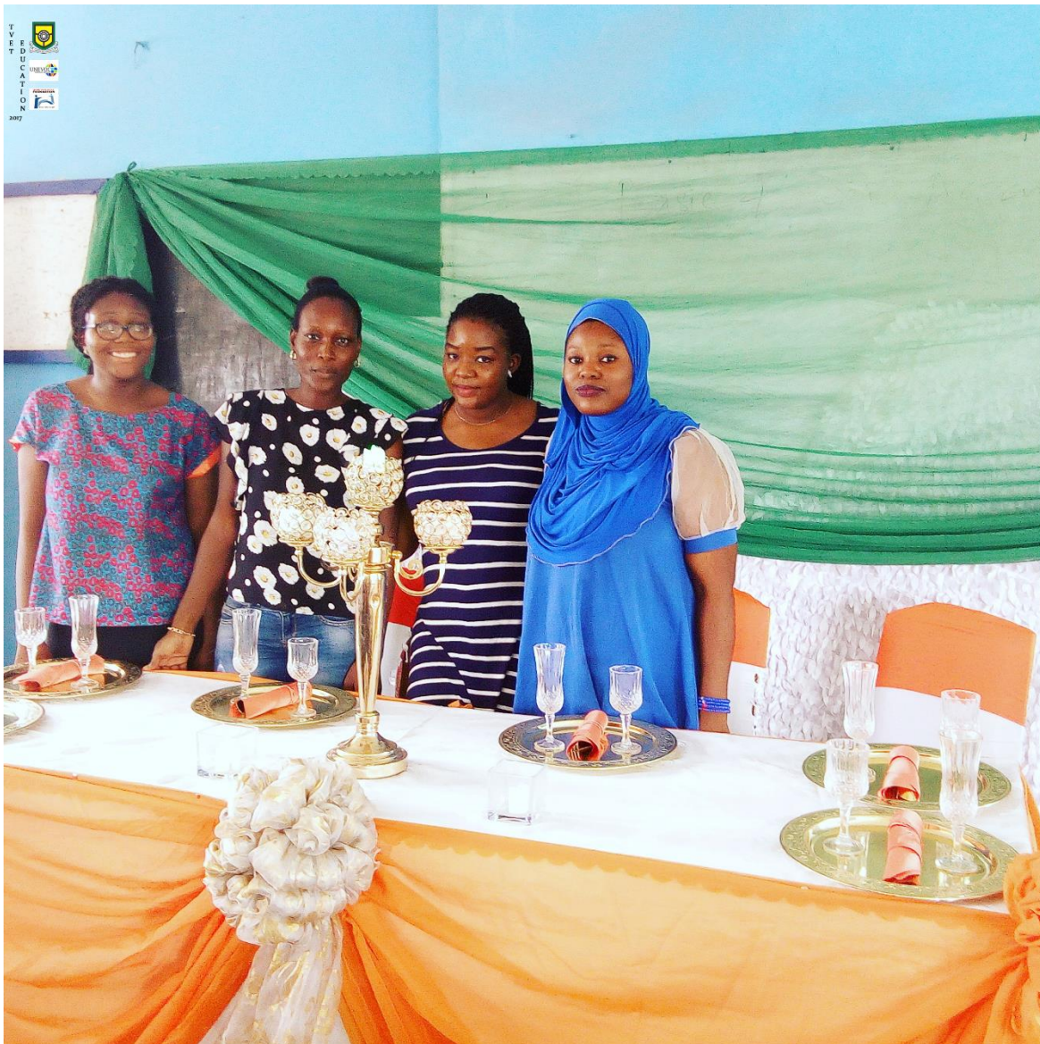
Pix – Event decoration assignment – partial view