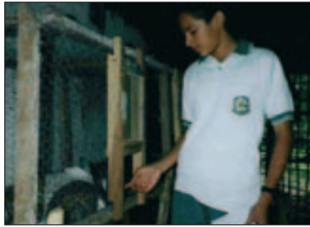
A vocational programme in a secondary school in northern Colombia, which involves raising rabbits

TVET teachers should discuss these various interpretations of sustainable development with their students. Even when a group comes to a semblance of consensus on a working definition of sustainable develop-