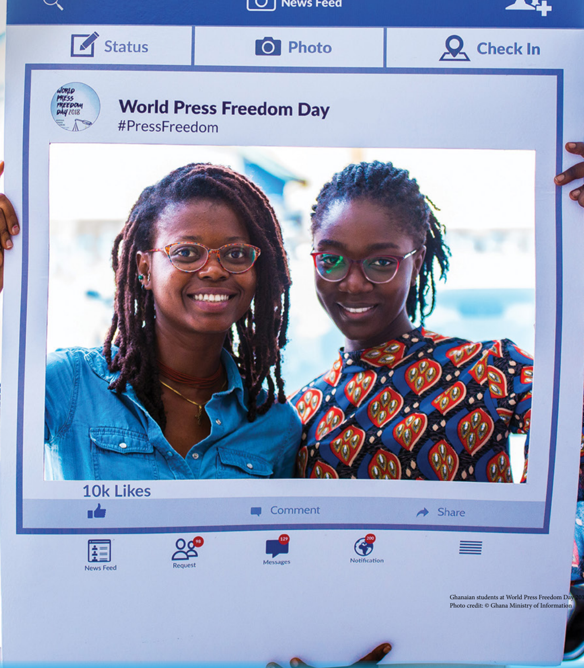
Ghanaian students at World Press Freedom Day 2018 Accra, Ghana.