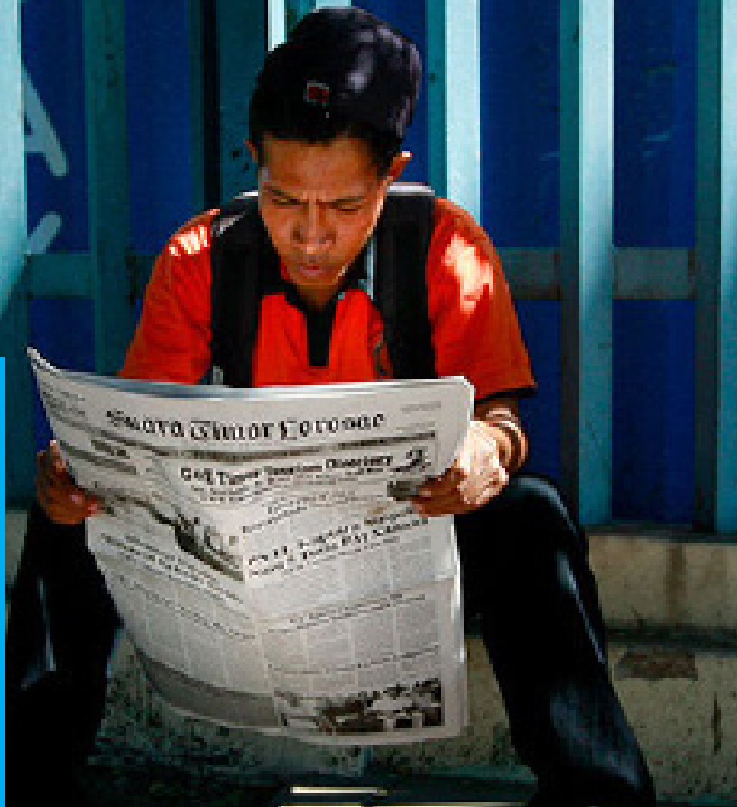
Young man reading newspaper in Dili, Timor-Leste.

UNESCO's mandate to promote the free flow of ideas