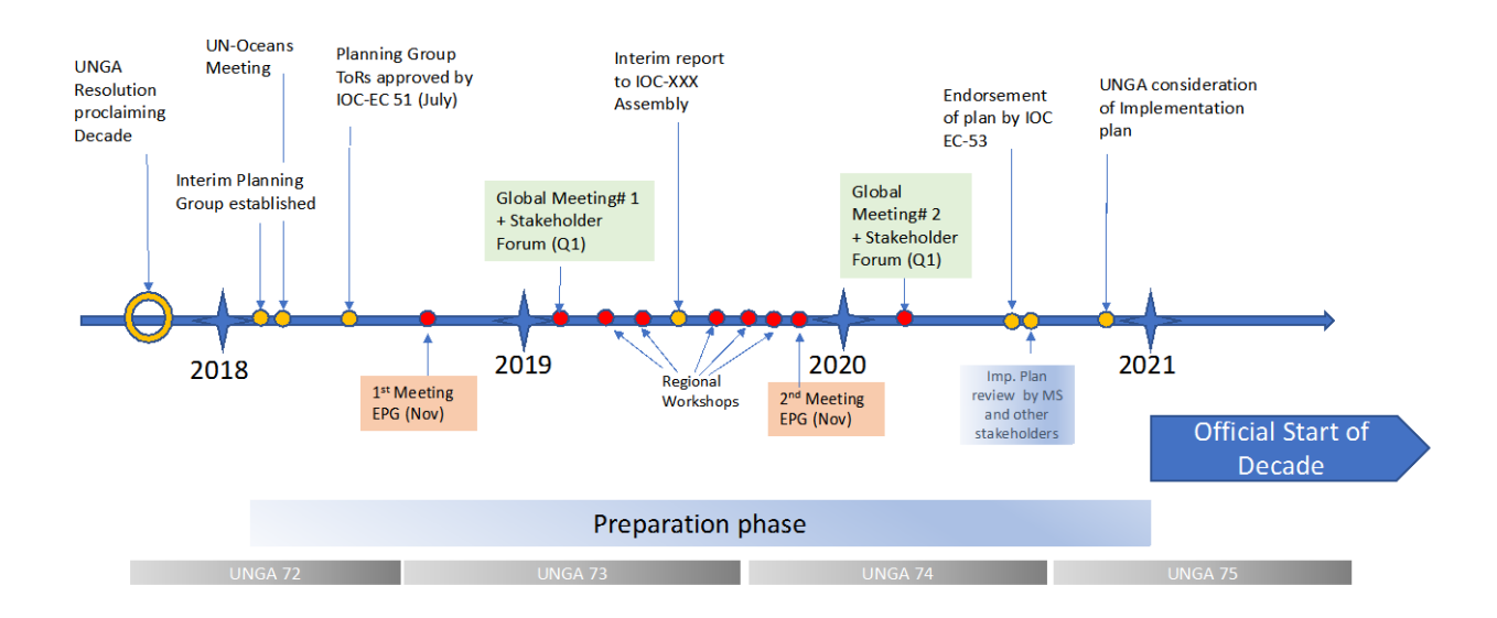
Figure 1. Key steps for the Preparation Phase

Figure 1 shows schematically the different high-level activities and milestones in the development of an Implementation Plan and establishment of the Decade. The governing body meetings of the IOC are critical since the UN has given IOC the lead responsibility for preparing the Implementation Plan. The Implementation Plan is likely to include a Science Plan (and project Research Plans), an Engagement and Communication Plan, a Resource/business Plan, and a Capacity Development, Training and Education Plan.