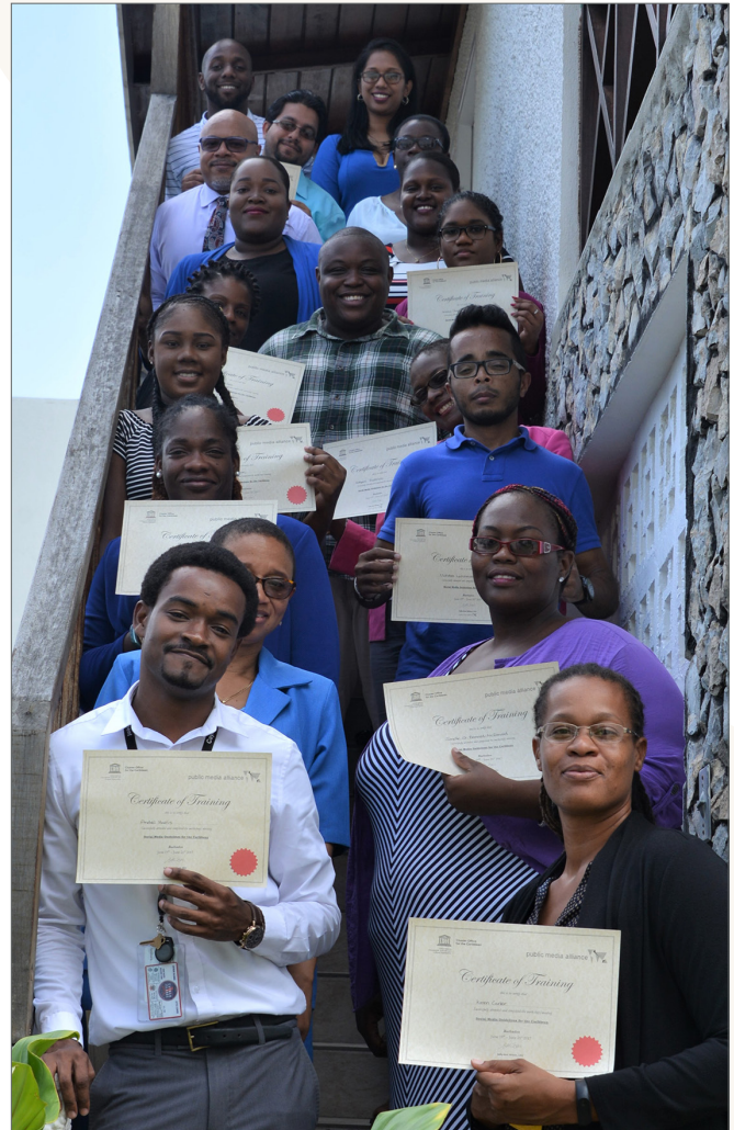
Right: Regional contributors to the Social Media Guidelines Handbook.