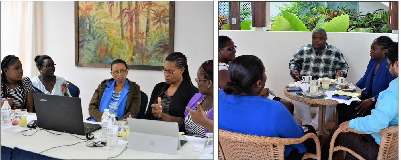
Above left & right: Collaboration from across the Caribbean was essential to making this guide.

Be prepared. Agree a company strategy and stick to it. Never take down a post - instead apologise or amend with edits shown if there is a long period of time after the post has been published. Trust is essential and corrections are a powerful tool to reinforce how accountable and transparent your media organisation is.