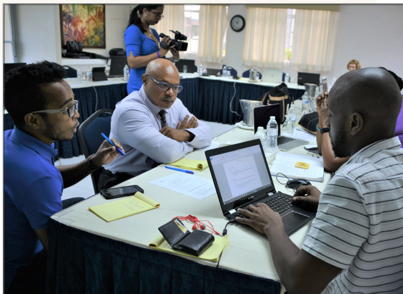
Above: Contributors developing guidelines in Barbados

Many staff at your organisation may have a public profile. It is therefore unwise to think that a staff member can post in a private capacity without the public believing that the post represents the organisation. You should be extremely cautious about what you post because seemingly innocuous comments can be taken out of context, become amplified and cause reputational damage to the organisation. If you have any questions about whether you can publish information, a point of view, media or any other content check with the management team first.