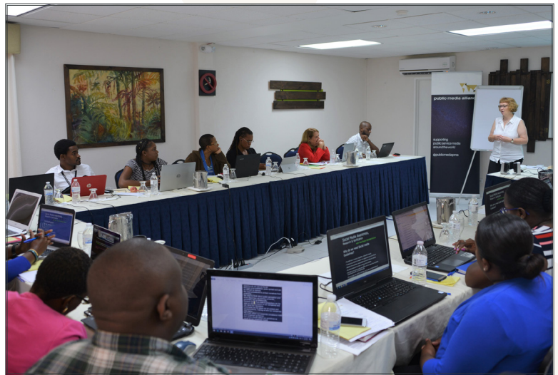
Above: Regular training is essential to ensure best social media practice amongst media professionals.

Social media is evolving and changing fast. Training should be updated on a quarterly basis to reflect the rapid changes taking place in the social media world. Post disaster and trauma coverage - social media staff may need counselling as they may have viewed graphic material unsuitable for