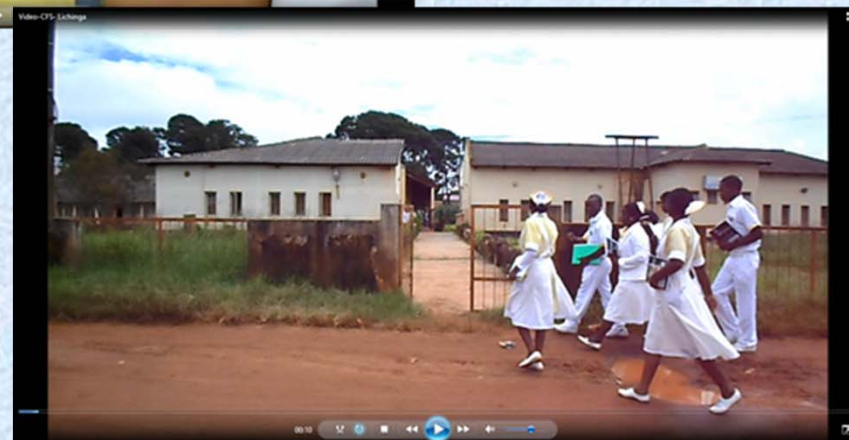
Figure 05: Frames of the video produced at CFS -Lichinga-Mozambique