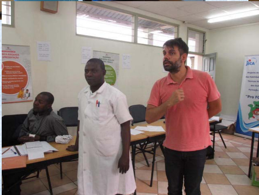
Figure 1: distributing movies (DVD) and storyline for shooting