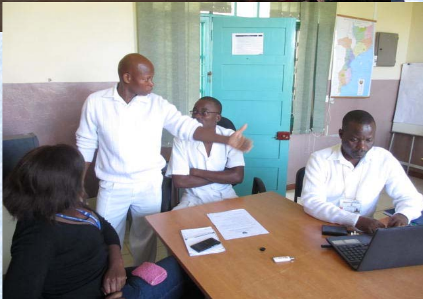
Figure 02: Preparing the community at health centre to display video and Students and teachers to shooting and editing the video