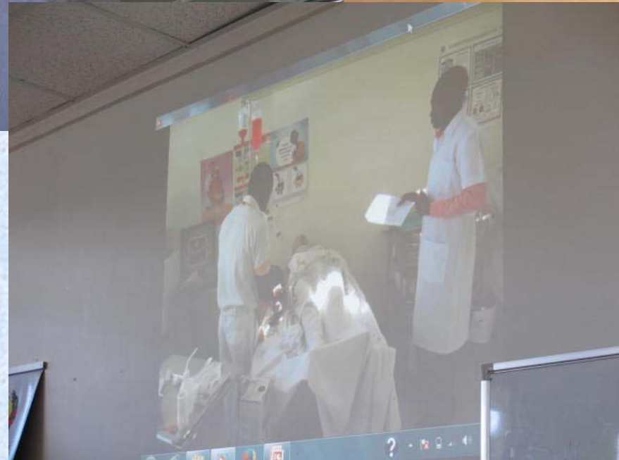
Figure 04: Trying to project the video produced...