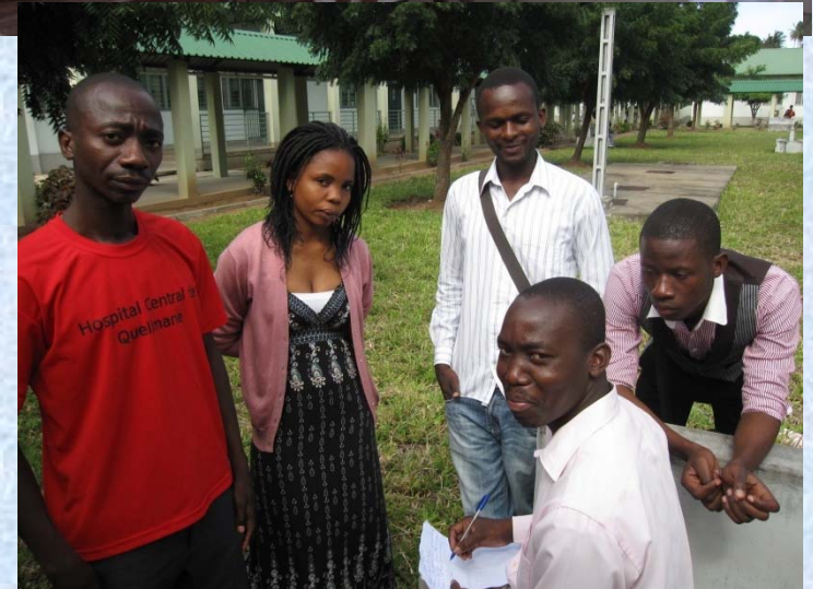
Figure 03: Elaborating the scrrereplay, preparing the students and editing the video