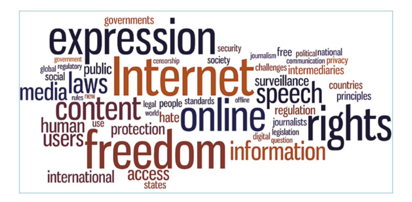
Figure 2. Word Cloud of Responses to Questions on Freedom of Expression