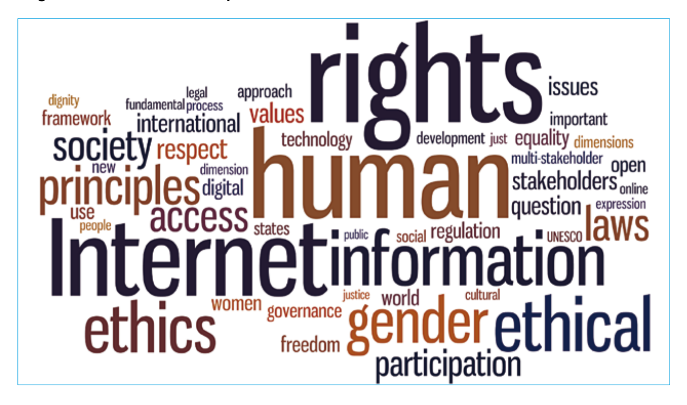
Figure 4. Word Cloud of Responses to Questions on Ethics