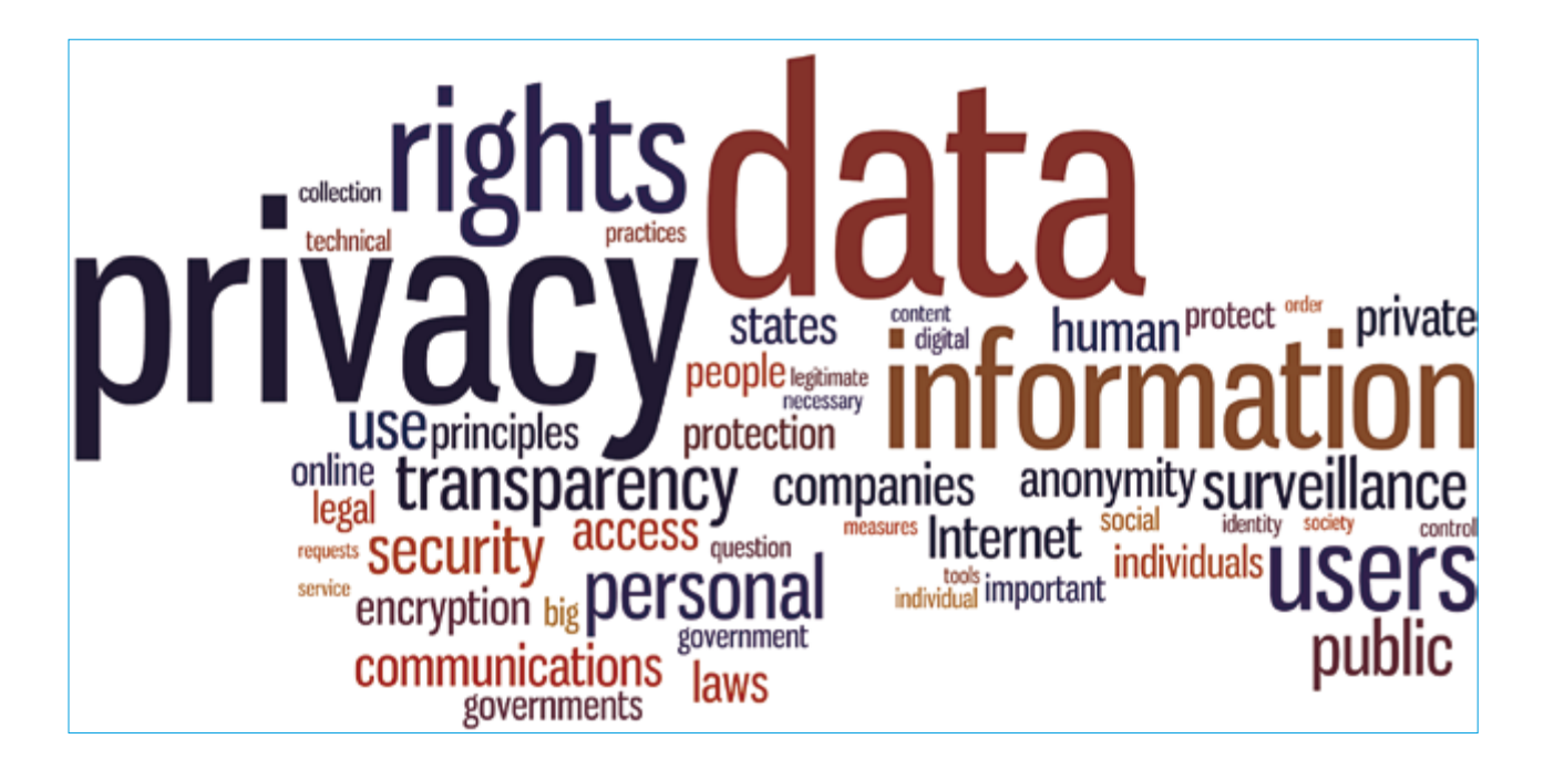
Figure 3. Word Cloud of Responses to Questions on Privacy