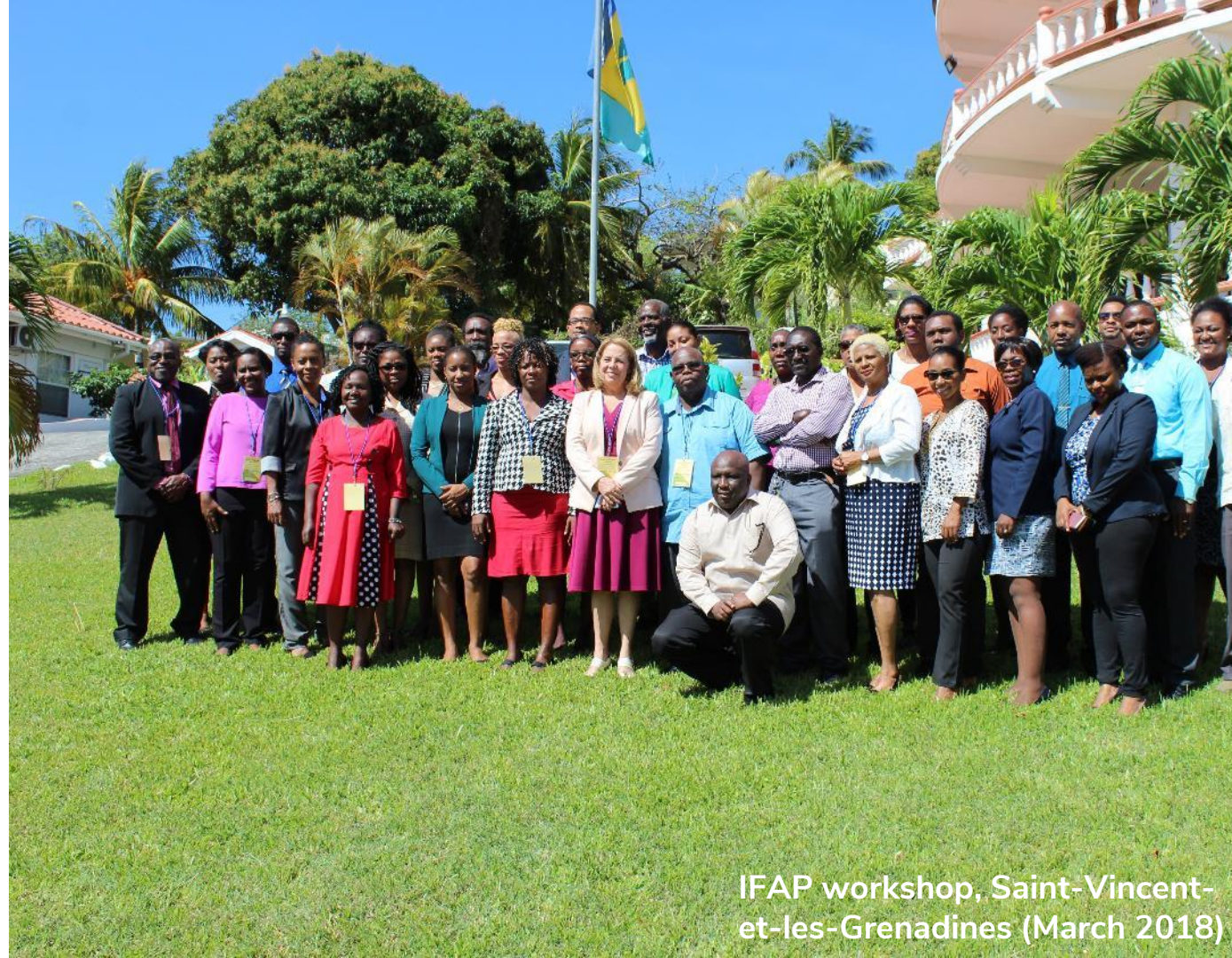
IFAP workshop, Saint-Vincent-et-les-Grenadines (March 2018)