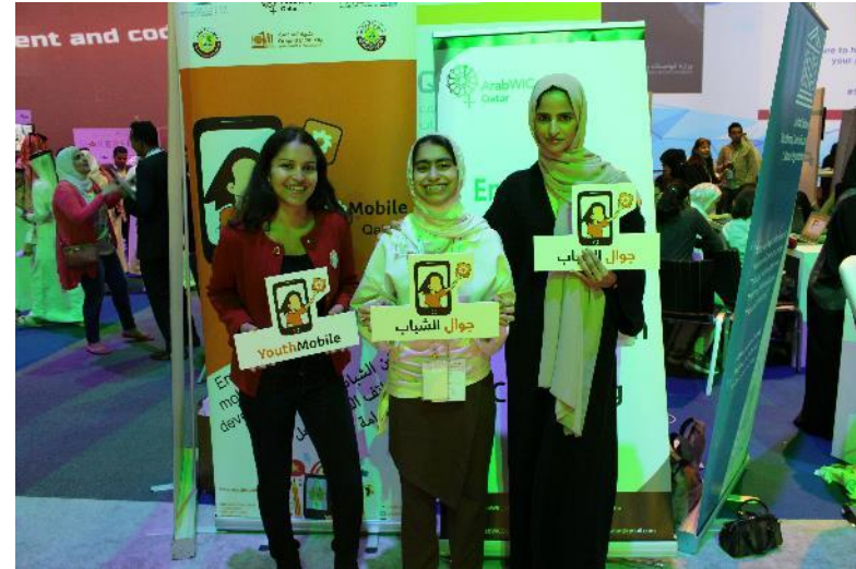
UNESCO YouthMobile (Qatar 2017)