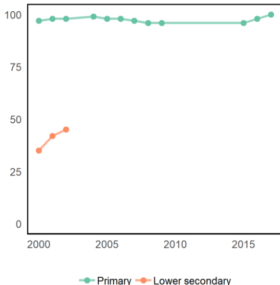
Adjusted net enrolment rate