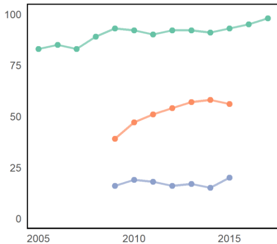
Adjusted net enrolment rate

● Primary ● Lower secondary ● Upper secondary