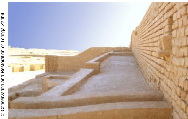
Earthen wall of Tchoga Zanbil after restoration