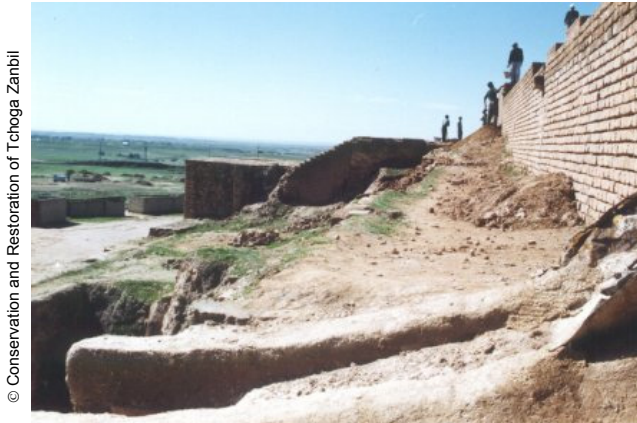
Earthen wall of Tchoga Zanbil before restoration